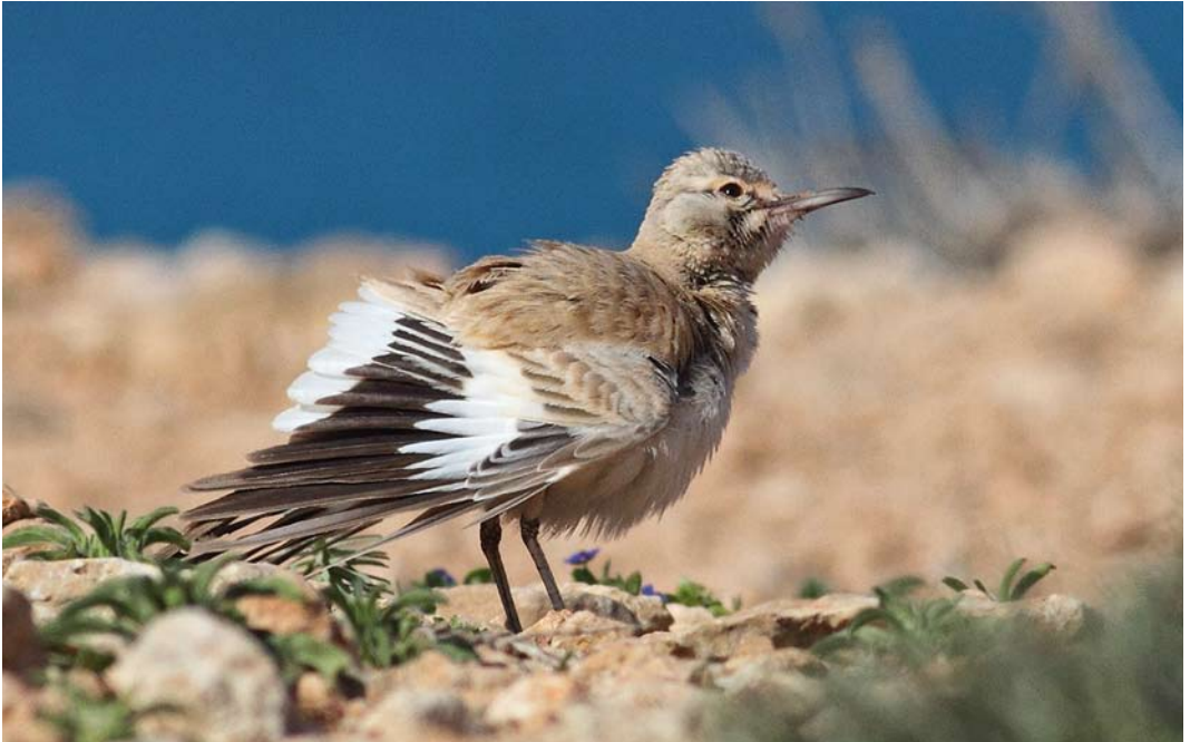
252 Greater Hoopoe-Lark / Witbandleeuwerik Alaemon alaudipes , Comino, Malta, 11 April 2014 (Natalino Fenech)