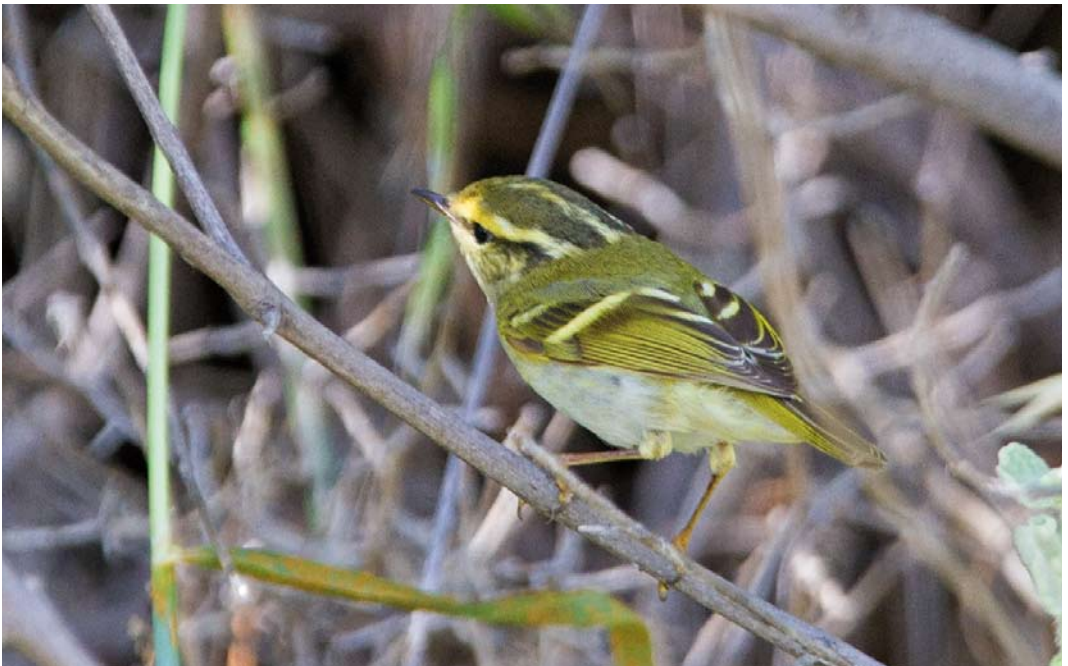
253 Pallas's Leaf Warbler / Pallas' Boszanger Phylloscopus proregulus , Lesvos, Greece, 8 May 2014