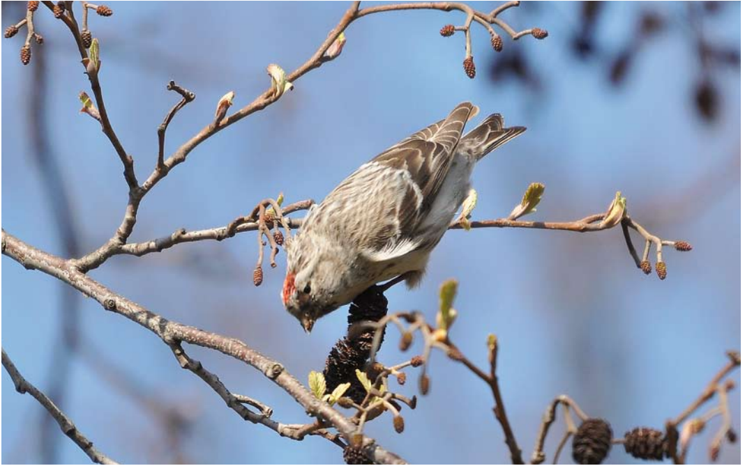
281 Witstuitbarmsijs / Coues's Arctic Redpoll Acanthis hornemanni exilipes , Het Twiske, Noord-Holland, 28 maart 2014 ( John van der Graaf ) 282 Witstaartkievit / White-tailed Lapwing Vanellus leucurus , De Nollen, Den Helder, Noord-Holland, 28 april 2014 ( Hans Brinks ) 283 Grijskopspecht / Grey-headed Woodpecker Picus canus , vrouwtje, Westplaat, Maasvlakte, Zuid-Holland, 31 maart 2014 ( Peter Soer )