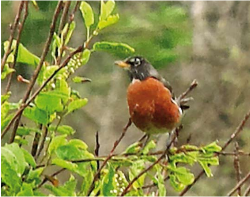
286 Roodborstlijster / American Robin Turdus migratorius , eerste-zomer mannetje, Noordhollands Duinreservaat, Heemskerk, Noord-Holland, 27 april 2014 (Lonnie Bregman)