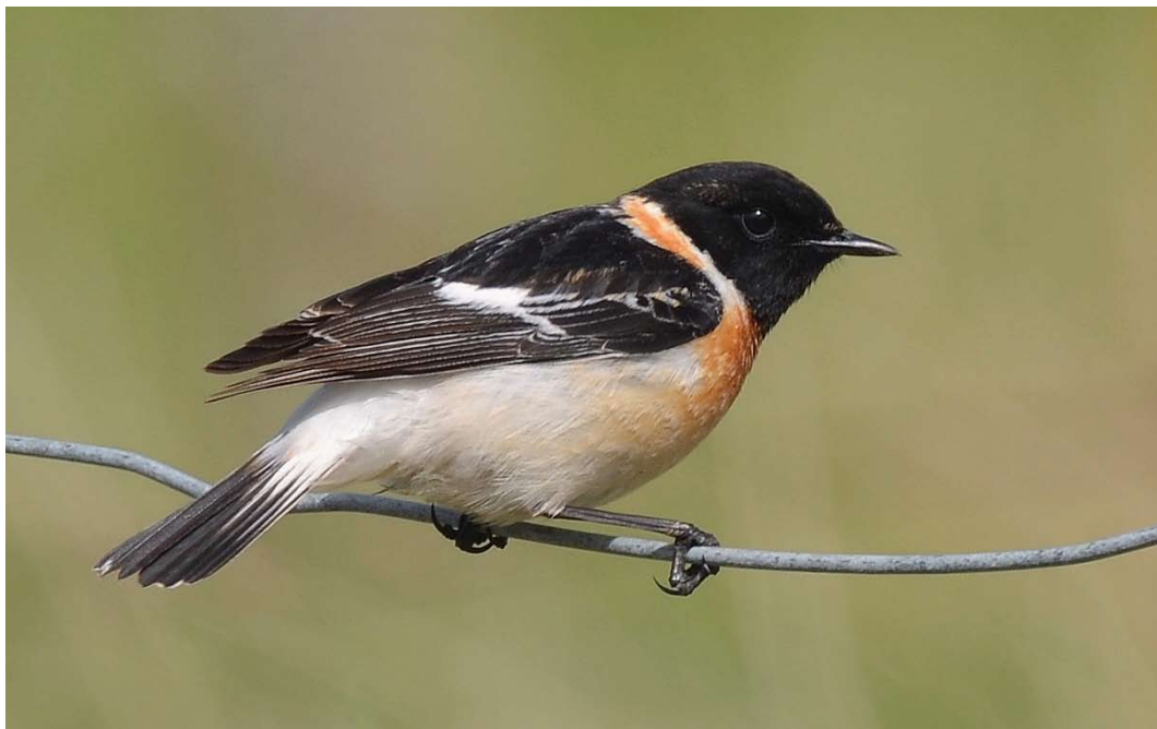
262 Caspian Stonechat / Kaspische Roodborsttapuit Saxicola maurus hemprichii , adult male, Fair Isle, Shetland, Scotland, 30 April 2014 ( Chris Bromley )