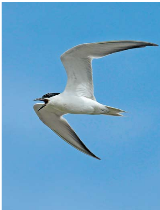
184 Gull-billed Tern / Lachstern Gelochelidon nilotica , adult, Waarland, Noord-Holland, Netherlands, 12 August 2013