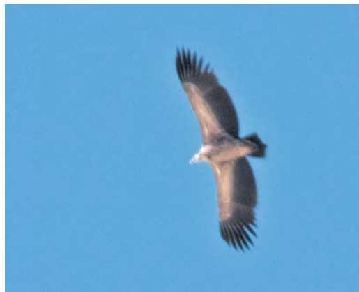
191-192 Himalayan Vulture / Himalayagier Gyps himalayensis , juvenile, near Chahbahar, Sistan-Baluchestan, Iran, 8 December 2010. Note heavy, broad-winged silhouette and bold creamy streaking of body and axillaries.

reduce the overall size of the white area and the contrast between the white underwing-coverts and the dark remiges.