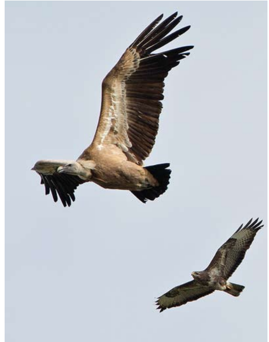
270 Ringsnaveleend / Ring-necked Duck Aythya collaris , mannetje, met Kuifeenden / Tufted Ducks A fuligula , mannetjes, Vlaardingen, Zuid-Holland, 20 maart 2014 271 Vale Gier / Griffon Vulture Gyps fulvus , met Buizerd / Common Buzzard Buteo buteo , Rossum, Gelderland, 7 april 2014 272 Sneeuwuil / Snowy Owl Bubo scandiacus , tweede-kalenderjaar vrouwtje, Formerum, Terschelling, Friesland, 20 maart 2014