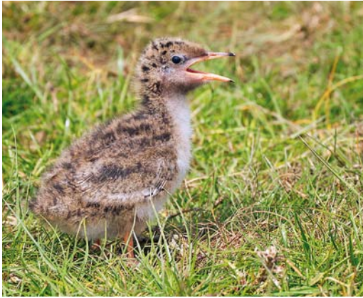
180 Gull-billed Tern / Lachstern Gelochelidon nilotica , chick, Neufelderkoog, Schleswig-Holstein, Germany, 28 June 2012 (Sebastian Conradt)