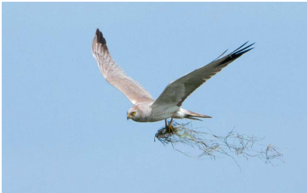
266 Steppekiekendief / Pallid Harrier Circus macrourus , mannetje, Finsterwolde, Groningen, 13 mei 2014 (Co van der Wardt)