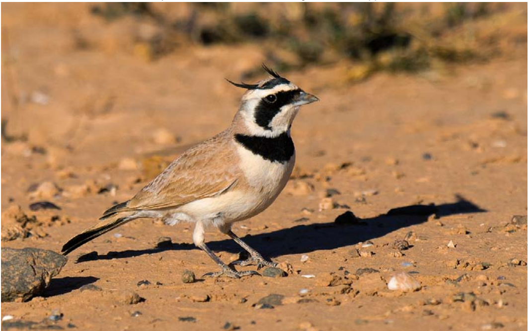
235 Temminck's Lark / Temmincks Strandleeuwerik Eremophila bilopha , Goulimine, Lower Draa, Morocco, 30 January 2013