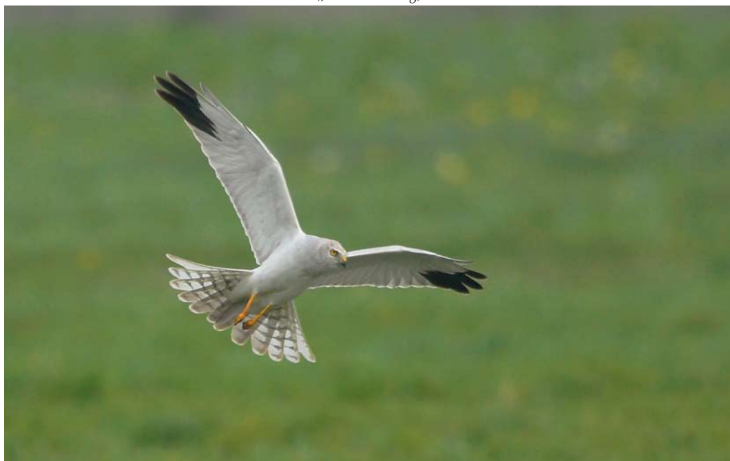
267 Steppekiekendief / Pallid Harrier Circus macrourus , mannetje, Buinerveen, Drenthe, 5 april 2014