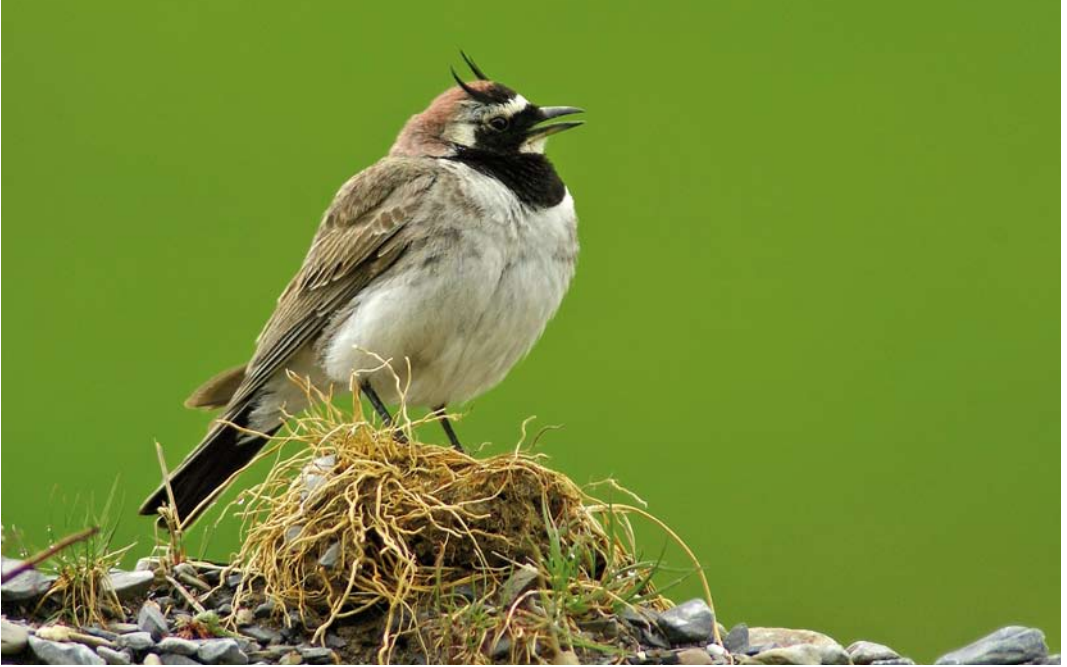
236 Caucasian Horned Lark / Kaukasische Strandleeuwerik Eremophila penicillata , Kazbegi, Georgia, 26 June 2005