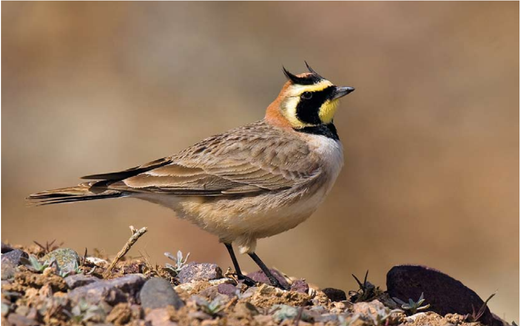
234 Atlas Horned Lark / Atlasstrandleeuwerik Eremophila atlas , Oukaimeden, Western High Atlas, Morocco, 26 March 2009