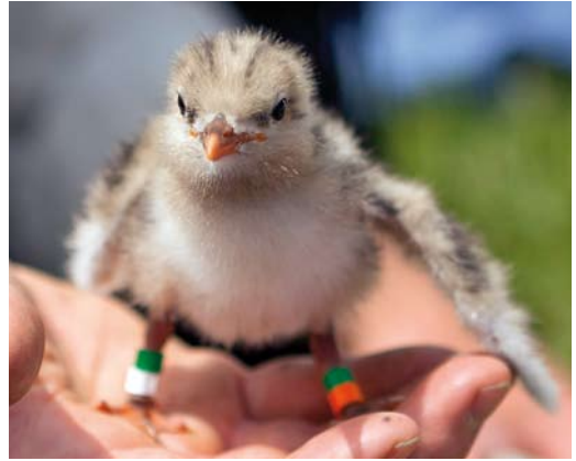
181 Gull-billed Tern / Lachstern Gelochelidon nilotica , chick ringed with colour-rings, Neufelderkoog, Schleswig-Holstein, Germany, 28 June 2012 (Sebastian Conradt)

koog-Vorland in Schleswig-Holstein. The c 40 breeding pairs prefer places grazed in spring by migrating Barnacle Goose Branta leucopsis . These short, open salt meadows are also traditionally grazed by sheep. The birds nest amidst c 2000 nests of Common Terns. The Gull-billed Terns are protected from intruders thanks to the aggressive behaviour of the Common Terns. In May, Gull-billed lay two to three eggs in a flat, bare scrape nest. After about three weeks the eggs hatch. The chicks fledge around mid-July. Usually, they start to breed when they are four to five years old (Bauer et al 2012). The breeding success in 1995-2012 strongly varied for each year but showed a strong overall decline (figure 3-4).