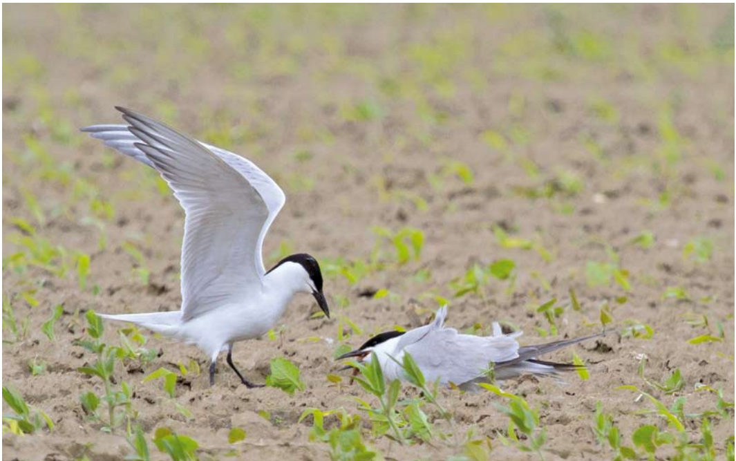
182 Gull-billed Terns / Lachsterns Gelochelidon nilotica , male (left) and female during courtship, Nordkehdingen, Niedersachsen, Germany, 2 June 2013 (Gerd-Michael Heinze)

To improve and develop the conservation plan each year, data on diet and feeding areas are very important. Gull-billed Terns, contrary to other tern species, need inland feeding grounds such as moors and wet meadows with fresh and brackish water. Prey from the sea or salt marshes is normally not taken, especially when they raise their chicks, as the young birds do not tolerate salt. The adults forage in the vicinity of the colony for worms and insects. This is what the young chicks need in their first days. Later, the adults feed their young with mice, frogs and also various young birds. These are collected at up to 5-10 km distance from the colony. A speciality of the Neufelder Gull-billed Terns is catching (introduced) Chinese Mitten Crabs Eriocheir sinensis in the river and the Neufelder harbour, where the birds can be observed extremely well. Because the hinterland of Dithmarschen has less ecological value, the birds fly also to the other side of the Elbe in Niedersachsen, where they can find plenty of lizards.