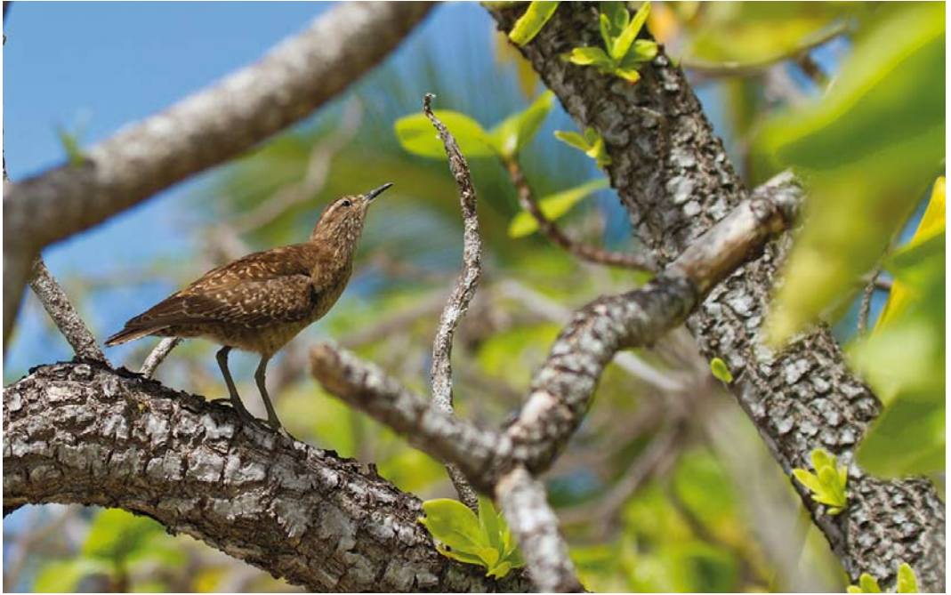
228-229 Tuamotu Sandpiper / Tuamotustrandloper Prosobonia parvirostris , Tenararo Atoll, French Polynesia, 12 September 2013 (Steve N G Howell). Foraging on nectar in tree.