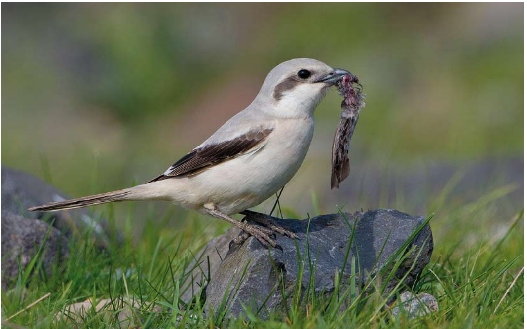
210 Steppeklapekster / Steppe Grey Shrike Lanius lahtora pallidirostris , Stuifdijk, Maasvlakte, Zuid-Holland, 1 mei 2014