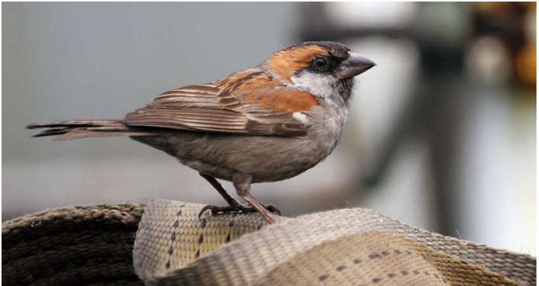
201 Iago Sparrow / Kaapverdische Mus Passer iagoensis , male, on board of MV Plancius , Hansweert, Zeeland, Netherlands, 20 May 2013 (Gerjon Gelling)