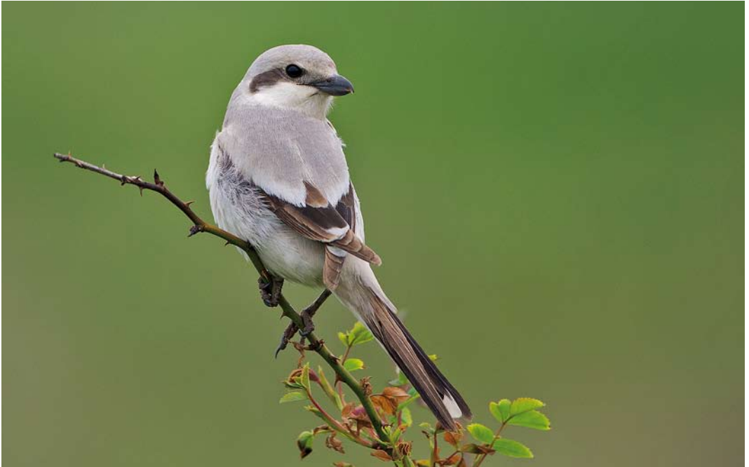
209 Steppeklapekster / Steppe Grey Shrike Lanius lahtora pallidirostris , Stuifdijk, Maasvlakte, Zuid-Holland, 30 april 2014 (Co van der Wardt)