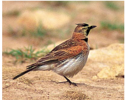
231 Temminck's Larks / Temmincks Strandleeuweriken Eremophila bilopha , Gleb Jdiane, Dhakla, Oued Ad-Deheb, Western Sahara, Morocco, 12 January 2012 232 Colombian Horned Lark / Colombiaanse Strandleeuwerik Eremophila alpestris peregrina , Vereda Fute, Cundinamarca, Colombia, 3 February 2006 233 Colombian Horned Lark / Colombiaanse Strandleeuwerik Eremophila alpestris peregrina , Tominé, Cundinamarca, Colombia, 2000

(mtDNA) and two types of nuclear DNA were investigated (Drovetski et al 2014). The mtDNA analysis had a surprise in store: the Tibetan form elwesi turned out to be the sister group to all other horned larks, split off c 1.5 million years ago (mya). The remaining Eremophila split into three groups c 1 mya: 1 Temminck's Lark; 2 Atlas Horned Lark and the Caucasian penicillata group; and 3 the remaining Holarctic forms. The latter group could be divided into the tundra-breeding Shore Lark ( flava ), the steppe-dwelling brandti and American Horned Lark ( alpestris group). In American Horned Lark, five mtDNA clades were identified. Four of these were geographically restricted, while one was widespread – and none were linked to single subspecies. It seems likely that the understudied