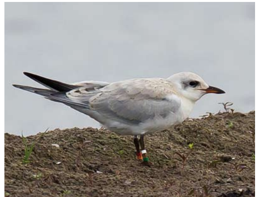
185 Gull-billed Terns / Lachsterns Gelochelidon nilotica , with Black-headed Gulls / Kokmeeuwen Chroicocephalus ridibundus , Schagerbrug, Noord-Holland, Netherland, 3 August 2008 186 Gull-billed Terns / Lachsterns Gelochelidon nilotica , Nieuwe Pekela, Groningen, Netherlands, 5 August 2013 187 Gull-billed Terns / Lachsterns Gelochelidon nilotica , adult feeding juvenile, Schagerbrug, Noord-Holland, Netherlands, 21 August 2012 188 Gull-billed Tern / Lachstern Gelochelidon nilotica , juvenile, Schagerbrug, Noord-Holland, Netherlands, 11 August 2012. Note colour-rings.