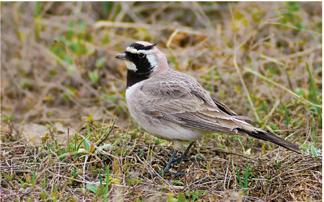
237 Caucasian Horned Lark / Kaukasische Strandleeuwerik Eremophila penicillata , Aragats, Armenia, 13 May 2011