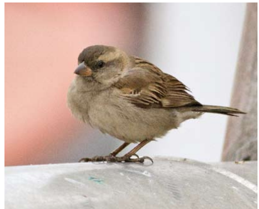
202 Iago Sparrows / Kaapverdische Mussen Passer iagoensis , female (left) and male, on board of MV Plancius , Hansweert, Zeeland, Netherlands, 20 May 2013 ( Cerjon Gelling ) 203 Iago Sparrows / Kaapverdische Mussen Passer iagoensis , male (left) and female, on board of MV Plancius , Hansweert, Zeeland, Netherlands, 20 May 2013 ( Luuk Punt ) 204 Iago Sparrow / Kaapverdische Mus Passer iagoensis , female, on board of MV Plancius , Hansweert, Zeeland, Netherlands, 20 May 2013 ( Karel Hoogteyling )

Hazevoet, C J 2013b. Iago sparrows in the Netherlands – a tragi-comical soap without happy ending. Website: www.scvz.org/info0913.html .