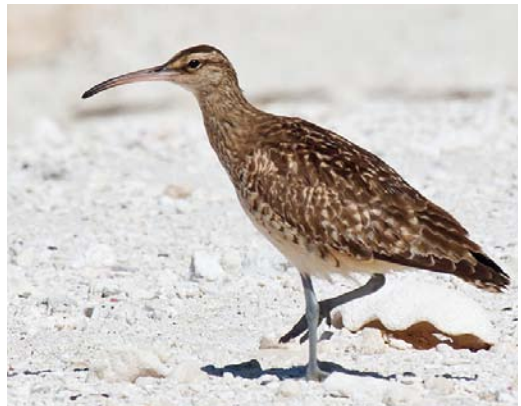
213 Bristle-thighed Curlew / Zuidzeewulp Numenius tahitiensis , second calendar-year, Oeno Island, Pitcairn Islands, 10 September 2013 (Steve N G Howell). Note overall fresh plumage (cf plate 215-216 showing adult-type birds) and complete primary moult. 214 Bristle-thighed Curlew / Zuidzeewulp Numenius tahitiensis , second calendar-year, Tenararo Atoll, French Polynesia, 12 September 2013 (Steve N G Howell). Note overall fresh plumage (cf plate 215-216 showing adult-type birds) and complete primary moult. Fresher cinnamon underparts and scapular feathers may be incoming second-winter feathers or late-moulted first-summer feathers. 215 Bristle-thighed Curlew / Zuidzeewulp Numenius tahitiensis , adult-type, Henderson Island, Pitcairn Islands, 8 September 2013 (Steve N G Howell). Foraging inside forest. Note variable but overall worn plumage (cf plate 213-214 and 221 showing second calendar-year birds). 216 Bristle-thighed Curlew / Zuidzeewulp Numenius tahitiensis , adult-type, Oeno Island, Pitcairn Islands, 10 September 2013 (Steve N G Howell). Cf plate 212 and note variation in bill length and curvature, along with variable but overall worn plumage (cf also plate 213-214 and 221 showing second calendar-year birds).

Haematopus ostralegus (Marks & Hall 1992, Henry & Aznar 2006). The species may in fact be an active egg (and even chick) predator in Polynesia, given the high frequency with which it is chased in flight by a variety of seabirds (especially Murphy's Petrel Pterodroma ultima and noddies Anous ).