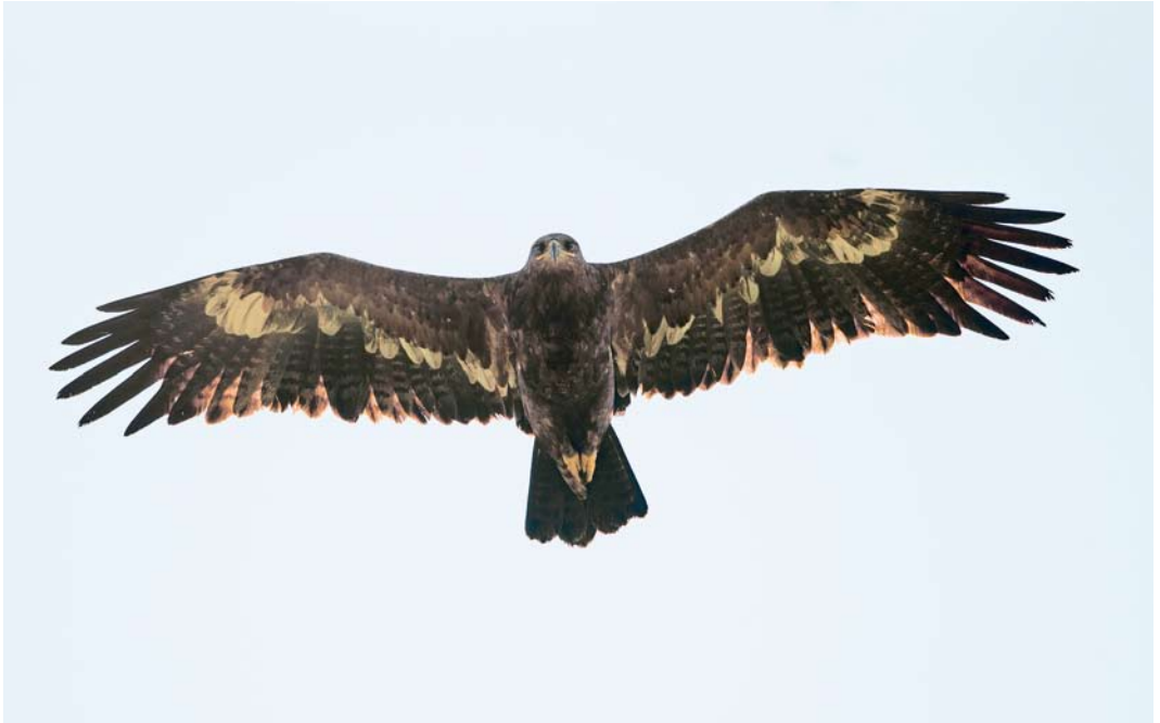
239 Steppe Eagle / Steppearend Aquila nipalensis, third calendar-year, Großkrut, Niederösterreich, Austria, 6 May 2014