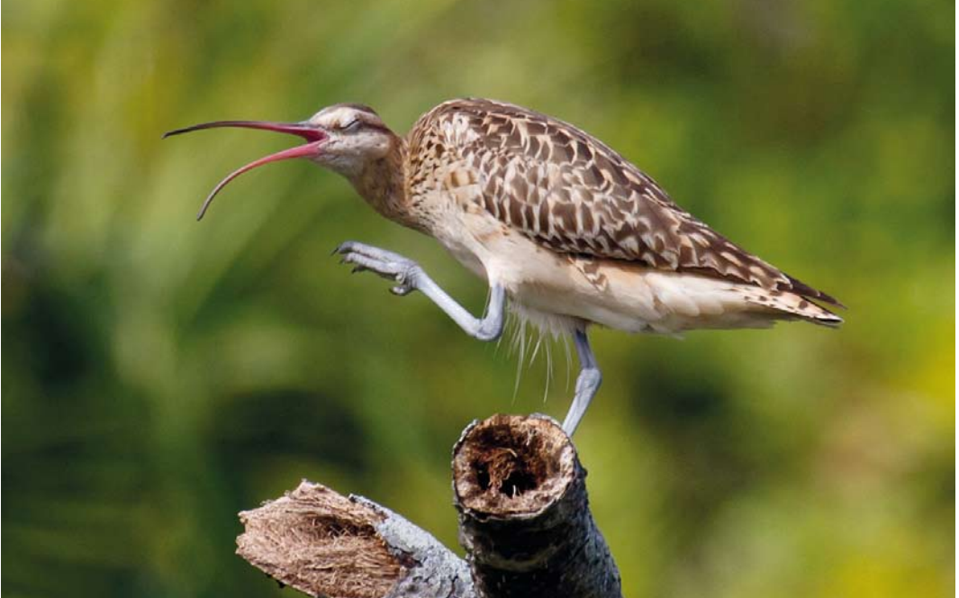
221 Bristle-thighed Curlew / Zuidzeewulp Numenius tahitiensis , second calendar-year, Henderson Island, Pitcairn Islands, 7 September 2013. Note overall fresh plumage (cf plate 215-216 showing adult-type birds) but retained juvenile outermost primary.

to see in the field but surprisingly easy on photographs.