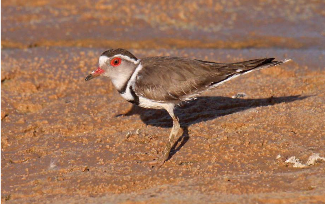
43 Three-banded Plover / Driebandplevier Charadrius tricollaris , Abu Simbel, Egypt, 1 May 2012 (Jens Hering)