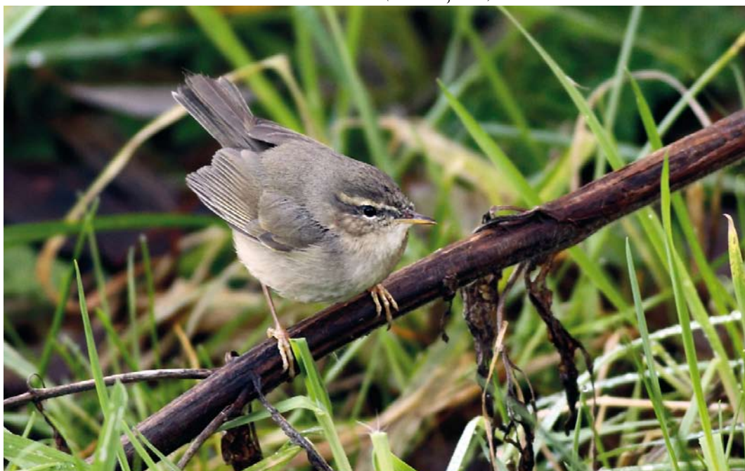
93 Bruine Boszanger / Dusky Warbler Phylloscopus fuscatus , Geestmerambacht, Noord-Holland, 15 december 2012 ( Cock Reijnders )