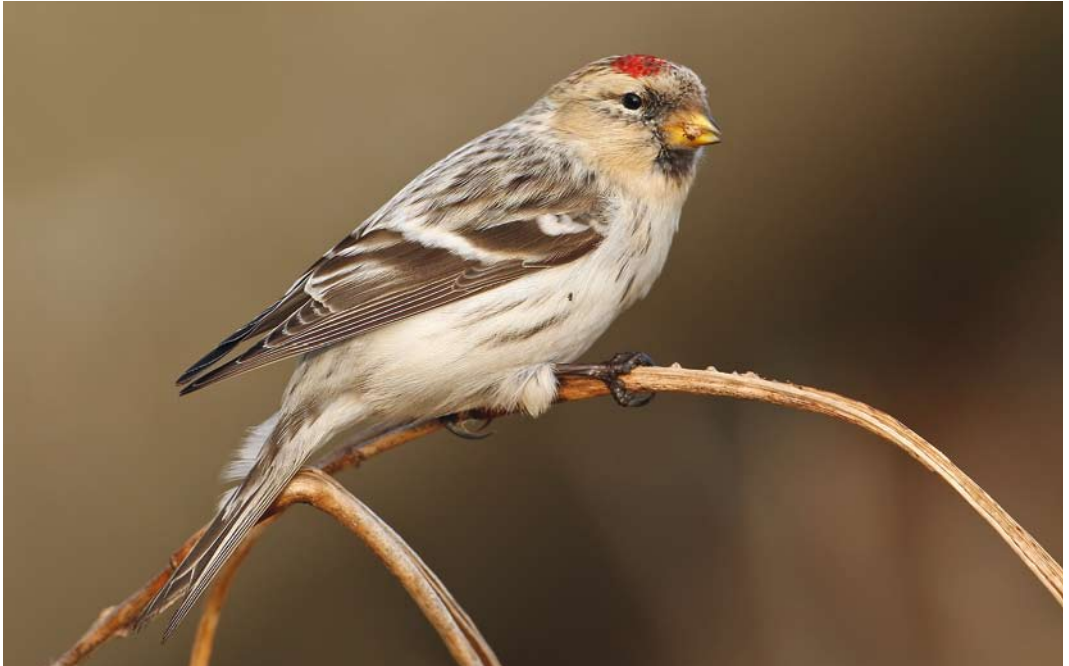
76 Hornemann's Redpoll / Groenlandse Witstuitbarmsijs Acanthis hornemanni hornemanni, first-year, Aldeburgh, Suffolk, England, 16 December 2012