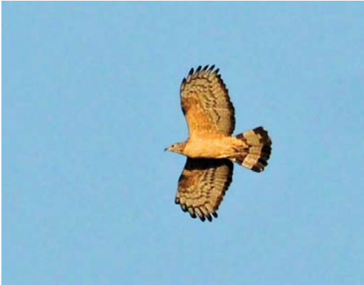
53 Crested Honey Buzzard / Aziatische Wespendif Pernis ptilorhynchus , adult male, Korgalzhyn, Aqmola province, Kazakhstan 12 May 2012