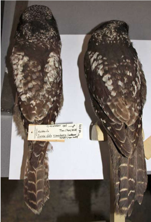
12 American Hawk Owl / Amerikaanse Sperweruil Surnia ulula caparoch (caught off Las Palmas, Gran Canaria, Canary Islands, in October 1924), right, with Northern Hawk-Owl / Sperweruil S u tianschanica (specimen from Central Asia), Naturalis Biodiversity Center, Leiden, Netherlands, August 2012 (Cosme D Romay)