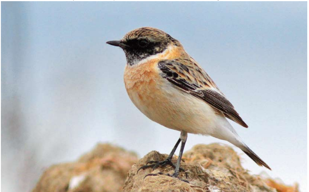
77 Caspian Stonechat / Kaspische Roodborsttapuit Saxicola maurus hemprichii , adult male, Ebro delta, Catalunya, Spain, 16 January 2013