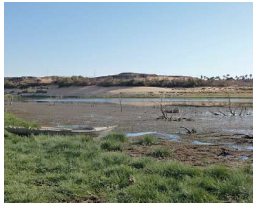
45-47 Three-banded Plover / Driebandplevier Charadrius tricollaris , Abu Simbel, Egypt, 1 May 2012 (Jens Hering) 48 Three-banded Plover / Driebandplevier Charadrius tricollaris , Abu Simbel, Egypt, 2 May 2012 (Jens Hering) 49-50 Location of lek of Three-banded Plover Charadrius tricollaris on eastern shore of brackish lake south of Abu Simbel airport, Egypt, 3 May 2012 (Jens Hering)