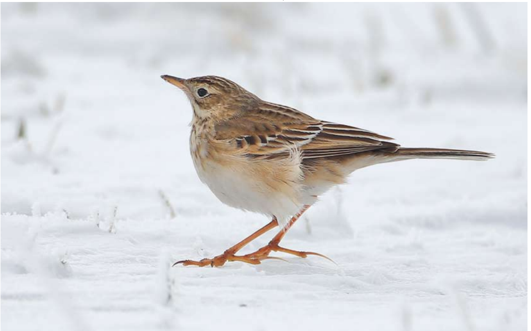
79 Richard's Pipit / Grote Pieper Anthus richardi , first-winter, Warta mouth, Poland, 8 December 2012 (Mateusz Matysiak)