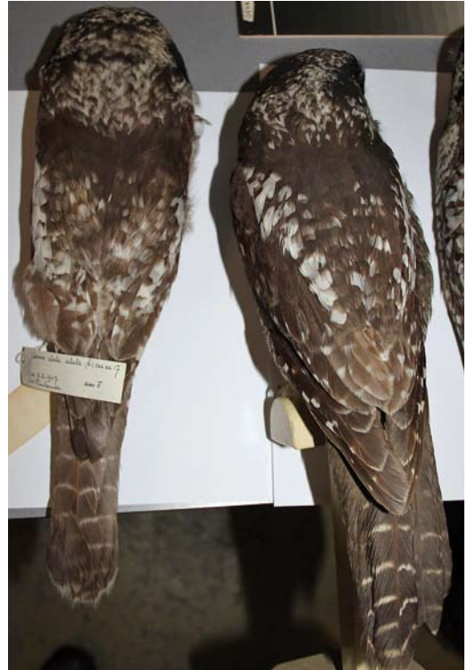
13 American Hawk Owls / Amerikaanse Sperweruilen Surnia ulula caparoch (caught off Las Palmas, Gran Canaria, Canary Islands, in October 1924), right, with Northern Hawk-Owl / Sperweruil S u ulula (left: specimen from Finland), Naturalis Biodiversity Center, Leiden, Netherlands, August 2012

Amsterdam, The Hague or Rotterdam zoos, it was immediately sent to the Rijksmuseum van Natuurlijke Historie in Leiden, the predecessor of Naturalis, where it was mounted as Surnia ulula caparoch nr 5, register nr 5409.