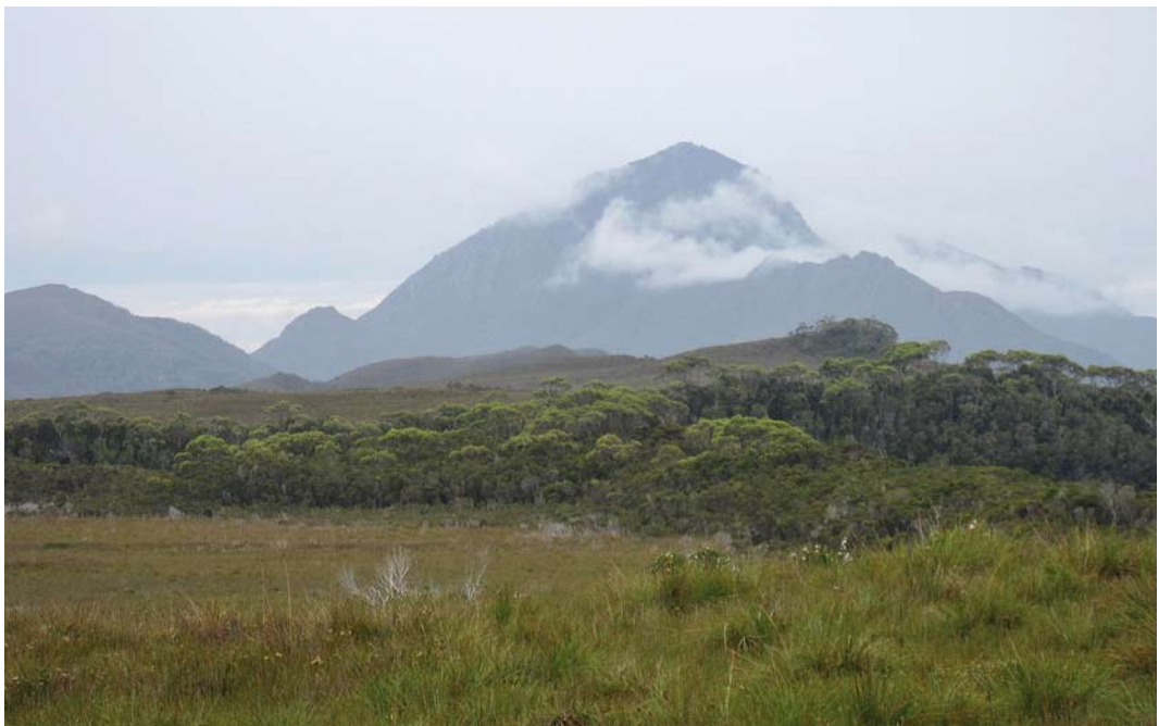
60 Breeding habitat of Orange-bellied Parrot Neophema chrysogaster , Melaleuca, Tasmania, Australia, 31 January 2011 (Maartje van Kregten)

Australia. Migration includes crossing Bass Strait, a 600 km flight over sea. They spend the winter in saltmarshes, dunes, beaches, pastures and shrubland close to the coast, where they feed on the ground or in low vegetation. Feeding is almost exclusively on seeds and fruits, mainly of sedges, and salt-tolerant coastal and saltmarsh plants (Orange-bellied Parrot Recovery Team 2006). The preferred habitat has been degraded and lost throughout the species' range; however, the majority of this impact has occurred within the wintering areas. The major contributing factor is habitat loss due to