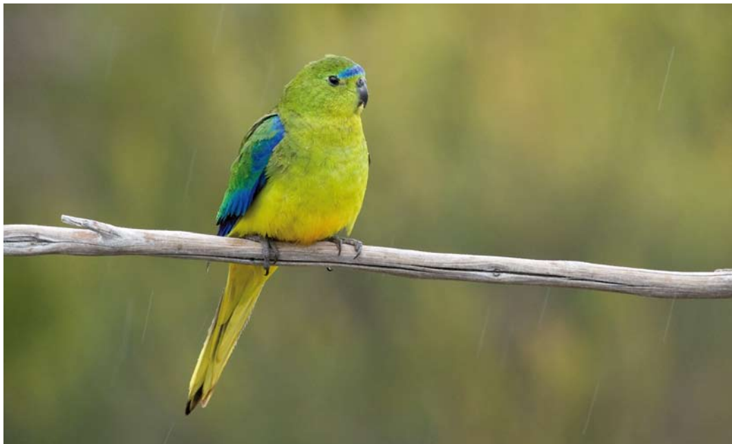
55 Orange-bellied Parrot / Oranjebuikparkiet Neophema chrysogaster , adult, Melaleuca, Tasmania, Australia, 30 January 2011 (Peter Lindenburg)

The entire breeding area lies within a radius of c