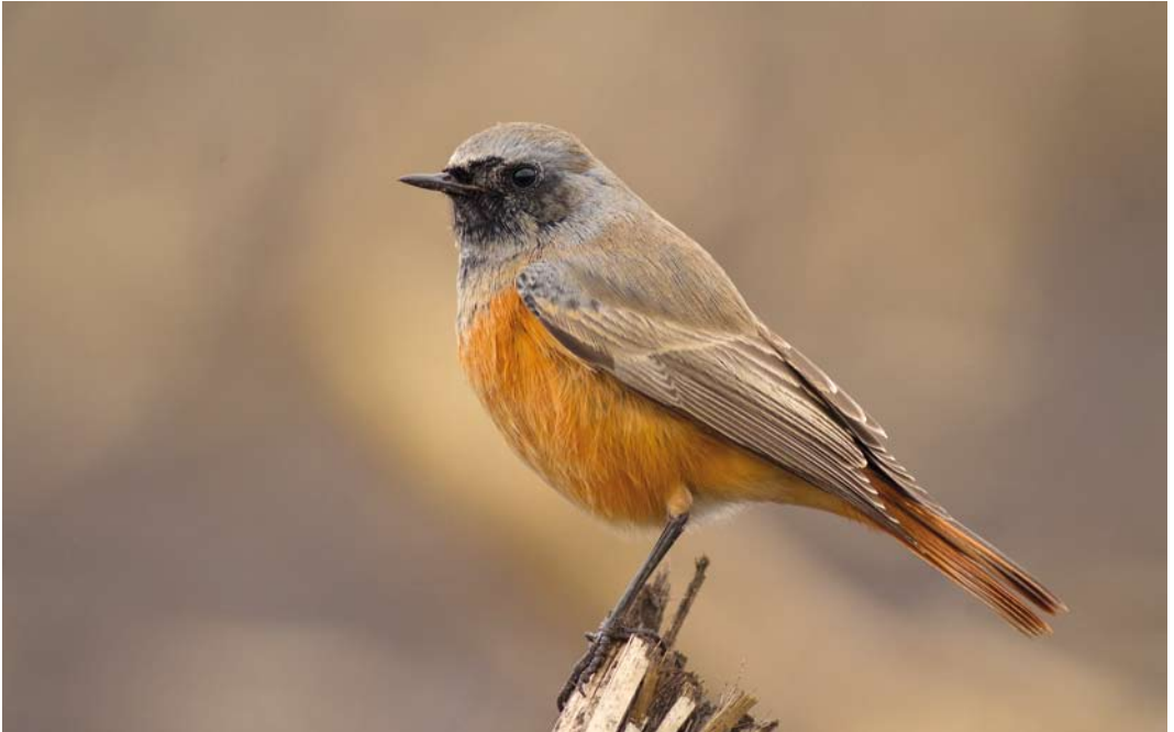
94 Oosterse Zwarte Roodstaart / Eastern Black Redstart Phoenicurus ochruros phoenicuroides , eerstejaars mannetje, Rolde, Drenthe, 9 november 2012 ( Jurriën van Deijk )