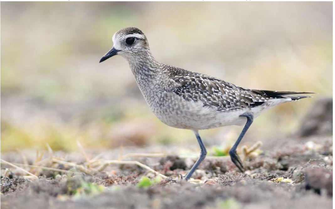
67 American Golden Plover / Amerikaanse Goudplevier Pluvialis dominica , first-winter, Po del Sol, Santo Antão, Cape Verde Islands, 28 November 2012