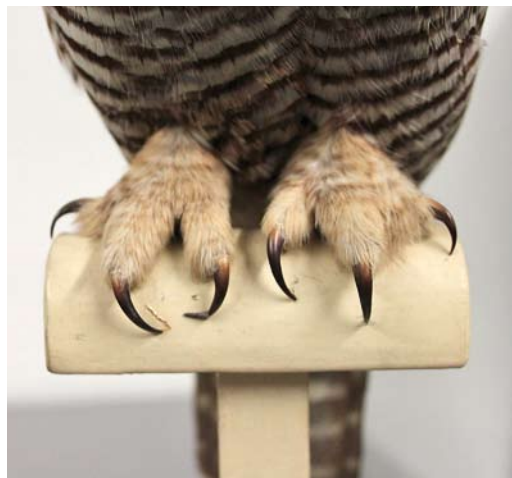
5 American Hawk Owl / Amerikaanse Sperweruil Surnia ulula caparoch (caught off Las Palmas, Gran Canaria, Canary Islands, in October 1924), Naturalis Biodiversity Center, Leiden, Netherlands, August 2012 (Cosme D Romay). Detail of claws and feathered feet.