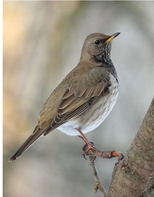
75 Black-throated Thrush / Zwartkeellijijster Turdus atrogularis , adult male, Espoo Nöykkiö, Finland, 23 December 2012 (Petteri Hytönen)

Dundaga, on 13 January. The first Slaty-backed Gull L schistisagus for Belarus (and fifth for the WP) was an adult photographed along the Neman river (15 km from the Polish border) at Hrodna, Hrodna Oblast, from 26 December to at least 4 January. An adult Kelp Gull L dominicanus vetula and nine Great Black-backed Gulls L marinus were seen at Khnifiss lagoon in southwestern Morocco on 24 December. The number of Gull-billed Terns Gelochelidon nilotica breeding in France increased sharply from 489 pairs in 2010 to 643-730 pairs in 2011 ( Ornithos 19: 312, 2012). A Whiskered Tern Chlidonias hybrida on São Vicente on 20-30 December was the first for the Cape Verde Islands. In Malta, a first-winter Lesser Crested Tern Sterna bengalensis turned up off Grand Harbour on 2 December. In Ireland, the adult Forster's Tern S forsteri stayed at Nimmo's Pier, Galway, until at least 17 January and a first-winter bird appeared at Our Lady's Island Lake, Wexford, on 20 January; the fifth for Spain was seen at Enseada da Insua, Ponteceso, A Coruña, on 15 December. The number of Roseate Terns Sterna dougallii in France reached the lowest level ever with 9-11 breeding pairs in 2011 (in 2005, there were 76 pairs).