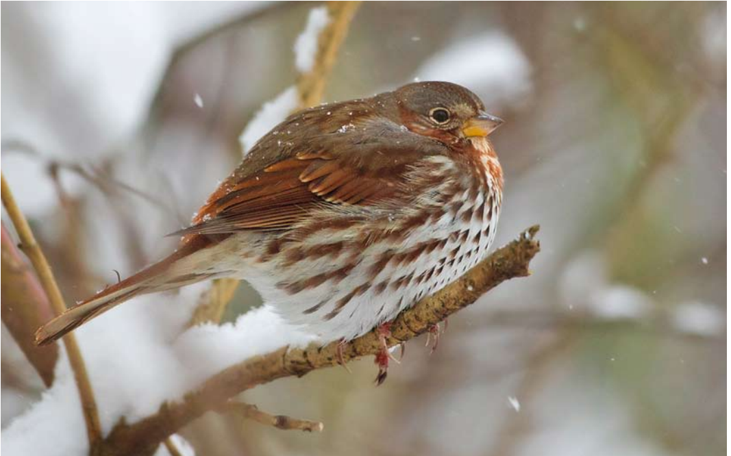
84 Fox Sparrow / Roodstaartgors Zonotrichia iliaca , Haapsula, Estonia, 14 December 2012 (David Monticelli)