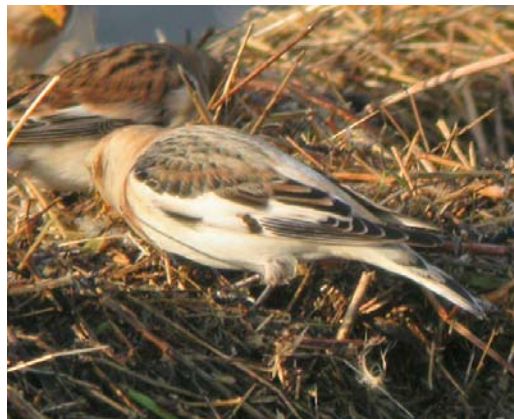
15 Snow Bunting / Sneeuwvogel Plectrophenax nivalis , first-winter male P n insulae , Lauwersoog, Groningen, Netherlands, 16 February 2008 (Rik Winters) 16 Snow Bunting / Sneeuwvogel Plectrophenax nivalis , male, most likely P n nivalis , Eemshaven, Groningen, Netherlands, 6 January 2008 (Rik Winters). Note extensively white rump and contrast between pale mantle fringes and rufous scapular fringes. Very pale plumage and large size suggestive of vasowae .

(hereafter nivalis ) from Greenland east to western Russia, including Scandinavia, and P n insulae (hereafter insulae ) from Iceland. The two subspecies form mixed flocks on the wintering grounds where their ranges overlap. Little is known about the ratios in which the subspecies occur in the Netherlands. Insulae is presumed to be the most numerous subspecies, being about twice as numerous as nivalis (Jukema & Fokkema 1992), but this ratio may vary between winters. However, using the identification criteria described hereafter, birds I checked in the Wadden Sea area in autumn (September-October) all proved to be nivalis .