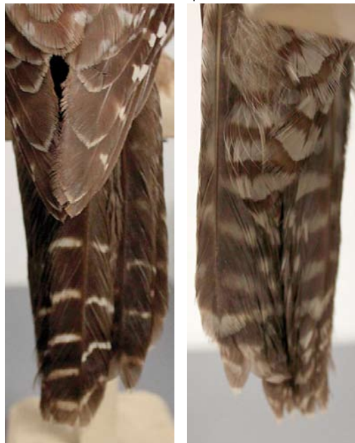
6-7 American Hawk Owl / Amerikaanse Sperweruil Surnia ulula caparoch (caught off Las Palmas, Gran Canaria, Canary Islands, in October 1924), Naturalis Biodiversity Center, Leiden, Netherlands, August 2012 (Cosme D Romay). Details of tail from above (plate 6) and below (plate 7).

first-year male caparoch . Accordingly, this record from the Canary Islands was mentioned in the section 'Movements' of the species account in Cramp (1985) while its mensural data were similarly included in the section 'Measurements' but no further details were published. Because this specimen represents only the second record of caparoch in Europe and the Western Palearctic, we here provide a full account of this record.