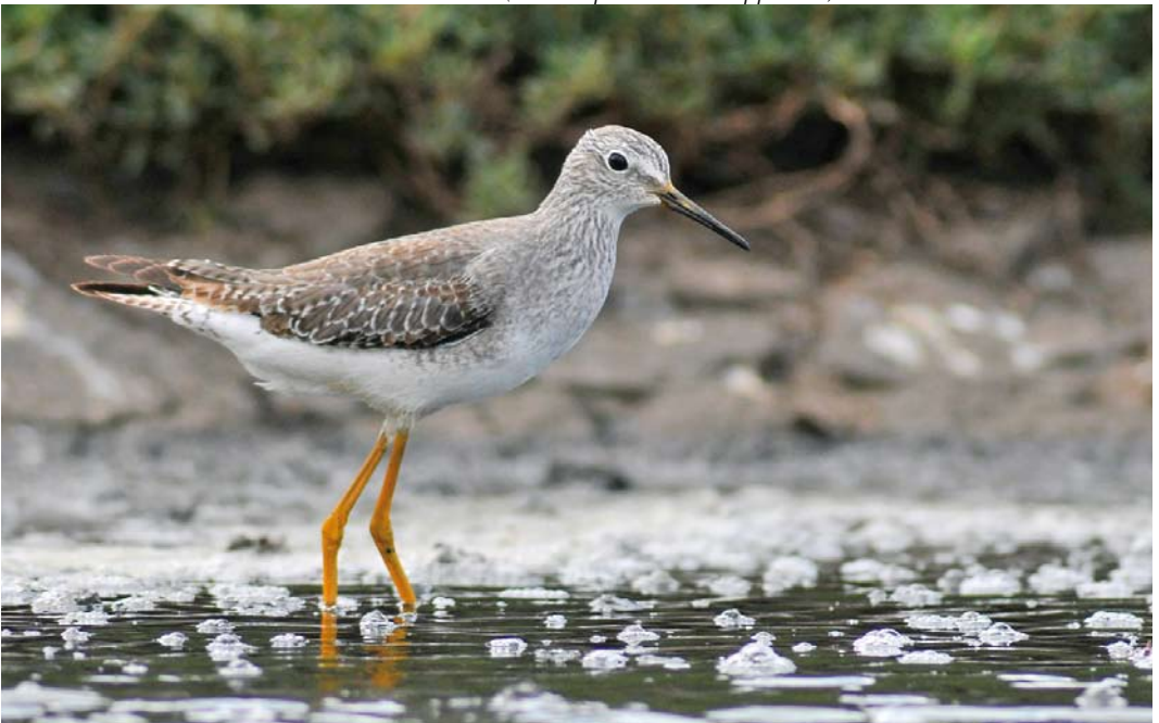
65 Lesser Yellowlegs / Kleine Geelpootruiter Tringa flavipes , first-winter, Mindelo, Santo Antão, Cape Verde Islands, 3 December 2012