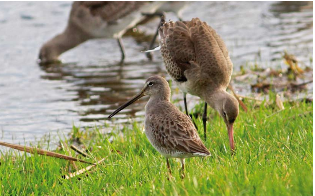
69 Long-billed Dowitcher / Grote Grijze Snip Limnodromus scolopaceus , adult winter, with Black-tailed Godwits / Grutto's Limosa limosa , Our Lady's Island Lake, Wexford, Ireland, 14 January 2013