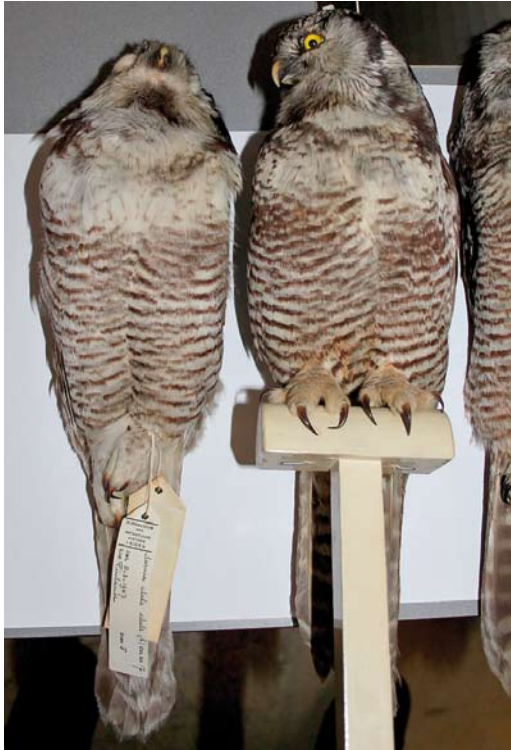
10 American Hawk Owl / Amerikaanse Sperweruil Surnia ulula caparoch (caught off Las Palmas, Gran Canaria, Canary Islands, in October 1924), right, with Northern Hawk-Owl / Sperweruil S u ulula (left: specimen from Finland), Naturalis Biodiversity Center, Leiden, Netherlands, August 2012 (Cosme D Romay)