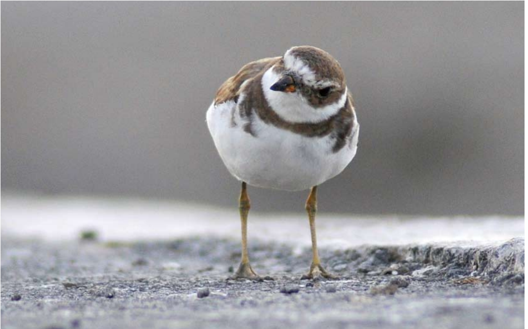
66 Semipalmated Plover / Amerikaanse Bontbekplevier Charadrius semipalmatus , Mindelo, Santo Antão, Cape Verde Islands, 3 December 2012