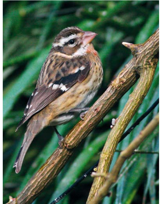
83 Rose-breasted Grosbeak / Roodborstkardinaal Pheucticus ludovicianus , first-winter male, Hugh Town, St Mary's, Scilly, England, 29 December 2012 (Martin P Goodey)

China. Dating analysis suggests that a basal divergence separating curruca and minula from the other four taxa occurred between 4.2 and 7.2 million years ago, and these two then diverged between 2.3 and 4.4 million years ago. The splits between althaea , blythi , halimodendri and margelanica occurred later, between one and 2.5 million years ago. For information on taxa identified in the Netherlands (Siberian blythi , European curruca and Central Asian halimodendri ), see www.dutchbirding.nl/news.php?id=768 . The second Eastern Oliveaceous Warbler Iduna pallida for Utsira, Rogaland, Norway, was seen on 1 October (not 1 November) and was not trapped (contra Dutch Birding 35: 404, 2012). In Western Sahara, three family groups of Cricket Warbler Spiloptila clamans were found west of Awserd in late December and early January.