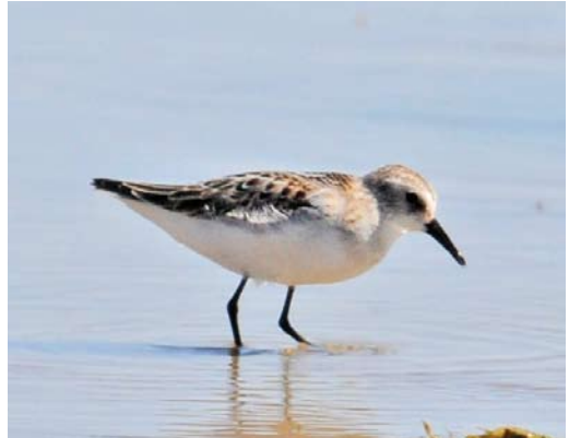
54 Red-necked Stint / Roodkeelstrandloper Calidris ruficollis , juvenile, Sorbulak lake, Almaty province, Kazakhstan, 23 September 2012 ( Machiel Valkenburg )