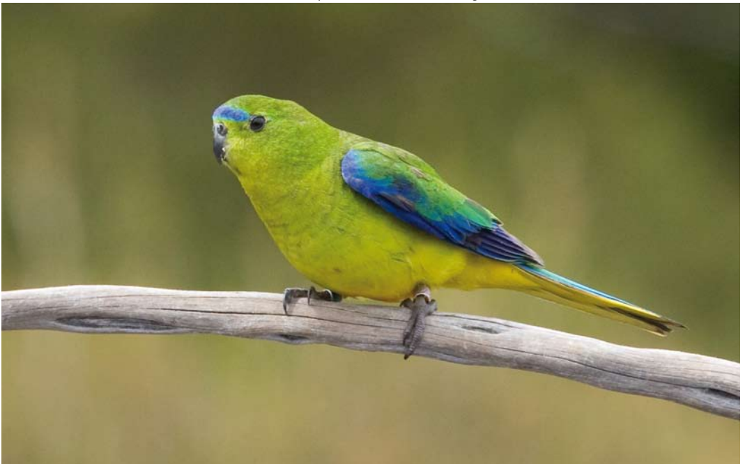
59 Orange-bellied Parrot / Oranjebuikparkiet Neophema chrysogaster , adult, Melaleuca, Tasmania, Australia, 29 January 2011 (Peter Lindenburg)