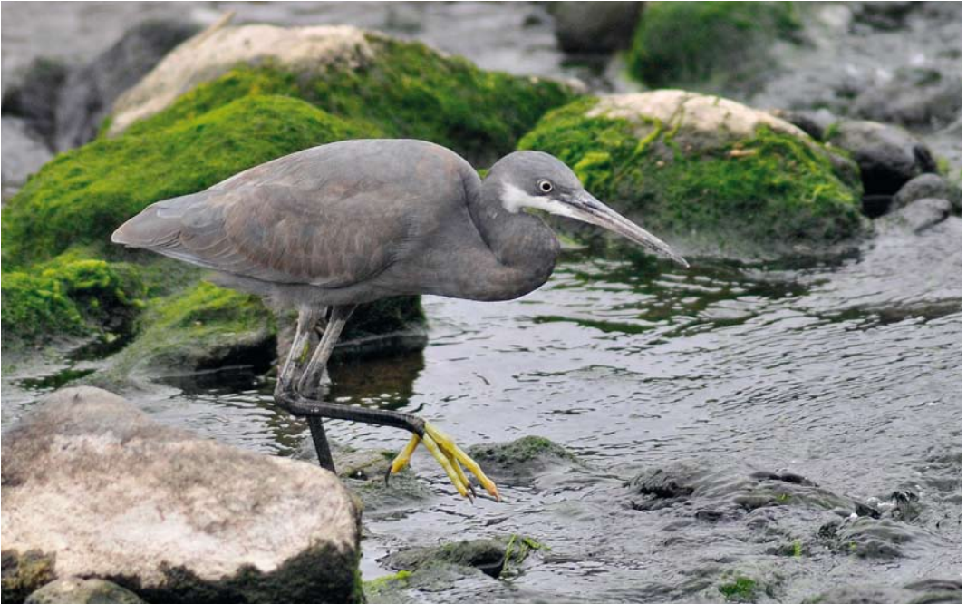
64 Western Reef Heron / Westelijke Rifeiger Egretta gularis , Ribeira Grande, Santo Antão, Cape Verde Islands, 28 November 2012