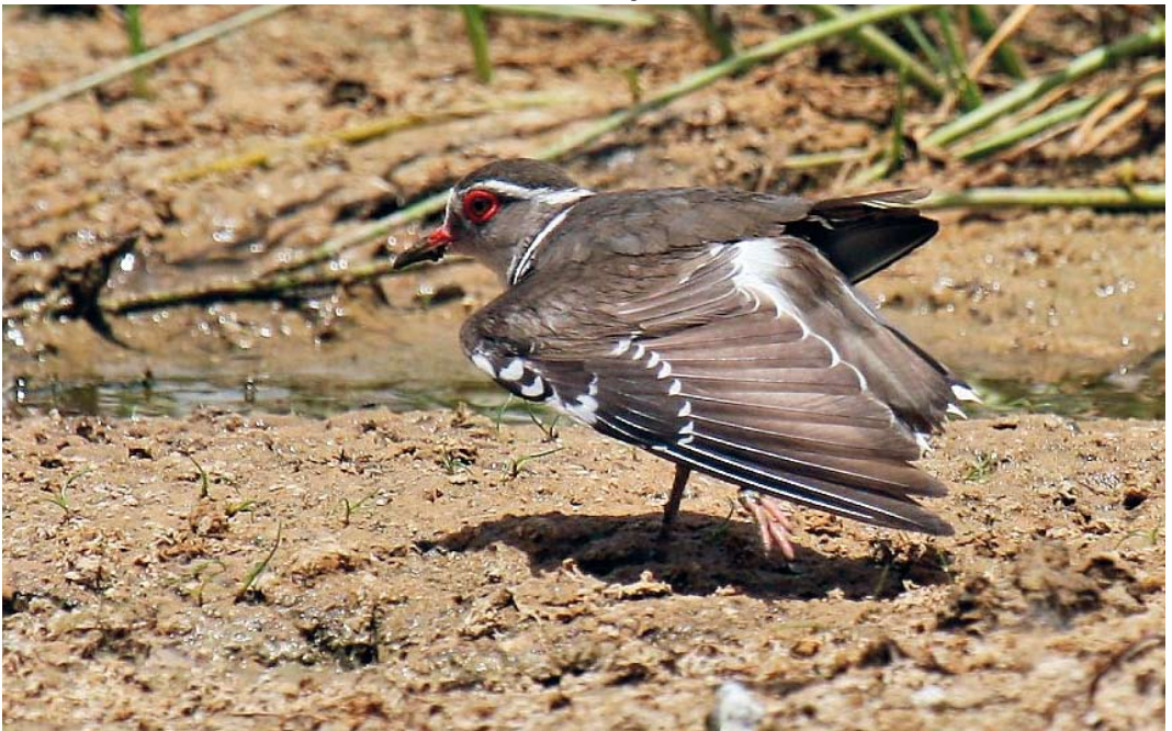
44 Three-banded Plover / Driebandplevier Charadrius tricollaris , Abu Simbel, Egypt, 1 May 2012 (Jens Hering)