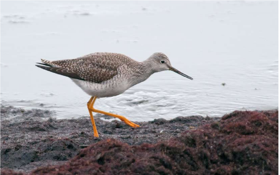
68 Greater Yellowlegs / Grote Geelpootruiter Tringa melanoleuca , juvenile, Skillinge, Skåne, Sweden, 4 January 2013 (Magnus Ulmann)