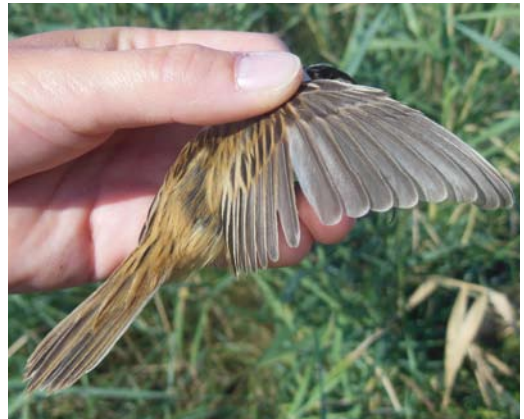
30 Aquatic Warbler / Waterrietzanger Acrocephalus paludicola , adult, Gironde estuary, Charente-Maritime, France, 23 August 2011 (Raphaël Musseau) 31 Aquatic Warbler / Waterrietzanger Acrocephalus paludicola , adult, Gironde estuary, Charente-Maritime, France, 15 August 2012 (Raphaël Musseau) 32 Aquatic Warbler / Waterrietzanger Acrocephalus paludicola , juvenile, Gironde estuary, Charente-Maritime, France, 22 August 2011 (Raphaël Musseau) 33 Aquatic Warbler / Waterrietzanger Acrocephalus paludicola , juvenile, Gironde estuary, Charente-Maritime, France, 22 August 2012 (Raphaël Musseau)

ity of males leave in the second half of July (de By 1990). Birds take a western migratory route mainly along the coastlines to reach north-western Africa in September, western Africa in October and the sub-Saharan winter quarters in November (Flade & Lachmann 2008, Schäffer et al 2006). During post-breeding migration, the species is regularly recorded in Latvia, Lithuania, Poland, Germany, Netherlands, Belgium, France, Portugal, Spain and sometimes in England (Flade & Lachmann 2008). Indirect records (predated individuals discovered in nests of Eleonora's Falcon Falco eleonora ) have also been documented along the Mediterranean Sea and Black Sea, in Turkey and Bulgaria (Flade & Lachmann 2008). Habitats used are close to those