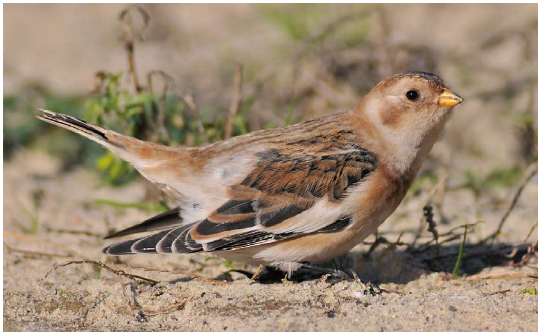
26 Snow Bunting / Sneeuwgorst Plectrophenax nivalis , male P. n. insulae , Texel, Noord-Holland, Netherlands, 11 October 2010. Extensive rusty markings on head and underparts and little contrast between fringes of scapulars and mantle-feathers indicative of insulae . 27 Snow Bunting / Sneeuwgorst Plectrophenax nivalis , female P. n. nivalis , Katwijk aan Zee, Zuid-Holland, Netherlands, 2 November 2012. Note extensive white on primaries, second innermost showing more than 60% white, diagnostic of nivalis . Also note overall pale appearance and contrast between pale mantle and rusty scapular edges.