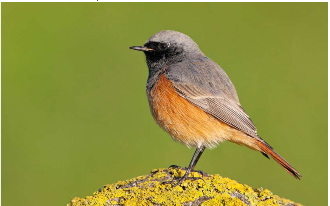
95 Oosterse Zwarte Roodstaart / Eastern Black Redstart Phoenicurus ochruros phoenicuroides , eerstejaars mannetje, Paesens, Friesland, 12 november 2012