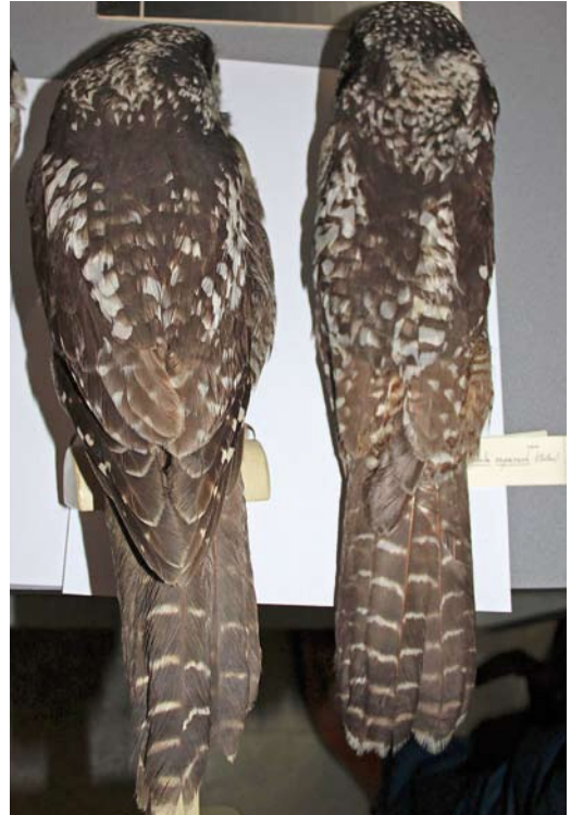
11 American Hawk Owls / Amerikaanse Sperweruilen Surnia ulula caparoch (left: caught off Las Palmas, Gran Canaria, Canary Islands, in October 1924; right: specimen from Canada), Naturalis Biodiversity Center, Leiden, Netherlands, August 2012