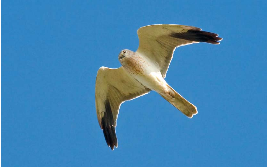
70 Pallid Harrier / Stepekiekendief Circus macrourus , second calendar-year male, Barbate, Andalucía, Spain, 8 December 2012

wordpress.com/2012/12/17/interesting-shearwater). Along the Mediterranean coast of Israel, a Leach's Storm Petrel Oceanodroma leucorhoa was seen off Akhziv on 8 December. On Santo Antão, Cape Verde Islands, several Cape Verde Storm Petrels O jabejabe were sound-recorded at Fontainhas on 27-30 November and (one) at Boca de Ambas as Ribeiras, c 3 km inland, on 2 December; breeding is not known from Santo Antão although the species has been reported in the past. If accepted, a White-tailed Tropicbird Phaethon lepturus found dead on the tideline at Mawbray Bank, Cumbria, England, on 6 January would be the first for Britain. A white-morph Red-footed Booby Sula sula was photographed on Raso, Cape Verde Islands, on 9 October. On 13 December, a Masked Booby S dactylatra turned up on Curral Velho off Boa Vista, Cape Verde Islands. The first-winter Double-crested Cormorant Phalacrocorax auritus on El Hierro, Canary Islands, from 22 October was still present on 30 November.