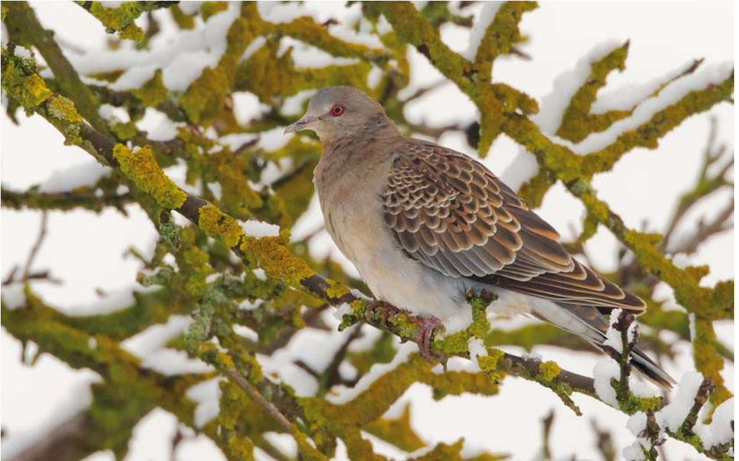
78 Rufous Turtle Dove / Meenatortel Streptopelia orientalis meena , first-winter, Wabern, Hessen, Germany, 2 December 2012 (David Monticelli)