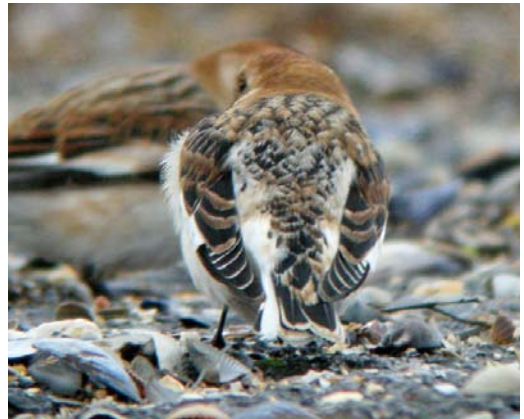
18 Snow Bunting / Sneeuwgors Plectrophenax nivalis , adult male P n insulae , Eemshaven, Groningen, Netherlands, 6 January 2008 ( Rik Winters ). Note fringes to mantle-feathers being only slightly paler than fringes of scapulars. 19 Snow Bunting / Sneeuwgors Plectrophenax nivalis , male, Lauwersoog, Groningen, Netherlands, 23 February 2008 ( Rik Winters ). Tertial and inner greater covert edges much abraded, rump invisible, so age and subspecies cannot be told with certainty, but rusty fringes to mantle-feathers and compact appearance suggest insulae . 20 Snow Bunting / Sneeuwgors Plectrophenax nivalis , first-winter female, Lauwersoog, Groningen, Netherlands, 18 February 2008 ( Rik Winters ). Tertial and inner greater covert edges abraded and narrow, tail-feathers sharply pointed. Grey mantle and extensive white underparts indicate P n nivalis . 21 Snow Bunting / Sneeuwgors Plectrophenax nivalis , adult male P n insulae , Lauwersoog, Groningen, Netherlands, 23 December 2008 ( Rik Winters ). Note typical rump pattern with extensive black markings.

In general, adults show more white than first-winter birds of the same sex and subspecies. When both sex and subspecies can (in most cases) be determined, some additional features may be of use when determining the age of the bird.