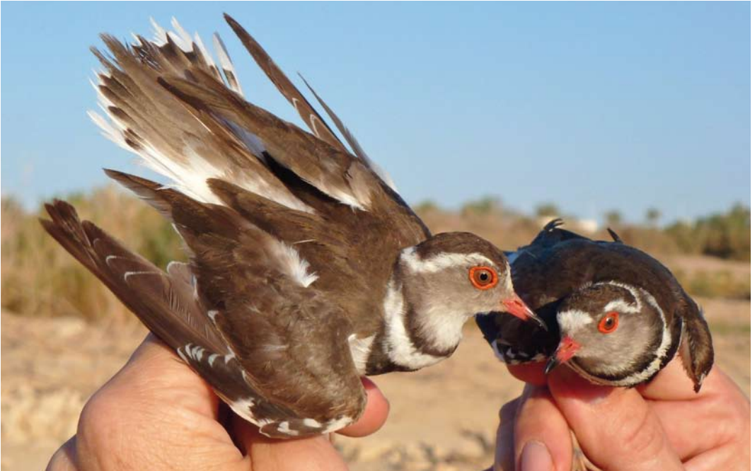
41 Three-banded Plovers / Driebandplevieren Charadrius tricollaris , Abu Simbel, Egypt, 3 May 2012 (Jens Hering)