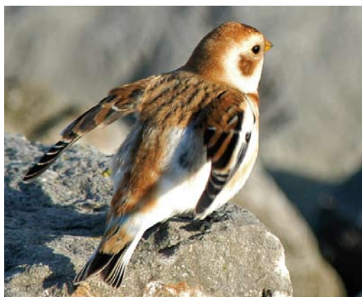
22 Snow Bunting / Sneeuwgorz Plectrophenax nivalis , first-winter female P n insulae , Lauwersoog, Groningen, Netherlands, 23 December 2008 (Rik Winters). Note broad edge to moulted inner greater covert. 23 Snow Bunting / Sneeuwgorz Plectrophenax nivalis , first-winter female P n insulae , De Blocq van Kuffeler, Flevoland, 24 December 1996 (Arnoud B van den Berg). Note general rusty appearance and lack of obvious white. 24 Snow Buntings / Sneeuwgorzen Plectrophenax nivalis , Katwijk aan Zee, Zuid-Holland, Netherlands, 2 November 2012 (Luuk Punt). Male nivalis (right): note rump without black; rusty fringes wear with time, leaving rump white. 25 Snow Bunting / Sneeuwgorz Plectrophenax nivalis , male P n insulae , IJmuiden, Noord-Holland, Netherlands, 10 November 2003 (Arnoud B van den Berg). Note extensive rusty markings and black centres of rump-feathers visible through rusty edges.

the rump. Subspecific identification of females is less straightforward; c 75% can be assigned to subspecies using features not easily observed in the field while, on the other hand, the reliability of visible features is not well known.