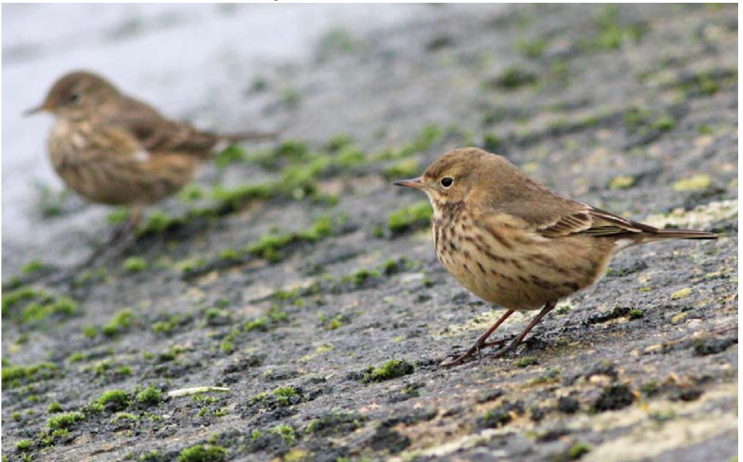
87 American Buff-bellied Pipits / Amerikaanse Waterpiepers Anthus rubescens rubescens , Queen Mother Reservoir, Berkshire, England, 26 December 2012 ( Marek Walford )