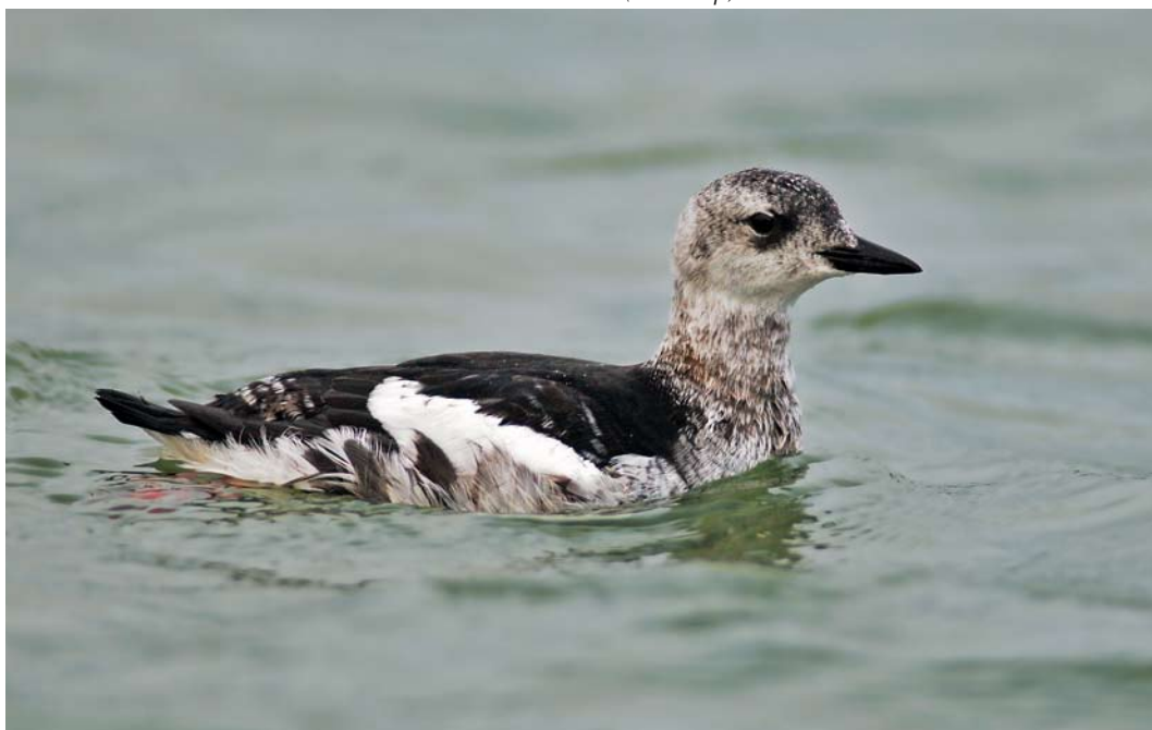
90 Zwarte Zeekoet / Black Guillemot Cephus grylle , adult winter, Oudeschild, Texel, Noord-Holland, 16 december 2012