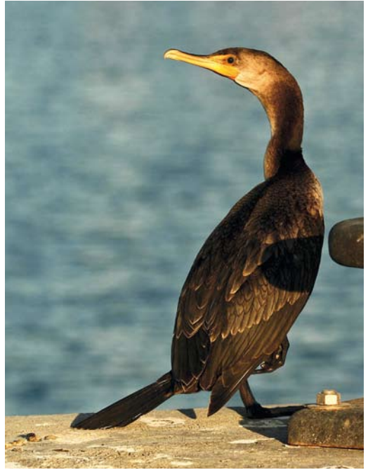
61 Red-footed Booby / Roodpootgent Sula sula , Raso, Cape Verde Islands, 9 October 2012 (Gerard Bota) 62 Double-crested Cormorant / Geoorde Aalscholver Phalacrocorax auritus , first-year, La Restinga, El Hierro, Canary Islands, November 2012 (Marcel Gil Velasco) 63 Slaty-backed Gull / Kamtsjatkameeuw Larus schistisagus , adult, Hrodna, Hrodna Oblast, Belarus, 30 December 2012 (Mikalay Hulinski/www.birdwatch.by)