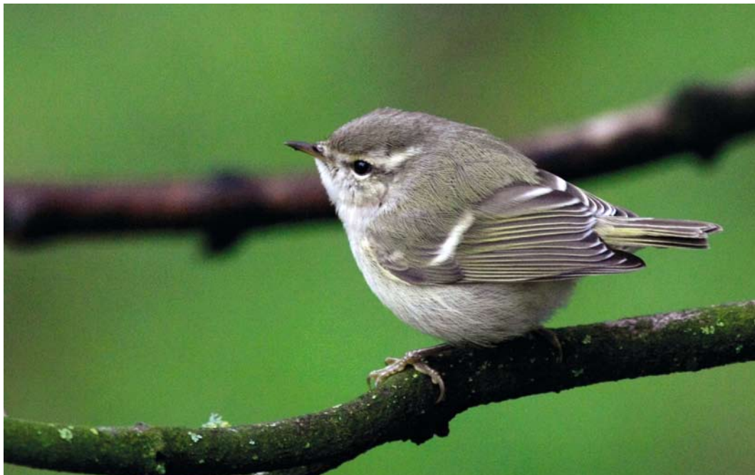
92 Humes Bladkoning / Hume's Leaf Warbler Phylloscopus humei , Beijum, Groningen, Groningen, 25 december 2012 ( Ipe Weeber )