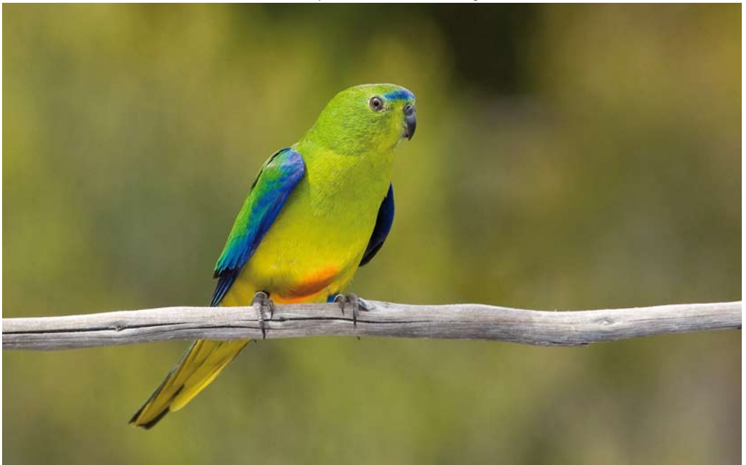
57 Orange-bellied Parrot / Oranjebuikparkiet Neophema chrysogaster , adult, Melaleuca, Tasmania, Australia, 29 January 2011 (Peter Lindenburg)