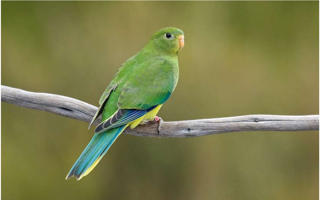
56 Orange-bellied Parrot / Oranjebuikparkiet Neophema chrysogaster , juvenile, Melaleuca, Tasmania, Australia, 29 January 2011 (Peter Lindenburg)