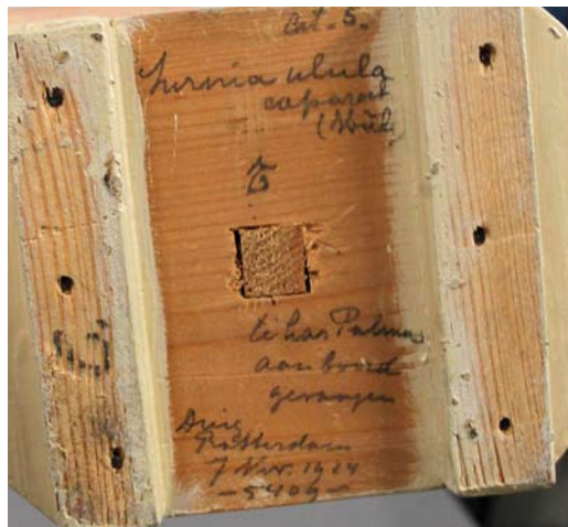
4 Underside of stand of American Hawk Owl / Amerikaanse Sperweruil Surnia ulula caparoch caught off Las Palmas, Gran Canaria, Canary Islands, in October 1924: 'caught at Las Palmas aboard ship; Rotterdam Zoo, 7 November 1924'. Naturalis Biodiversity Center, Leiden, Netherlands, August 2012