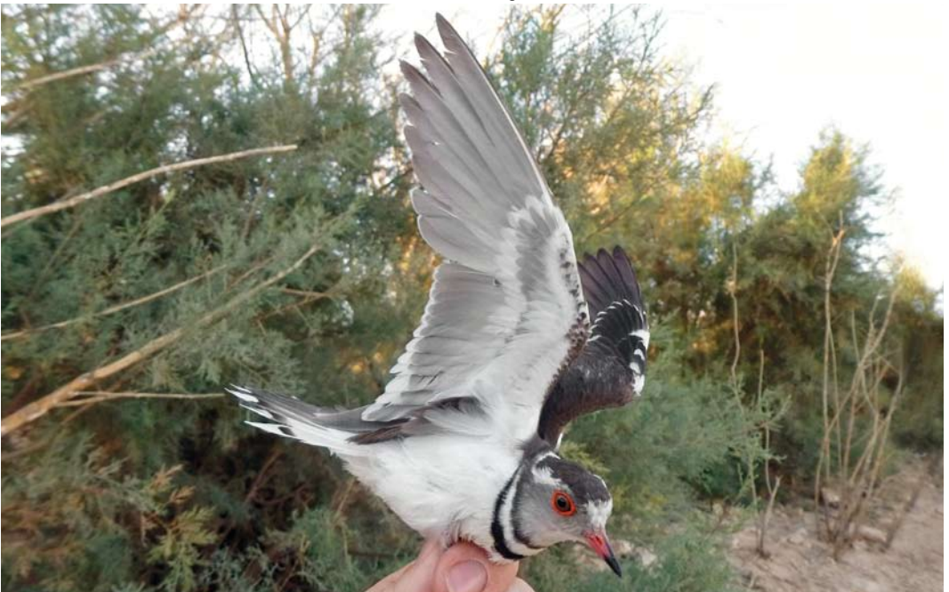
42 Three-banded Plover / Driebandplevier Charadrius tricollaris , Abu Simbel, Egypt, 3 May 2012 (Jens Hering)