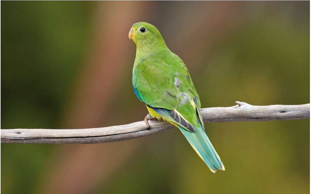
58 Orange-bellied Parrot / Oranjebuikparkiet Neophema chrysogaster , juvenile, Melaleuca, Tasmania, Australia, 29 January 2011 (Peter Lindenburg)