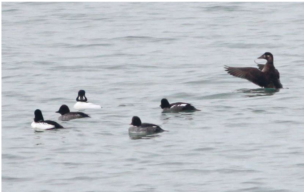
89 Brilzee-eend / Surf Scoter Melanitta perspicillata , eerste-winter vrouwtje, met Brilduikers / Common Goldeneyes Bucephala clangula , Brouwersdam, Zeeland, 18 december 2012 ( Pim A Wolf )