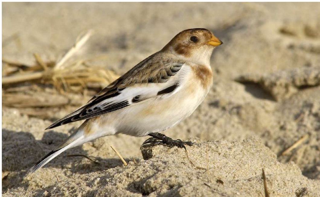
28 Snow Bunting / Sneeuwgor Plectrophenax nivalis , male P n nivalis , Julianadorp, Noord-Holland, Netherlands, 23 September 2002 ( René Pop ). Male nivalis as indicated by pale fringes to mantle-feathers, extensive white in primary coverts, white in primaries and overall pale appearance. 29 Snow Bunting / Sneeuwgor Plectrophenax nivalis , adult male P n nivalis , Texel, Noord-Holland, Netherlands, 25 May 2004 ( René Pop ). Note totally white rump and whitish fringes to mantle-feathers. Lack of white at primary bases indicates second calendar-year.