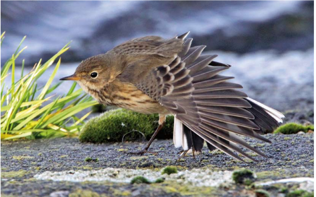
86 American Buff-bellied Pipit / Amerikaanse Waterpieper Anthus rubescens rubescens , Queen Mother Reservoir, Berkshire, England, 15 December 2012 ( Chris Baines )