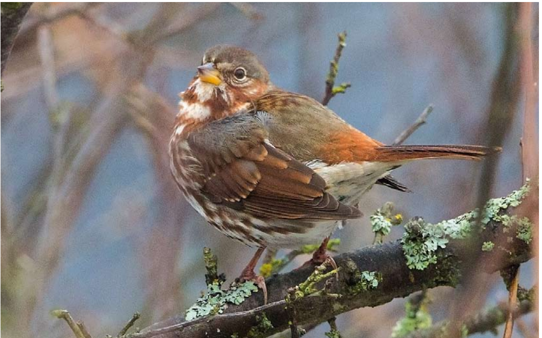
85 Fox Sparrow / Roodstaartgors Zonotrichia iliaca , Korpoo, Utö, Finland, 20 December 2012