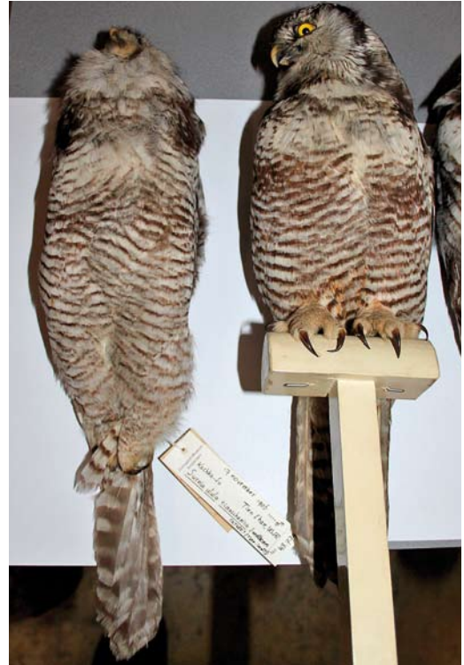
9 American Hawk Owl / Amerikaanse Sperweruil Surnia ulula caparoch (caught off Las Palmas, Gran Canaria, Canary Islands, in October 1924), right, with Northern Hawk-Owl / Sperweruil S u tianschanica (specimen from Central Asia), Naturalis Biodiversity Center, Leiden, Netherlands, August 2012 (Cosme D Romay). Note that underpart barring is slightly bolder and darker in caparoch than in tianschanica .

in characters but the overlap is wide. Some differences between both taxa exist in the pattern of individual feathers on crown, scapulars and chest (eg, Cramp 1985) but even within one individual the variation in feather pattern in each of these feather tracts is large and valid for identification only when exactly the same feather of ulula and caparoch is compared. The only easy identification character is formed by the colour pattern of the two longest primaries (p7-8; primaries numbered from inside): ulula shows 8-10 white spots beyond the longest primary covert on the outer web of these feathers (of which 4-5 on the emarginated part), caparoch has 5-7 white spots (2-3 on the emarginated part); moreover, the spots of ulula are larger and squarer and of caparoch smaller and rounder. This character is useful in the field as well. The Las Palmas bird has only five spots on the outer web of p7-8 (of which two small ones on the emarginated part) and thus clearly belongs to caparoch . Measurements of