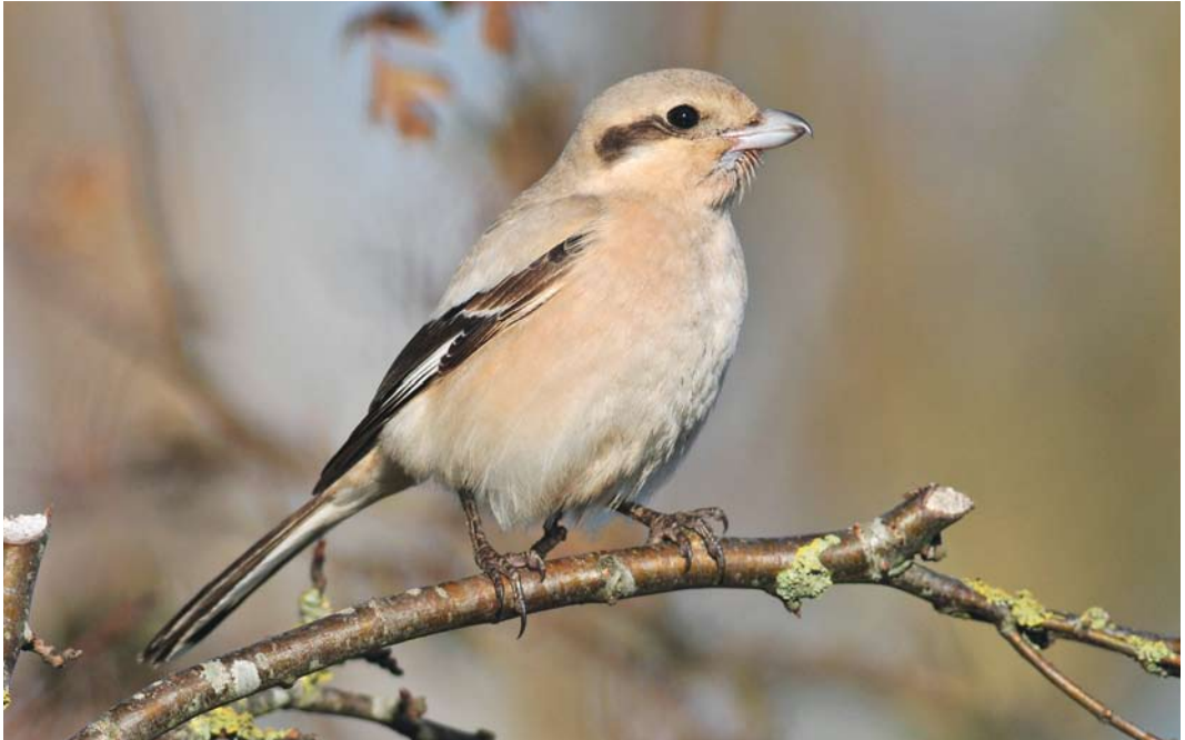
96 Steppeklapekster / Steppe Grey Shrike Lanius lahtora pallidirostris , eerstejaars, Buitendijk, Texel, Noord-Holland, 5 november 2012

en overige belangstellenden bezocht. In totaal werden c 25-30 exemplaren geteld, waaronder de bekende lichte vogel met kenmerken van Zugmayers Huiskraai C s zugmayeri (een noordwestelijke ondersoort). Tegenstanders van de bestrijdingsactie tekenden met succes bezwaar aan; de rechter besloot om voorlopig niet tot eliminatie over te gaan, omdat de Huiskraai is aangevoelen als beschermde inheemse soort. De enige telst waar Bonte Kraaien C cornix werden gemeld was de Eemshaven, met zeven exemplaren. Het Zuid-Hollandse paar Raven C corax werd de gehele periode rondom Meijndel waargenomen. Vanaf 4 november bevonden zich weer overwinterende Buidelmezen Remiz pendulinus rondom Vockestaert, Zuid-Holland, ditmaal maximaal twee. Net als vorige winter was een van de vogels geringd. Op 22 november werden er nog liefst vijf geringd in het Verdronken Land van Saeftinghe, Zeeland, waar op 17 december ook nog een veldwaarneming werd verricht. De twee Kuifleeuweriken Galerida cristata van Venlo, Limburg, bleven de gehele periode. Met slechts 19 gemelde langstreckende Strandleeuweriken Eremophila alpestris bleef de soort uitermate schaars. Een late Oeverzwaluw Riparia riparia verbleef op 9 november bij het Zuidlaardermeer, Groningen. Tot eind november werden nog verscheidene Boerenzwaluwen Hirundo rustica waargenomen. Op 16 december volgde ten slotte nog een melding bij Puttershoek, Zuid-Holland. Er was een serie waarnemingen van late Huiszwaluwen Delichon urbicum , met