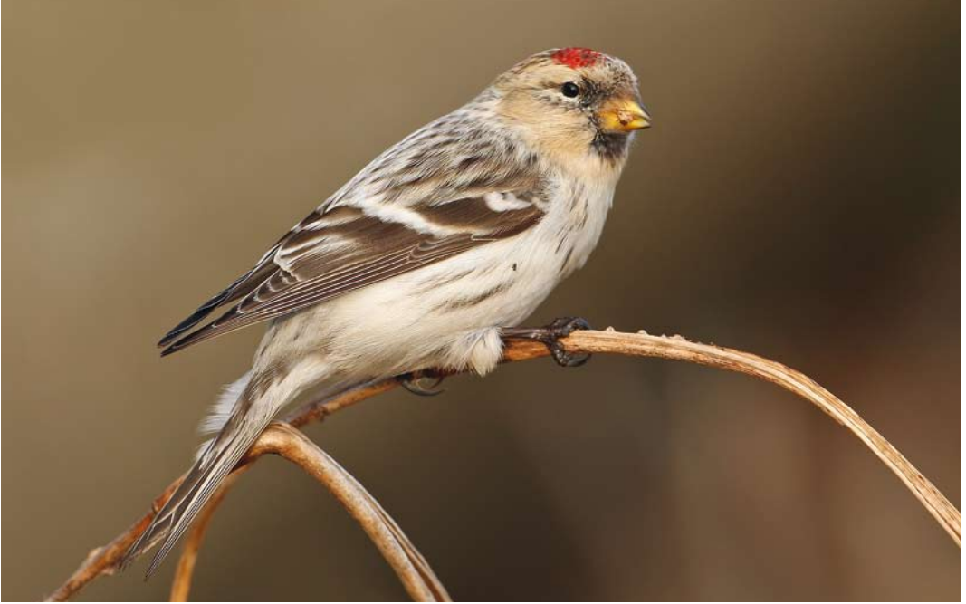
76 Hornemann's Redpoll / Groenlandse Witstuitbarmsijs Acanthis hornemanni hornemanni, first-year, Aldeburgh, Suffolk, England, 16 December 2012