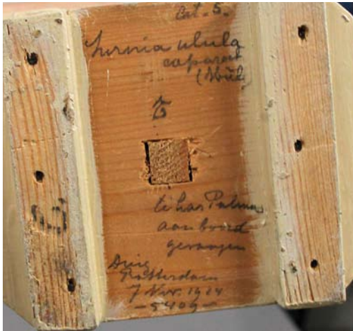
4 Underside of stand of American Hawk Owl / Amerikaanse Sperweruil Surnia ulula caparoch caught off Las Palmas, Gran Canaria, Canary Islands, in October 1924: 'caught at Las Palmas aboard ship; Rotterdam Zoo, 7 November 1924'. Naturalis Biodiversity Center, Leiden, Netherlands, August 2012