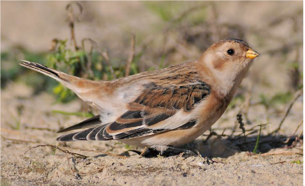
26 Snow Bunting / Sneeuwgorst Plectrophenax nivalis , male P. n. insulae , Texel, Noord-Holland, Netherlands, 11 October 2010 (René Pop). Extensive rusty markings on head and underparts and little contrast between fringes of scapulars and mantle-feathers indicative of insulae . 27 Snow Bunting / Sneeuwgorst Plectrophenax nivalis , female P. n. nivalis , Katwijk aan Zee, Zuid-Holland, Netherlands, 2 November 2012 (René van Rossum). Note extensive white on primaries, second innermost showing more than 60% white, diagnostic of nivalis . Also note overall pale appearance and contrast between pale mantle and rusty scapular edges.