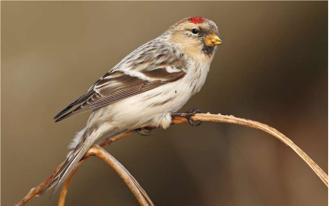
76 Hornemann's Redpoll / Groenlandse Witstuitbarmsijs Acanthis hornemanni hornemanni, first-year, Aldeburgh, Suffolk, England, 16 December 2012