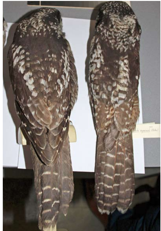
11 American Hawk Owls / Amerikaanse Sperweruilen Surnia ulula caparoch (left: caught off Las Palmas, Gran Canaria, Canary Islands, in October 1924; right: specimen from Canada), Naturalis Biodiversity Center, Leiden, Netherlands, August 2012