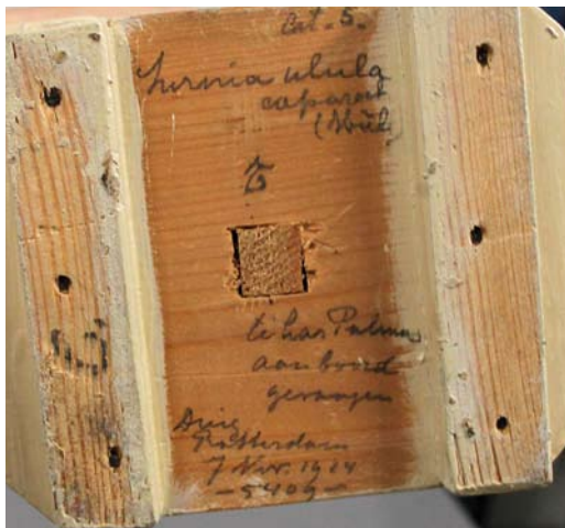
4 Underside of stand of American Hawk Owl / Amerikaanse Sperweruil Surnia ulula caparoch caught off Las Palmas, Gran Canaria, Canary Islands, in October 1924: 'caught at Las Palmas aboard ship; Rotterdam Zoo, 7 November 1924'. Naturalis Biodiversity Center, Leiden, Netherlands, August 2012