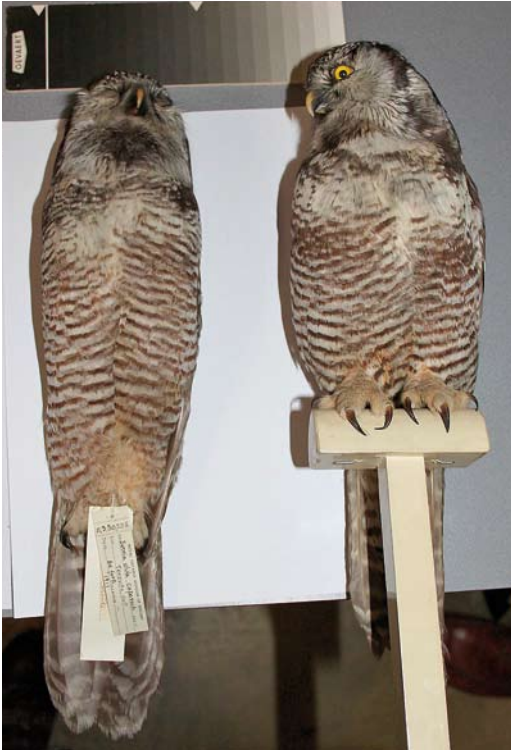
8 American Hawk Owls / Amerikaanse Sperweruilen Surnia ulula caparoch (right: caught off Las Palmas, Gran Canaria, Canary Islands, in October 1924; left: specimen from Canada), Naturalis Biodiversity Center, Leiden, Netherlands, August 2012

in characters but the overlap is wide. Some differences between both taxa exist in the pattern of individual feathers on crown, scapulars and chest (eg, Cramp 1985) but even within one individual the variation in feather pattern in each of these feather tracts is large and valid for identification only when exactly the same feather of ulula and caparoch is compared. The only easy identification character is formed by the colour pattern of the two longest primaries (p7-8; primaries numbered from inside): ulula shows 8-10 white spots beyond the longest primary covert on the outer web of these feathers (of which 4-5 on the emarginated part), caparoch has 5-7 white spots (2-3 on the emarginated part); moreover, the spots of ulula are larger and squarer and of caparoch smaller and rounder. This character is useful in the field as well. The Las Palmas bird has only five spots on the outer web of p7-8 (of which two small ones on the emarginated part) and thus clearly belongs to caparoch . Measurements of