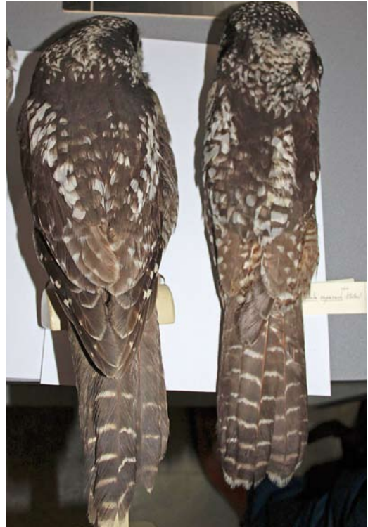
11 American Hawk Owls / Amerikaanse Sperweruilen Surnia ulula caparoch (left: caught off Las Palmas, Gran Canaria, Canary Islands, in October 1924; right: specimen from Canada), Naturalis Biodiversity Center, Leiden, Netherlands, August 2012