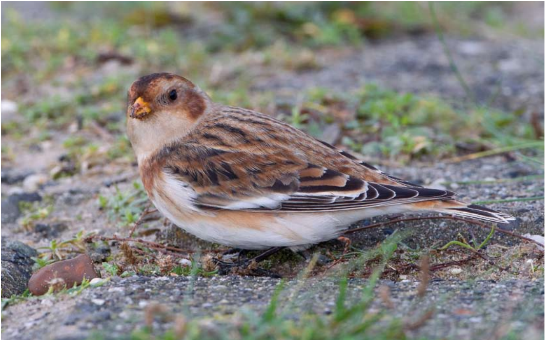
17 Snow Bunting / Sneeuwgorz Plectrophenax nivalis , adult female P n insulae , Katwijk aan Zee, Zuid-Holland, Netherlands, 2 November 2012. Pointed centre of scapulars typical for female. Extensive coloration on head and underparts and slight contrast between mantle and scapulars indicate insulae .

The inner greater coverts can be used in two ways. They are largely dark with a pale fringe. In juveniles, this fringe is narrow and easily wears off while, in adults, the fringe is wide and less prone to wear. Especially late in the season, interpretation of this feature may become difficult. The tell-tale sign of age is a moult contrast shown by some first-winter birds. Some have moulted their innermost (rarely two) inner greater covert(s) and replaced the narrowly edged juvenile one(s) by a broadly edged adult-type feather. Any bird showing a broadly edged inner greater covert next to a narrowly edged one certainly is a first-winter (plate 22).