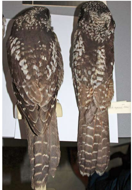
11 American Hawk Owls / Amerikaanse Sperweruilen Surnia ulula caparoch (left: caught off Las Palmas, Gran Canaria, Canary Islands, in October 1924; right: specimen from Canada), Naturalis Biodiversity Center, Leiden, Netherlands, August 2012