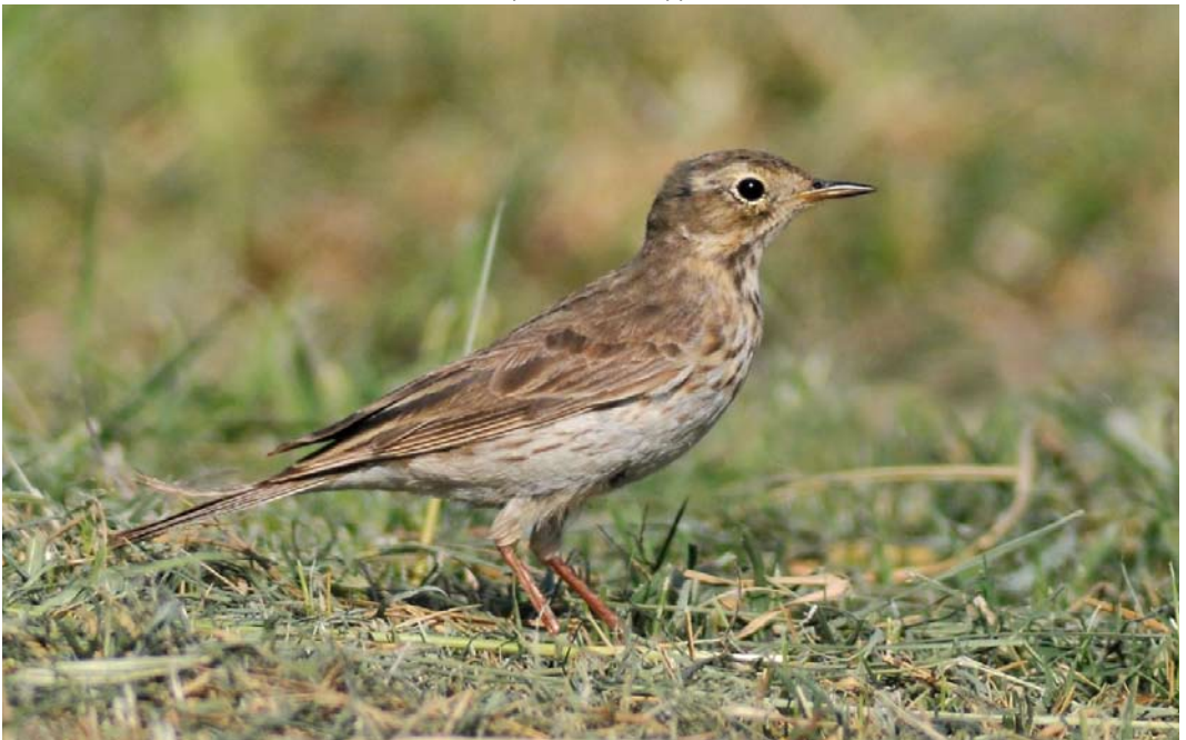
246 Siberian Buff-bellied Pipit / Siberische Waterpieper Anthus rubescens japonicus , Sohar, Oman, 23 March 2013