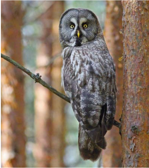
181 Great Grey Owl / Laplanduul Strix nebulosa , adult, Sobibor forest, Lublin province, Poland, 15 July 2012