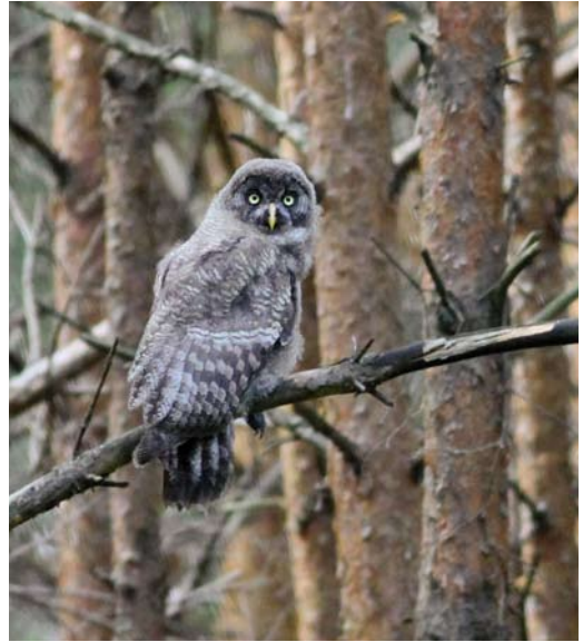
182 Great Grey Owl / Laplanduul Strix nebulosa , juvenile, Sobibor forest, Lublin province, Poland, 15 July 2012 (Maciej Kowalski)

Zhytomyr district in the Polesie reserve in 2002, a total of 26 occupied nests were reported. Overall, the number is estimated at 30-33 pairs (Gorban & Bumar 2003). During this period, the species began to show up in areas south of the reserve. Later, it was found nesting west of the Polesie reserve in the Rivne and Volyn districts. A nest was found in the Rivne reserve in May 2005 (Hymyn 2005a), while previously at least 10 breeding pairs had been found in the reserve (Gorban & Bumar 2003). Thereafter, a nest was found in Cheremskom reserve in the western Volyn region in late May 2005 (Hymyn 2005b); this is the most westerly nest found in Ukraine. The distance from the Polesie reserve is c 290 km west-south-west. Only one sighting was reported in the Chernihiv region of left-bank Polesie in September 1984 (Marisova et al 1991). However, these data are not confirmed. There are no other reports from left-bank Polesie.