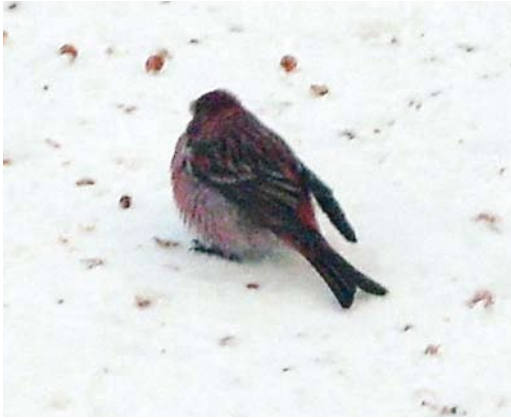
198 Pallas's Rosefinch / Pallas' Roodmus Carpodacus roseus , male, Ulyanovsk, Russia, 25 January 2011. Same bird as plate 199.