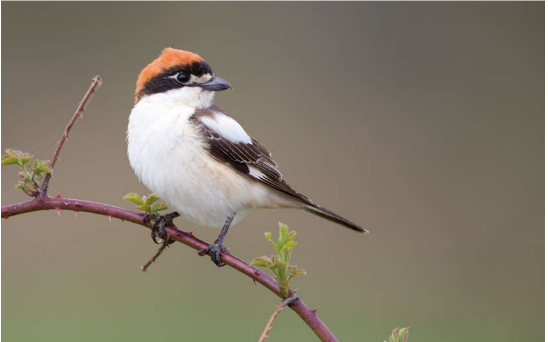
264 Roodkopklauwier / Woodchat Shrike Lanius senator , Udenhout, Noord-Brabant, 23 april 2013