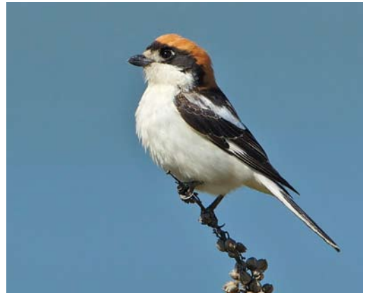
260 Roodstuitwaluw / Red-rumped Swallow Cecropis daurica , Kustweg, Lauwersoog, Groningen, 17 april 2013 (Willem Hartholt) 261 Iberische Tjiftjaf / Iberian Chiffchaff Phylloscopus ibericus , Donkere Duinen, Den Helder, Noord-Holland, 30 april 2013 (Maurits Martens) 262 Hop / Eurasian Hoopoe Upupa epops , Beilen, Drenthe, 15 april 2013 (Frank van der Wielen) 263 Roodkopklauwier / Woodchat Shrike Lanius senator , Maasvlakte, Zuid-Holland, 28 april 2013 (Martin van der Schalk)

Haliaeetus albicilla , 2183 Bruine Kiekendieven Circus aeruginosus met onder andere 101 langs Breskens op 8 april, 284 Blauwe Kiekendieven C cyaneus , 12 Grauwe Kiekendieven C pygargus , 19 Ruigpootbuizerds Buteo lagopus , 98 Visarenden Pandion haliaetus , 216 Smellekens Falco columbarius , slechts 97 Boomvalken F sub-buteo (234 in dezelfde periode in 2012) en 218 Slechtvalken F peregrinus . Een Slangenarend Circaetus gallicus werd op 29 april gemeld boven het Drents-Friese Wold bij Wateren, Drenthe. Vanaf 6 april werden minstens 15 doortrekkende Steppekiekendieven C macrourus opgemerkt. Zoals inmiddels gebruikelijk in het voorjaar was de soort nauwelijks twitchbaar. Vanaf half april werden slechts c vijf Roodpootvalken F vespertinus gemeld, waaronder een pleisteraar vanaf 21 april in het Haaksbergerveen, Overijssel. In de eerste week van maart tekende zich massale trek van Kraanvogels Grus grus af; alleen al door trektellers werden toen ruim 63 000