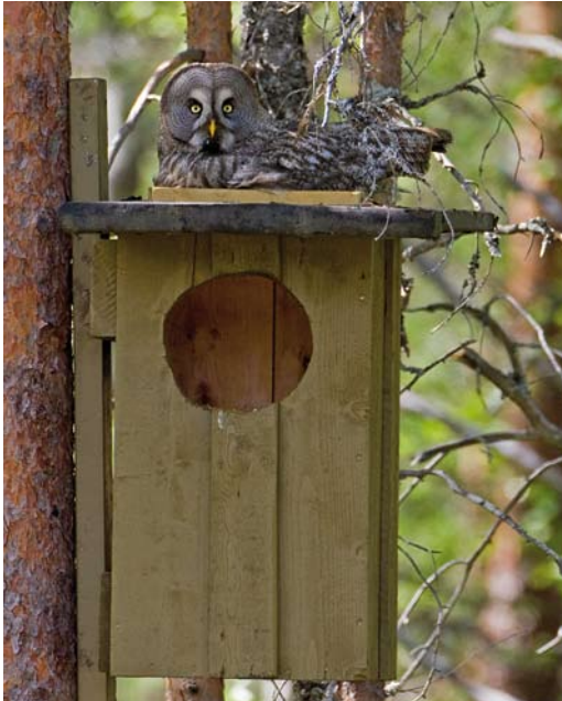
176 Great Grey Owl / Laplanduil Strix nebulosa , female incubating eggs on top of Ural Owl S uralensis nest box, Elverum, Hedmark, Norway, 2 June 2011

ing a very good breeding year. According to Stefansson (1997), the autumn population in Sweden that year must have been at least 3000 individuals. However, the total population in Sweden is considered to have declined slightly during the last 30 years to 400 pairs (from an estimated 500 pairs; Ottosson et al 2012, cf Hipkiss et al 2008), while it is considered stable in Finland (estimated population size fluctuating between 300 and 1500 breeding pairs; Valkama et al 2011). In Norway, Great Grey Owls have been regularly sighted in south-eastern districts ever since the first breeding pair was found there in 1989 (Solheim 2009; figure 1). The winters of 2009/10 and 2010/11 in Norway were cold with dry and loose snow, which seemed to trigger the biggest vole year in decades. The species bred in the south-east of the country in unprecedented numbers, with three pairs in 2010 (Berg 2010) and at least 22 pairs in 2011 (Berg et al 2011; figure 1; plate 175-176). Based on wing moult patterns (cf Solheim 2011), the majority of them were aged as first-year birds (Solheim et al in prep). Two breeding females had been ringed as juveniles in mid-central Sweden one and 11 years earlier (Berg et al 2011). During the winter of 2011/12, at least 12