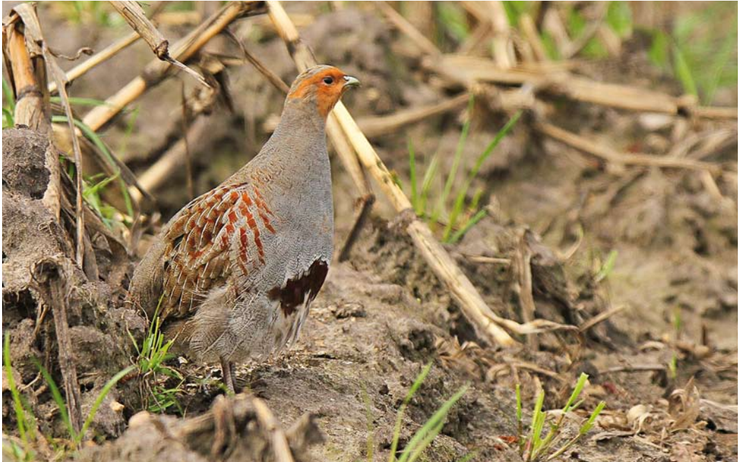
187 Grey Partridge / Patrijs Perdix perdix , Lage Veld, Drenthe, Netherlands, 21 April 2013. Photographed within range of P p sphagnetorum .