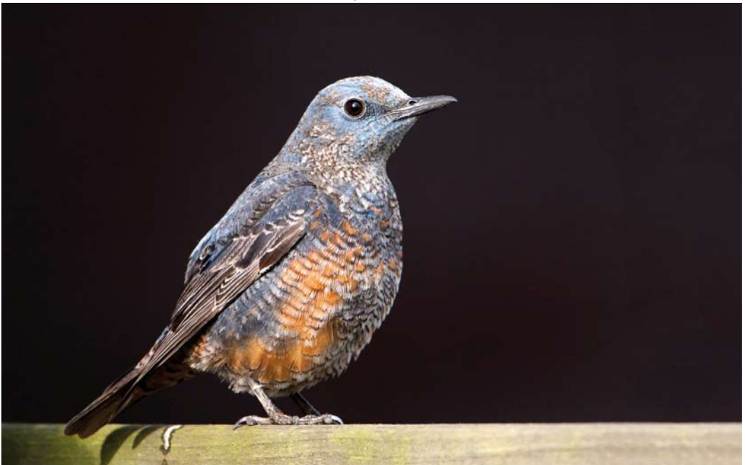
265 Rotslijster / rock thrush Monticola , Den Helder, Noord-Holland, 13 april 2013 (Martijn Verdoes)