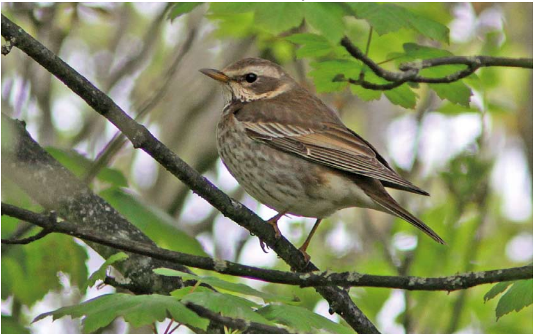
250 Dusky Thrush / Bruine Lijster Turdus eunomus , first-summer female, Margate, Kent, England, 18 May 2013