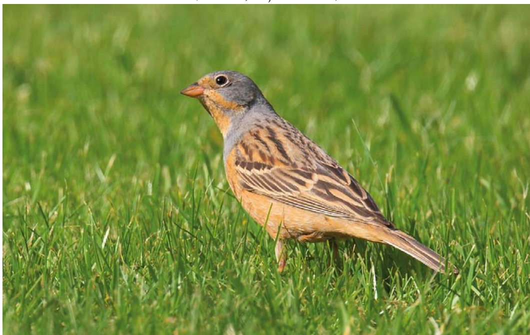
206 Bruinkeelortolaan / Cretzschmar's Bunting Emberiza caesia , mannetje, Lauwersoog, Groningen, 5 mei 2013