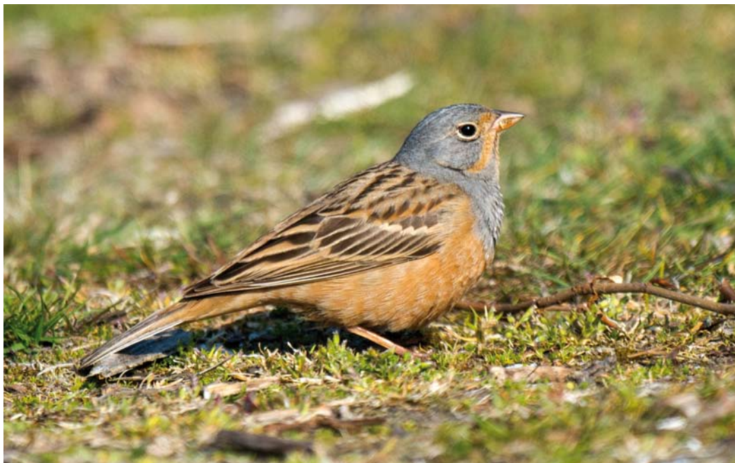
205 Bruinkeelortolaan / Cretzschmar's Bunting Emberiza caesia , mannetje, Lauwersoog, Groningen, 5 mei 2013 (Arnoud B van den Berg)