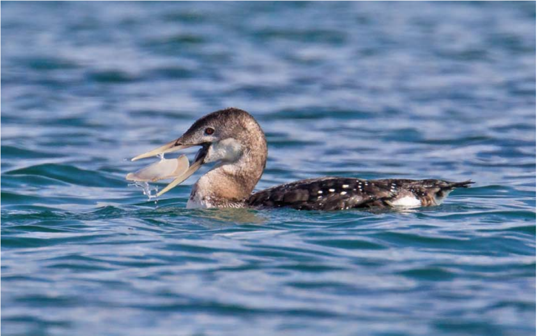
225 Yellow-billed Loon / Geelsnavelduiker Gavia adamsii , adult, Herston, South Ronaldsay, Orkney, Scotland, 7 April 2013