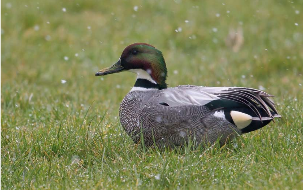
254 Bronskopeend / Falcated Duck Anas falcata , mannetje, Spijkenisse, Zuid-Holland, 20 maart 2013 (Kris De Rouck)