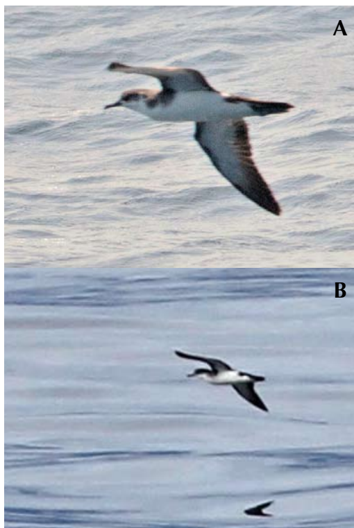
FIGURE 2 A Boyd's Shearwater / Kaapverdise Kleine Pijlstormvogel Puffinus boydi , off Cape Verde Islands, March 2009 (Killian Mullarney); B unidentified shearwater / ongedetermineerde pijlstormvogel P boydi/lherminieri , between Tenerife and La Gomera, Canary Islands, 10 December 2012 (Marcel Gil Velasco). Centre of gravity is similarly close to chest. Lower bird seems to have blunter head but this impression could be distorted by light conditions.

Barolo seem to show this extensive dark underwing pattern and some authors (eg, Howell 2012) have even speculated about the possibility of these belonging to a new taxon.