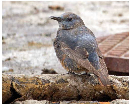
269 Rotstijster / rock thrush Monticola , Den Helder, Noord-Holland, 13 april 2013 (Mattias Hofstede)