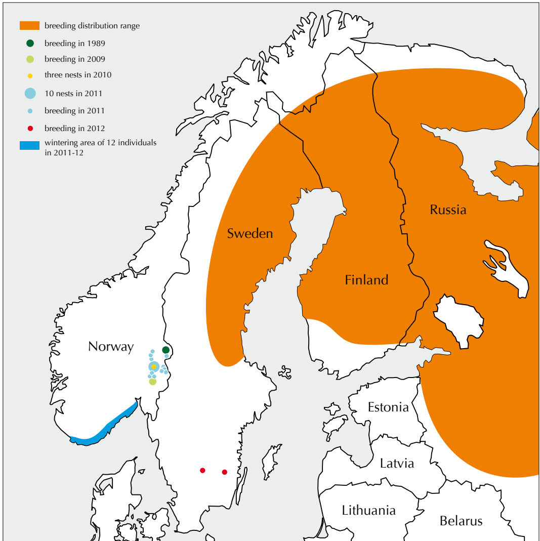
FIGURE 1 Current distribution of Great Grey Owl Strix nebulosa in Fennoscandia and western Russia (based on Solheim 2009, Berg et al 2011, Valkama et al 2011, Ottosson et al 2012; this paper).

forest. At that time, the population in Belarus was estimated at 50-100 pairs (Tishechkin et al 1997).