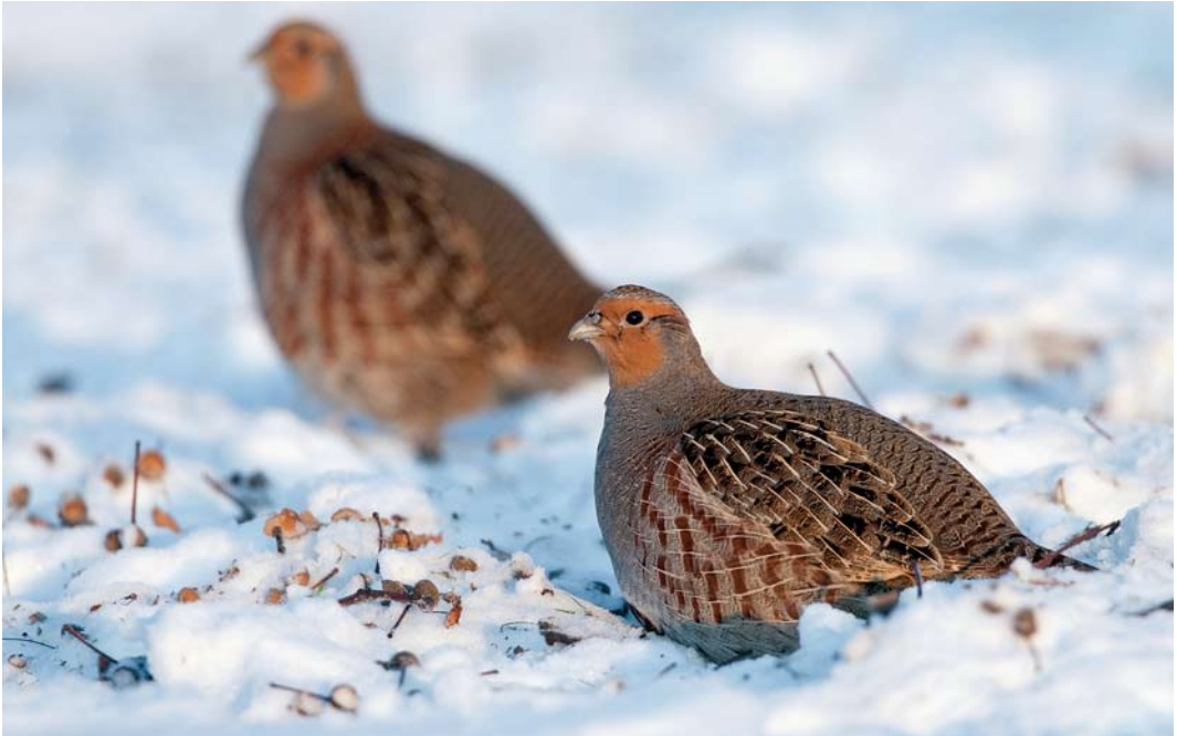
189 Grey Partridge / Patrijs Perdix perdix , Tilburg, Noord-Brabant, Netherlands, 19 December 2009. Birds photographed within range of nominate P p perdix when following 'traditional' range but within range of P p sphagnetorum when following Kelm (1979). Note that both snow and low sunlight affect colours here.

schilt van de rest van de populatie. In het geval van sphagnetorum zijn de verschillen clinaal en er is geen duidelijke grens tussen sphagnetorum en perdix . Dit, in combinatie met eerder onderzoek dat heeft aangetoond dat er weinig genetische verschillen zijn, leidt er toe dat sphagnetorum beter als synoniem van nominaat perdix kan worden aangemerkt.