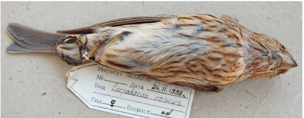
195-197 Pallas's Rosefinch / Pallas' Roodmus Carpodacus roseus , female or first-year male (collected at Saraktash district, Orenburg oblast, Russia, 24 November 1998), Institute of Plant and Animal Ecology, Ural Centre of Russian Academy of Sciences, Yekaterinburg, Russia, 26 July 2010