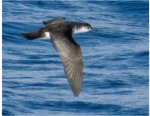
212 Boyd's Shearwater / Kaapverdise Kleine Pijlstormvogel Puffinus boydi , off Cape Verde Islands, 25 March 2007. Note rather pale face. 213 Barolo Shearwater / Kleine Pijlstormvogel Puffinus baroli , off Canary Islands, 6 August 2012. Note parallel pale wing-bars giving impression of pale panel on greater coverts. Note also isolated eye in middle of face and short-tailed and short-winged impression.

it were definitely identified as Audubon's. However, the big surprise in all this is that there is actually some strong evidence to indicate that Boyd's Shearwater is in fact quite likely to be encountered around the Canary Islands at this time of year: a new research project (not yet published) with geolocators has put some light on Boyd's movements (Jacob González-Solís & Zuzana Zajkova in litt). A significant part of the population from the Cape Verde Islands moves northward during the pre-breeding season, with some birds reaching the Azores. Some of these birds spend the winter in the Canary Islands, from November to early January, which means that the mystery shearwater was seen just in the middle of this period. (Note that the Spanish rarities committee, unlike some other committees in Europe, does not accept any records of tagged birds if they have not been seen alive.) Nevertheless, taking into account all the features that can be determined in the photographs as well as the recent geolocator data, the mystery shearwater would appear very likely to have been a Boyd's. Given its winter distribution, this species could well turn into a target species for pelagic trips in the north-eastern Atlantic region and even for seabirding from land. However, Audubon's also seems to be a possible visitor to the northern Atlantic.