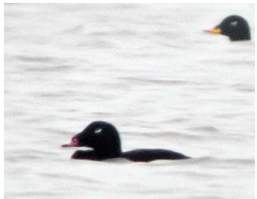
229 Moroccan Shag / Marokkaanse Kuifaalscholver Phalacrocorax aristotelis riggenbachi , Tamri, Morocco, 10 April 2013 (Arnoud B van den Berg) 230 American Wigeon / Amerikaanse Smient Anas americana , male, Njarðvík, Iceland, 5 April 2013 (Richard Bonser) 231 Baikal Teal / Siberische Taling Anas formosa , male, Tevenerheide, Nordrhein-Westfalen, Germany, 4 May 2013 (Ger de Hoog) 232 Senegal Thick-knee / Senegalese Griel Burhinus senegalensis , El Gouna, Egypt, 23 March 2013 (Edwin Winkel) 233 American Scoter / Amerikaanse Zee-eend Melanitta americana , adult male, Blåvand, Syddenmark, Denmark, 16 February 2013 (Vincent Legrand) cf Dutch Birding 35: 129, 2013 234 American White-winged Scoter / Amerikaanse Grote Zee-eend Melanitta deglandi deglandi , adult male, with Velvet Scoter / Grote Zee-eend M fusca , male, Blåvands Huk, Syddenmark, Denmark, 16 February 2013 (Vincent Legrand) cf Dutch Birding 35: 129, 2013