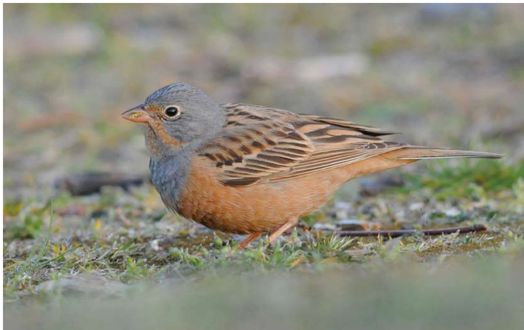
204 Bruinkeelortolaan / Cretschmar's Bunting Emberiza caesia, mannetje, Lauwersoog, Groningen, 5 mei 2013