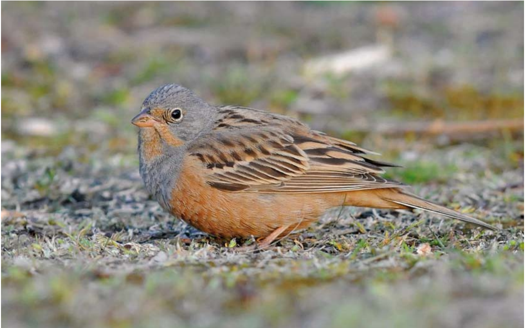
249 Cretzschmar's Bunting / Bruinkeelortolaan Emberiza caesia , male, Lauwersoog, Groningen, Netherlands, 5 May 2013 (Roef Mulder)