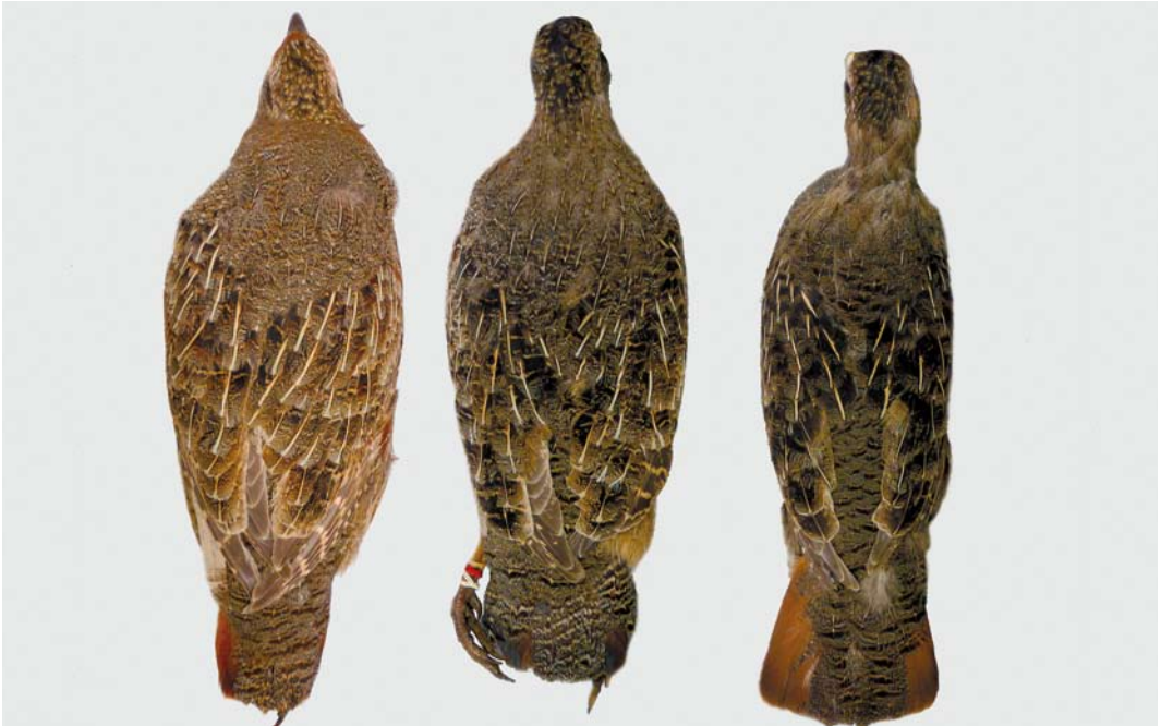
FIGURE 8 Grey Partridges / Patrijzen Perdix perdix, females, Naturalis Biodiversity Centre, Leiden, Netherlands, 28 December 2011 (right and centre) and Zoologisches Forschungsmuseum Alexander Koenig, Bonn, Germany, 12 August 2011 (left). From left to right: collected at Hersel, Bornheim, Nordrhein-Westfalen, Germany, on 20 November 1967; Wijnjewoude, Friesland, Netherlands, on 21 November 1934; and Orvelte, Drenthe, Netherlands, on 12 November 1935. These birds illustrate (from left to right) minimum, mean and maximum darkness of scapulars in females in our sample.