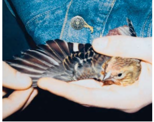
192-193 Pallas's Rosefinch / Pallas' Roodmus Carpodacus roseus , female or first-year male, Tsivil district, republic of Chuvashia, Russia, 9 December 1995

Chuvashia, female or first-year male, trapped by A Ksenofontov (plate 192-193). This record was accepted by the regional Middle Volga ornithological records committee. The man who trapped the bird claimed he saw other Pallas's Rosefinches at the same location some two weeks later (Sotnikov 2008, Isakov et al 2009; Oleg Borodin in litt, Vladimir Yakovlev in litt).