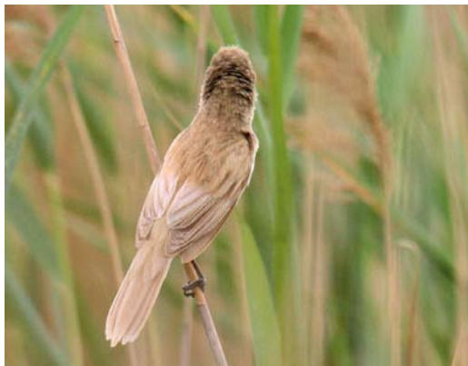
214-217 Aberrantly coloured Clamorous Reed Warbler / Indische Karekiet Acrocephalus stentoreus , Ismailiya, Nile Delta, Egypt, 20 April 2012

tail (75.0 mm) and tarsus length (29.6 mm) were all consistent with the known measurements of males of nominate A. stentoreus (cf Cramp 1992, Kennerley & Pearson 2010). The short primary projection typical for the species was also noticeable. The non-feathered body parts and the eye showed a normal coloration. The basic colour of the plumage was generally paler in comparison with other Clamorous Reed Warblers; for comparison, plate 221-222 show a normally coloured Clamorous Reed Warbler. The primaries and secondaries had a beige basic colour with a pale fringe. The cream-coloured fringes of the tertials were particularly broad and covered almost the complete feather vane. The tail-feathers also had a pale fringe, with the fringes broadening towards the tip so that the distal half of the innermost tail-feather appeared almost completely cream-coloured. The uppertail-coverts also displayed a remarkable paler colour. According to Hein van