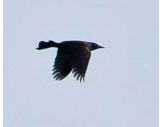
266-267 Common Grackle / Glanstroepiaal Quiscalus quiscula , Kamperhoek, Flevoland, 8 april 2013