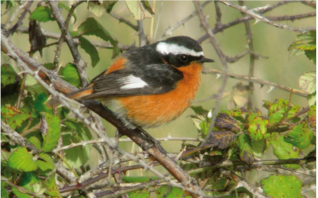
245 Moussier's Redstart / Diadeemroodstaart Phoenicurus moussieri , male, Constantí, Tarragona, Spain, 21 March 2013 (Ricard Gutiérrez)