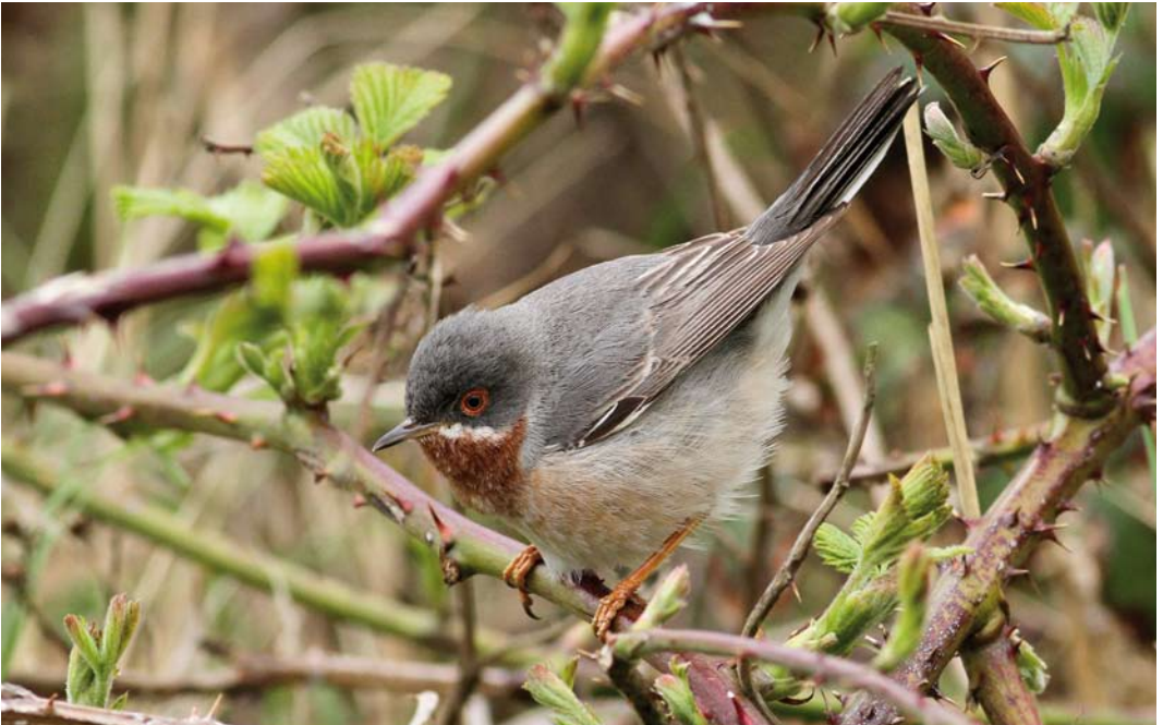
248 Eastern Subalpine Warbler / Balkanbaardgrasmus Sylvia cantillans albistriata , male, Landguard, Suffolk, England, 27 April 2013 (Richard Bonser)