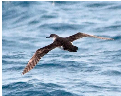
210 Audubon's Shearwater / Audubons Pijlstormvogel Puffinus lherminieri , off Cape Hatteras, North Carolina, USA, 1 June 2011. Note long-tailed impression, similar to Canary Islands bird. Note also bulkier impression of head and bill in comparison with Barolo Shearwater P baroli in plate 213 and dark surrounding of eye. Although secondaries are still growing, it is already possible to see lack of pale panel. 211 Boyd's Shearwater / Kaapverdische Kleine Pijlstormvogel Puffinus boydi , off Cape Verde Islands, 24 March 2007. Note lack of pale panel in greater coverts, black of cap extending to eye and long-tailed impression. Note strong similarity between this individual and Audubon's Shearwater P lherminieri in plate 210.

A third option would be Tropical Shearwater P bailloni . This species is hard to separate from the lherminieri -complex but only juveniles show as dark (almost pure black) a back as the mystery shearwater. Although it is impossible to age the bird without much more detailed images, as fledgling Tropical Shearwaters do not leave their colonies in the Indo-Pacific before December, it is highly unlikely one would find its way to the Canary Islands at this time of year. Moreover, as there are only two sightings from the well-watched eastern South African coast and no sightings at all from the even more intensively watched South African western coast (Sinclair 2009) it is probably safe to assume that it is an unlikely vagrant further north in the Atlantic.