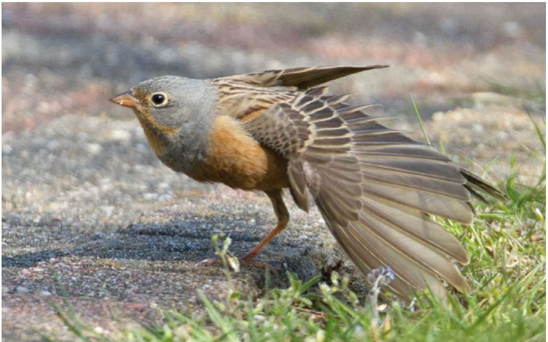
207 Bruinkeelortolaan / Cretschmar's Bunting Emberiza caesia , mannetje, Lauwersoog, Groningen, 5 mei 2013 (Jaap Denee)

Bruinkeelortolaan broedt in het zuiden van Griekenland, op veel eilanden in de Egeïsche Zee en op Cyprus, langs de west- en zuidkust van Turkije en via Syrië en Libanon tot in Noord-Israël en Jordanië. Opmerkelijk daarbij is dat de vogels voorkomen binnen een strook van c 100 km van de Middellandse Zeekust. De soort overwintert relatief dicht bij de broedgebieden, voornamelijk in Noord-Soedan en Zuid-Soedan en Eritrea maar in