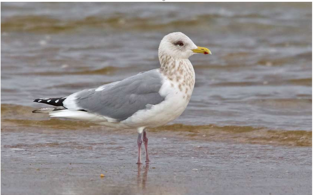
224 Thayer's Gull / Thayers Meeuw Larus thayeri , adult, San Ciprian, Galicia, Spain, 23 March 2013