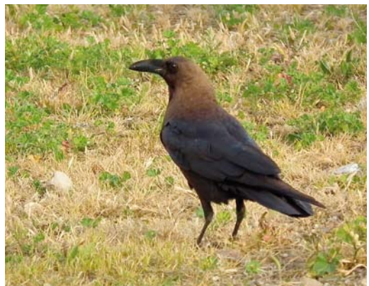
235 Little Swift / Huisgierzwaluw Apus affinis , Ghadira, Malta, 16 March 2013 ( Nicholas Galea ) 236 Pallas's Leaf Warbler / Pallas' Boszanger Phylloscopus proregulus , Zurrieq, Malta, 21 April 2013 ( Patrick Sammut ) 237 Common Bulbul / Grauwe Buulbuul Pycnonotus barbatus , Tarifa, Cádiz, Spain, 1 May 2013 ( Javier Elorriaga ) 238 Red-tailed Shrike / Turkestaanse Klauwier Lanius phoenicuroides , Comino, Malta, 20 April 2013 ( Luca Pisani ) 239 Citrine Wagtail / Citroenkwikstaart Motacilla citreola , adult male, Bagno di Venere, Pantelleria, Italy, 3 April 2013 ( Andrea Corso ) 240 Brown-necked Raven / Bruinnekraaf Corvus ruficollis , Vila-Seca, Tarragona, Catalunya, Spain, 11 April 2013 ( Edu Gracia Tinedo )