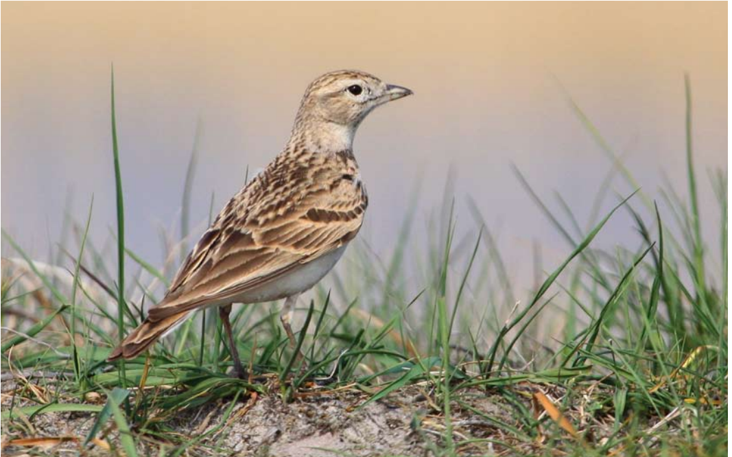
243 Greater Short-toed Lark / Kortteenleeuwerik Calandrella brachydactyla , Karsiborska Kepa, Swinoujście, Poland, 7 May 2013 (Zbigniew Kajzer)