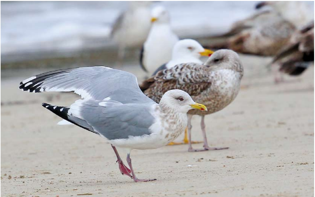
223 Thayer's Gull / Thayers Meeuw Larus thayeri , adult, San Ciprian, Galicia, Spain, 23 March 2013 (Kris De Rouck)