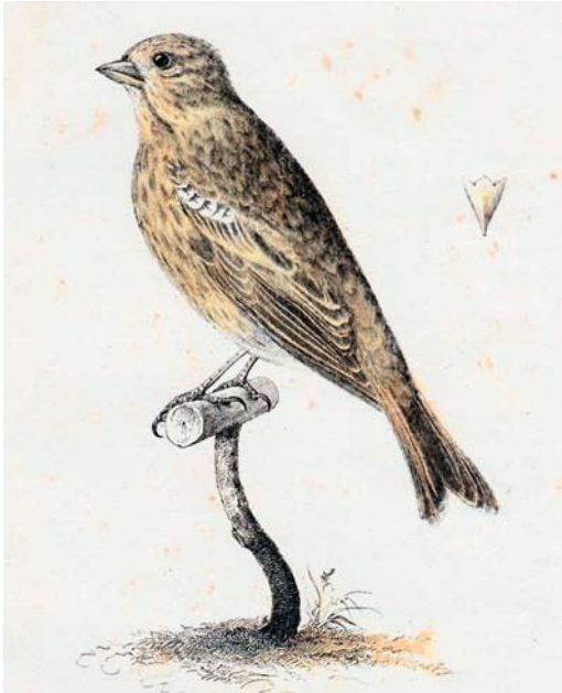
FIGURE 3 Pallas's Rosefinch/Pallas' Roodmus Carpodacus roseus , male, collected at Budapest, Istenehgy, Hungary, on 1 December 1850, published in Petényi [c 1850]

tenkoi as a synonym of 'sachalinensis' (Portenko, 1960), although Browning (1988) provided convincing evidence that the type of 'sachalinensis' was a migrant of the nominate subspecies, making 'sachalinensis' a junior synonym of roseus .