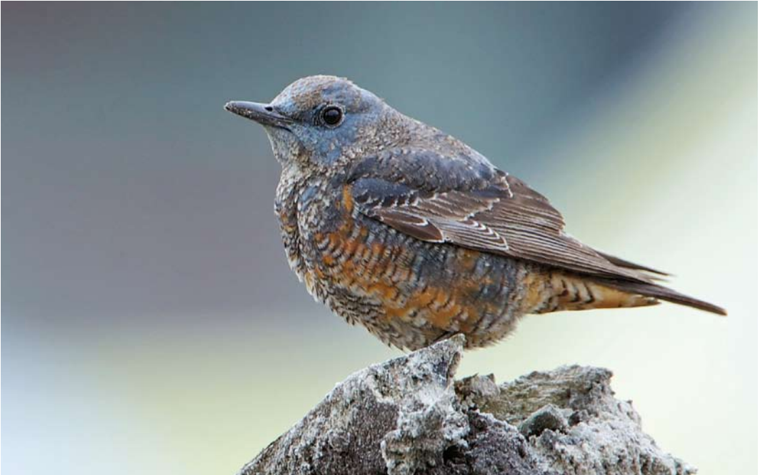
270 Rotslijster / rock thrush Monticola , Den Helder, Noord-Holland, 12 april 2013

sein gegeven voor 'circus rotslijster'. Die avond werd hij nog door c 30 vogelaars gezien. 's Avonds ging hij slapen op de kerk en was daar in de verlichting van het gebouw zichtbaar, zodat twitchers hem ook in het donker nog konden aanschouwen. De volgende vier dagen trok hij in totaal enkele 100en bezoekers. Meestal verbleef hij (onzichtbaar) op de daken om regelmatig naar de grond te komen en daar te foerageren op zandige stukjes. Ook verbleef hij regelmatig op de steenhopen bij de dijk. In ieder geval van vrijdag op zaterdag sliep hij wederom op de kerk.