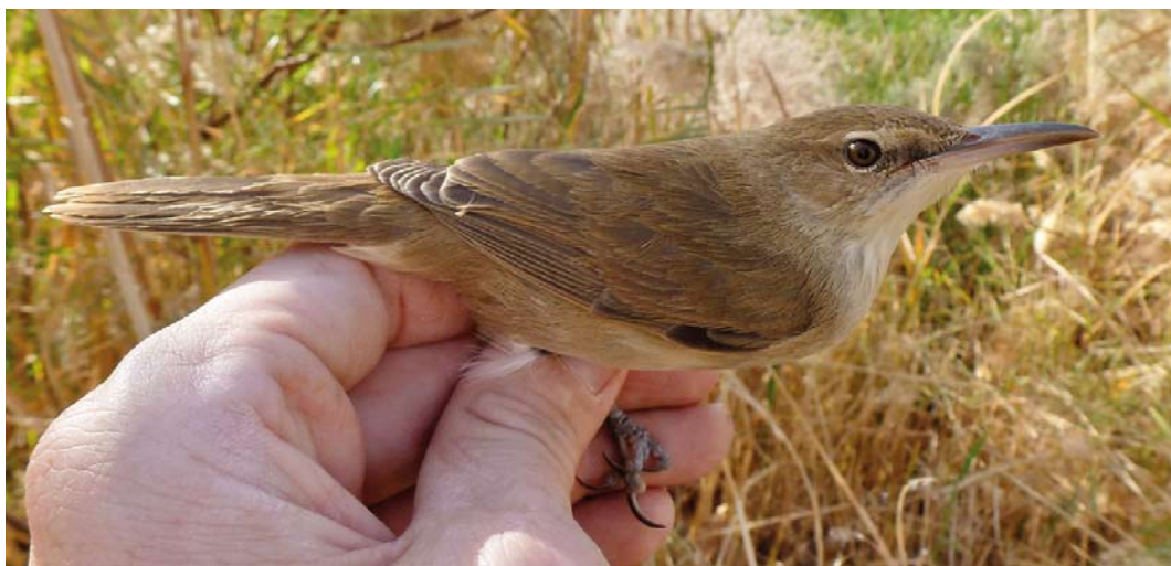
221-222 Clamorous Reed Warbler / Indische Karekiet Acrocephalus stentoreus , Dakhla Oasis, Libyan Desert, Egypt, 10 January 2012. Normally coloured individual.

Heunks 1999, Bensch et al 2000) and above all for various island-based representatives of Acrocephalus in Polynesia, including leucism in several species (Holyoak 1978, Graves 1992, Kennerley & Pearson 2010, Leisler & Schulze-Hagen 2011). In contrast, in the Middle East subspecies A. s. levantinus of Clamorous Reed, dark-coloured birds have been noted regularly, and these are indicated as dark morph (being unique to this subspecies; cf Kennerley & Pearson 2010; http://blumen.smugmug.com/Birds/Clamorous-reed-warbler-Dark ). For example, in Israel, the proportion of ringed dark morphs is 30-40% (Yosef Kiat pers comm). The only other reed warbler species with a distinct dark morph is Tahiti Reed Warbler A. caffer in