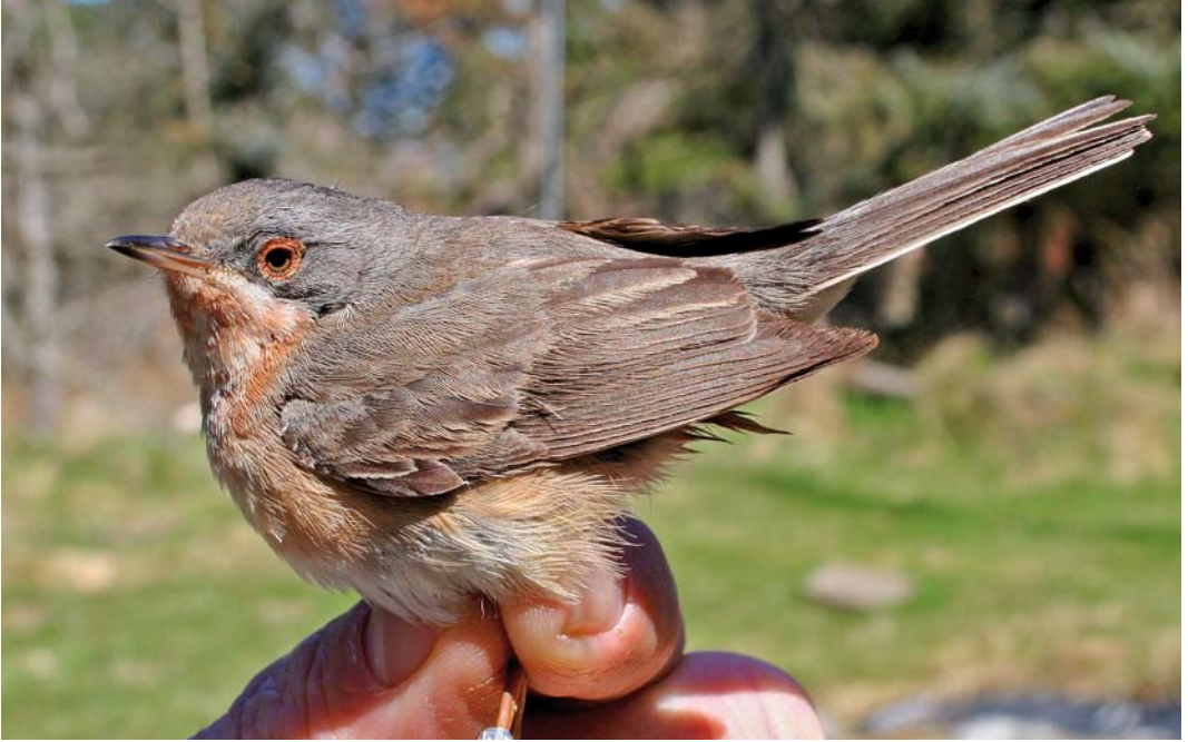
247 Subalpine Warbler / Baardgrasmus Sylvia cantillans , male, Blåvands Huk, Syddenmark, Denmark, 2 May 2013 (Henrik Knudsen)