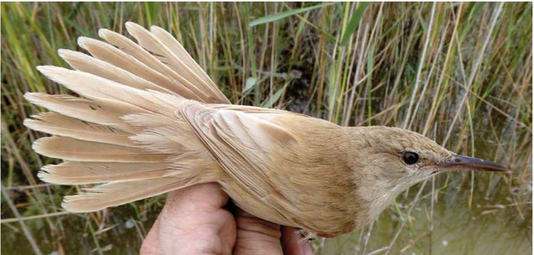
218-220 Aberrantly coloured Clamorous Reed Warbler / Indische Karekiet Acrocephalus stentoreus , Ismailiya, Nile Delta, Egypt, 20 April 2012 (Jens Hering)

Grouw (pers comm), the pale fringes were enhanced by bleaching by the (sun) light since these feather parts are always exposed. The actual colour due to the mutation could only be observed on the feathers' inner webs.