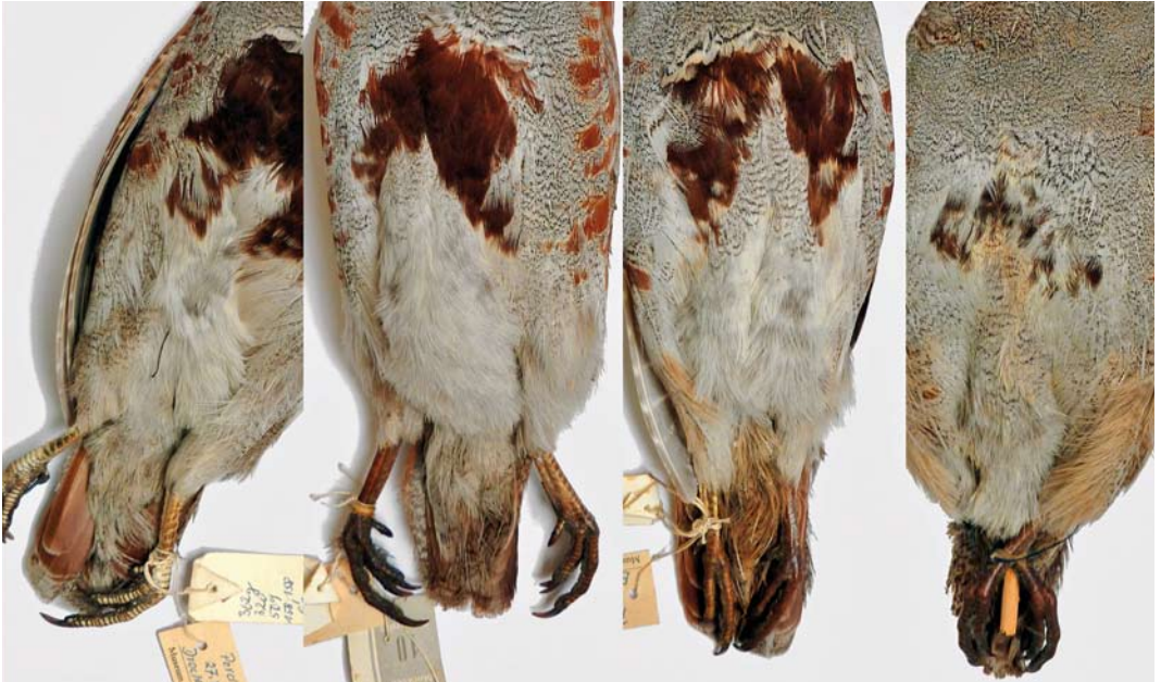
FIGURE 2 Grey Partridges / Patrijsen Perdix perdix, Zoologisches Forschungsmuseum Alexander Koenig, Bonn, Germany, 12 August 2011. Four scores for undertail-coverts coloration (from left to right): golden-brown coloration 'absent', 'only faintly present', 'clearly present' and 'not possible to score'.

186 Grey Partridge / Patrijs Perdix perdix perdix, male (collected at Szabolcs, Hungary, on 22 February 1934), Naturalis Biodiversity Centre, Leiden, Netherlands, 28 December 2011. Grey circle in middle of Grey Card was used to calibrate colours (see text). Despite being collected far from sphagnetorum range, this individual shows large belly patch.