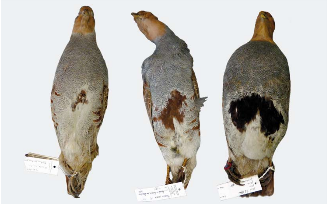
FIGURE 6 Grey Partridges / Patrijzen Perdix perdix , males, Naturalis Biodiversity Centre, Leiden, Netherlands, 28 December 2011 (Justin J F J Jansen). From left to right: collected at Raalte, Overijssel, Netherlands, on 14 December 1925; Marche-en-Famenne, Luxembourg, Belgium, on November 1947; and Westerwolde, Groningen, Netherlands, on 31 December 1933. These birds illustrate (from left to right) minimum, mean and maximum belly patch size in males in our sample.

dix and 54% to sphagnetorum ; however, when following 'traditional', 69% of the birds are perdix and 31% sphagnetorum . In either case, the number of sphagnetorum is sufficiently large to allow a good comparison. 54% of the birds used in the analysis are male and 46% female.