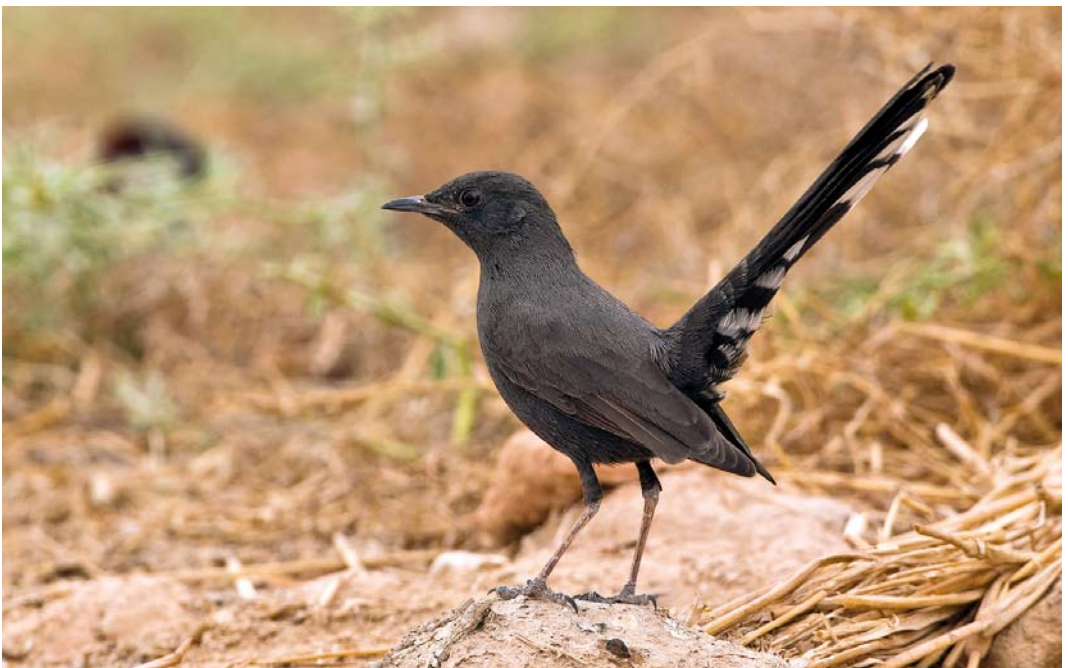
242 Black Scrub Robin / Zwarte Waaijerstaart Cercotrichas podobe , Yotvata, Israel, 8 April 2013 (David Monticelli)