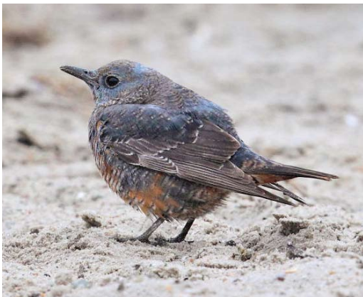
268 Rotstijster / rock thrush Monticola , Den Helder, Noord-Holland, 12 april 2013

Rotstijster in Den Helder zorgt voor hoofdbrekens Soms heb je van die dagen die wat langer in je geheugen blijven hangen en die eigenlijk het predicaat 'te bizar voor woorden' verdienen. Donderdag 11 april 2013 was zo'n dag. De dag begon net als de voorgaande dagen om 05:00 op een hotelkamer in Den Helder, Noord-Holland, waar ik (André Boven) voor mijn werk als grondwerker verbleef – moeizaam wakker worden, tanden poetsen en een ontbijtje met veel koffie. Na aankomst op de bouwplaats werden de werkzaamheden voor die dag nog even doorgenomen en na nog meer koffie werd om 07:00 begonnen met de klus. Het begon net licht te worden. Ik had wat materiaal gehaald van de opslagplaats en toen ik terug liep naar de werkplek ging ineens een vogel op c 10 m voor mijn neus op een hekje zitten – het eerste wat door mijn nog duffe hoofd schoot was: