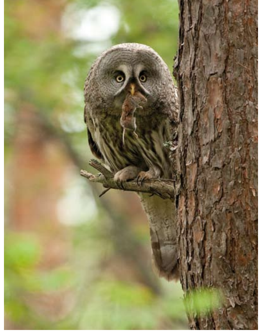
177-179 Great Grey Owl / Laplanduil Strix nebulosa , Białowieża forest, Bobrovichy area, Belarus, 31 May 2010 (Ronald Messemaker) 180 Great Grey Owl / Laplanduil Strix nebulosa , nestling, Białowieża forest, Bobrovichy area, Belarus, 31 May 2010 (Ronald Messemaker)