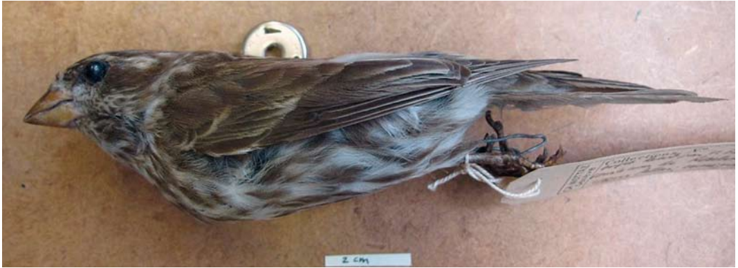
202 Purple Finch / Amerikaanse Roodmus Carpodacus purpureus , female or young male (allegedly obtained at Fort l'Ecluse, Ain, France, November 1889), Muséum d'histoire naturelle de Genève (Laurent Vallotton)