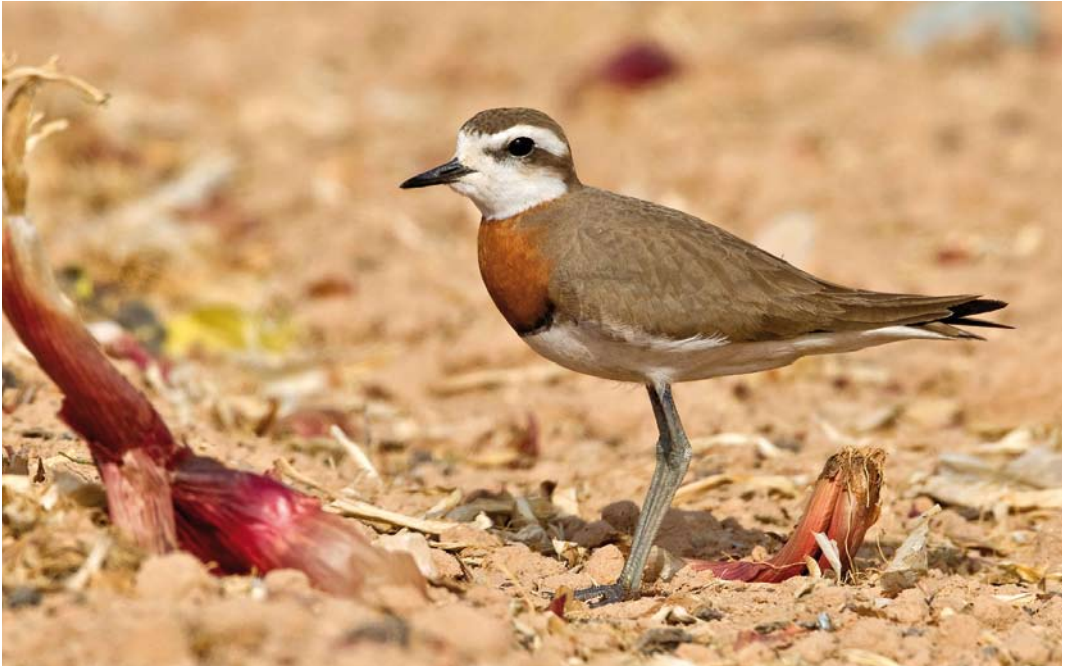
241 Caspian Plover / Kaspische Plevier Charadrius asiaticus , male, Yotvata, Israel, 13 April 2013 (Vincent Legrand)