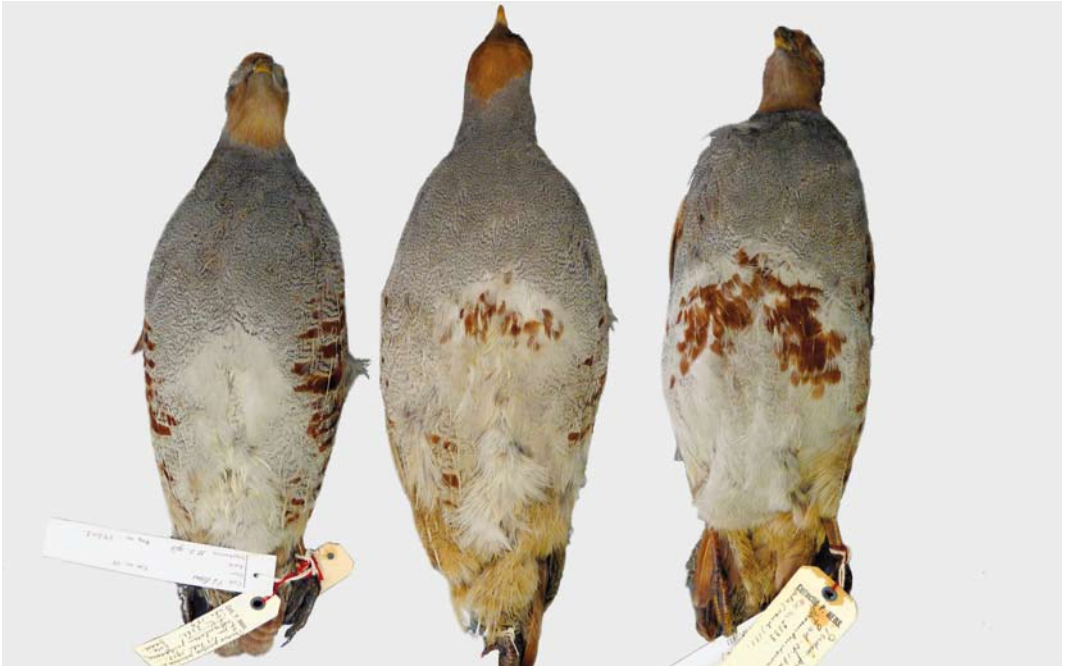
FIGURE 7 Grey Partridges / Patrijzen Perdix perdix , females, Naturalis Biodiversity Centre, Leiden, Netherlands, 28 December 2011 (Justin J F J Jansen). From left to right: collected at Ede, Gelderland, Netherlands, on 15 January 1934; Echt-Susteren, Limburg, Netherlands, on 10 November 1974; and Houthem, Limburg, on 23 December 1933. These birds illustrate (from left to right) minimum, mean and maximum belly patch size in females in our sample.