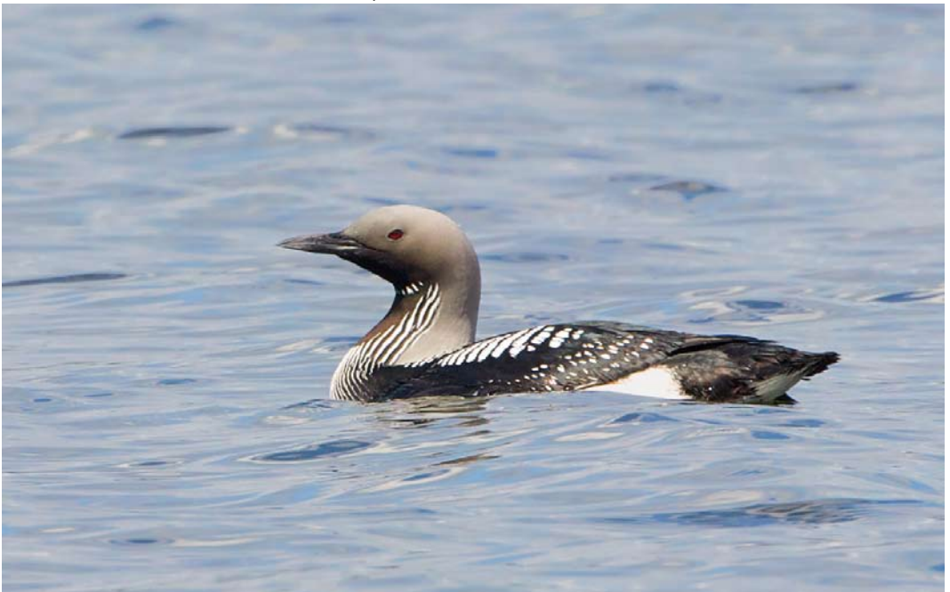
255 Parelduiker / Black-throated Loon Gavia arctica , adult zomerkleed, Het Twiske, Oostzaan, Noord-Holland, 28 april 2013