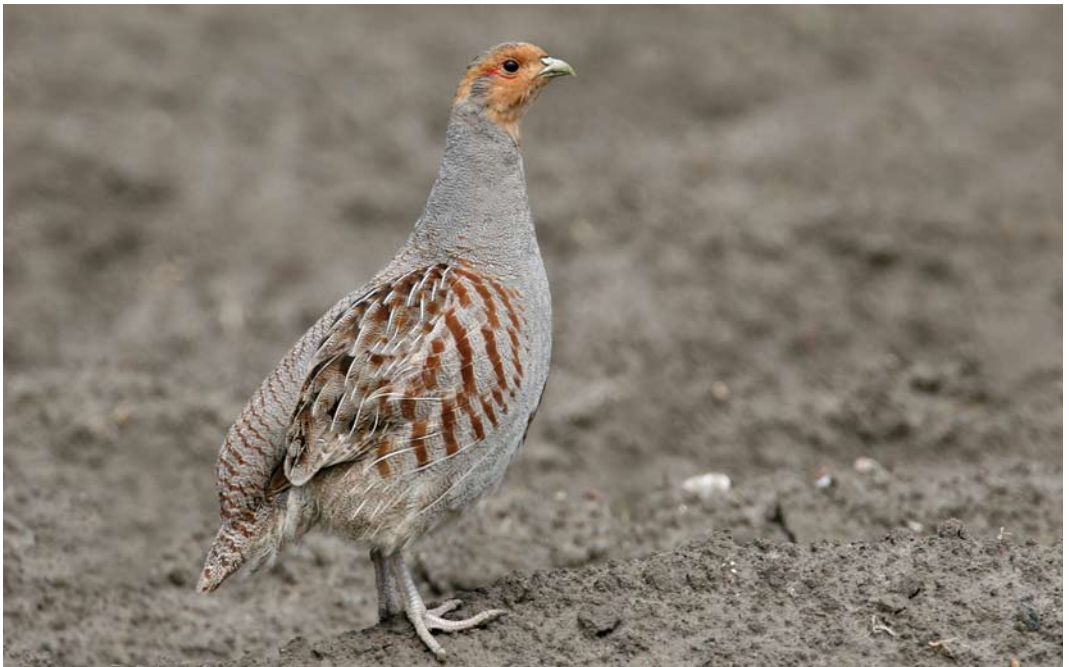
188 Grey Partridge / Patrijs Perdix perdix , male, Eemsmond, Groningen, Netherlands, 13 May 2007 (Mark Schuurman). Photographed within range of nominate P p perdix .