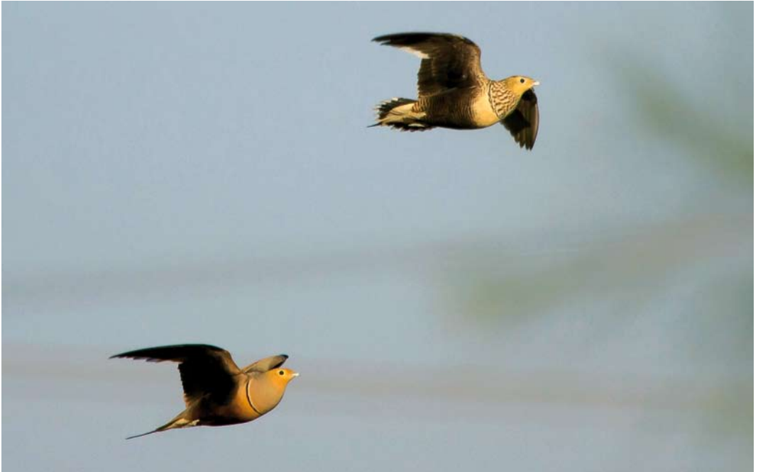
227 Chestnut-bellied Sandgrouse / Roodbuikzandhoenders Pterocles exustus , Sandafa, Minya, Egypte, 6 April 2013