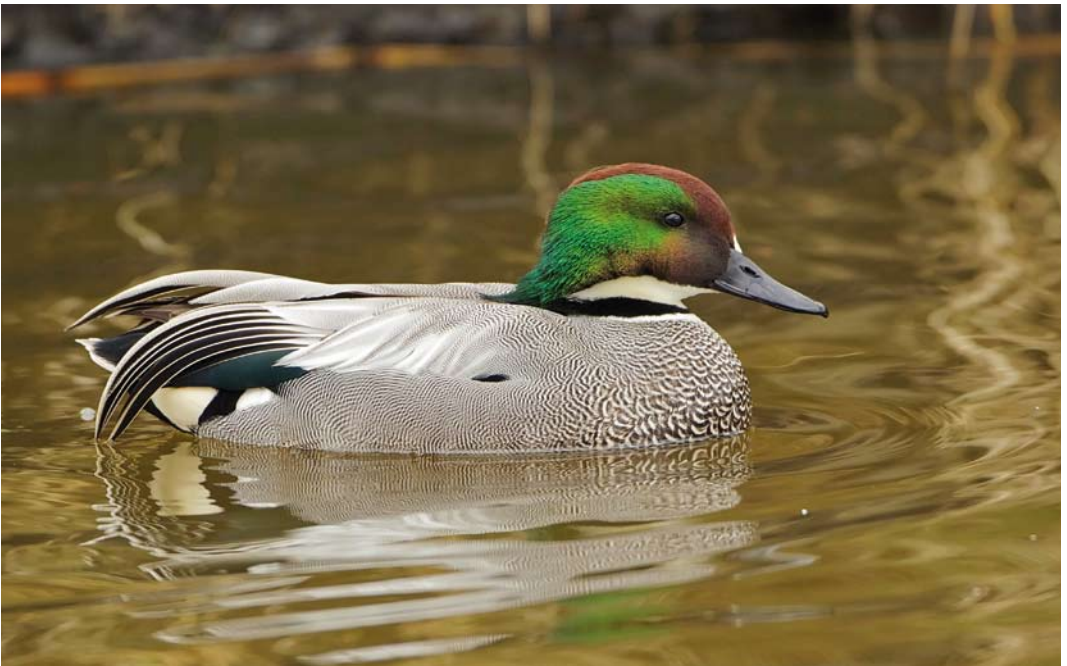
226 Falcated Duck / Bronskopeend Anas falcata , male, Spijkenisse, Zuid-Holland, Netherlands, 30 March 2013 (Martin van der Schalk)