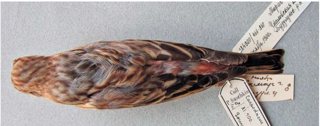
190-191 Pallas's Rosefinch / Pallas' Roodmus Carpodacus roseus , first-year male (collected in Buzuluk district, Orenburg oblast, Russia, in November 1900), Zoological Museum, St Petersburg, Russia, 27 January 2012

than escaped individuals (figure 2; numbering of records in map corresponds to numbering of records below).