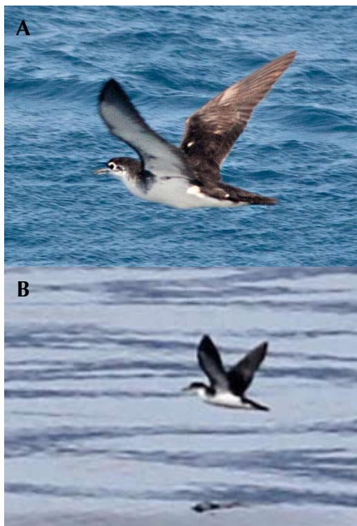
FIGURE 1 A Boyd's Shearwater / Kaapverdise Kleine Pijlstormvogel Puffinus boydi , off Cape Verde Islands, March 2009 (Killian Mullarney); B unidentified shearwater / ongedetermineerde pijlstormvogel P boydi/lherminieri , between Tenerife and La Gomera, Canary Islands, 10 December 2012 (Marcel Gil Velasco). Note similar long-tailed impression. Compare also all-dark primary bases in both individuals.