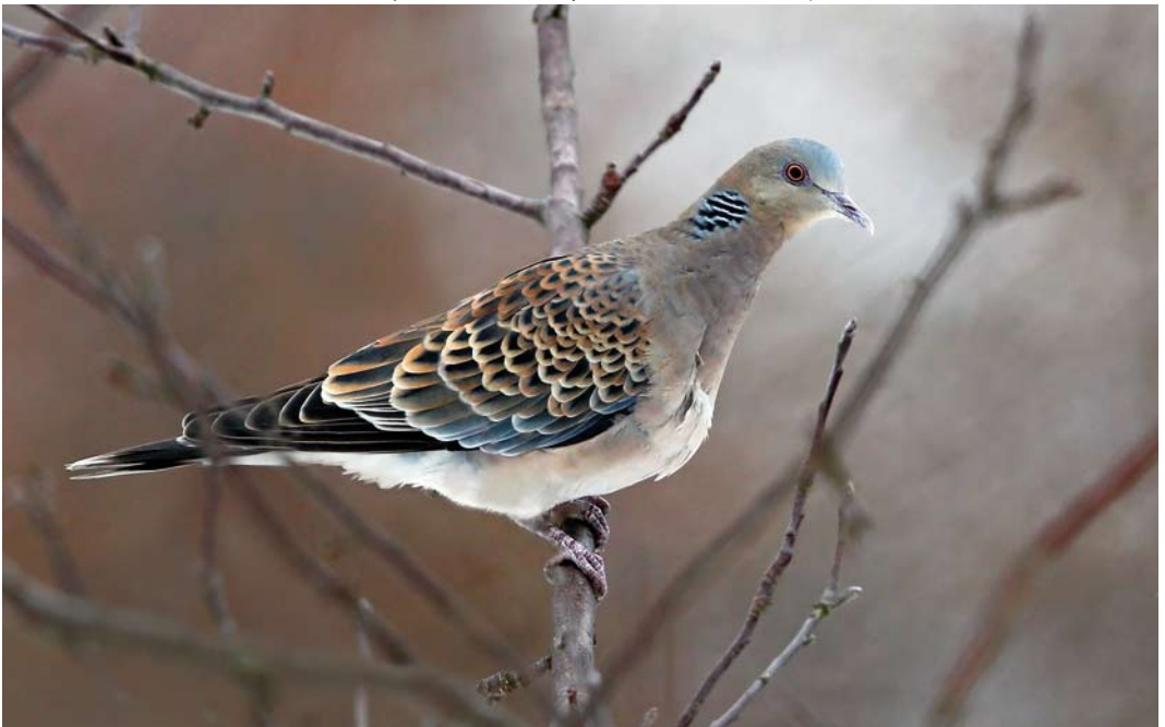
228 Rufous Turtle Dove / Meenatortel Streptopelia orientalis meena , Suchedniow, Skarzysko-Kamienna, Swietokrzyskie, Poland, 6 April 2013