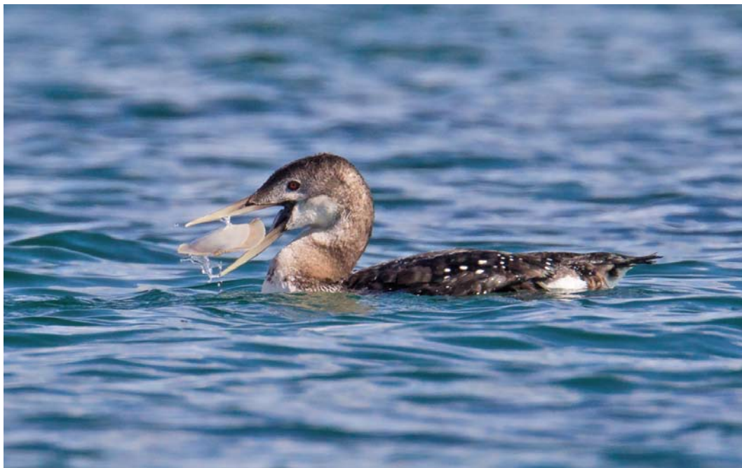
225 Yellow-billed Loon / Geelsnavelduiker Gavia adamsii , adult, Herston, South Ronaldsay, Orkney, Scotland, 7 April 2013 (Hugh Harrop)