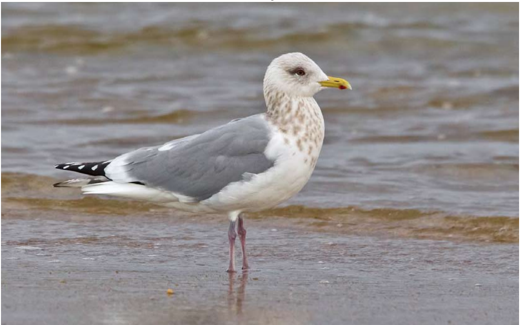
224 Thayer's Gull / Thayers Meeuw Larus thayeri , adult, San Ciprian, Galicia, Spain, 23 March 2013 (Vincent Legrand)