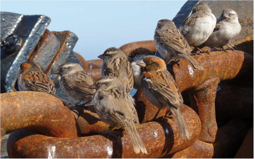
251 Iago Sparrows / Kaapverdise Mussen Passer iagoensis , on board of MV Plancius, Atlantic Ocean between Cape Verde Islands and Desertas, Hansweert, Zeeland, Netherlands, 8 May 2013 252 Iago Sparrows / Kaapverdise Mussen Passer iagoensis , male (front) and female, on board of MV Plancius, Hansweert, Zeeland, Netherlands, 19 May 2013. Ship-assisted arrivals from Raso, Cape Verde Islands.