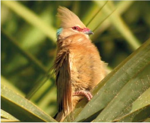
51 Blue-naped Mousebird / Blauwnekmuisvogel Urocolius macrourus , Akhmakou, Mauritania, 2 January 2005 (Kris De Rouck)