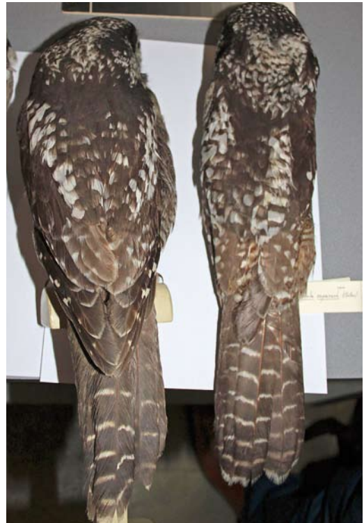
11 American Hawk Owls / Amerikaanse Sperweruilen Surnia ulula caparoch (left: caught off Las Palmas, Gran Canaria, Canary Islands, in October 1924; right: specimen from Canada), Naturalis Biodiversity Center, Leiden, Netherlands, August 2012