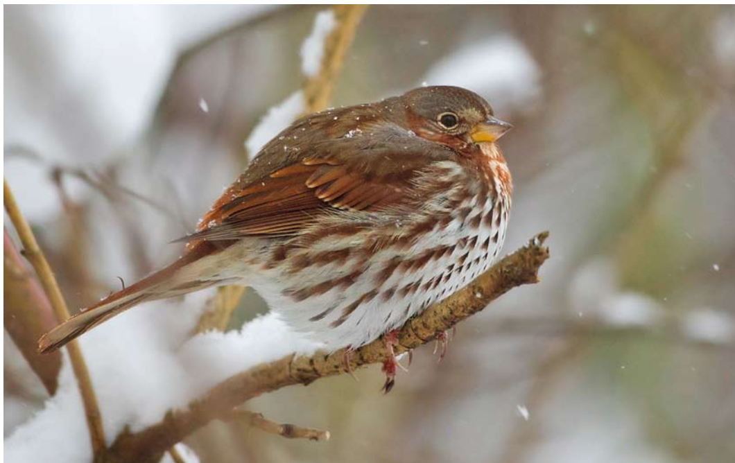
84 Fox Sparrow / Roodstaartgors Zonotrichia iliaca , Haapsula, Estonia, 14 December 2012