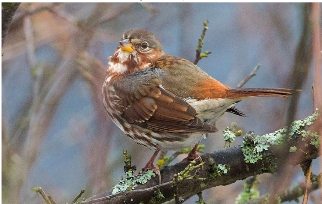
85 Fox Sparrow / Roodstaartgors Zonotrichia iliaca , Korpoo, Utö, Finland, 20 December 2012