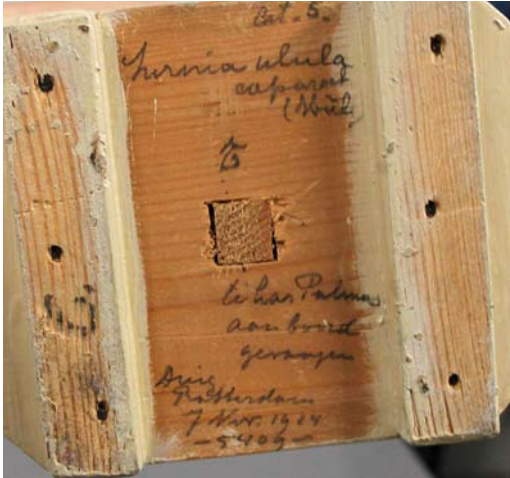
4 Underside of stand of American Hawk Owl / Amerikaanse Sperweruil Surnia ulula caparoch caught off Las Palmas, Gran Canaria, Canary Islands, in October 1924: 'caught at Las Palmas aboard ship; Rotterdam Zoo, 7 November 1924'. Naturalis Biodiversity Center, Leiden, Netherlands, August 2012