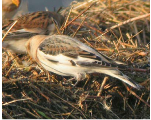
15 Snow Bunting / Sneeuwgors Plectrophenax nivalis , first-winter male P n insulae , Lauwersoog, Groningen, Netherlands, 16 February 2008 (Rik Winters) 16 Snow Bunting / Sneeuwgors Plectrophenax nivalis , male, most likely P n nivalis , Eemshaven, Groningen, Netherlands, 6 January 2008 (Rik Winters). Note extensively white rump and contrast between pale mantle fringes and rufous scapular fringes. Very pale plumage and large size suggestive of vasowae .

(hereafter nivalis ) from Greenland east to western Russia, including Scandinavia, and P n insulae (hereafter insulae ) from Iceland. The two subspecies form mixed flocks on the wintering grounds where their ranges overlap. Little is known about the ratios in which the subspecies occur in the Netherlands. Insulae is presumed to be the most numerous subspecies, being about twice as numerous as nivalis (Jukema & Fokkema 1992), but this ratio may vary between winters. However, using the identification criteria described hereafter, birds I checked in the Wadden Sea area in autumn (September-October) all proved to be nivalis .