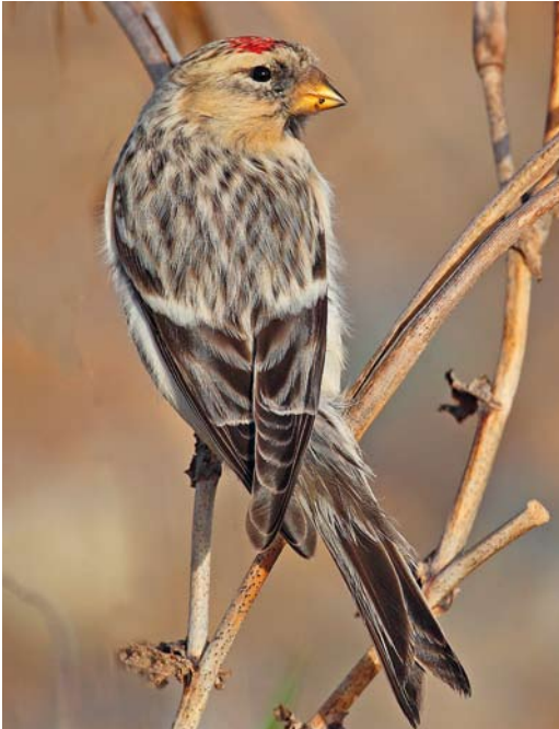
82 Hornemann's Redpoll / Groenlandse Witstuitbarmsijs Acanthis hornemanni hornemanni , first-year, Aldeburgh, Suffolk, England, 15 December 2012