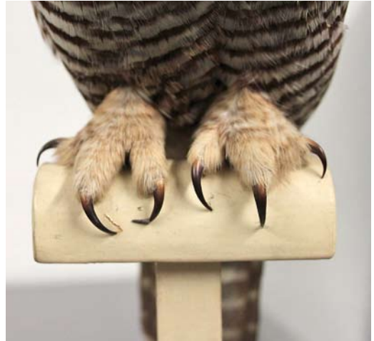
5 American Hawk Owl / Amerikaanse Sperweruil Surnia ulula caparoch (caught off Las Palmas, Gran Canaria, Canary Islands, in October 1924), Naturalis Biodiversity Center, Leiden, Netherlands, August 2012 (Cosme D Romay). Detail of claws and feathered feet.