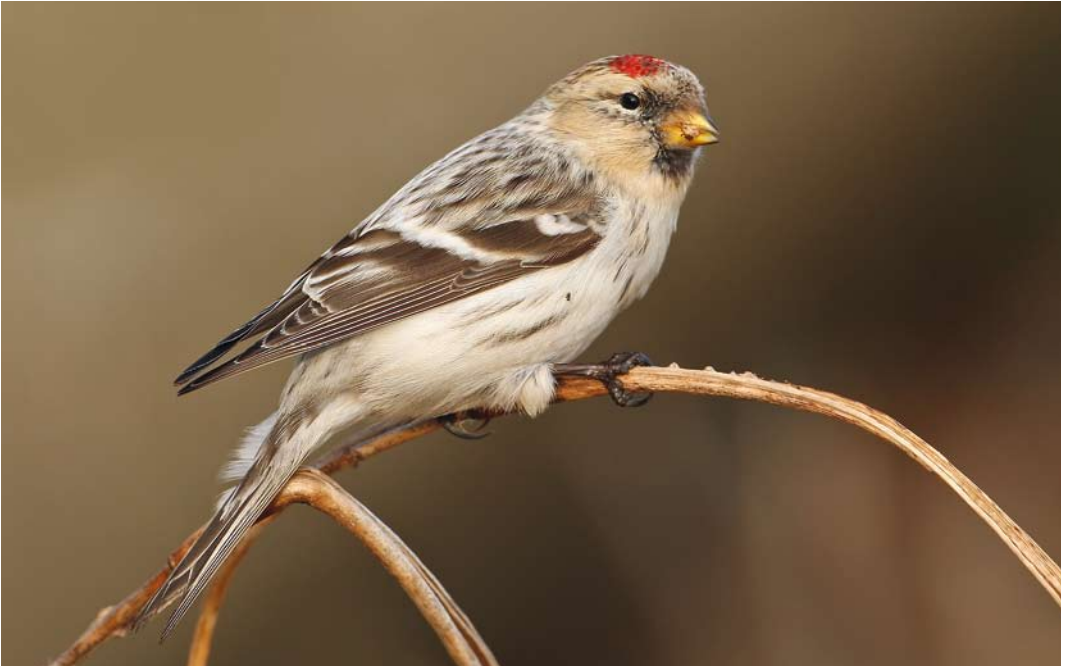
76 Hornemann's Redpoll / Groenlandse Witstuitbarmisj Acanthis hornemanni hornemanni, first-year, Aldeburgh, Suffolk, England, 16 December 2012