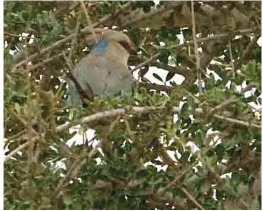
52 Blue-naped Mousebird / Blauwnekmuisvogel Urocolius macrourus , near Choum, Mauritania, 13 December 2007

Dunn's Lark in the area, where the species is in fact widespread (Crochet 2007), occurring north to Morocco in southern Western Sahara (Awserd area, see Copete et al 2008) and even Tafilalt (Albegger et al 2010; http://maroc.observado.org/waarneming/view/67994098 ).