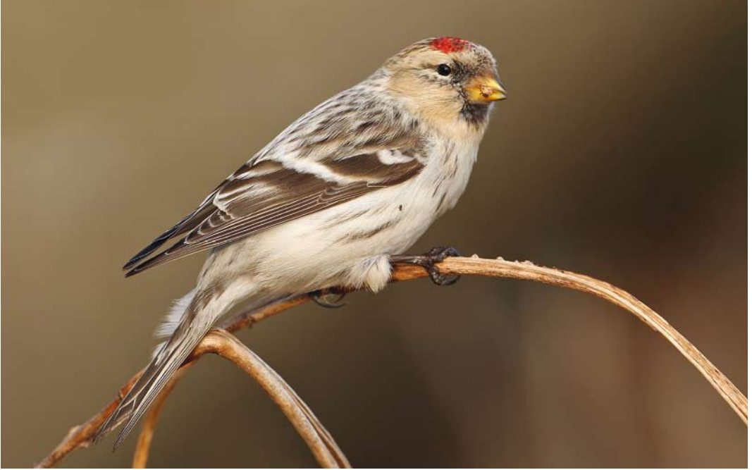
76 Hornemann's Redpoll / Groenlandse Witstuitbarmisjijs Acanthis hornemanni hornemanni, first-year, Aldeburgh, Suffolk, England, 16 December 2012