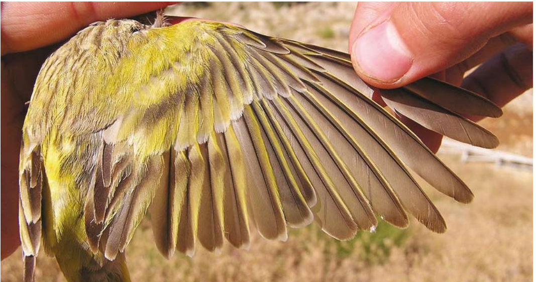
107 Syrian Serin / Syrische Kanarie Serinus syriacus , adult (third calendar-year or older) male, mount Hermon, Israel, July 2007. Most feathers moulted c 1 year before, at same period. As a result, these feathers have same basic colour, abrasion and pattern (compare with plate 106). Note that all fresh feathers, including fresh/growing inner primaries, are part of this bird's post-breeding moult that had started just few weeks before this wing was photographed, and are not part of the discussed moult pattern.