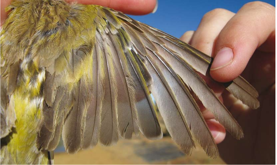
106 Syrian Serin / Syrische Kanarie Serinus syriacus , second calendar-year female, mount Hermon, Israel, 19 July 2008. All retained feathers, especially primaries, extensively worn and browner than adult-type feathers (compare with plate 107). Note that all fresh feathers, including fresh/growing inner primaries and primary coverts, are part of this bird's first post-breeding moult that had started just few weeks before this wing was photographed in July, and are not part of the discussed moult pattern.