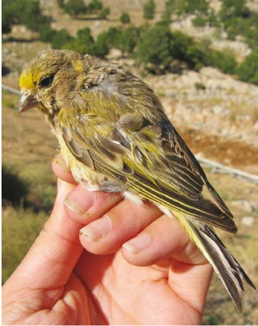
109 Syrian Serin / Syrische Kanarie Serinus syriacus , second calendar-year male, mount Hermon, Israel, 18 July 2008 (Yael Lehnardt). Despite colourful appearance, this bird can be aged by retained juvenile alula feathers and by worn primaries.