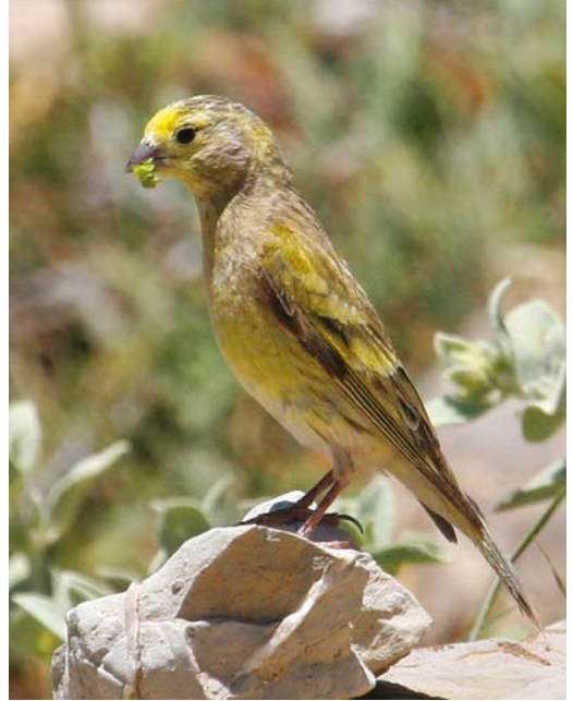
110 Syrian Serin / Syrische Kanarie Serinus syriacus , second-year female, mount Hermon, Israel, 29 May 2008 (Lior Kislev). Note brownish and worn alula feathers and primary coverts, lacking yellowish edges and grey tip.

birds, having both adult-type feathers and some old retained juvenile feathers; and 3 adults (third calendar-year or older) of which all feathers are similar in age and pattern.