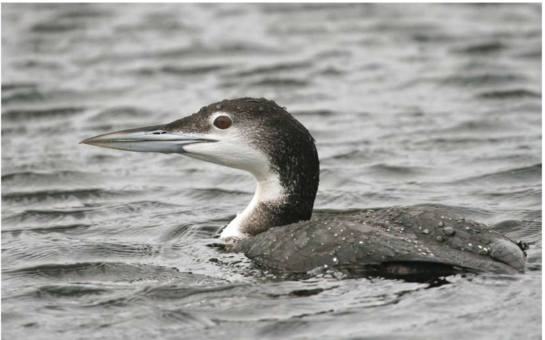
177 Ijsduiker / Great Northern Loon Gavia immer , adult, Hoofddorp, Noord-Holland, 9 januari 2012 (Lars Buckx)