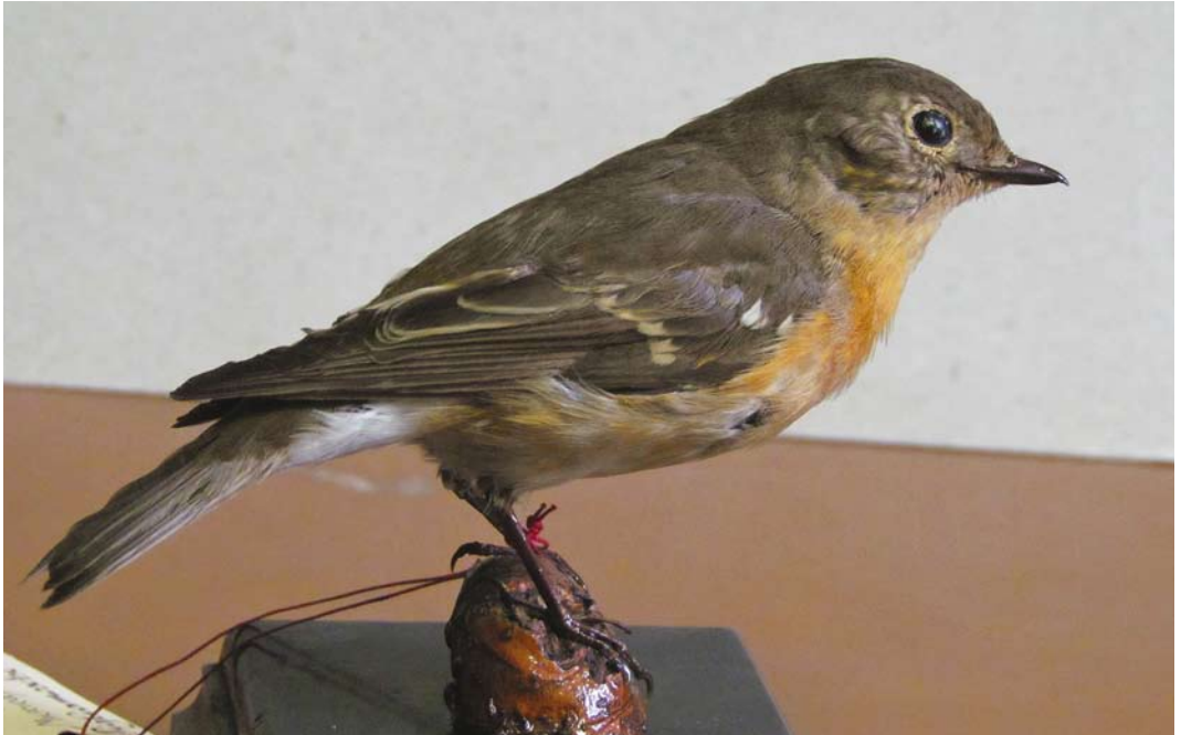
147 Mugimaki Flycatcher / Mugimakivliegenvanger Ficedula mugimaki , first-winter female (collected at San Vendemiano, Treviso, Italy, on 29 October 1957), Museum Brandolini Giol, Oderzo, Treviso, January 2012 (Giancarlo Fracasso)

presented here and represent the first colour photographs of this individual to be published. The all-dark tail clearly indicates this is a female (lacking the white patches on the outer tail shown by males), as do the pale yellowish underparts (deeper orange in male). The pale tips to the median and greater coverts indicate that it is a first-year bird. The good condition of the specimen (in particular wing- and tail-feathers and bare parts) visible in plate 146-147 was noted by Giol (1959) as an indication of a presumed wild origin.