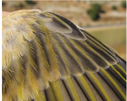
103 Syrian Serin / Syrische Kanarie Serinus syriacus , juvenile, mount Hermon, Israel, 18 July 2008 ( Gidon Perlman ). Note brownish-grey basic colour of alula and greater coverts, not blackish; first (smallest) alula feather fringed rufous; little yellow on second alula feather. In addition, greater coverts have broad rufous edges.

Most of the adults were moulting their feathers when trapped but it was always easy to discern, based on wear and/or feather colour, which of the feathers had been replaced in the previous summer. Before the onset of their first complete post-breeding moult, first-summer (second calendar-year) birds (as defined by ring recoveries) were examined carefully to identify old retained first-generation feathers. These old feathers can in fact