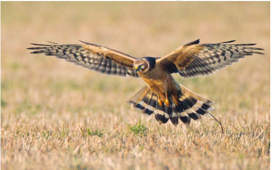
158 Pallid Harrier / Steppekiekendief Circus macrourus , second calendar-year male, Finsterhennen, Bern, Switzerland, 18 January 2012