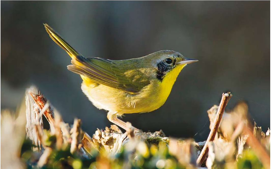
168 Common Yellowthroat / Gewone Maskerzanger Geothlypis trichas, second calendar-year male, Rhiwderyn, Gwent, Wales, 25 February 2012