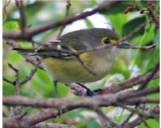
44 White-eyed Vireo / Witoogvireo Vireo griseus , first-year, Ribeira da Ponte, Corvo, Azores, 18 October 2009

before flying away and vanishing into the dense laurel wood. The observation had only lasted for 10-20 sec and PAC knew he had little chance to see the bird again soon.