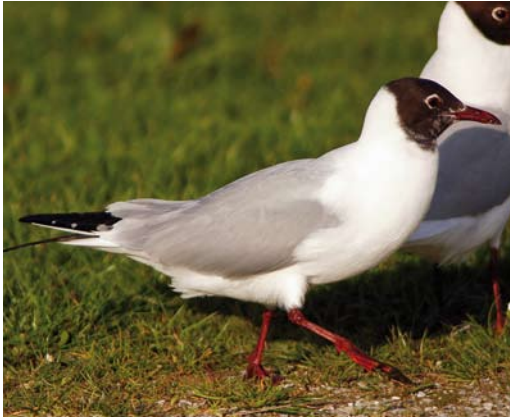
30 Black-headed Gull / Kokmeeuw Chroicocephalus ridibundus , Benthuizenplas, Zoetermeer, Zuid-Holland, Netherlands, 8 May 2009. Same bird as in plate 28 and 31. Note incomplete summer plumage.