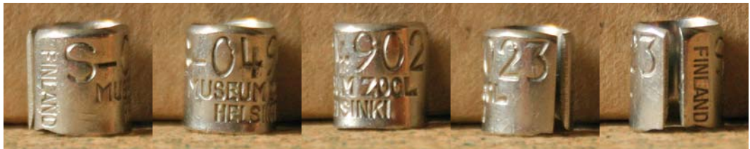
FIGURE 6 Stainless steel ring Helsinki S-049023 of Black-headed Gull Chroicocephalus ridibundus , 30 years and 8 months after ringing on tarsus. Found dead near Monster, Zuid-Holland, Netherlands (record 4 in table 1), collection J van Kruijssen.

as well, with an annual survival of adults of 90% (Prévoit-Julliard et al 1998). During a long-term study in London, England, Gibson (2011) saw 30 individuals of over 20 years old, and 28 breeding birds out of 109 ringed birds (26%) on Griend reached an age of at least 15 years. Most had been ringed as adult, so their real age might even be (much) higher. We have not investigated sex-biased wear and loss of rings but we do not rule out that this also occurs (see Coulson (1976) for