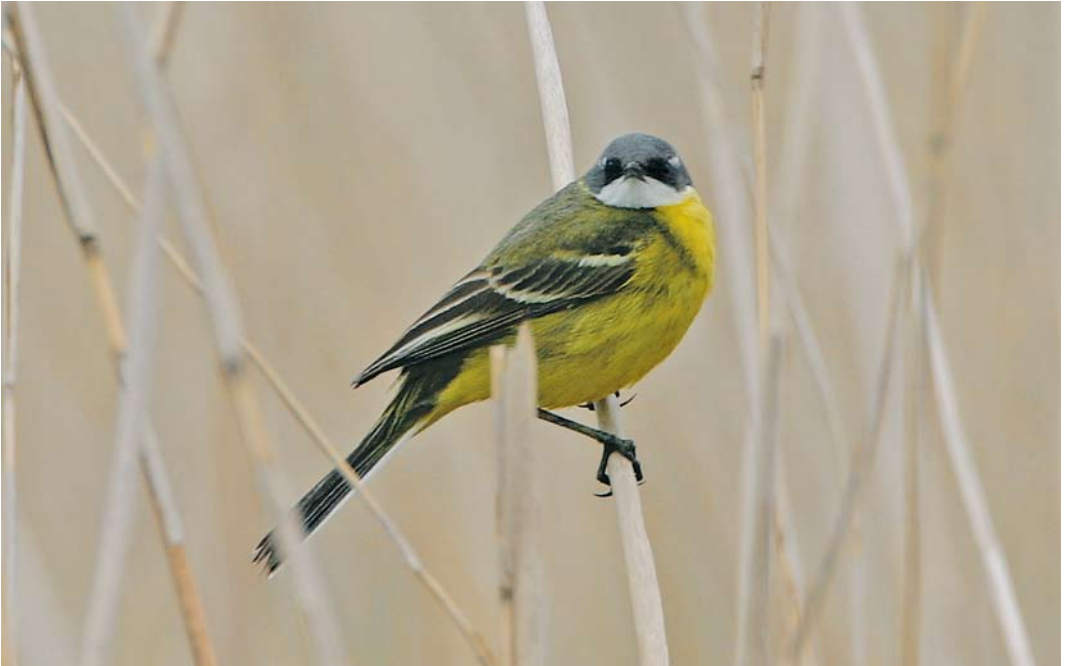
37-38 Witkeelkwikstaart / White-throated Wagtail Motacilla cinereocapilla , mannetje, Makkum, Friesland, 5 mei 2004 ( Bas van den Boogaard )