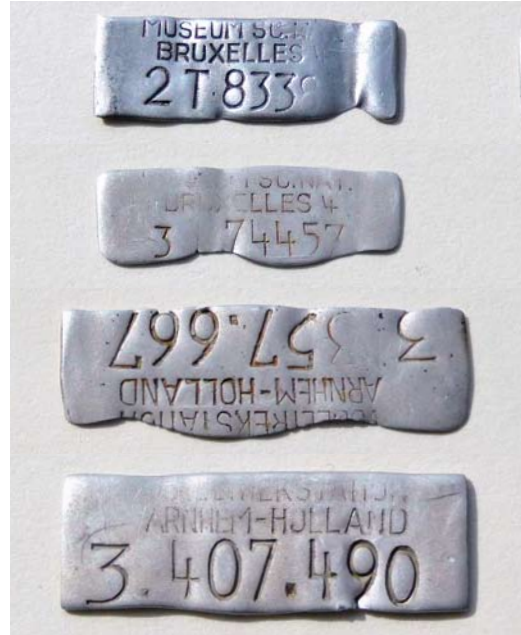
FIGURE 5 Aluminium rings removed from four Black-headed Gulls Chroicocephalus ridibundus breeding on Griend, Friesland, Netherlands (upper three on tarsus, lower on tibia). All trapped on nest and ring replaced by stainless steel ring, Arnhem 3.357.667 upside down; see text for details. Note irregular scalloping of lower edge.