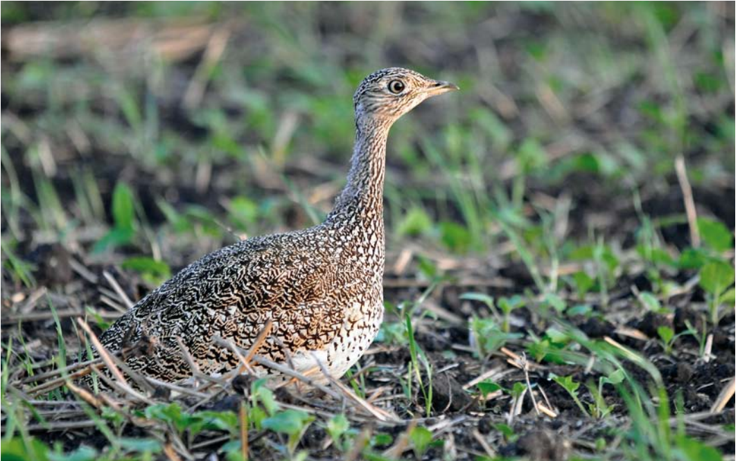
434 Little Bustard / Kleine Trap Tetrax tetrax , Machnówek, Lubelskie, Poland, 8 September 2012