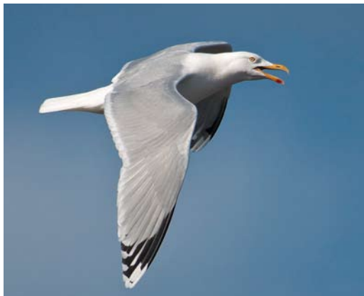
407 Hybrid Glaucous x Herring Gull Larus hyperboreus x argentatus , adult, Sandgerði, Iceland, 1 April 2010. Different individual than in plate 408, but with roughly same features in primary pattern. This bird has even larger white mirror on p9, with very little subterminal black.