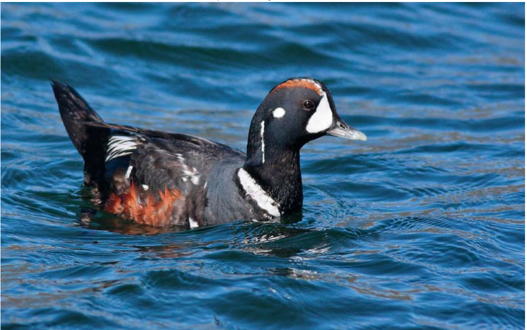
435 Harlequin Duck / Harlekijneend Histrionicus histrionicus , male, Persfjorden, Vardø, Finnmark, Norway, 28 July 2012 (Jürgen Steudtner)