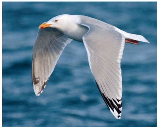
408 Hybrid Glaucous x Herring Gull Larus hyperboreus x argentatus , adult, Njarðvík, Iceland, 1 April 2010 (Peter Adriaens). As this bird combines pale grey upperparts with long, Caspian Gull L. cachinnans -like tongue on underside of p10, it may recall Smithsonian Gull L. smithsonianus . Note, however, absence of black on p5, and very large white mirror on p9-10. This bird has no real 'bayonet pattern' on p7-8 either.

Amongst other things, it lacked a black band on p5, did not have a complete black subterminal band on p10 and lacked obvious bayonets on p7-8). Several of the visible features indicate that this bird is most likely an argentatus or smithsonianus with hyperboreus influence. These features include: overall structure and size, slaty black colour on the outer primaries, especially when compared directly with the jet-black coloration of the primaries of other nearby gulls (although it should be noted that, if seen alone, the colour could seem, at times, more jet-black), very pale grey wings, paler than argenteus in direct comparison, lack of any black coloration on p5 and restricted black on p6, would, most likely, indicate argentatus or smithsonianus with hyperboreus influence. This bird addresses well the potential pitfall and illustrates why, when dealing with smithsonianus candidates, hybrid hyperboreus x argentatus should also be borne in mind. A thorough study of the primary pattern is essential for a correct identification.