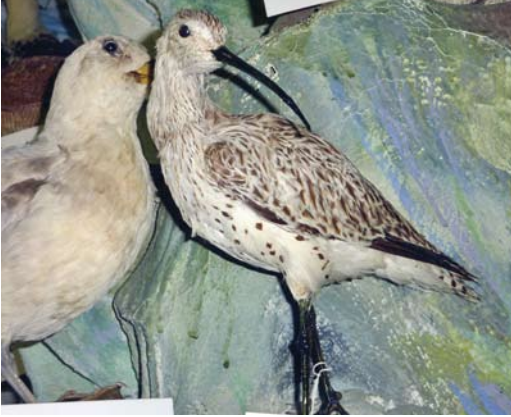
426 Dunbekwulp / Slender-billed Curlew Numenius tenuirostris (verzameld te Zierikzee, Zeeland, op 5 december 1888), Missiemuseum te Steijl, Venlo, Limburg, 9 augustus 2011

Zierikzee en werkte daar bij het gerechtshof.