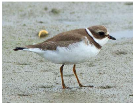
450 Little Crake / Klein Waterhoen Porzana parva , Kruikeke, Oost-Vlaanderen, Belgium, 6 September 2012 451 Booted Eagle / Dwergarend Aquila pennata , Walem, Antwerpen, Belgium, 18 July 2012 452 Short-billed Dowitcher / Kleine Grijze Snip Limnodromus griseus , juvenile, Lodmoor, Dorset, England, 6 September 2012 453 Terek Sandpiper / Terekrutter Xenus cinereus , Cabo da Praia, Terceira, Azores, 29 August 2012 454 Greater Sand Plover / Woestijnplevier Charadrius leschenaultii , Hauke-Haien-Koog, Nordrhein-Westfalen, Germany, 25 August 2012 455 Semipalmated Plover / Amerikaanse Bontbekplevier Charadrius semipalmatus , first-year, South Uist, Outer Hebrides, Scotland, 7 September 2012