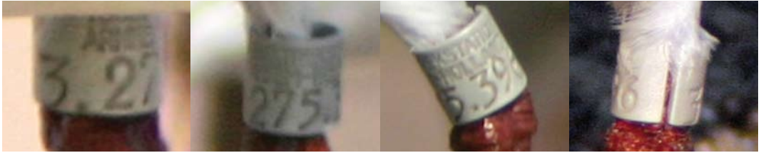
FIGURE 2 Aluminium ring Arnhem 3.275.396 on tibia of world's oldest Black-headed Gull Chroicocephalus ridibundus, Zoetermeer, Zuid-Holland, Netherlands, 16 March 2010 (far left) and 21 March 2011 (other three). Note almost absence of wear after more than 32½ years.