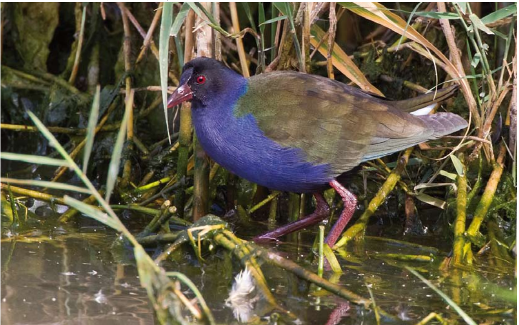
56 Allen's Gallinule / Afrikaans Purperhoen Porphyrio alleni , adult, Catalina Garcia, Fuerteventura, Canary Islands, 9 December 2011