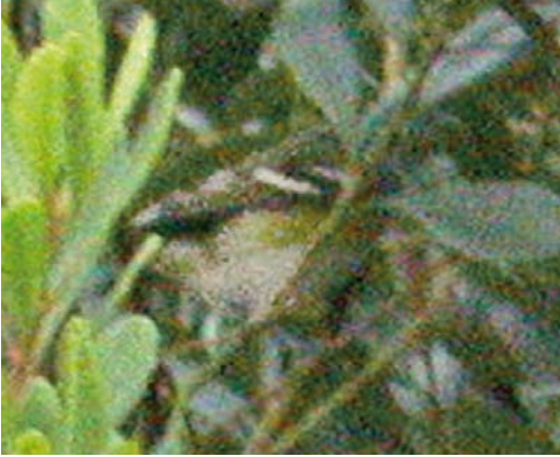
41 White-eyed Vireo / Witoogvireo Vireo griseus , first-year, Ribeira de Cancelas, Corvo, Azores, 22 October 2005 (Peter Alfrey)