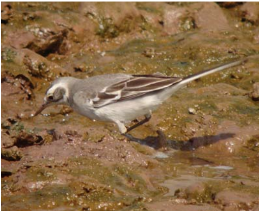
49-50 Citrine Wagtail / Citroenkwikstaart Motacilla citreola , first-year, Lugar de Baixo, Madeira, 10 September 2011

Enno B Ebels, Joseph Haydnlaan 4, 3533 AE Utrecht, Netherlands ( ebels@wxs.nl )