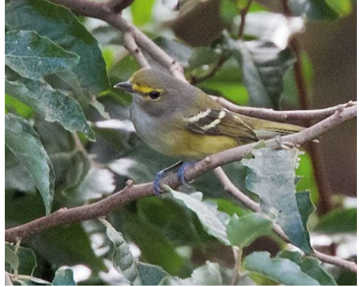
42 White-eyed Vireo / Witoogvireo Vireo griseus , first-year, Ribeira da Lapa, Corvo, Azores, 24 October 2008 (Vincent Legrand)

west of the 'high fields' on Corvo's sloping eastern flank. Ribeira da Lapa is a small and relatively open valley (compared with other ribeiras on Corvo), the vegetation being dominated by laurel and hydrangea scrub and small cedars. Unfortunately, despite finding a Lesser Yellowlegs Tringa flavipes alongside the pools in the lower part of the valley, they had not detected any interesting passerines and, about halfway up the valley, PA headed south to work his way back through the fields as DS pushed on up the ribeira. Dropping back into the valley bottom, DS was struck by the increased amount of bird activity in this section and, after briefly stopping to take a photograph, settled down in a shady spot overlooking an area of scrub on the opposite side. After a short period scanning, a small, grey-headed passerine with double wing-bars and yellow underparts suddenly appeared amongst the laurel before, almost instantly, disappearing again.