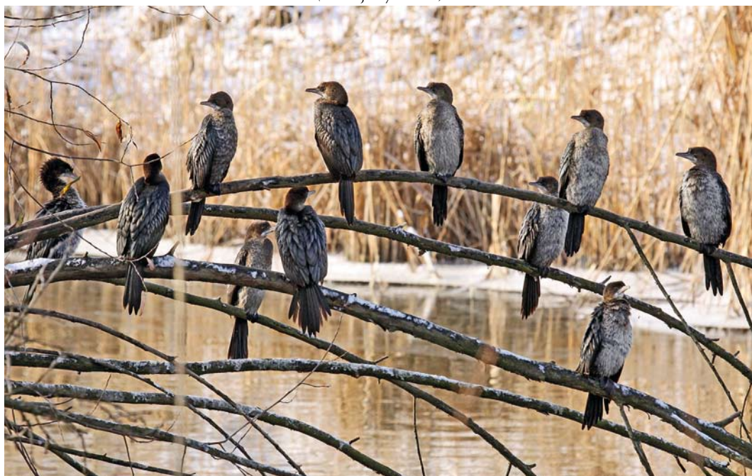
384 Pygmy Cormorants / Dwergaalscholwers Phalacrocorax pygmeus , Belgrade, Serbia, 28 December 2008