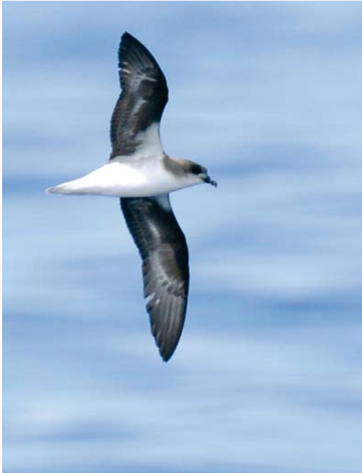
445 Zino's Petrel / Freira Pterodroma madeira , Fortune Bank, c 21 nautical miles east of Graciosa, Azores, 1 August 2012 (Harro H Müller)