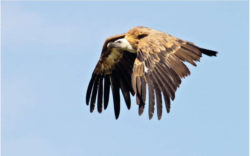
467 Vale Gier / Griffon Vulture Gyps fulvus , Tzummarum, Friesland, 7 juli 2012 ( Kees de Vries ) 468 Bairds Strandloper / Baird's Sandpiper Calidris bairdii , juveniel, Noordzeestrand, Meijendel, Zuid-Holland, 29 augustus 2012 ( Ben van den Broek ) 469 Vale Gier / Griffon Vulture Gyps fulvus , Odiliapeel, Noord-Brabant, 31 juli 2012 ( Toy Janssen )