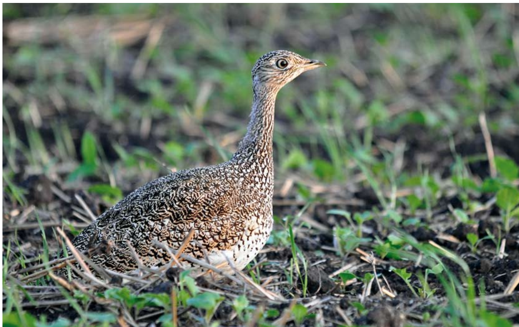
434 Little Bustard / Kleine Trap Tetrax tetrax , Machnówek, Lubelskie, Poland, 8 September 2012