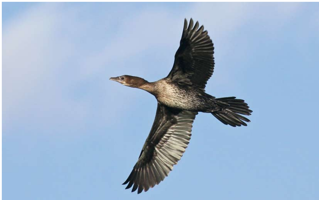
383 Pygmy Cormorant / Dwergaalscholver Phalacrocorax pygmeus , Belgrade, Serbia, 23 November 2008 (Maciej Szymański)