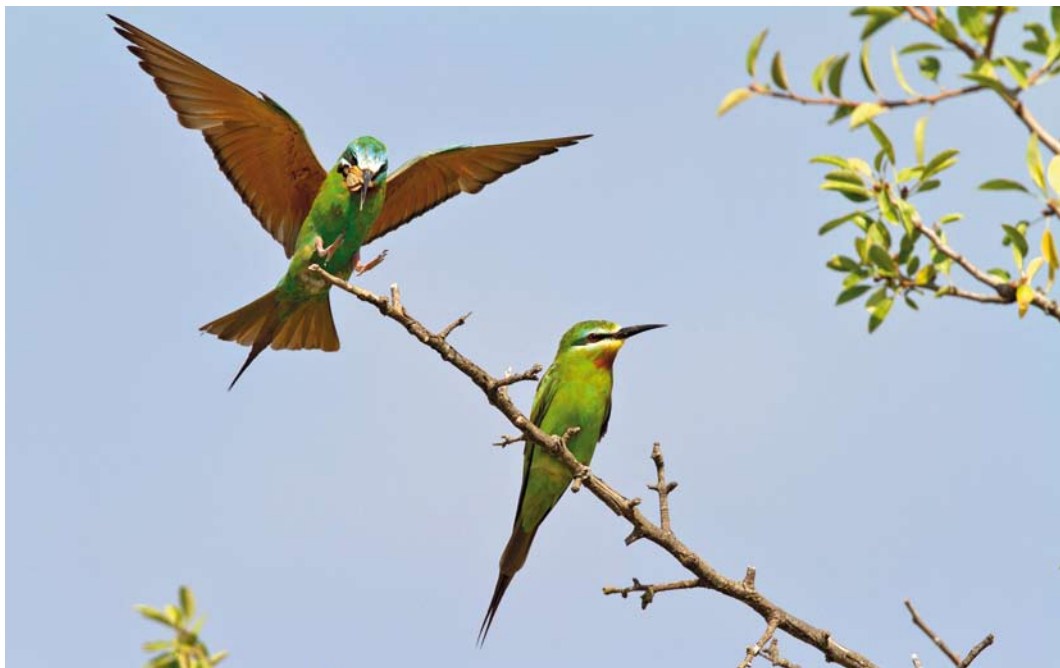
462 Blue-cheeked Bee-eaters / Groene Bijeneters Merops persicus , Delfía, Girona, Spain, 24 August 2012