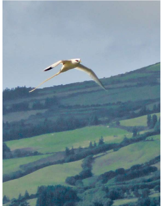
446 White-tailed Tropicbird / Witstaartkeerringvogel Phaethon lepturus , adult, Horta, Faial, Azores, 17 September 2012

at Gulf of Cagliari. In 2011, the feral breeding population of African Sacred Ibis Threskiornis aethiopicus in France numbered 660-710 pairs (from 1700 pairs in 2006), mostly in Loire-Atlantique (Ornithos 19: 238-239, 2012). At the Dutch-German border, three fledgling Chilean Flamingos Phoenicopterus chilensis were ringed at Zwillbrocker Venn colony where this (and occasionally other) flamingo species has been thriving since 1982. In the Azores, long-staying Pied-billed Grebes Podilymbus podiceps remained through at least mid-September at Lagoa Azul, São Miguel, at Angra do Heroísmo, Terceira, and at Lagoa Branca, Flores.