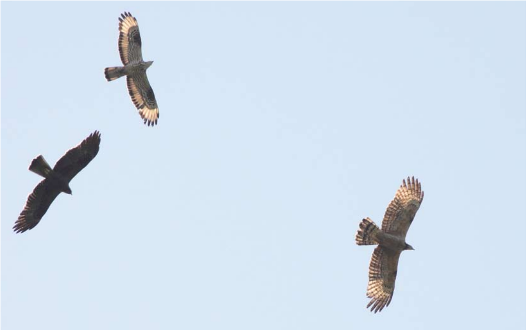
432 Crested Honey Buzzard / Aziatische Wespendif Pernis ptilorhyncus , adult female (right), with European Honey Buzzard / Wespendif P apivorus , male, and Booted Eagle / Dwegarend Aquila pennata , Batumi, Georgia, 4 September 2012 433 Cory's Shearwater / Kuhls Pijlstormvogel Calonectris borealis , with Sandwich Tern / Grote Stern Sterna sandvicensis , Frederikshavn, Nordjylland, Denmark, 11 July 2012