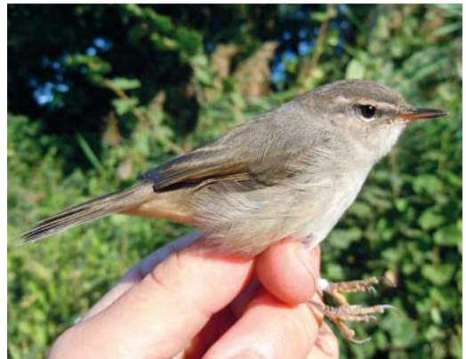
456 European Bee-eater / Bijeneter Merops apiaster , Malta, April 2012 457 Little Swift / Huisgierzwaluw Apus affinis , juvenile, New Brighton, Merseyside, England, 22 June 2012 cf Dutch Birding 34: 264, 2012 458 Magnolia Warbler / Magnoliazanger Setophaga magnolia , Fair Isle, Scotland, 23 September 2012 459 Magnolia Warbler / Magnoliazanger Setophaga magnolia , Fair Isle, Scotland, 23 September 2012 460 Yellow-breasted Bunting / Wilgengors Emberiza aureola , Falsterbo, Skåne, Sweden 461 Dusky Warbler / Bruine Boszanger Phylloscopus fuscatus , Nodebais, Brabant Wallon, Belgium, 30 August 2012