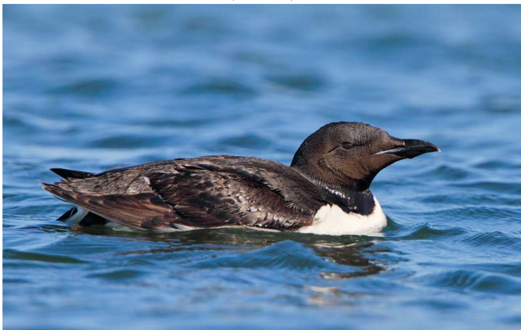
478 Kortbekzeekoet / Thick-billed Murre Uria lomvia , Huisduinen, Den Helder, Noord-Holland, 12 augustus 2012 (Michel Veldt)