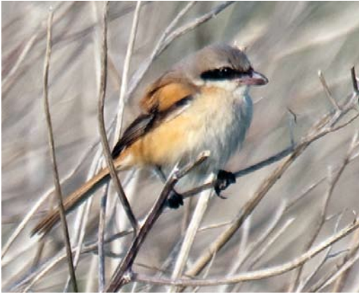
419 Langstaartklauwier / Long-tailed Shrike Lanius schach , eerste-winter, Oude Vuilnisbelt, Den Helder, Noord-Holland, 31 oktober 2011 (Arnoud B van den Berg)