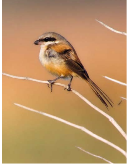
415-417 Langstaartklauwier / Long-tailed Shrike Lanius schach , eerste-winter, Oude Vuilnisbelt, Den Helder, Noord-Holland, 31 oktober 2011 418 Langstaartklauwier / Long-tailed Shrike Lanius schach , eerste-winter, Oude Vuilnisbelt, Den Helder, Noord-Holland, 31 oktober 2011