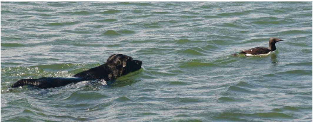
483 Kortbekzeekoet / Thick-billed Murre Uria lomvia , Huisduinen, Den Helder, Noord-Holland, 12 augustus 2012

THICK-BILLED MURRE On 28-29 July 2012, a summer-plumaged Thick-billed Murre Uria lomvia was seen near Lauwersoog, Groningen, the Netherlands. On 11-13 August, the same bird stayed at Den Helder, Noord-Holland, c 130 km to the west. On the last day, the bird died while on the water (the corpse could not be collected). At both sites, the bird could be observed at close range and extensively photographed and videoed. The detailed documentation may suffice to identify the subspecies. This was the ninth record, the third of a live bird (two of which eventually also died), the first in summer and the first twitchable.