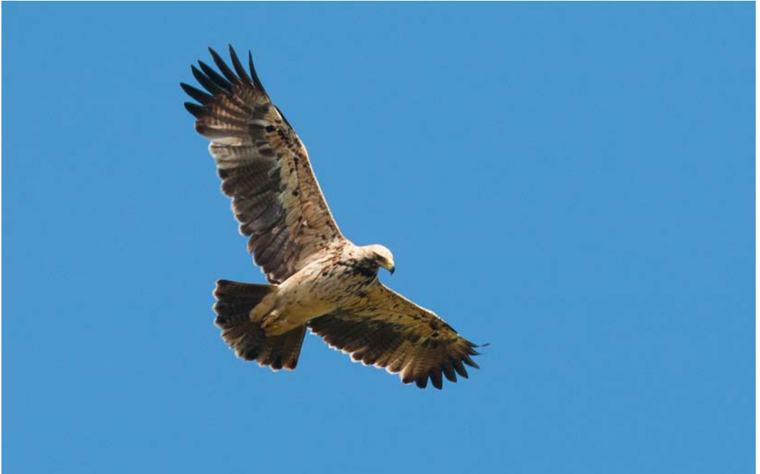
436 Eastern Imperial Eagle / Keizerarend Aquila heliaca , subadult, Sturup, Skåne, Sweden, 25 July 2012 437 Rüppell's Vulture / Rüppells Gier Gyps rueppellii , Vila Velha De Rodão, Portugal, 4 August 2012 438 Hybrid Lesser Spotted x Greater Spotted Eagle Aquila pomarina x clanga , juvenile, Biebrza marshes, Poland, 7 September 2012