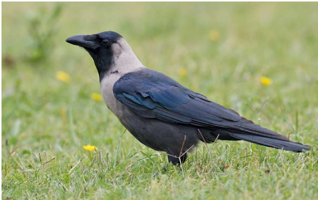
477 Huis kraai / House Crow Corvus splendens , Hoek van Holland, Zuid-Holland, 26 augustus 2012. Exemplaar met kenmerken van C s zugmayeri .