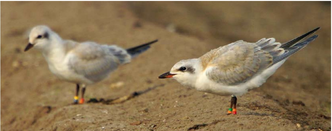
474 Grote Burgemeester / Glaucous Gull Larus hyperboreus , tweede-zomer, Osdorp, Amsterdam, Noord-Holland, 6 september 2012 ( Michel Veldt ) 475 Kleinste Jager / Long-tailed Jaeger Stercorarius longicaudus , juveniel, Kinderdijk, Zuid-Holland, 22 augustus 2012 ( Adri Clements ) 476 Lachsters / Gull-billed Terns Gelochelidon nilotica , juveniele, Keinsmerbrug, Noord-Holland, 28 augustus 2012 ( Arnold W J Meijer )

Vooral twee tamme juveniele van 28 tot 31 augustus op een parkeerplaats bij Hargen aan Zee, Noord-Holland, trokken veel bekijks. Een Amerikaanse Goudplevier Pluvialis dominica verbleef van 17 juli tot 18 augustus in de omgeving van Serooskerke. Aziatische Goudplevieren P. fulva werden gemeld op 3 en 4 juli in Mariëndal bij Den Helder, Noord-Holland; op 8 en 10 juli bij De Cocksdorp op Texel; van 21 tot 23 maximaal twee in de Slufter op Texel; op 31 juli en 1 augustus opnieuw twee in Waal en Burg op Texel; en op 16 augustus in de Ezumakeeg, Friesland. Het is onduidelijk hoeveel vogels er in het spel waren. Een Bonapartes Strandloper Calidris fuscicollis verbleef op 28 juli in de Sophiapolder bij Oostburg, Zeeland. Een tamme juveniele Bairds Strandloper C. bairdii die op 27 augustus werd gefotografeerd op het strand bij Wassenaar, Zuid-Holland, was daar tot groot genoegen van veel vogelaars ook op 29 en 30 augustus te zien. Het betrof alweer de derde twitchbare binnen een jaar. Op zeven plekken in het noorden en