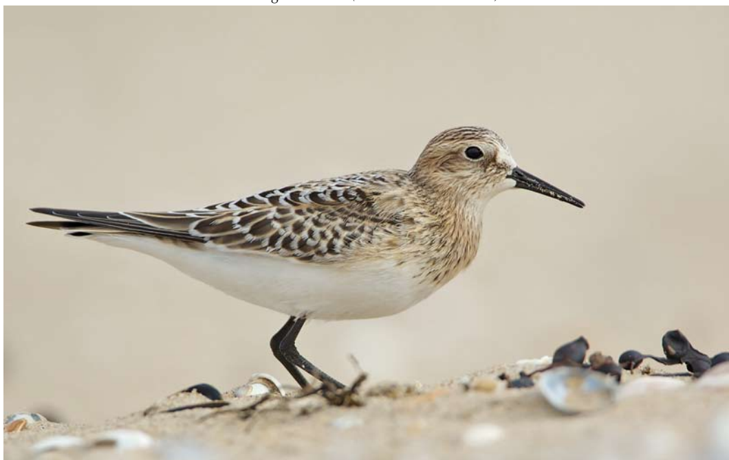
466 Bairds Strandloper / Baird's Sandpiper Calidris bairdii , juveniel, Noordzeestrand, Meijendel, Zuid-Holland, 29 augustus 2012