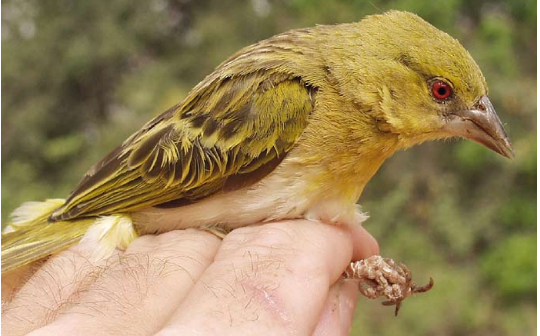
430 Village Weaver / Grote Textorwever Ploceus cucullatus , adult female, Amurum, Jos Plateau, Nigeria (09°52'N, 08°58'E), 27 March 2003 (Ross McGregor). Note long claws, similar to Abu Simbel bird.