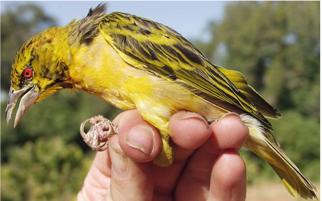
431 Village Weaver / Grote Textorwever Ploceus cucullatus , adult male, Amurum, Jos Plateau, Nigeria (09°52'N, 08°58'E), 28 November 2001 (Ross McGregor). Note long claws, similar to Abu Simbel bird.