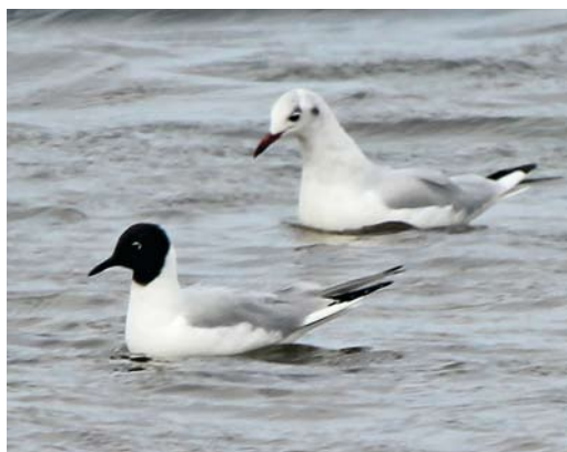
439 Swinhoe's Storm Petrel / Chinees Stormvogeltje Oceanodroma monorhis , Fortune Bank, c 21 nautical miles east of Graciosa, Azores, Azores, 1 August 2012 440-441 Swinhoe's Storm Petrel / Chinees Stormvogeltje Oceanodroma monorhis , Fortune Bank, c 21 nautical miles east of Graciosa, Azores, 1 August 2012 442 Black-bellied Storm Petrel / Zwartbuikstormvogeltje Fregetta tropica , Banco de la Concepción, c 45 nautical miles north of Lanzarote, Canary Islands, 18 August 2012 443 Pallas's Gull / Reuzenzwartkopmeeuw Larus ichthyaetus , first-year, Swinoujście, Poland, 22 August 2012 444 Bonaparte's Gull / Kleine Kokmeeuw Chroicocephalus philadelphia , adult (left), Blåvandshuk, Vestjylland, Denmark, 4 August 2012