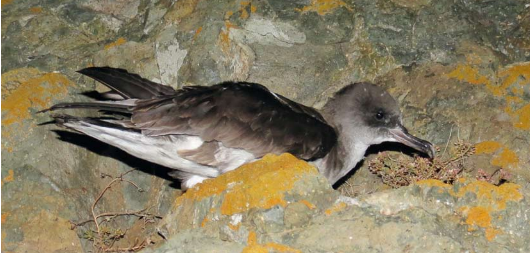
422 Cape Verde Shearwater / Kaapverdische Pijlstormvogel Calonectris edwardsii , Selvagem Grande, Selvagens, 5 April 2012