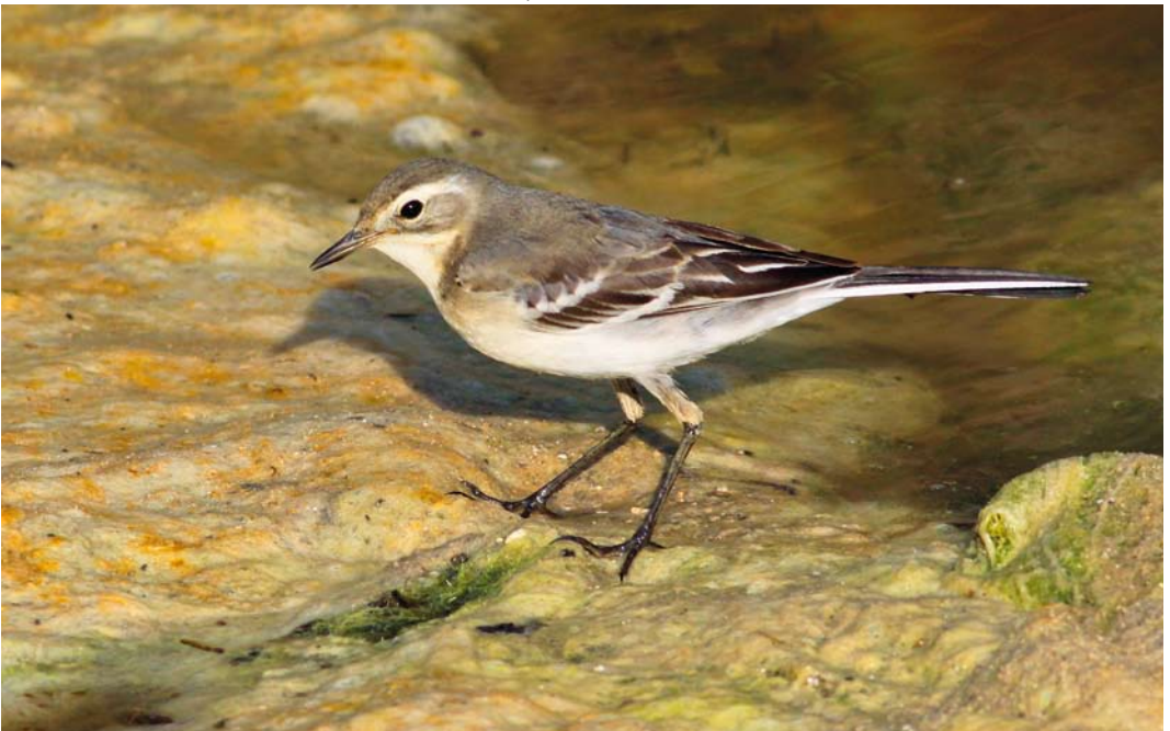
463 Citrine Wagtail / Citroenkwikstaart Motacilla citreola , first-year, Malta, 15 August 2012 (Raymond Galea)