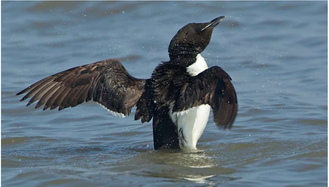
482 Kortbekzeekoet / Thick-billed Murre Uria lomvia, Kustweg, Lauwersmeer, Groningen, 29 juli 2012

Hoewel hij op enige afstand zwom, waren de belangrijkste kenmerken van Kortbekzeekoet goed te zien, zoals de zwarte bovendelen (bruiner bij Zeekoet), de kortere snavel met het karakteristieke witte lijntje op de zijkant, de compactere bouw vergeleken met Zeekoet, de in een scherpe punt oplopende witte borsttekening en het ontbreken van donkere tekening op de flanken. Na enige tijd zwom hij verder de zee op en ging actief duiken, waarbij het afwachten was waar hij weer boven zou komen. Na een uurtje begon hij aan een grondige poetsbeurt en liet zich toen rustig bekijken. Steeds meer vogelaars kwamen de dijk opgerend en wierpen een blik door de opgestelde telescopen: de soort was binnen – en voor verbaasd veel, ook zeer reislustige, vogelaars was het nog een 'lifer' ook.