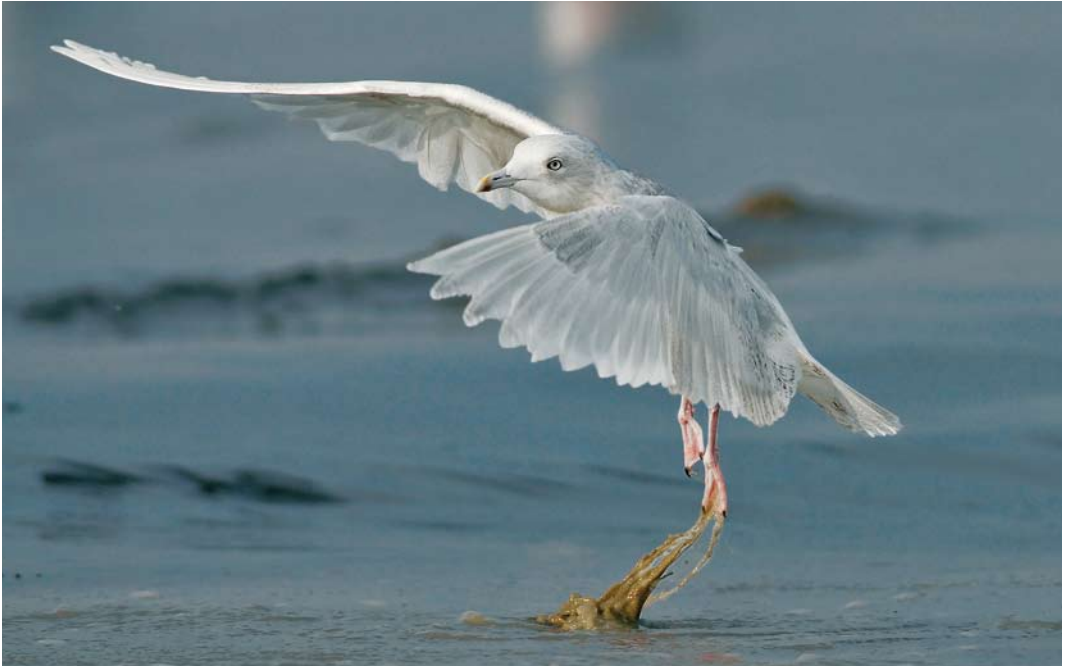
182 Kleine Burgemeester / Iceland Gull Larus glaucooides , tweede-winter, paal 28, Texel, Noord-Holland, 5 februari 2012 (René Pop)