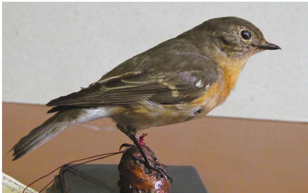
147 Mugimaki Flycatcher / Mugimakivliegenvanger Ficedula mugimaki , first-winter female (collected at San Vendemiano, Treviso, Italy, on 29 October 1957), Museum Brandolini Giol, Oderzo, Treviso, January 2012 (Giancarlo Fracasso)

presented here and represent the first colour photographs of this individual to be published. The all-dark tail clearly indicates this is a female (lacking the white patches on the outer tail shown by males), as do the pale yellowish underparts (deeper orange in male). The pale tips to the median and greater coverts indicate that it is a first-year bird. The good condition of the specimen (in particular wing- and tail-feathers and bare parts) visible in plate 146-147 was noted by Giol (1959) as an indication of a presumed wild origin.