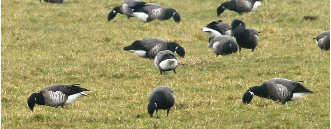
124 Presumed hybrid Pale-bellied x Dark-bellied Brent Goose / vermoedelijke hybride Witbuikrotgans x Rotgans Branta hrota x bernicla , adult (left), with Dark-bellied Brent Geese / Rotganzen B. bernicla , Texel, Noord-Holland, Netherlands, 22 February 2009 (Dirk Vogt)

probably leave 'difficult' brent geese unidentified and/or are reluctant to report hybrids. Older reports are perhaps hard to trace anyway because, in those days, all brent geese taxa were treated as subspecies and 'intermediate' birds were considered to be of very limited interest. Therefore, the reports in table 1 are probably not complete but give an idea of the minimum numbers involved.