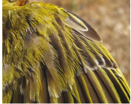
104 Syrian Serin / Syrische Kanarie Serinus syriacus , second calendar-year female, mount Hermon, Israel, 15 August 2008 (Yael Lehnardt). All alula feathers and three outer greater coverts juvenile, with rusty fringes, and more strongly worn. Unmoulted outer primary coverts also worn and brownish. Note that two new inner primaries and primary coverts are part of this bird's first post-breeding moult that has started just few weeks before this wing was photographed in July, and are not part of the discussed moult pattern. 105 Syrian Serin / Syrische Kanarie Serinus syriacus , adult male, mount Hermon, Israel, 18 July 2008 (Yael Lehnardt). All alula feathers from same moult period, having blackish centre and yellow fringes. Primary coverts neatly tipped pure grey. Compare with plate 103 and 104.

ing the winter since they had no more than only one or two different wear and colour patterns in their wings. Feathers that had been replaced due to accidental loss in winter, evident because they were the least worn and not symmetrically moulted, were not included in our analysis.