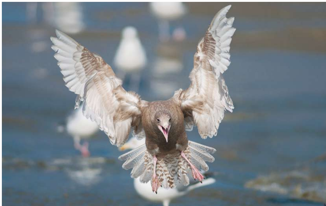
180 Grote Burgemeester / Glaucous Gull Larus hyperboreus , eerste-winter, paal 29, Texel, Noord-Holland, 6 maart 2012