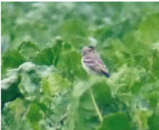
118 Hybride Citroenkwikstaart x Gele Kwikstaart / hybrid Citrine x Blue-headed Wagtail Motacilla citreola x flava , juveniel, Zeewolde, Flevoland, 16 juli 2011 (Roy Slaterus)

Ook van 19 tot 22 juli verzamelden beide ouders voedsel voor de jongen maar de frequentie van de voedselvluchten lag aanzienlijk lager dan in de voorgaande dagen. Opvallend was dat het mannetje meerdere pogingen deed om overvliegende Torenvalken Falco tinnunculus te verjagen en daarin soms werd bijgestaan door Gele Kwikstaarten die in de nabijheid nestelden. Ook werd waargenomen hoe het mannetje kortstondig boven de bietenplanten een luchtgevecht aanging met een mannetje Gele Kwikstaart. De jongen verbleven nog steeds hoofdzakelijk op de grond en lieten zich nauwelijks bekijken. De ouders zaten langdurig boven in het gewas om pas na veelvuldige verplaatsingen met het verzamelde voedsel naar de grond te vliegen om daar, buiten beeld, de jongen te voeren.