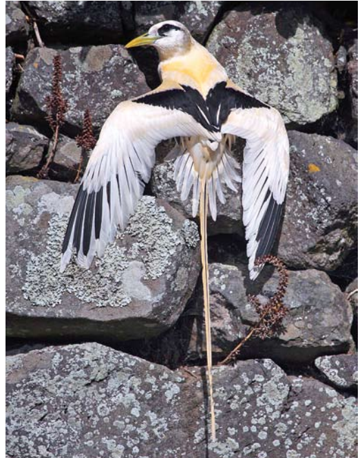
137 White-tailed Tropicbird / Witstaartkeerkringvogel Phaethon lepturus , adult, Fajãzinha, Flores, Azores, 16 October 2011 138 White-tailed Tropicbird / Witstaartkeerkringvogel Phaethon lepturus , adult, Fajãzinha, Flores, Azores, 17 October 2011 139 White-tailed Tropicbird / Witstaartkeerkringvogel Phaethon lepturus , adult, Fajãzinha, Flores, Azores, 15 October 2011