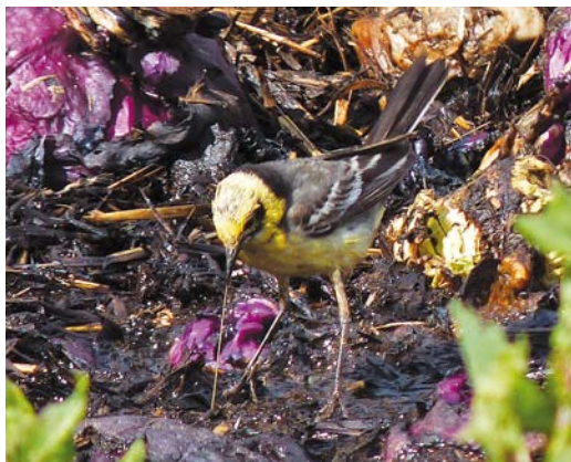
116 Citroenkwikstaart / Citrine Wagtail Motacilla citreola , eerste-zomer mannetje, Zeewolde, Flevoland, 17 juli 2011