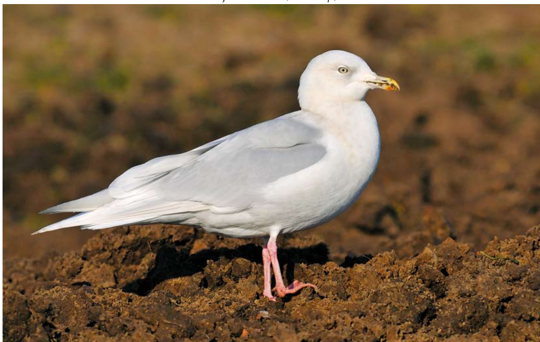
179 Kleine Burgemeester / Iceland Gull Larus glaucoides , adult, Oudeschild, Texel, Noord-Holland, 31 januari 2012