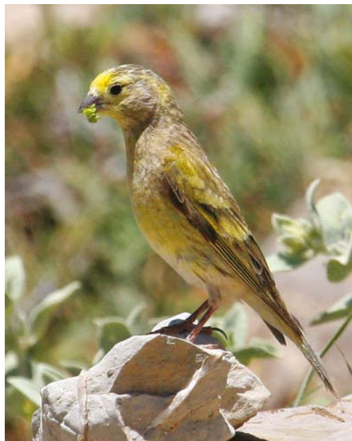
110 Syrian Serin / Syrische Kanarie Serinus syriacus , second-year female, mount Hermon, Israel, 29 May 2008 (Lior Kislev). Note brownish and worn alula feathers and primary coverts, lacking yellowish edges and grey tip.

birds, having both adult-type feathers and some old retained juvenile feathers; and 3 adults (third calendar-year or older) of which all feathers are similar in age and pattern.