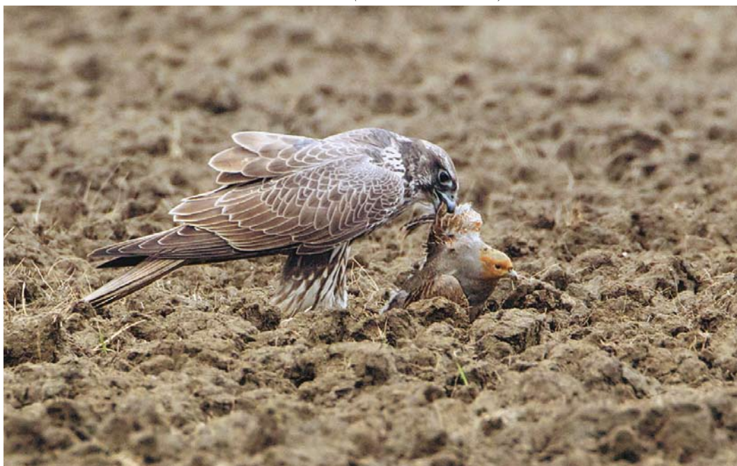
175 Giervalk / Gyrfalcon Falco rusticolus , eerstejaars, met Patrijs / Grey Partridge Perdix perdix , Hoek, Zeeland, 24 februari 2012 (Martin van der Schalk)