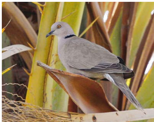
140-141 Mourning Collared Dove / Treurtortel Streptopelia decipiens , Abu Simbel, Egypt, 29 December 2010

sounded again, a 'collared dove' performed a display flight which was repeated after c 10 min. At that moment, we heard another individual making the same sound and soon both doves were clearly visible and KDR managed to obtain some photographs. We noted that both birds were unringed.