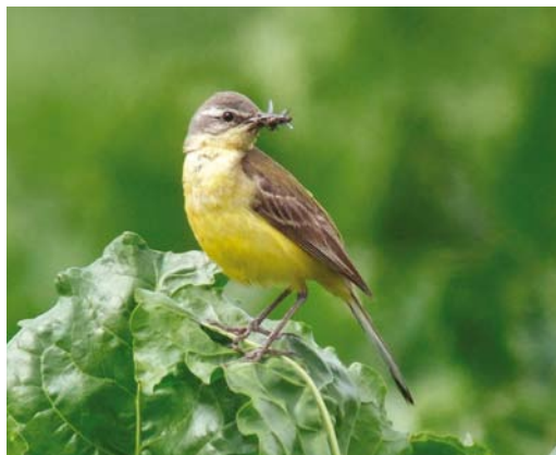
117 Gele Kwikstaart / Blue-headed Wagtail Motacilla flava , vrouwtje, Zeewolde, Flevoland, 21 juli 2011 (Roy Slaterus). Vrouwtje van gemengd broedpaar.

was: niet alleen ging het om het c 33e geval van Citroenkwikstaart (28 gevallen tot en met 2010) maar bovendien om het eerste broedgeval. In de daaropvolgende dagen werd vastgesteld dat de vogel gepaard was met een vrouwtje Gele Kwikstaart M flava en dat ze samen ten minste drie jongen grootbrachten. De plek was niet vrij toegankelijk en daarom werd besloten om het nieuws niet uitgebreid te verspreiden. In dit artikel worden de determinatie van de Citroenkwikstaart en het gemengde broedgeval besproken.