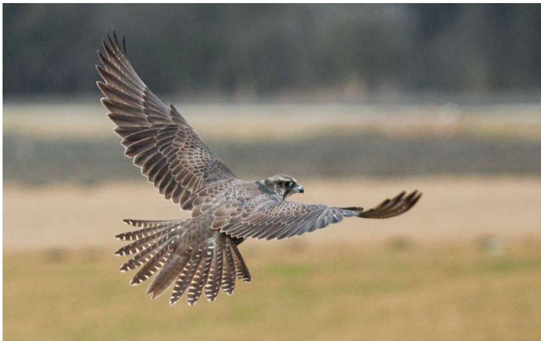
174 Giervalk / Gyrfalcon Falco rusticolus , eerstejaars, Hoek, Zeeland, 19 februari 2012 (Garry Bakker)