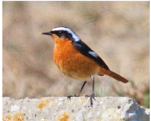
170 Glaucous Gull / Grote Burgemeester Larus hyperboreus , first-winter, with Yellow-legged Gull / Geelpootmeeuw L. michahellis , first-winter, Lagune de Khnifiss, Western Sahara, Morocco, 15 January 2012 (Arnoud B van den Berg/The Sound Approach) 171 Ross's Gull / Ross' Meeuw Rhodostethia rosea , first-winter, Molfetta, Puglia, Italy, 23 February 2012 (Angelo Nitti) 172 Isabelline Wheatear / Izabeltapuit Oenanthe isabellina , Âit-Labbès, Eastern High Atlas, Morocco, 13 March 2012 (Arnoud B van den Berg/The Sound Approach) 173 Moussier's Redstart / Diadeemroodstaart Phoenicurus moussieri , male, Tarifa, Cádiz, Spain, 17 March 2012 (Javier Elorriaga)

discovered at Maasbracht, Limburg, the Netherlands, on 23 February and seen across the Belgian-Dutch border at, eg, Kessenich and Maaseik, Limburg, Belgium, from 28 February into March (and again occasionally on the Dutch side of the border from 7 March). During the International Gull Meeting at Zagreb, Croatia, on 16-19 February, a possible Heuglin's Gull L. heuglini and three Great Black-backed Gulls L. marinus (only seven previous records) were found at the Jakuševac dump. The identification of a third-winter 'herring gull' at Den Oever, Noord-Holland, from 22 January into March was much debated, as its characters did not exclude Smithsonian Gull L. smithsonianus ; analysis of DNA taken from its droppings, however, indicated it concerned a Herring Gull L. argentatus (Peter de Knijff in litt). In Spain, the adult Smithsonian Gull at Lires, Fisterra, A Coruña, from 28 December 2011 was still present on 22 February.