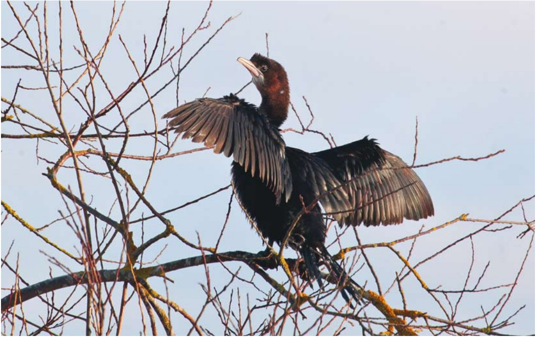
148 Pygmy Cormorant / Dwergaalscholver Phalacrocorax pygmeus , Uzava floodplains, Ventspils, Latvia, 1 February 2012 ( Kārlis Millers ) 149 Black Heron / Zwarte Reiger Egretta ardesiaca , adult, Barragem de Poilão, Santiago, Cape Verde Islands, 28 February 2012 ( Vincent Legrand ) 150 Intermediate Egret / Middelste Zilverreiger Mesophoyx intermedia , Barragem de Poilão, Santiago, Cape Verde Islands, 27 February 2012 ( Vincent Legrand )