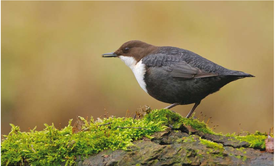
189 Zwartbuikwaterspreeuw / Black-bellied Dipper Cinclus cinclus cinclus , Oosterveld, Hengelo, Overijssel, 28 februari 2012

verbleef een Grote Pieper Anthus richardi in Het Zwin, Zeeland. Een mooi aantal van 113 Sneeuwgorzen Plectrophenax nivalis trok op 24 februari langs telpost Noordkaap in Groningen. Het landelijke telpostrecord is in handen van dezelfde telpost en betrof 384 exemplaren op 26 februari 2011. Grauwe Gorzen Emberiza calandra werden op enkele plekken in Groningen,