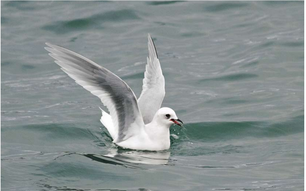
154 Ross's Gull / Ross' Meeuw Rhodostethia rosea , adult, Ardglass, Down, Ireland, 24 January 2012