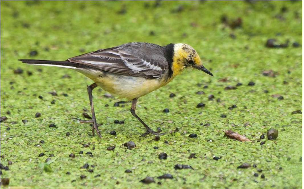
114-115 Citroenkwikstaart / Citrine Wagtail Motacilla citreola , eerste-zomer mannetje, Zeewolde, Flevoland, 16 juli 2011