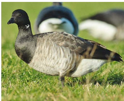
120-121 Presumed hybrid Pale-bellied x Dark-bellied Brent Goose / vermoedelijke hybride Witbuikrotgans x Rotgans Branta hrota x bernicla , adult, Bantpolder, Lauwersmeer, Friesland, Netherlands, 21 February 2009 ( Rik Winters ) 122-123 Presumed hybrid Pale-bellied x Dark-bellied Brent Goose / vermoedelijke hybride Witbuikrotgans x Rotgans Branta hrota x bernicla , adult, Smerp, Noord-Holland, Netherlands, 28 December 2009 ( Fred Visscher ). Different birds.

2009 near Ezumazijl, Friesland. Based on the intermediate appearance, the three birds were presumed to be hybrids Pale-bellied x Dark-bellied Brent Goose, although this is probably not more than a best guess. In all cases, also the possibility of 'Gray-bellied Brant' (cf Garner & Millington 2001, Garner & friends 2008; see also below) was suggested, and the birds were judged by some birders who were asked to comment to be pale Dark-bellied Brent Geese, or dark Pale-bellied Brent Geese (with last two options remarkably depending strongly on the species being most frequent in the commentators' country of residence...).