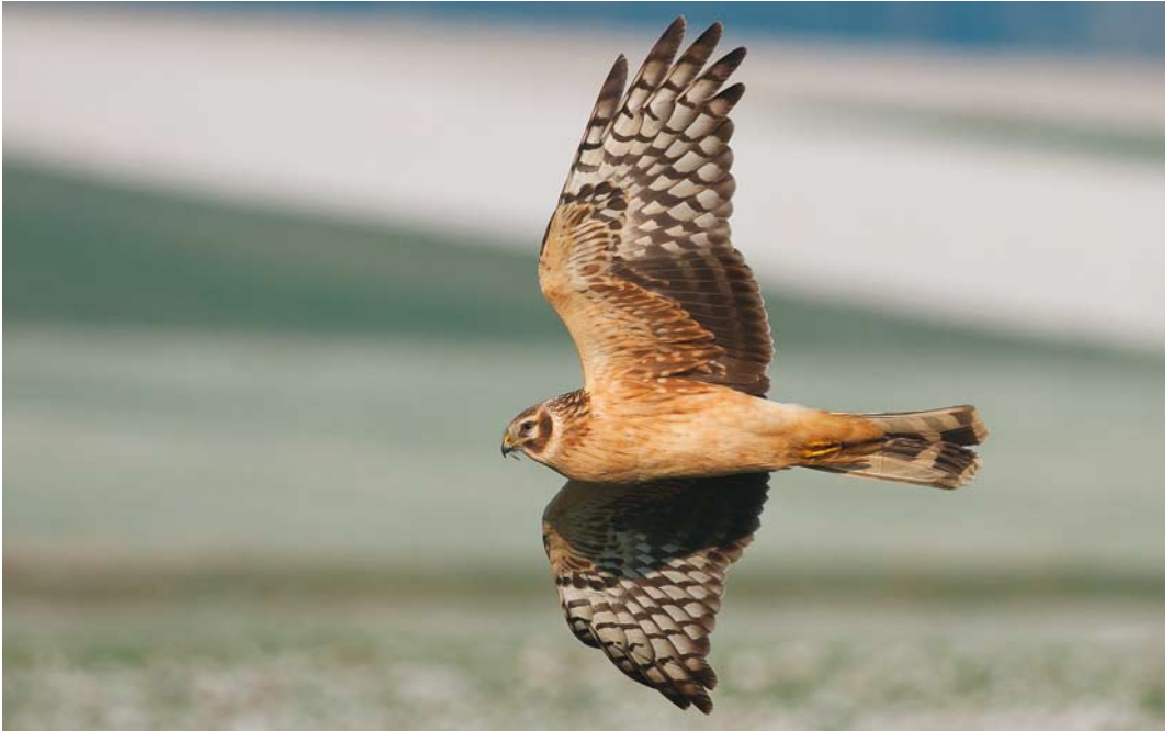
157 Hybrid Pallid x Hen Harrier / hybride Steppekiekendief x Blauwe Kiekendief Circus macrourus x cyaneus , second calendar-year female, Villers-le-Gambon, Namur, Belgium, 1 February 2012 (Alain de Broyer)