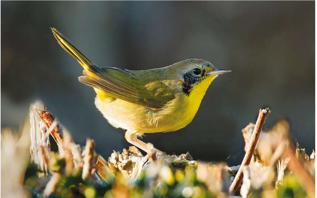
168 Common Yellowthroat / Gewone Maskerzanger Geothlypis trichas, second calendar-year male, Rhiwderyn, Gwent, Wales, 25 February 2012