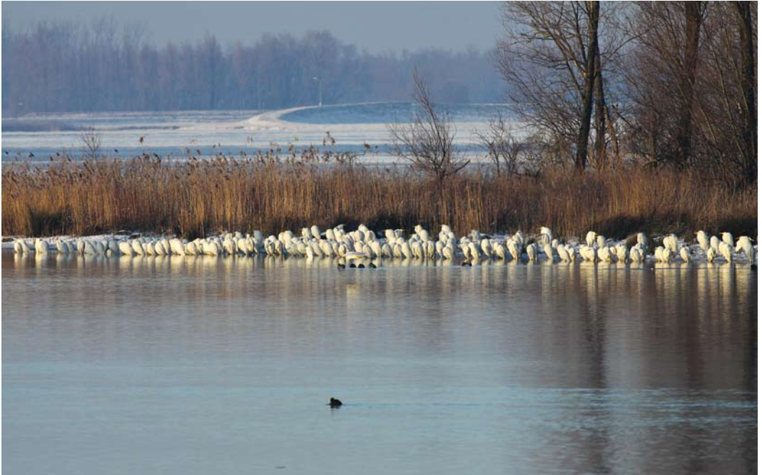
176 Grote Zilverreigers / Western Great Egrets Casmerodius albus , Brabantse Biesbosch, Noord-Brabant, 1 februari 2012 ( Thomas van der Es ). Deel van groep van 917.