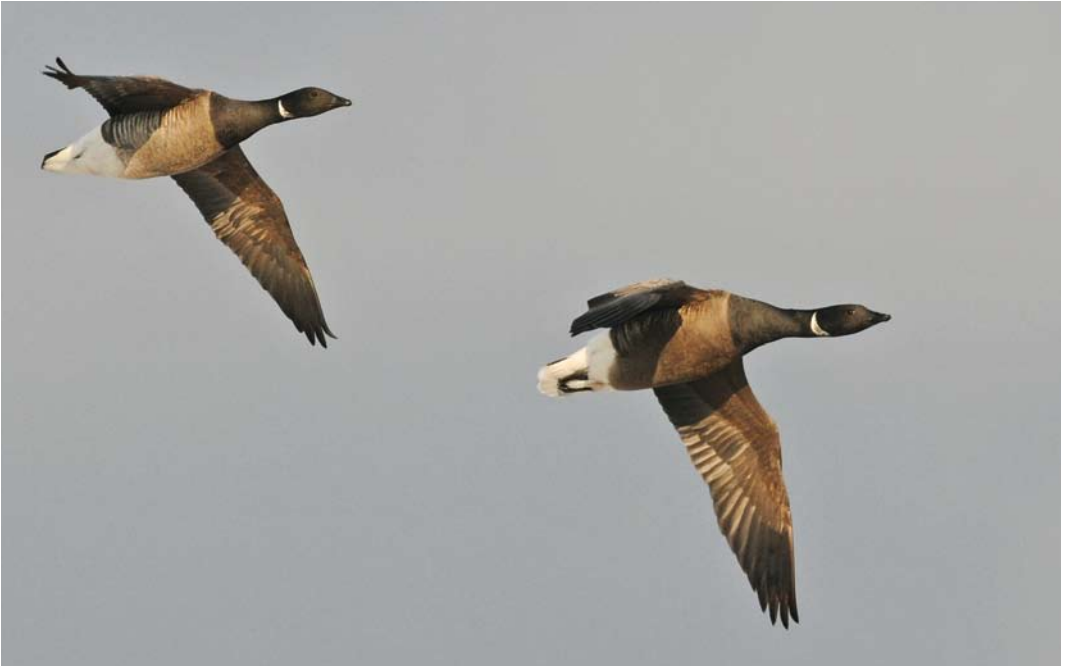
125 Presumed hybrid Pale-bellied x Dark-bellied Brent / vermoedelijke hybride Witbuikrotgans x Rotgans Branta hrota x bernicla (left), with Dark-bellied Brent Goose / Rotgans B bernicla , Ezumazijl, Friesland, Netherlands, 4 February 2009. Presumed to be same bird as in plate 120-121.

Pale-bellied may occur. Hybrids between Dark-bellied and Black have been documented (Berrevoets & Erkman 1993, Bakker & Ebels 2002) and are reported each winter.