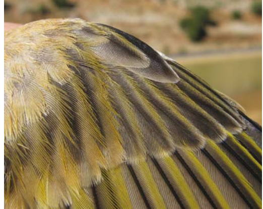
103 Syrian Serin / Syrische Kanarie Serinus syriacus , juvenile, mount Hermon, Israel, 18 July 2008 ( Gidon Perlman ). Note brownish-grey basic colour of alula and greater coverts, not blackish; first (smallest) alula feather fringed rufous; little yellow on second alula feather. In addition, greater coverts have broad rufous edges.

Most of the adults were moulting their feathers when trapped but it was always easy to discern, based on wear and/or feather colour, which of the feathers had been replaced in the previous summer. Before the onset of their first complete post-breeding moult, first-summer (second calendar-year) birds (as defined by ring recoveries) were examined carefully to identify old retained first-generation feathers. These old feathers can in fact