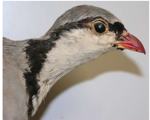
131-132 Italian Rock Partridge / Italiaanse Steenpatrijs Alectoris graeca orlandoi , adult (collected at Molise, Apennines, Italy, November 2007), Università di Scienze Naturali del Molise, Pesche, Campobasso, Italy (Andrea Corso). Same bird as in plate 126, 129 and 133. Note very pale underparts, typical of most birds (but few of the southernmost part of the range in Calabria), with almost apricot-tinged belly/vent, as well as quite pale, almost apricot undertail-coverts. 133 Italian Rock Partridge / Italiaanse Steenpatrijs Alectoris graeca orlandoi , adult (collected at Molise, Apennines, Italy, November 2007), Università di Scienze Naturali del Molise, Pesche, Campobasso, Italy (Andrea Corso). Same bird as in plate 126, 129 and 131-132. Close-up of head and throat. Note quite clean off-white throat patch, surrounded by black collar which is broader than in Sicilian Partridge A whitakeri but less irregular and ragged than in Alpine Rock Partridge A g saxatilis . Note almost invisible drab eye-line over black eye-stripe, differing from whitakeri . Note also well-defined and quite wide white line between crown and dark eye-stripe and lore.

colour in whitakeri (chiefly on undertail), as well as from darker saxatilis ; and 4 very clean and off-white throat surrounded by well-marked black collar, often narrower than in saxatilis but broader than in whitakeri . More details are given in the captions. I hope this note and these photographs will help taxonomists to further define the phenotypic appearance of orlandoi .