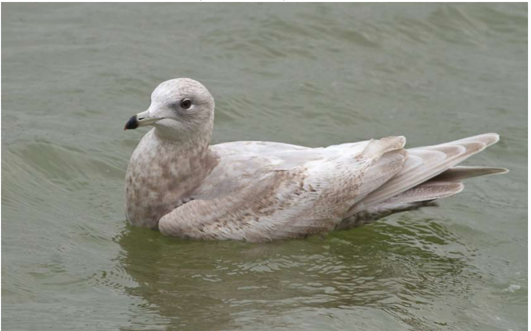
183 Kleine Burgemeester / Iceland Gull Larus glaucooides , tweede-winter, Den Oever, Noord-Holland, 22 januari 2012