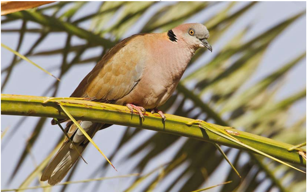
143 Mourning Collared Dove / Treurtortel Streptopelia decipiens , Abu Simbel, Egypt, 9 January 2012 ( Vincent Legrand )