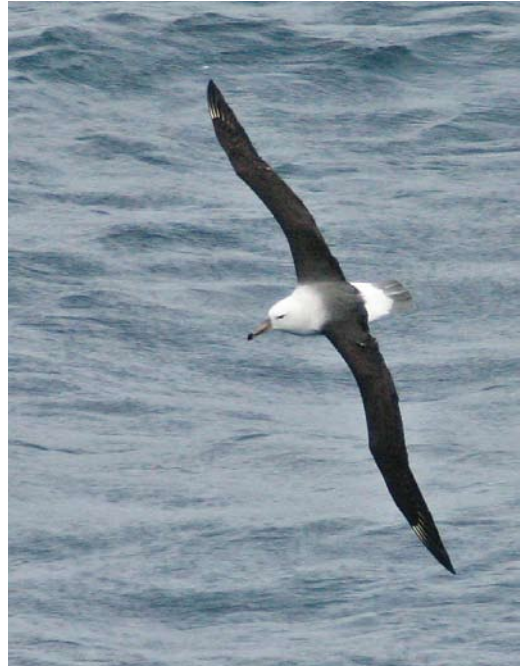
151-152 Black-browed Albatross / Wenkbrouwalbatros Thalassarche melanophris , at sea, c 184 nautical miles south-west of Mizen Head, Cork, Ireland, 29 February 2012 153 Kumlien's Gull / Kumliens Meeuw Larus glaucooides kumlieni , Zeebrugge, West-Vlaanderen, Belgium, 16 January 2012