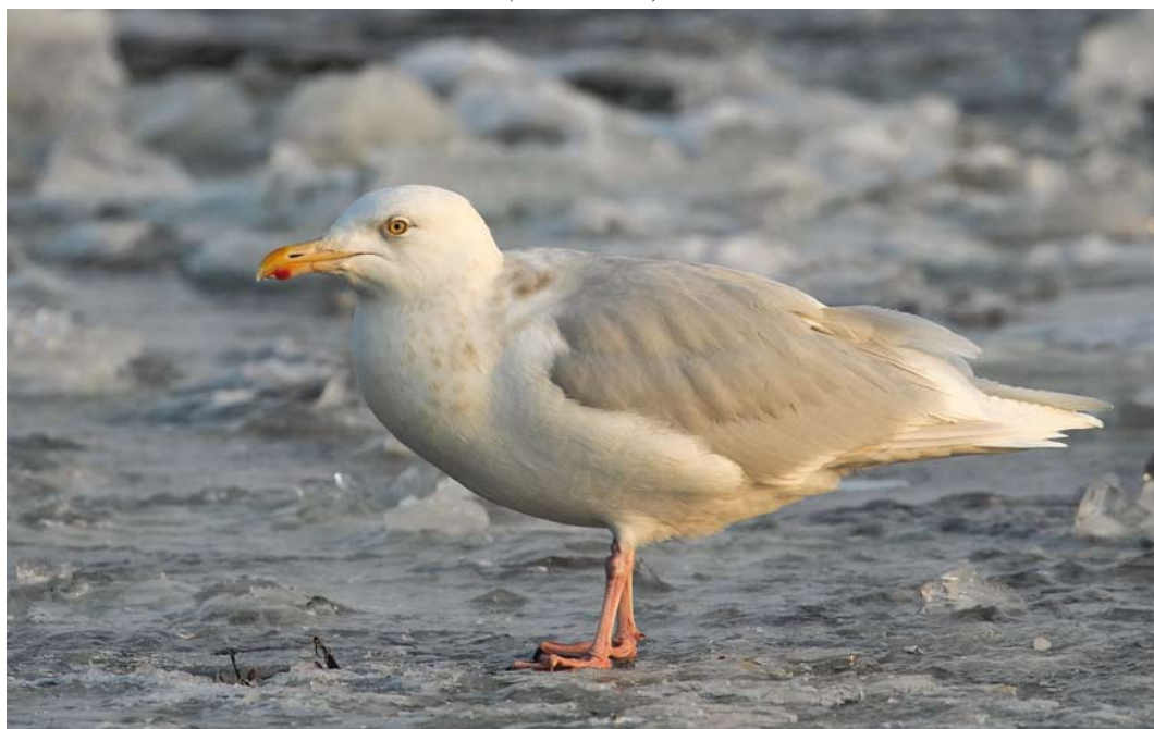
181 Grote Burgemeester / Glaucous Gull Larus hyperboreus , adult, Urk, Flevoland, 7 februari 2012