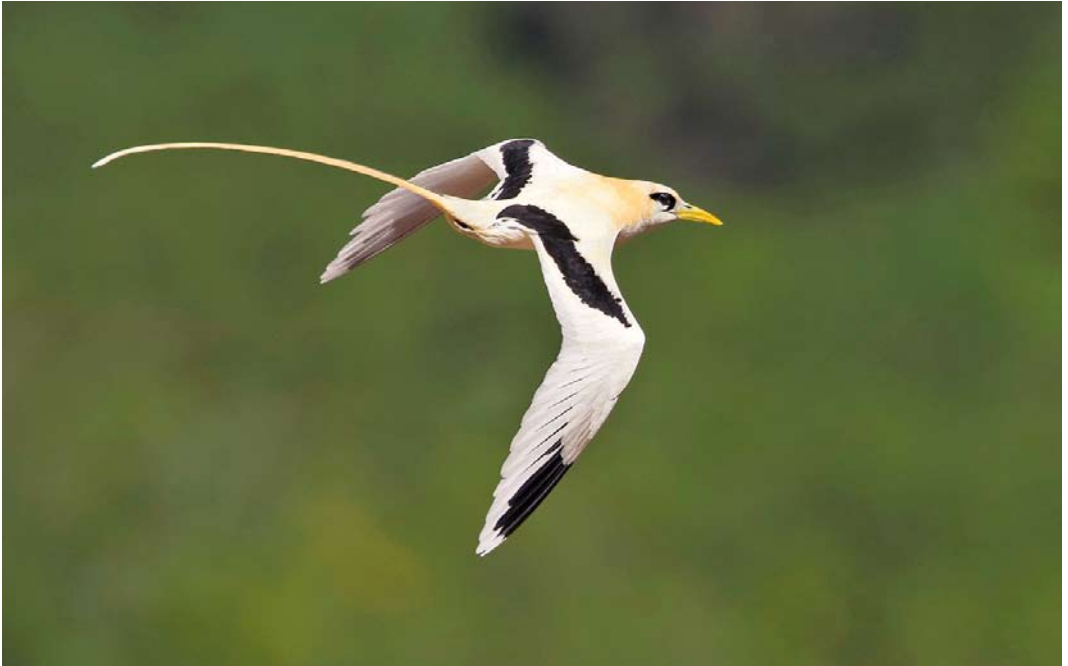
135 White-tailed Tropicbird / Witstaartkeerkringvogel Phaethon lepturus , adult, Fajãzinha, Flores, Azores, 15 October 2011 ( Vincent Legrand )