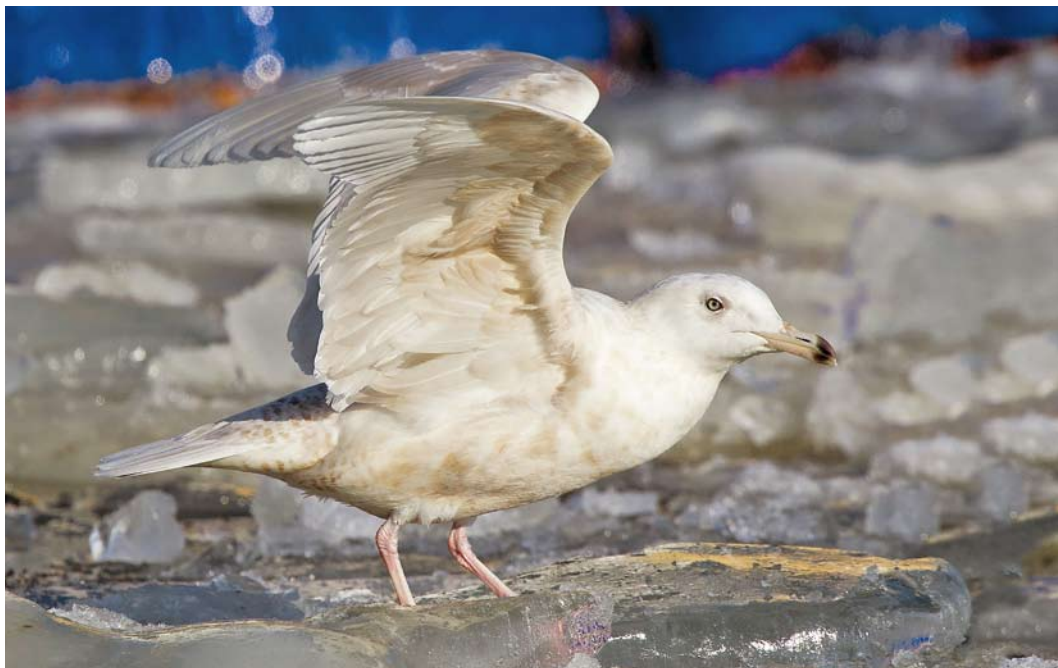
178 Grote Burgemeester / Glaucous Gull Larus hyperboreus , tweede-winter, Den Oever, Noord-Holland, 11 februari 2012 ( Inge van der Wulp )