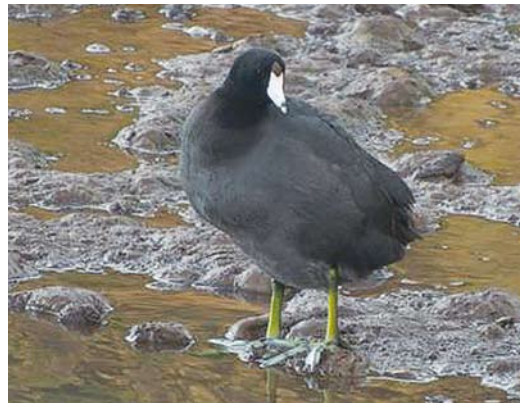
159 Black-throated Accentor / Zwartkeelheggenmus Prunella atrogularis , Gingen, Baden-Württemberg, Germany, 20 January 2012 160 Wallcreeper / Rotskruiper Tichodroma muraria , Sint Pietersberg, Maastricht, Limburg, Netherlands, 6 March 2012 161 Pine Bunting / Witkopgors Emberiza leucocephalos , male, with Yellowhammer / Geelgors E. citrinella , Gattererberg, Zillertal, Tirol, Austria, 9 March 2012 162 African Dunn's Lark / Afrikaanse Dunns Leeuwerik Eremalauda dunnii dunnii , Oued Jenna, Aousserd, Western Sahara, Morocco, 10 January 2012 163 Citrine Wagtail / Citroenkwikstaart Motacilla citreola , Aswan, Egypt, 5 February 2012 164 American Coot / Amerikaanse Meerkoet Fulica americana , Lugar de Baixo, Madeira, 20 January 2012