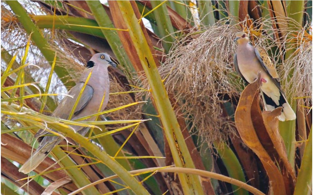
142 Mourning Collared Dove / Treurtortel Streptopelia decipiens (left), with European Turtle Dove / Zomertortel S turtur , Abu Simbel, Egypt, 7 May 2011