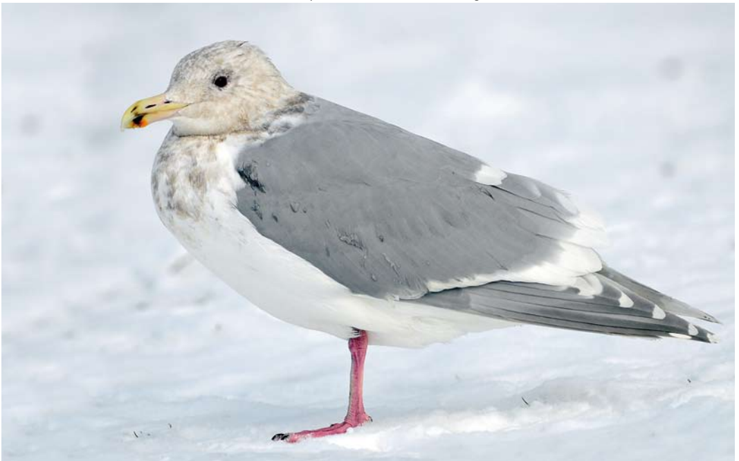
155 Glaucous-winged Gull / Beringmeeuw Larus glaucescens , adult, Århus, Nordjylland, Denmark, 3 February 2012 (Martin Gottschling)