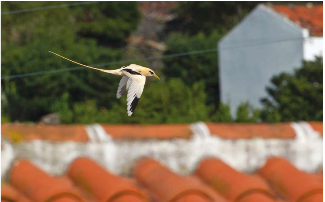
136 White-tailed Tropicbird / Witstaartkeerkringvogel Phaethon lepturus , adult, Fajãzinha, Flores, Azores, 15 October 2011 ( David Monticelli )