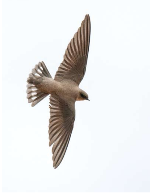
165 Paddyfield Warbler / Veldrietzanger Acrocephalus agricola , Pagham Harbour, West Sussex, England, 26 February 2012 166 Western Pale Crag Martin / Westelijke Vale Rotszwaluw Ptyonoprogne obsoleta presaharica , Oued Jenna, Aousserd, Western Sahara, Morocco, 10 January 2012 167 Pine Bunting / Witkopgors Emberiza leucocephalos , female, Kalanji, Tukums, Latvia, 29 January 2012