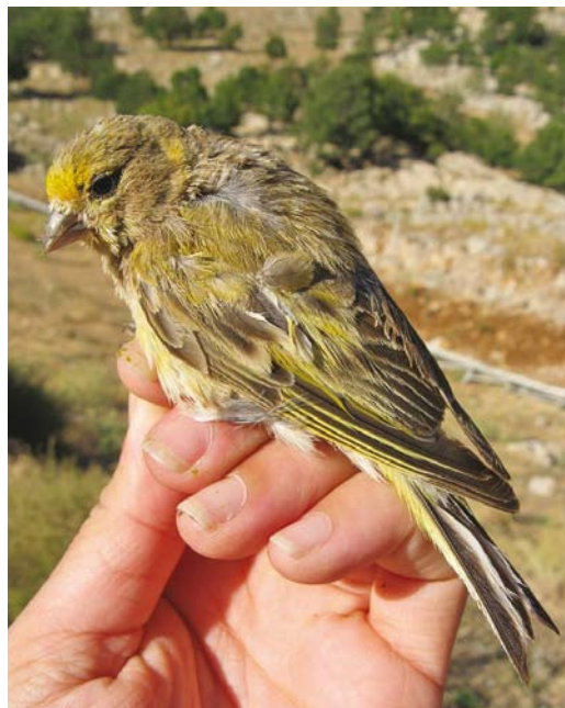
109 Syrian Serin / Syrische Kanarie Serinus syriacus , second calendar-year male, mount Hermon, Israel, 18 July 2008. Despite colourful appearance, this bird can be aged by retained juvenile alula feathers and by worn primaries.