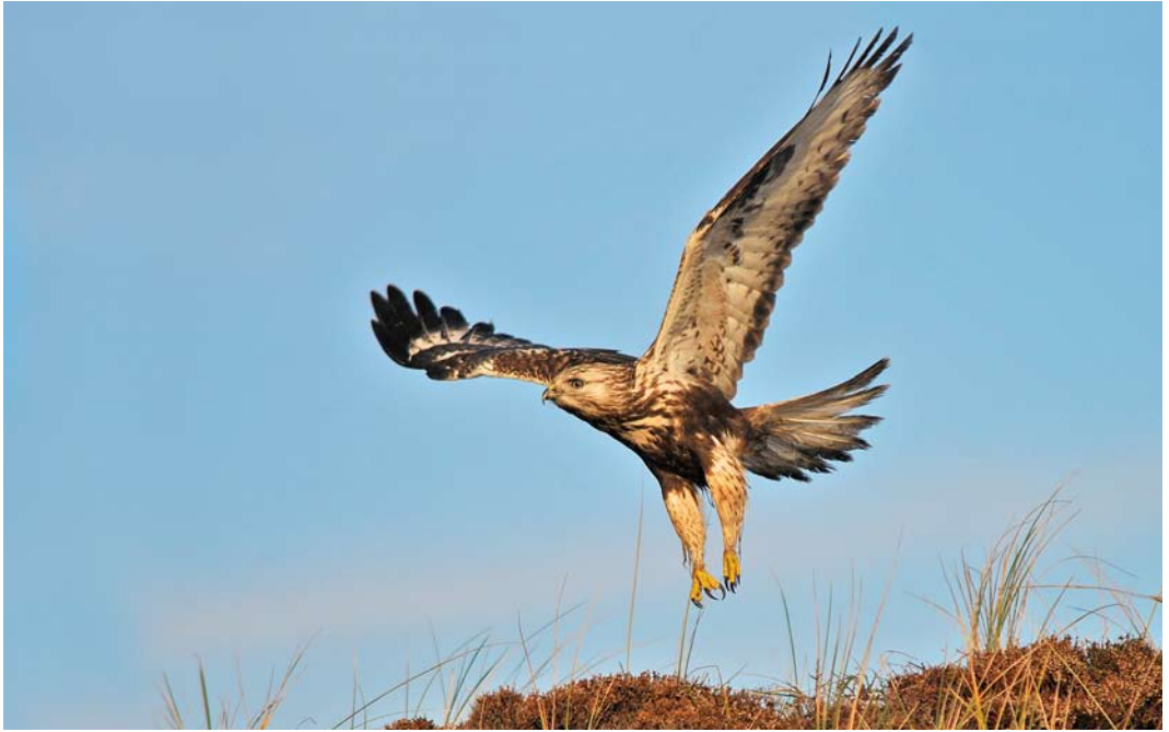
78 Ruigpootbuizerd / Rough-legged Buzzard Buteo lagopus , paal 12, Texel, Noord-Holland, 23 december 2011 (René Pop)