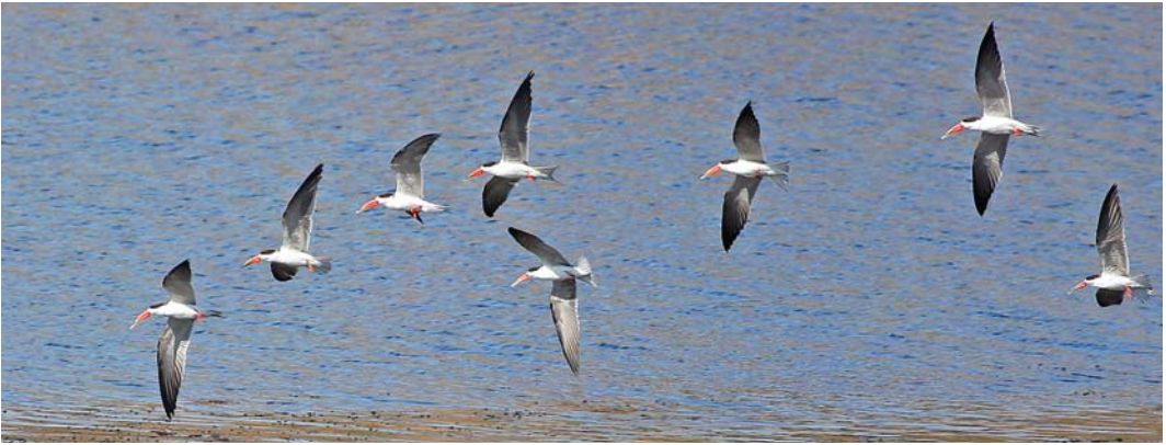
62 Allen's Gallinule / Afrikaans Purperhoen Porphyrio alleni , adult, St Julians, Malta, 24 December 2011 63 Western Sandpiper / Alaskastrandloper Calidris mauri , first-year, Cley, Norfolk, England, 28 December 2011 64 African Skimmers / Afrikaanse Schaarbekken Rynchops flavirostris , Kom Ombo, Egypt, 28 December 2011

33: 203, 2011). A first-year Western Sandpiper C mauri remained at Cley, Norfolk, England, from 28 November into January. The first-winter Long-toed Stint C subminuta at La Turballe, Loire-Atlantique, France from 6 November stayed until 20 December. A first-year Least Sandpiper C minutilla was foraging at Black Rock Strand, Kerry, Ireland, from 29 November to 19 December. A first-year Sharp-tailed Sandpiper C acuminata was present at Chew Valley Lake, Somerset, England, from 18 November to 16 December. The Wilson's Snipe Gallinago delicata on St Mary's, Scilly, England, since early October stayed into late December, while the 14th recorded in the Azores since the autumn was also found in December. The second Pin-tailed Snipe G stenura for Italy (and Europe) was present for a few days until at least 18 December near Siracusa, Sicily, and its identification could be confirmed by sonagrams. In the Azores, a Hudsonian Whimbrel Numenius hudsonicus was seen at Fajã dos Cubres, São Jorge, on 4 December. The last record of Slender-billed Curlew N tenuirostris for Poland on 7 October 1995 has been reconsidered and is now