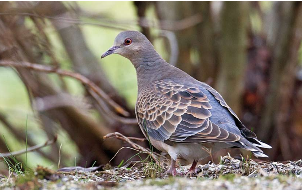
58 Rufous Turtle Dove / Meenatortel Streptopelia orientalis meena , first-year, Pello Nivanpää, Finland, 14 November 2011 (Micha Fager)