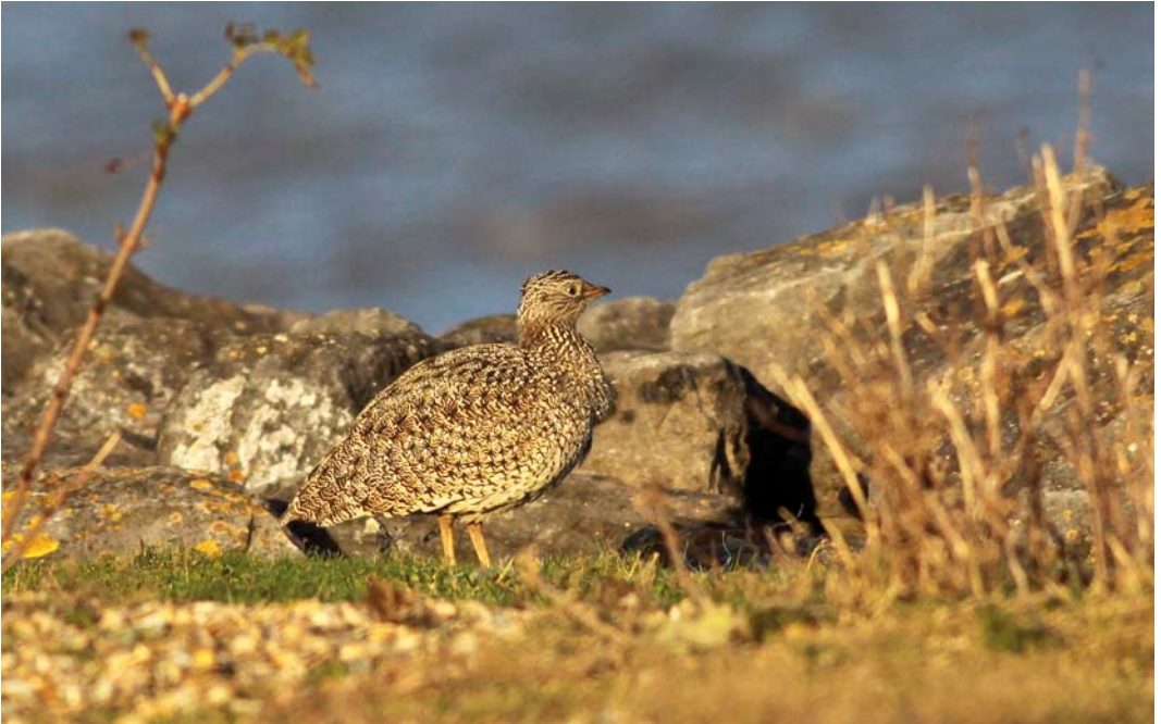
57 Little Bustard / Kleine Trap Tetrax tetrax , Verdrongen Land van Saeftinghe, Zeeland, Netherlands, 15 January 2012