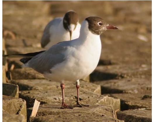
31 Black-headed Gull / Kokmeeuw Chroicocephalus ridibundus , Benthuizenplas, Zoetermeer, Zuid-Holland, Netherlands, 16 March 2010 (Benny Middendorp). Same bird as in plate 28 and 30. Note strong similarity in pattern of hood in the three different years.

measurements were taken: weight 294 g, wing length 306 mm, total head-and-bill length 82.7 mm, tarsus length 44.9 mm, and bill depth at gonys 8.8 mm. The bird was in full adult summer plumage and based on its measurements it was a male (Palomares et al 1997). The aluminium ring (figure 1) was replaced by a stainless steel ring (Arnhem 3.557.150) and the bird was released with a colour-ring 'white LCA' on the left tarsus. This colour-ring enabled Klaas van Dijk and RO to identify LCA on 12 other days between 5 and 29 May 2000, and again on 10 days between 8 May and 5 June 2001. In 2001, this bird was also in full adult summer plumage. Most observations were carried out when it was sitting on the beacon of Griend, in the centre of the breeding colony (plate 32), but we did not try to locate its nest exactly. However, it was seen landing near the beacon, and it showed territorial behaviour on the landing