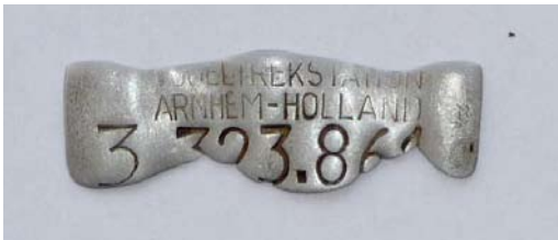
FIGURE 3 Aluminium ring Arnhem 3.323.861 from Black-headed Gull Chroicocephalus ridibundus , 18 years and 7 months after ringing on tarsus. Ringed as chick near Oostzaan, Noord-Holland, Netherlands, in June 1980, last observation in Amsterdam, Noord-Holland, on 1 January 2006.

35 Aluminium ring Arnhem 3.431.752 on tarsus of Black-headed Gull / Kokmeeuw Chroicocephalus ridibundus, 23 years and 5 months after ringing, Leiden, Zuid-Holland, Netherlands, 13 November 2011. Same bird as in plate 36.