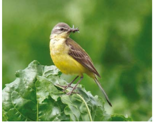
117 Gele Kwikstaart / Blue-headed Wagtail Motacilla flava , vrouwtje, Zeewolde, Flevoland, 21 juli 2011 (Roy Slaterus). Vrouwtje van gemengd broedpaar.

was: niet alleen ging het om het c 33e geval van Citroenkwikstaart (28 gevallen tot en met 2010) maar bovendien om het eerste broedgeval. In de daaropvolgende dagen werd vastgesteld dat de vogel gepaard was met een vrouwtje Gele Kwikstaart M flava en dat ze samen ten minste drie jongen grootbrachten. De plek was niet vrij toegankelijk en daarom werd besloten om het nieuws niet uitgebreid te verspreiden. In dit artikel worden de determinatie van de Citroenkwikstaart en het gemengde broedgeval besproken.