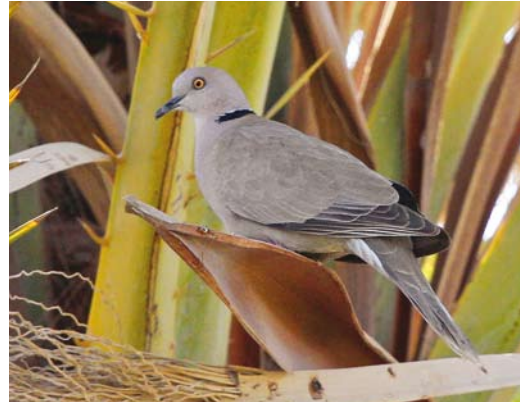
140-141 Mourning Collared Dove / Treurtortel Streptopelia decipiens , Abu Simbel, Egypt, 29 December 2010

sounded again, a 'collared dove' performed a display flight which was repeated after c 10 min. At that moment, we heard another individual making the same sound and soon both doves were clearly visible and KDR managed to obtain some photographs. We noted that both birds were unringed.