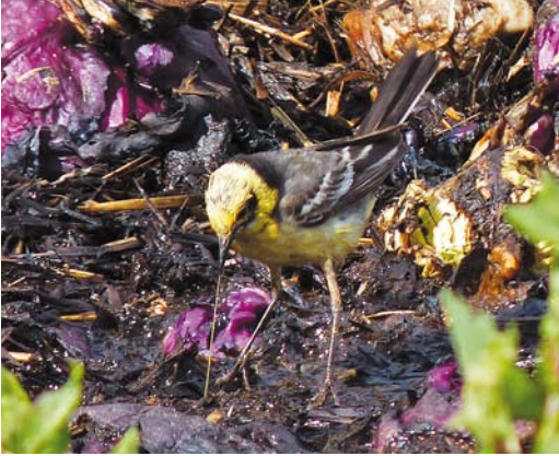
116 Citroenkwikstaart / Citrine Wagtail Motacilla citreola , eerste-zomer mannetje, Zeewolde, Flevoland, 17 juli 2011 (André van den Berg)