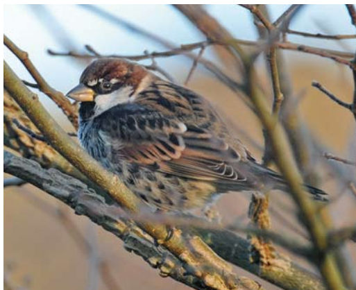
75 Spanish Sparrow / Spaanse Mus Passer hispaniolensis , male, Calshot, Hampshire, England, 13 January 2012