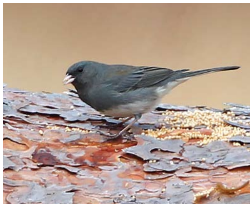
76 Dark-eyed Junco / Grijsje Junco Junco hyemalis , Hawkhill Inclosure, Beaulieu, Hampshire, England, 7 January 2012

hybrid between Collared x European Pied Flycatcher F. albicollis x hypoleuca based on a partial neck collar and other intermediate characters, turned out to be a pure European Pied; therefore, it is suggested that a neck collar may be a shared ancestral character of pied flycatcher species occasionally expressed in populations that normally lack it (J Ornithol 152: 1069-1073, 2011). This example shows that certain plumage features may not always be as diagnostic as assumed; for a few other examples of presumed atavism in WP birds see, eg, Dutch Birding 5: 26-27, 1983.