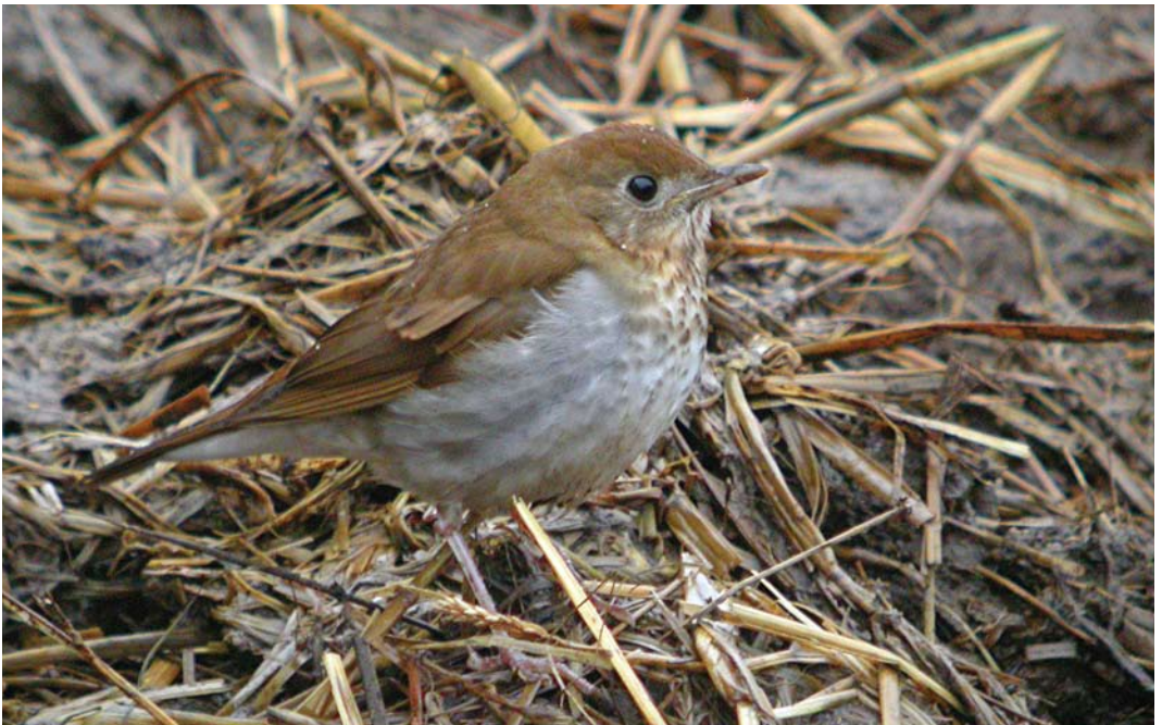
74 Veery / Veery Catharus fuscescens , Muck, Highland, Scotland, 18 November 2011 (Steve Nuttall)