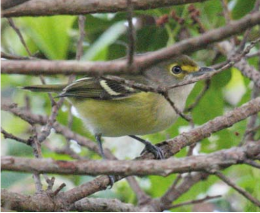
43 White-eyed Vireo / Witoogvireo Vireo griseus , first-year, Ribeira da Ponte, Corvo, Azores, 18 October 2009 (Edward Vercruyse)