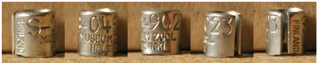
FIGURE 6 Stainless steel ring Helsinki S-049023 of Black-headed Gull Chroicocephalus ridibundus , 30 years and 8 months after ringing on tarsus (Benny Middendorp). Found dead near Monster, Zuid-Holland, Netherlands (record 4 in table 1), collection J van Kruijssen.

as well, with an annual survival of adults of 90% (Prévoit-Julliard et al 1998). During a long-term study in London, England, Gibson (2011) saw 30 individuals of over 20 years old, and 28 breeding birds out of 109 ringed birds (26%) on Griend reached an age of at least 15 years. Most had been ringed as adult, so their real age might even be (much) higher. We have not investigated sex-biased wear and loss of rings but we do not rule out that this also occurs (see Coulson (1976) for