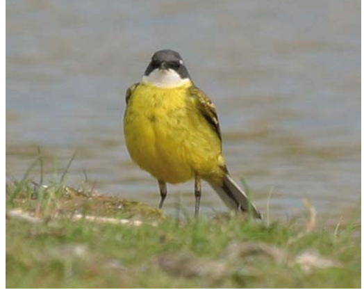
39-40 Witkeelkwikstaart / White-throated Wagtail Motacilla cinereocapilla , mannetje, Makkum, Friesland, 3 mei 2004 (Leo / R Boon/Cursorius)

GEDRAG Langdurig verblijvend in en nabij kort gemaaid vochtig rietmoeras. Tekenen van territoriaal gedrag tonend, waarbij steeds op vaste delen van rietveld hoge rietstengels bezettend, waar vanaf met geregelde tussenpozen roepend. Tijdens gehele verblijf erg plaatstrouw. Interactie met andere kwikstaarten of baltsgedrag richting vrouwtje niet vastgesteld.