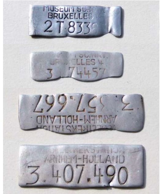
FIGURE 5 Aluminium rings removed from four Black-headed Gulls Chroicocephalus ridibundus breeding on Griend, Friesland, Netherlands (upper three on tarsus, lower on tibia). All trapped on nest and ring replaced by stainless steel ring, Arnhem 3.357.667 upside down; see text for details. Note irregular scalloping of lower edge.