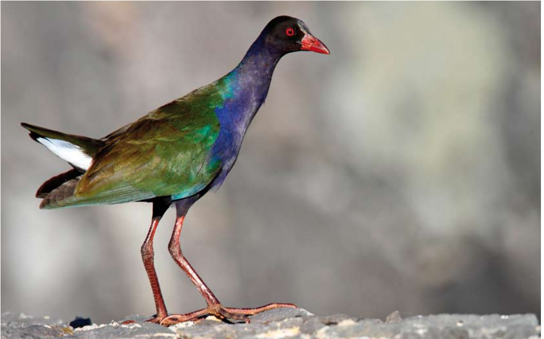
55 Allen's Gallinule / Afrikaans Purperhoen Porphyrio alleni , adult, Tías, Lanzarote, Canary Islands, 4 January 2012 ( Juan Sagardía Pradera )