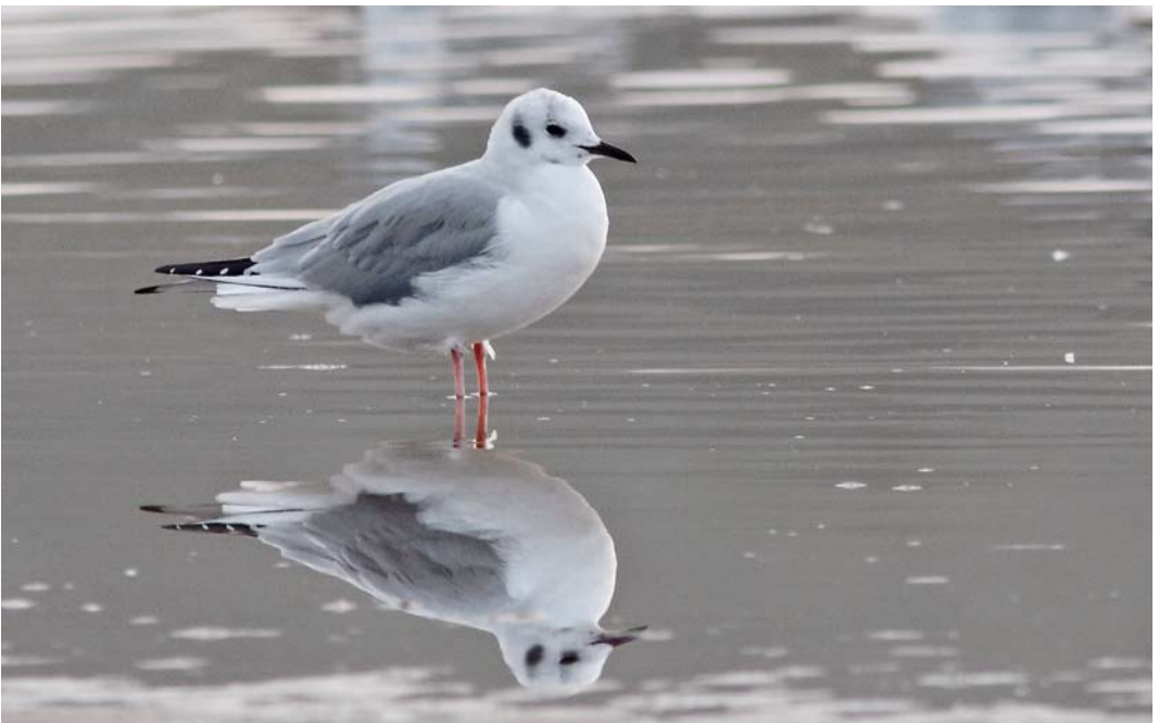
66 Bonaparte's Gull / Kleine Kokmeeuw Chroicocephalus philadelphia , Hirtshals, Nordjylland, Denmark, November 2011 ( Henrik Brandt )