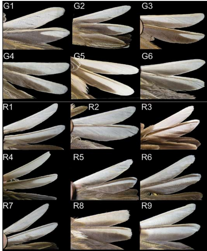
FIGURE 2 Variation in outermost tail-feathers of Richard's Pipit Anthus richardi (R) and Blyth's Pipit A. godlewskii (G) (David Vieites). G1-6 A. godlewskii . R1-4 A. r. richardi . R5-6 atypical A. r. centralasiae . R7 A. r. ussuriensis . R8-9 A. r. sinensis . G1-4 show typical pattern of t5-6 in Blyth's, with some specimens having more white on t5 (G5-G6). R8-9 examples of Richard's where pattern and amount of white resemble atypical Blyth's of G5-G6.

Tail pattern is a supporting feature for separating Richard's Pipit and Blyth's Pipit but it should be used with care as there is a certain degree of overlap (Svensson 1992, cf van den Berg et al 1993). The pattern of the outer tail-feather (t6) and the outer web of the second outermost tail-feather (t5) in both species are similar, being mostly white, but with some birds showing a variable degree of brown. Figure 2 shows examples of the variation in t5-6 in both species from a large series of skins at Natural History Museum in Tring, England, and Museum für Naturkunde, Berlin, Germany. In Blyth's, the white on the inner web of t5 never extends to the base of the feather, unlike the most common pattern in Richard's. The variation on t5 and t6 in Richard's is substantial; t5 and t6 usually have much white, with a typical pattern on the