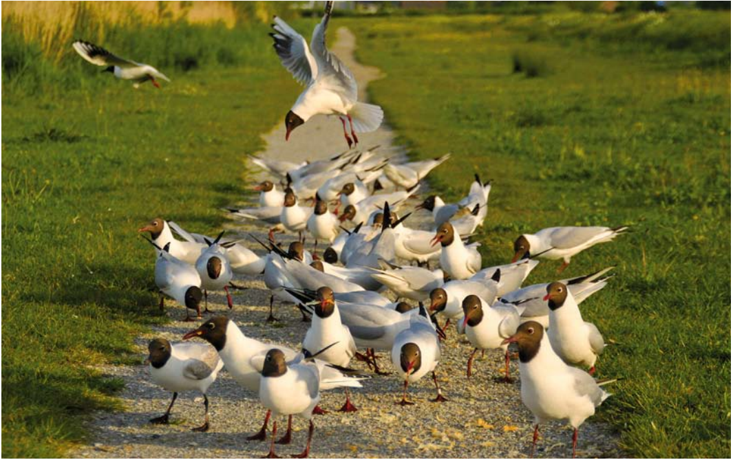
29 Black-headed Gulls / Kokmeeuwen Chroicocephalus ridibundus , Zoetermeer, Zuid-Holland, Netherlands, 20 May 2009. Birds of nearby Benthuiserplas breeding colony after being lured by food. World's oldest Black-headed Gull (plate 28) often recorded at this site.

food to an open area near the colony; see Middendorp (2009) for details. On that day, BM saw a ringed adult with an unfamiliar ring number and he could read the inscription (Arnhem 3.275.396) with his telescope. BM observed the bird at Benthuiserplas on 11 other days in 2009, two days in April, five in May, and four in June, with 22 June as the last day. The bird behaved like other local breeding birds but it attained no full adult summer plumage. Observations were not carried out inside the breeding colony, so it is unknown if it held a breeding territory or if it had a nest. The bird returned to Benthuiserplas on five days between 16 March and 8 April 2010, and again on 21 March 2011 (plate 28). Other sightings are lacking, despite extensive visits (at least twice a week by a few people) in the period March-July in 2010 and 2011, and there are no other records of this individual. BM was able to obtain several photographs and video images.