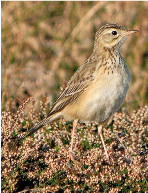
26-27 Blyth's Pipit / Mongoolse Pieper Anthus godlewskii , first-winter, Ouessant, Finistère, France, 14 October 2005. Note upright stance.

Richard's Pipit is on average larger, heavier, longer tailed and longer legged and with a more powerful bill than Blyth's Pipit. Some of these features, such as tail length relative to the body, are better judged in flight when, because of its shorter tail, Blyth's can recall one of the smaller pipits. Richard's tends to adopt a more upright posture than Blyth's, similar to a small thrush. On the other hand, Blyth's usually looks smaller, lighter, shorter tailed, more compact and better proportioned, and does not usually adopt the upright stance as frequently as Richard's. It is important to note that some Blyth's can occasionally show a very erect, upright posture, too, as in Richard's (plate 26-27).