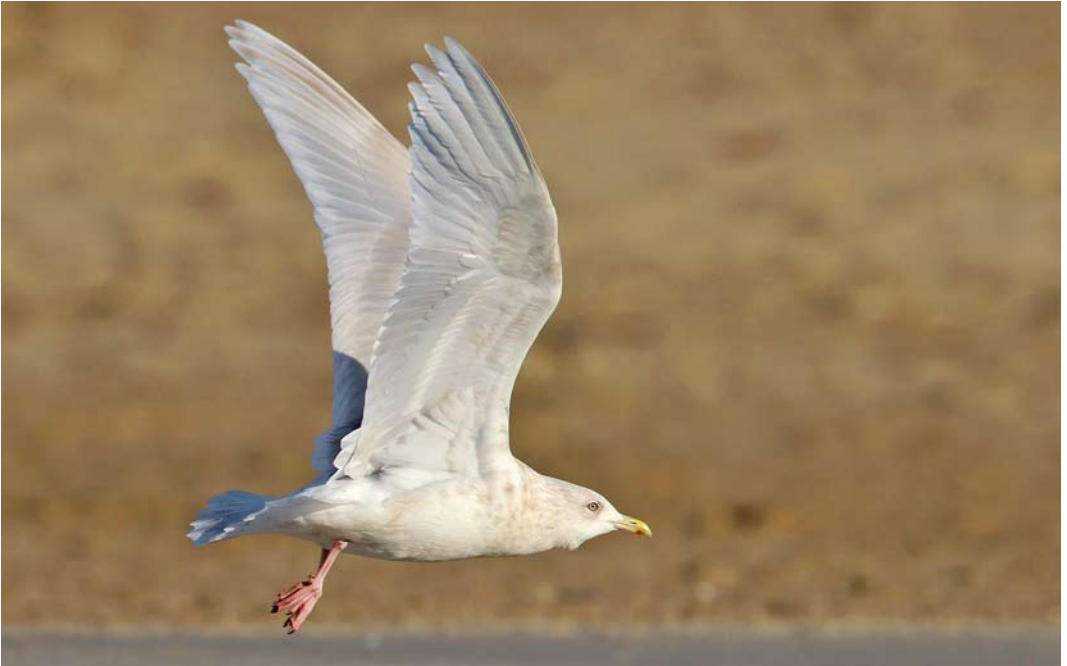
65 Kumlien's Gull / Kumliens Meeuw Larus glaucooides kumlieni , Zeebrugge, West-Vlaanderen, Belgium, 16 January 2012 ( Filip De Ruwe )