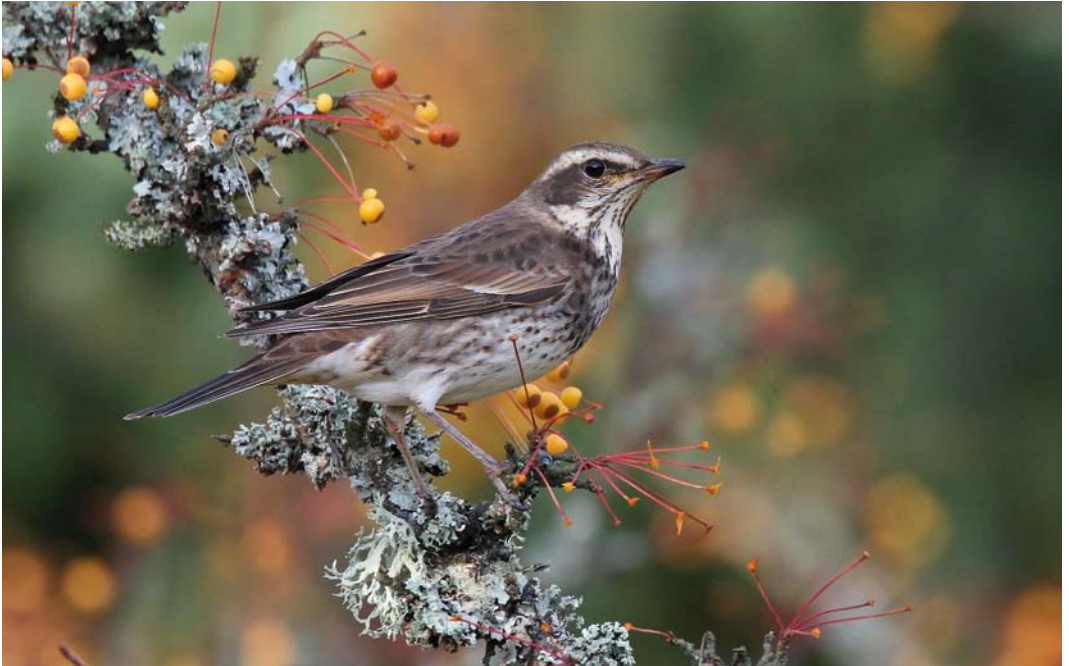
73 Dusky Thrush / Bruine Lijster Turdus eunomus , Säbyholm, Uppland, Sweden, 14 November 2011 (Johannes Rydström)