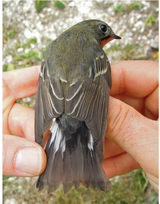
47-48 Mugimaki Flycatcher / Mugimakivliegenvanger Ficedula mugimaki , first-year male, Passo della Berga, Brescia, Italy, 6 October 2011