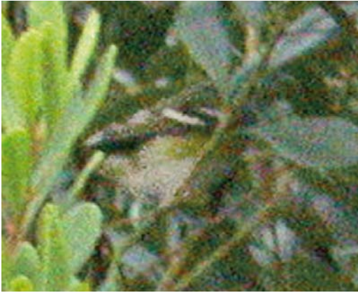
41 White-eyed Vireo / Witoogvireo Vireo griseus , first-year, Ribeira de Cancelas, Corvo, Azores, 22 October 2005