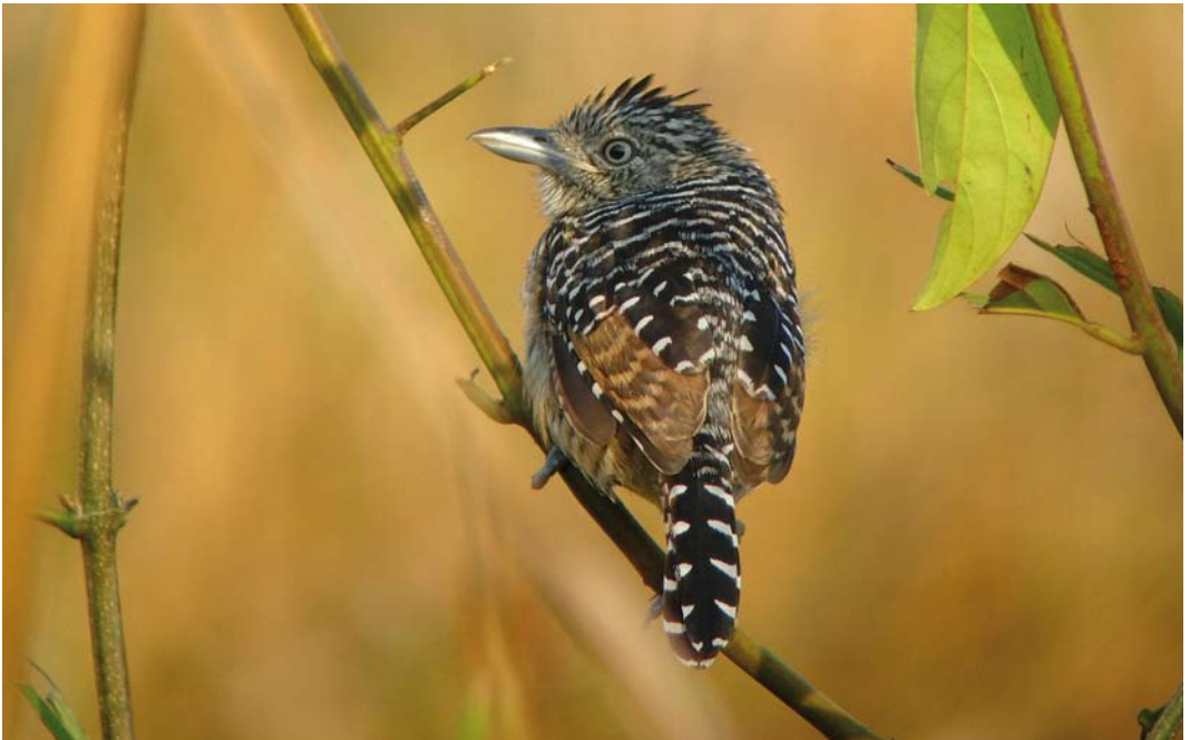
30 Barred Antshrike / Gebandeerde Mierklauwier Thamnophilus doliatus , immature male, 30 km south-west of Alta Floresta, Mato Grosso, Brazil, 6 September 2006 (Alexander C Lees)