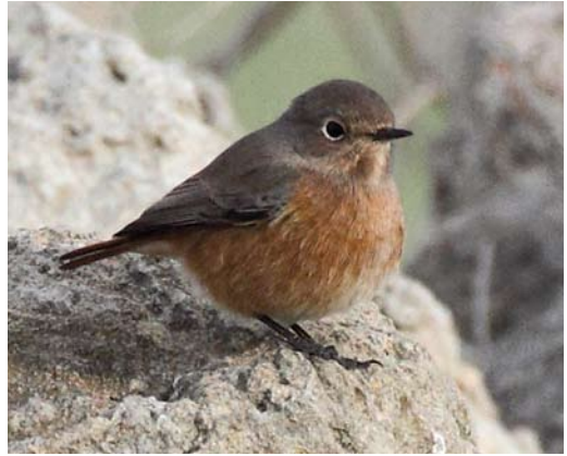
64 Moussier's Redstart / Diadeemroodstaart Phoenicurus moussieri , Malta, 13 December 2010 (Raymond Galea)