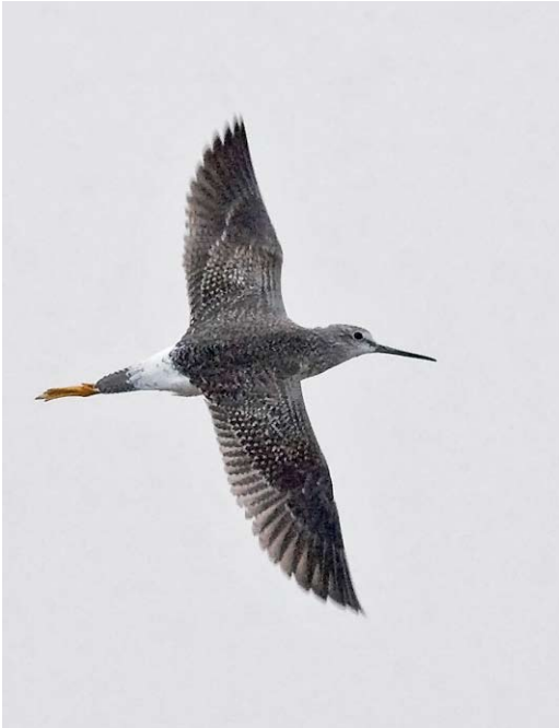
77 Grote Geelpootruiter / Greater Yellowlegs Tringa melanoleuca , eerstejaars, Wissenkerke, Zeeland, 10 december 2010