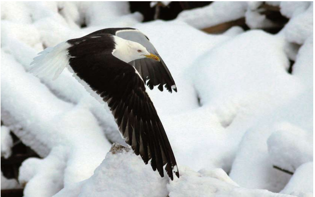
74 Vermoedelijke Baltische Mantelmeeuw / presumed Baltic Gull Larus fuscus fuscus , adult, Harselaar, Barneveld, Gelderland, 20 december 2010 (James Lidster)