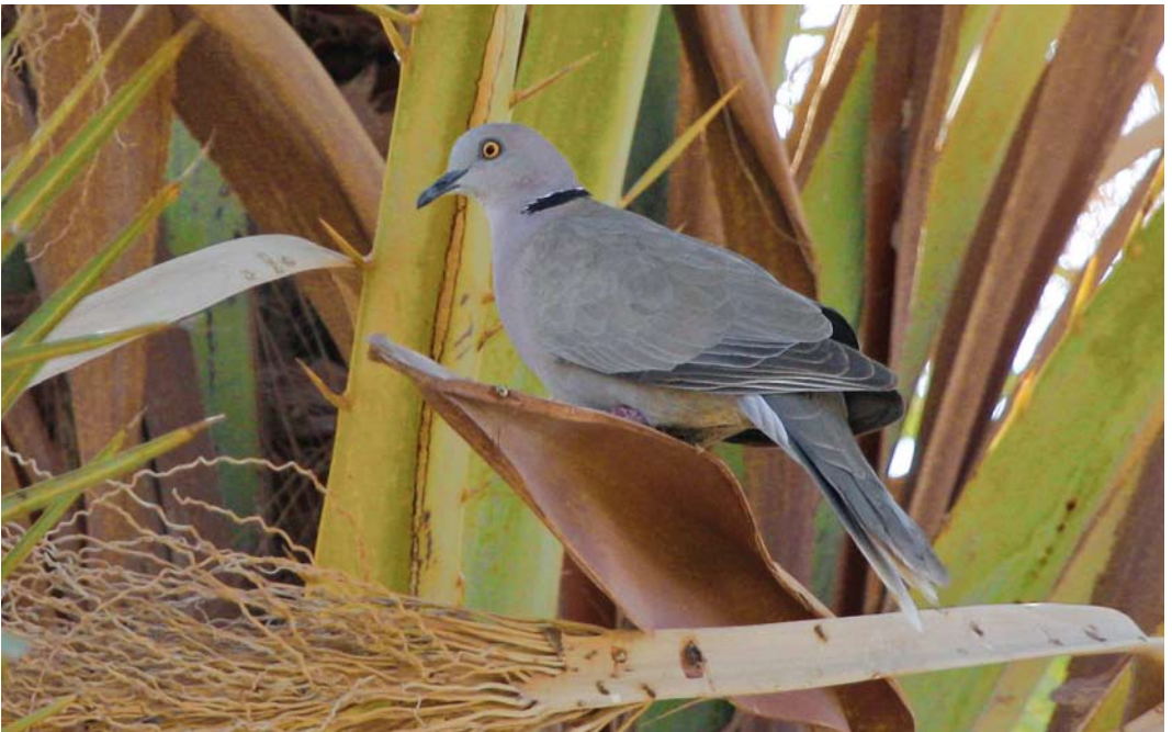
62 Mourning Collared Dove / Treurtortel Streptopelia decipiens , Abu Simbel, Egypt, 29 December 2010