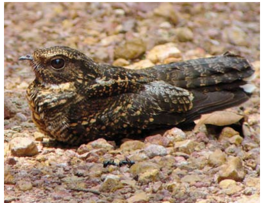
31 Pavonine Quetzal / Pauwquetzal Pharomachrus pavoninus , Rio Teles Pires, Alta Floresta, Mato Grosso, Brazil, 19 August 2006 (Alexander C Lees) 32 Cryptic Forest Falcon / Mintons Bosvalk Micrastur mintoni , Alta Floresta, Mato Grosso, Brazil, November 2006 (Hadoram Shirihai) 33 Black-girdled Barbet / Gordelbaardvogel Capito dayi , male, Alta Floresta, Mato Grosso, Brazil, November 2006 (Hadoram Shirihai) 34 Blackish Nightjar / Roetnachtzwaluw Caprimulgus nigrescens , Serra dos Caiabis, Alta Floresta, Mato Grosso, Brazil, 8 September 2006 (Alexander C Lees). Plate 32-33 contributed from forthcoming Photographic handbook to birds of the world (Jornvall & Shirihai, A&C Black).

river is characterized by the presence of 1000s of biologically impoverished small forest patches, along with large areas of undisturbed forest to the north. Forest patch size is the principal determinant of bird species richness but forest patch quality – the degree of anthropogenic disturbance – is also very important for the most forest-dependent species (Lees & Peres 2006, 2008b). Although these small patches may not be able to retain a full complement of species, they may still function as refuges for many plant and animal species. This permits future breathing space for conservationists to plan strategies for preventing species loss. Fragments may also act as sources for recolonization of proximate areas undergoing vegetative succession, particularly if agricultural land-uses become unprofitable in the future and facilitate resto-