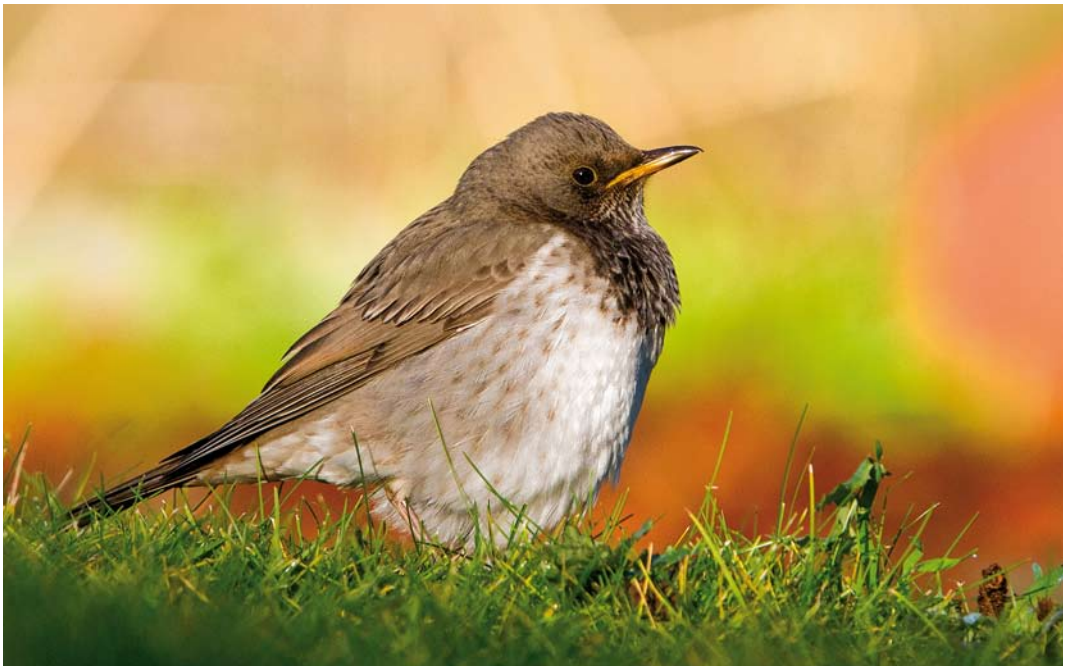
66 Black-throated Thrush / Zwartkeellijster Turdus atrogularis , first-winter male, Loppem, West-Vlaanderen, Belgium, 12 December 2010 (Edouard Dansette)