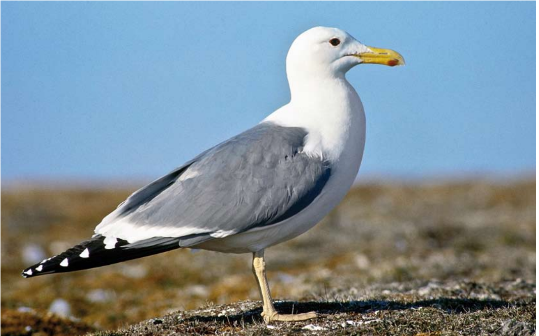
3 Taimyr Gull / Taimyrmeeuw Larus taimyrensis , adult in breeding colony, Bird Islands, Mys Vostochny, Taimyr, Russia, 8 July 1991