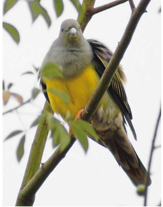
58 Striped Crake / Afrikaanse Porseleinhoen Aenigmatolimnas marginalis , female, Sierra Norte, Sevilla, Spain, 12 December 2010 ( Alberto Plata ) 59 Bruce's Green Pigeon / Waaliaduif Treron waalia , Luxor, Egypt, 3 January 2011 ( Steven R van der Veen ) 60 Pied-billed Grebe / Dikbekfuut Podilymbus podiceps , first-year, Greater Manchester, England, November 2010 ( Richard Stonier )