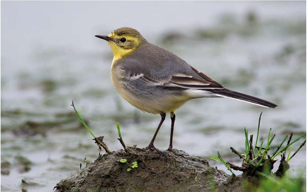
84 Citroenkwikstaart / Citrine Wagtail Motacilla citreola , adult, Klaas Hennepolder, Warmond, Zuid-Holland, 1 november 2010 ( Hans Overduin )