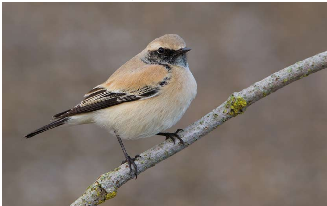
83 Woestijntapuit / Desert Wheatear Oenanthe deserti , mannetje, Stellendam, Zuid-Holland, 5 november 2010 (Martin van der Schalk)