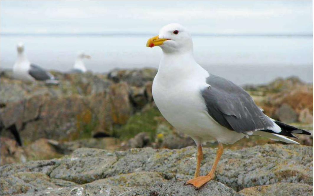
14 Taimyr Gull / Taimyrmeeuw Larus taimyrensis , adult in breeding colony, Mys Vostochny, Taimyr, Russia, 13 July 2007