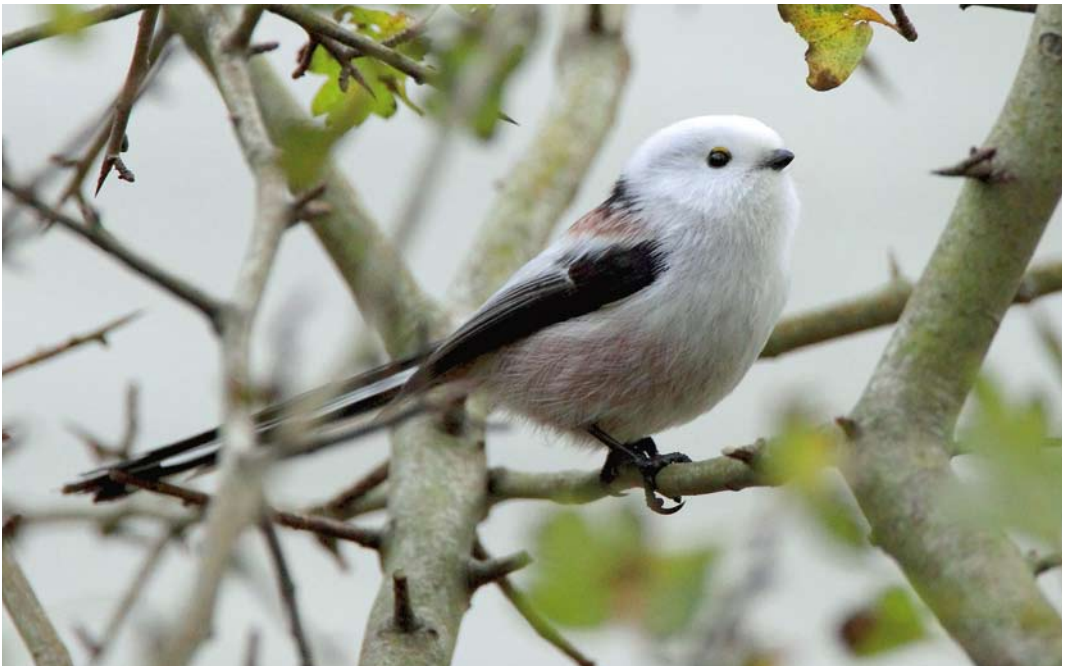
68 White-headed Long-tailed Tit / Witkopstaartmees Aegithalos caudatus caudatus , Ridderpark, Katwijk aan Zee, Zuid-Holland, Netherlands, 12 November 2010 (René van Rossum)