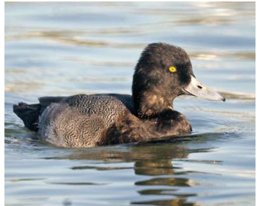
54 Northern Harrier / Amerikaanse Blauwe Kiekendief Circus cyaneus hudsonius , Thornham, Norfolk, England, 28 November 2010 55 Lanner Falcon / Lannervalk Falco biarmicus , Gageron, Camargue, Bouches-du-Rhône, France, 16 January 2011 56 Forster's Tern / Forsters Stern Sterna forsteri , first-year, Peniche, Portugal, 22 January 2011 57 Lesser Scaup / Kleine Topper Aythya affinis , adult male eclipse, Huningue, Haut-Rhin, France, October 2010

cies for the Netherlands was in Gelderland in 1996. In England, a genuine juvenile White-tailed Eagle Haliaeetus albicilla turned up in West Sussex on 11 December and flew to Hampshire the next day. The juvenile female Northern Harrier Circus cyaneus hudsonius at Tacumshin, Wexford, Ireland, remained through December as did a juvenile male between Holme and Blakeney, Norfolk, England; a third one was photographed at Kilcoole, Wicklow, Ireland, on 13 November ( Birding World 23: 509-523, 2010). In the Netherlands, 50 breeding pairs of Montagu's Harrier C. pygargus were counted in 2010 of which 45 in eastern Groningen. In southern Spain, an Atlas Long-legged Buzzard Buteo rufinus cirtensis at Los Barrios, Cádiz, on 9 January is considered to be the same individual seen during the past two years. The sixth Rough-legged Buzzard B. lagopus for Spain was photographed off Tarragona on 18 December. In the Netherlands (c 100) and France (at