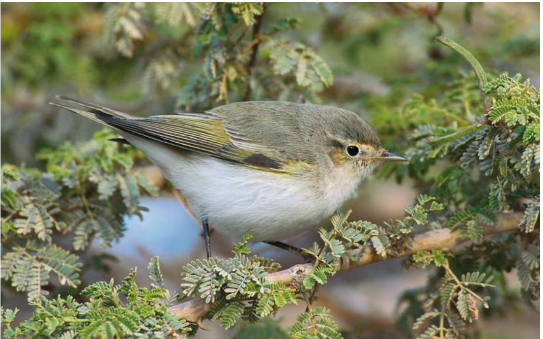
2 Eastern Bonelli's Warbler / Balkanbergfluitier Phylloscopus orientalis , Eilat, Israel, 26 March 2007