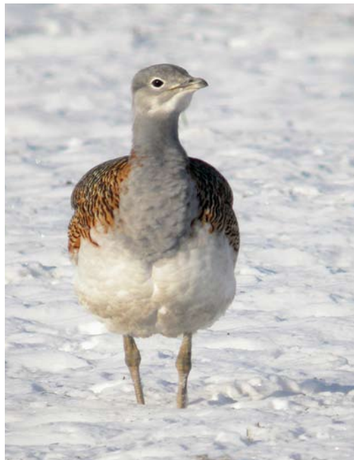
89 Grote Trap / Great Bustard Otis tarda , mannetje, Groesbeek, Gelderland, 24 december 2010 ( Jan Jacobs ) 90 Grote Trap / Great Bustard Otis tarda , mannetje, Hogerwaardpolder, Woensdrecht, Noord-Brabant, 25 december 2010 ( Mark Hoekstein ) 91 Grote Trap / Great Bustard Otis tarda , mannetje, Rilland, Zeeland, 25 december 2010 ( Jaap Denee )