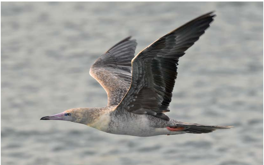
53 Red-footed Booby / Roodpootgent Sula sula , l'Estartit, Girona, Spain, 8 December 2010

involved 14 individuals. This winter, the best ever influx in decades of Barnacle Goose Branta leucopsis for Italy took place with 20-25 individuals, including a record flock of 12 photographed at Torrile, Parma; it was also a record winter for Red-breasted Goose B. ruficollis with more than five. In the USA, a limping Barnacle Goose in a flock of Canada Geese B. canadensis first seen at Orchard Beach, New York, on 26-27 November and then in Connecticut from 3 December into January had been ringed as a first-year on Islay, Scotland, on 13 November 2002 after which it was frequently seen until March 2005 (a parent and a sibling ringed on the same day are still regularly seen on Islay). In mid-December, in the Priyutnensky region of Kalmykia, north-west of the Caspian Sea in southern Russia, 300 to 1000 Red-breasted Geese and also a high number of Lesser White-fronted Geese A. erythropus , Little Bustards Tetrax tetrax and other species died due to freak weather conditions: snow with rain in -10°C, resulting in a 15 cm ice layer making the birds unable to move; it is the first instance of such mass mortality in the region and it is likely that more birds perished in areas not visited by people. One of the largest influxes ever of Pale-bellied Brent Goose B. hrota for the Netherlands occurred in December-January with several large flocks of more than 150 mostly in the Wadden Sea region and the south-west (the largest influx