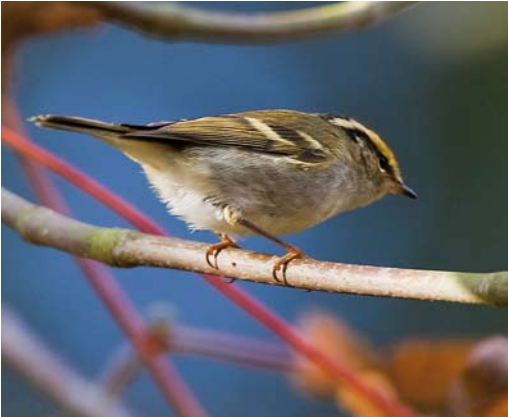
86 Pallas' Boszanger / Pallas's Warbler Phylloscopus proregulus , Ganzenhoek, Wassenaarse Slag, Zuid-Holland, 30 oktober 2010 (Menno van Duijn)