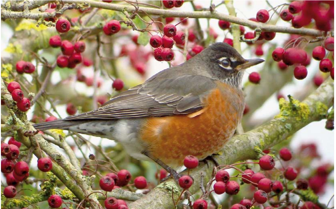
65 American Robin / Roodborstlijster Turdus migratorius , first-winter male, Turf, Devon, England, 11 November 2010