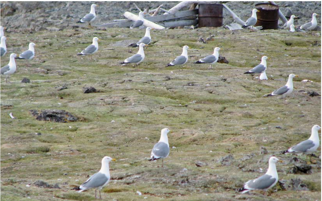
15 Taimyr Gulls / Taimyrmeeuwen Larus taimyrensis , adults in breeding colony, Mys Vostochny, Taimyr, Russia, 17 July 2008 ( Laurent Demongin )