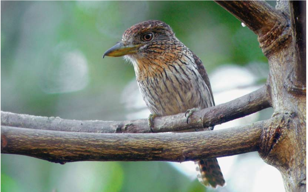
29 Striolated Puffbird / Gestreepte Baardkoekoek Nystalus striolatus , Rio Cristalino, Alta Floresta, Mato Grosso, Brazil, 18 July 2006 (Alexander C Lees)