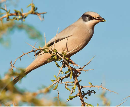
63 Hypocolius / Zijdestaart Hypocolius ampelinus , male, Cape Greco, Cyprus, 4 December 2010