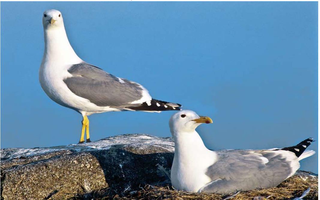
4 Taimyr Gulls / Taimyrmeeuwen Larus taimyrensis , breeding pair, Bird Islands, Mys Vostochny, Taimyr, Russia, 8 July 1991 ( Jan van de Kam )