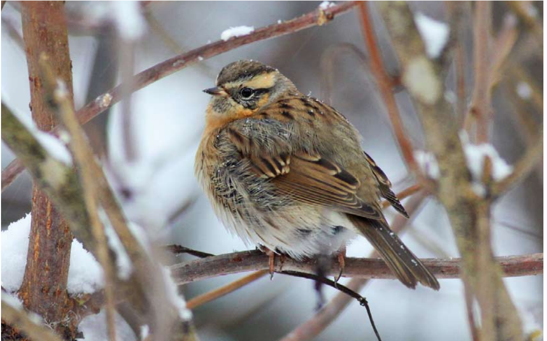
67 Black-throated Accentor / Zwartkeelheggenmus Prunella atrogularis Pori, Pihlava, Finland, 4 December 2010 (Stuart Piner)