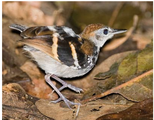
35 Bare-eyed Antbird / Naaktoogmiervogel Rhegmatorhina gymnops , Alta Floresta, Mato Grosso, Brazil, November 2006 ( Hadoram Shirihai ). Contributed from forthcoming Photographic handbook to birds of the world (Jornvall & Shirihai, A&C Black). 36 White-browed Antbird / Witbrauwmierkruiper Mymoborus leucophrys , male, Rio Cristalino, Alta Floresta, Mato Grosso, Brazil, 15 August 2006 ( Alexander C Lees ) 37 Glossy Antshrike / Rouwmierkluwier Sakesphorus luctuosus , male, Rio Cristalino, Mato Grosso, Brazil, December 2006 ( Arthur Grosset ) 38 Banded Antbird / Bandrugmiervogel Dichrozona cincta , Rio Cristalino, Alta Floresta, Mato Grosso, Brazil, December 2006 ( Arthur Grosset )

not an independent variable and is correlated with other traits such as habitat specificity, body mass, and geographic distribution (Terborgh 1974, Kattan 1992). Some of the species with small geographic range sizes in the Alta Floresta landscape are among the most threatened (Lees & Peres 2008b). It has been hypothesised that species with large home range sizes may also be extra-vulnerable to forest fragmentation effects (eg, Woodroffe & Ginsberg 1998), however there exists considerable variance in patch size sensitivity within and across families in guilds (Lees & Peres 2008b). Generalist species with large home range sizes may be able to exploit multiple small forest patches as long as they have good dispersal abilities, whilst some specialist species, even those with small home range sizes might be absent from the same patches