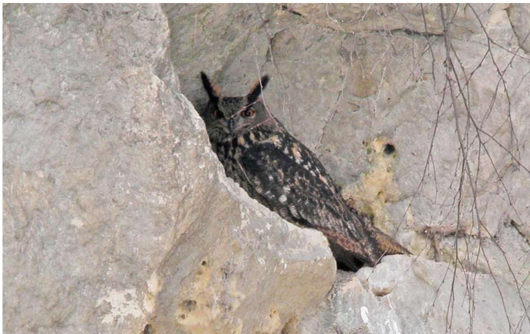
71 Oehoe / Eurasian Eagle Owl Bubo bubo , Sint Pietersberg, Maastricht, Limburg, 4 december 2010 (Wilma van Holten)