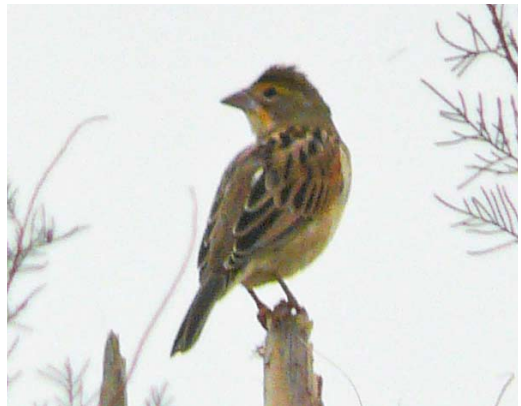
49 Dickcissel / Dickcissel Spiza americana , Ponta Delgado, Flores, Azores, 6 November 2009 (Nico de Vries). The first bird. 50-52 Dickcissel / Dickcissel Spiza americana , Ponta Delgado, Flores, Azores, 6 November 2009 (Nico de Vries). The second bird.

domestic cat disturbed the flock, most birds flew up and many perched on stone walls. I scanned the walls with my 10x40 binoculars and, at a distance of less than 10 m, noticed a small dark bird with a white belly, a relatively long tail, conspicuous white outer tail-feathers and a small pale bill. I had never seen such a bird before and therefore assumed it was a Nearctic songbird. The cat was still around and my camera still in the bag, giving me some worries... As feared, the birds were disturbed, not only by the cat but also by two tractors. The unknown bird flew off to quieter fields further away. Despite searching for it the rest of the morning, I could not relocate it. I made a few notes and a field sketch in my notebook and then quickly returned to our temporary home at Guada, where I consulted my field guide (National Geographic Society 2002). I quickly found the illustration of a male Dark-eyed Junco Junco hyemalis , which per-