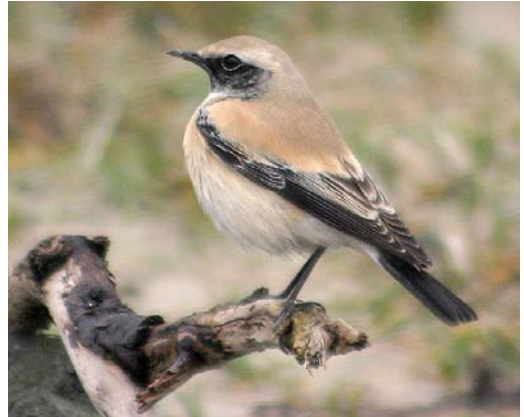
87 Woestijntapuit / Desert Wheatear Oenanthe deserti , mannetje, Stellendam, Zuid-Holland, 5 november 2010 (Anita de Bruijn)