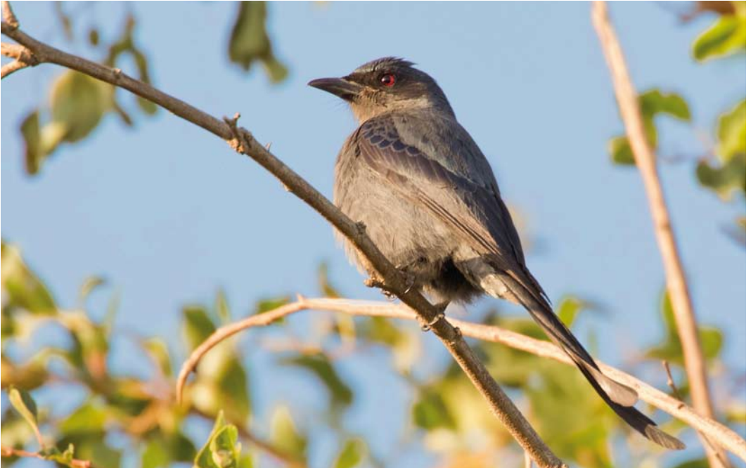
61 Ashy Drongo / Grijze Drongo Dicrurus leucophaeus , Jahra farms, Kuwait, 1 January 2011 (David Monticelli)