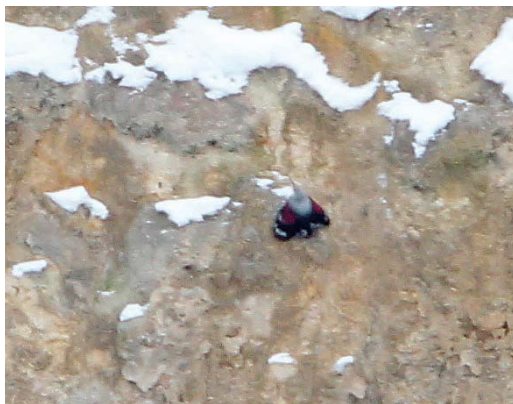
45 Rotskruiper / Wallcreeper Tichodroma muraria , Sint Pietersberg, Maastricht, Limburg, 4 december 2010 (Martin van der Schalk)