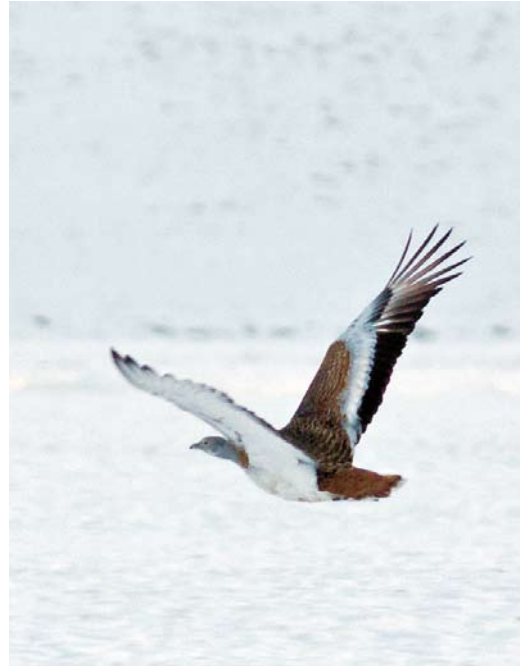
78 Grote Trap / Great Bustard Otis tarda , mannetje, Rilland, Zeeland, 25 december 2010 (Garry Bakker)