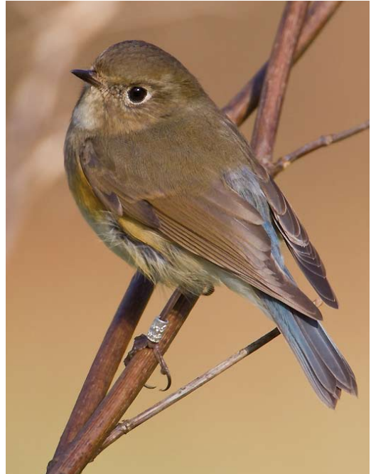
69 Red-flanked Bluetail / Blauwstaart Tarsiger cyanurus , Sant Feliu de Buixalleu, Girona, Spain, 4 January 2011 (Rafael Armada)

rote, the Bobolink Dolichonyx oryzivorus first seen on 21 October was still present on 25 December.