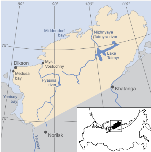
FIGURE 1 Map of Taimyr peninsula, central Siberia, Russia

coveries, both of birds which had migrated in a south-easterly direction towards the Pacific. Del Hoyo et al (1996) indicate that Taimyr Gulls spend the winter in the same area as shown by Cramp & Simmons (1983) but they state that birds breeding on eastern Taimyr winter along the north-western Pacific as well.