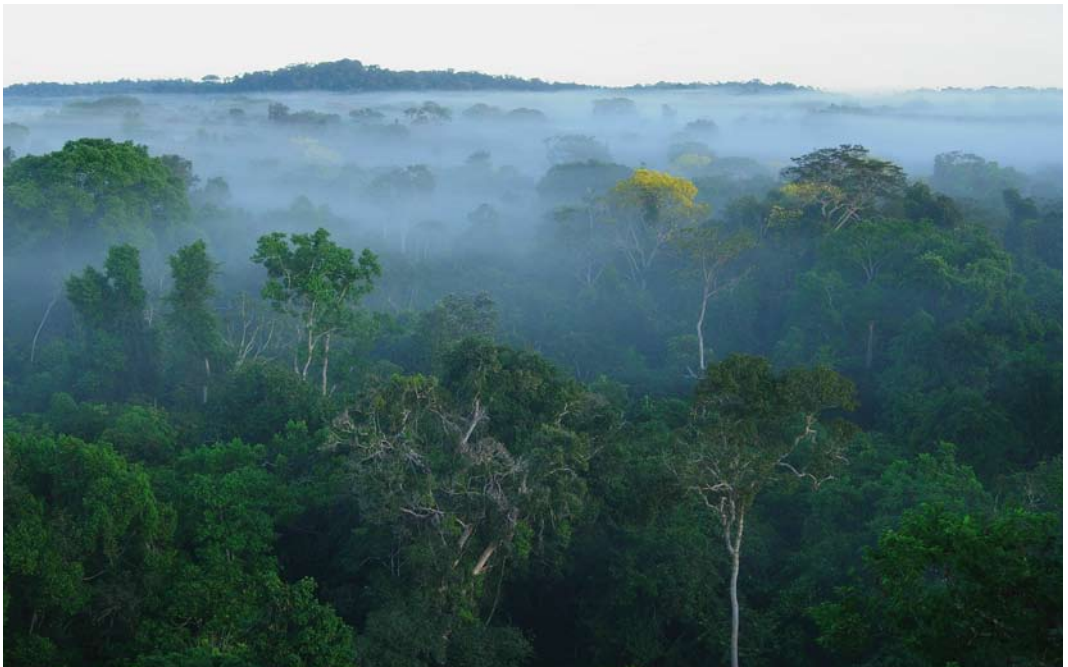
16 View from canopy tower at Cristalino Jungle Lodge, Rio Cristalino, Alta Floresta, Mato Grosso, Brazil, 28 May 2005 (Alexander C Lees)

Brazil, the world's fifth largest country, is huge (c 8.5 million km 2 ), covering almost 50% of the land surface of South America. Brazil is one of the richest birding countries in the world, with a list of