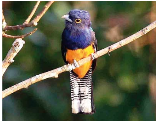
39 Tooth-billed Wren / Amazonewinterkoning Odontorchilus cinereus , Tapajós National Forest, Pará, Brazil, 10 December 2010 (Alexander C Lees) 40 Yellow-shouldered Grosbeak / Geelschouderkardinaal Parkerthraustes humeralis , Tapajós National Forest, Pará, Brazil, 10 December 2010 (Alexander C Lees) 41 Spangled Cotinga / Halsbandcotinga Cotinga cayana , immature male, Rio Cristalino, Alta Floresta, Mato Grosso, Brazil, 24 September 2005 (Alexander C Lees) 42 Paradise Jacamar / Paradijsglansvogel Galbula dea , Alta Floresta, Mato Grosso, Brazil, November 2006 (Hadoram Shirihai) 43 Musician Wren / Orpheuswinterkoning Cyphorinus arada , Alta Floresta, Mato Grosso, Brazil, November 2006 (Hadoram Shirihai) 44 Violaceous Trogon / Violette Trogon Trogon violaceus , Alta Floresta, Brazil, Mato Grosso, November 2006 (Hadoram Shirihai). Plate 42-44 contributed from forthcoming Photographic handbook to birds of the world (Jornvall & Shirihai, A&C Black).