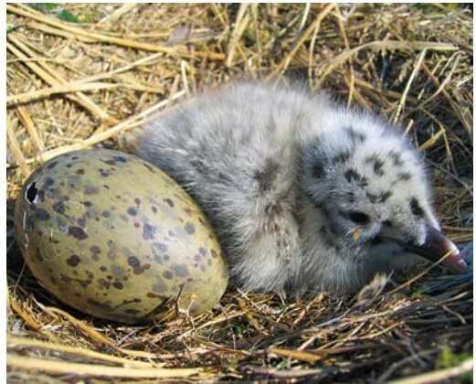
10 Taimyr Gull / Taimyrmeeuw Larus taimyrensis in breeding colony, Mys Vostochny, Taimyr, Russia, 22 June 2005 11 Taimyr Gull / Taimyrmeeuw Larus taimyrensis , adult in breeding colony, Mys Vostochny, Taimyr, Russia, 17 July 2008 12 Taimyr Gull / Taimyrmeeuw Larus taimyrensis , adult trapped on nest, Oleni islands, Medusa bay, Taimyr, Russia, 25 June 2001. Record 7 in appendix 1. 13 Taimyr Gull / Taimyrmeeuw Larus taimyrensis , egg and chick, Bird Islands, Mys Vostochny, Taimyr, Russia, 10 July 2005