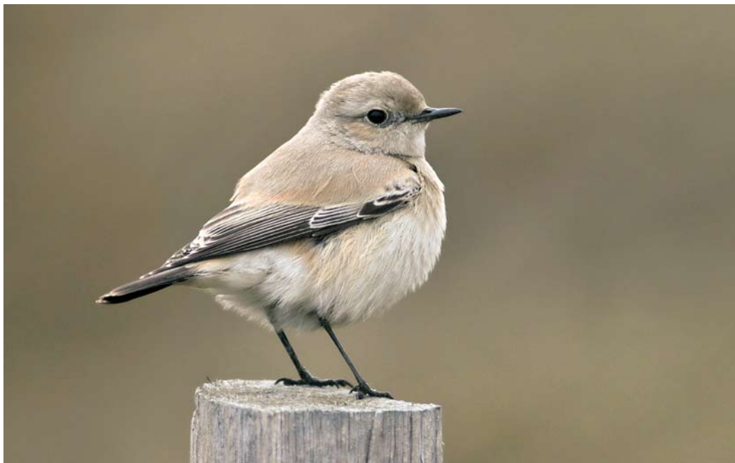
82 Woestijntapuit / Desert Wheatear Oenanthe deserti , vrouwtje, Camperduin, Noord-Holland, 5 november 2010