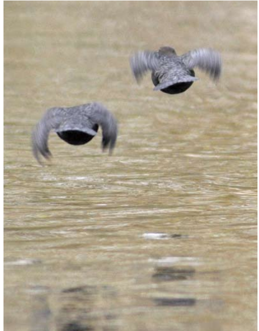
79 Zwartbuikwaterspreeuw / Black-bellied Dipper Cinclus cinclus cinclus , Amsterdamse Waterleidingduinen, Noord-Holland, 10 november 2010 ( Co van der Wardt ) 80 Zwartbuikwaterspreeuwen / Black-bellied Dippers Cinclus cinclus cinclus , Amsterdamse Waterleidingduinen, Noord-Holland, 22 november 2010 ( Harm Niesen ) 81 Zwartbuikwaterspreeuw / Black-bellied Dipper Cinclus cinclus cinclus , Amsterdamse Waterleidingduinen, Noord-Holland, 10 november 2010 ( Theo van Veenendaal )