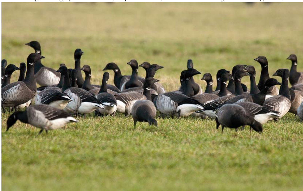
72 Witbuikrotganzen / Pale-bellied Brent Geese Branta hrota , met Rotgans / Dark-bellied Brent Goose B. bernicla , Smerp, Wieringen, Noord-Holland, 10 januari 2011