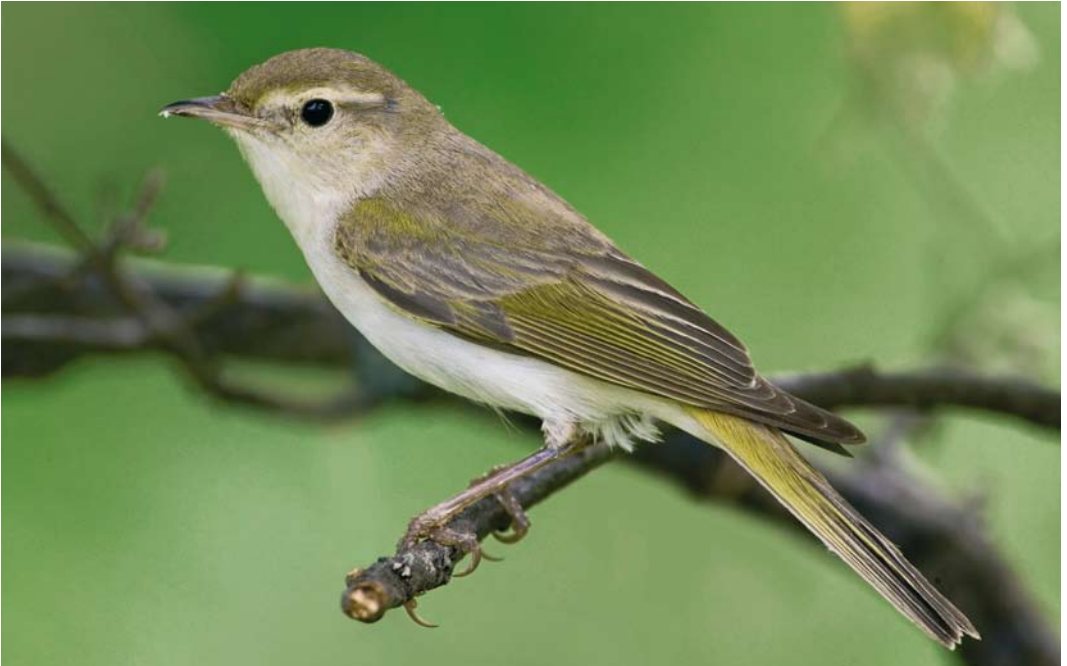
1 Western Bonelli's Warbler / Bergfluitier Phylloscopus bonelli , Toscana, Italy, 31 May 2007 (Daniele Occhiato)