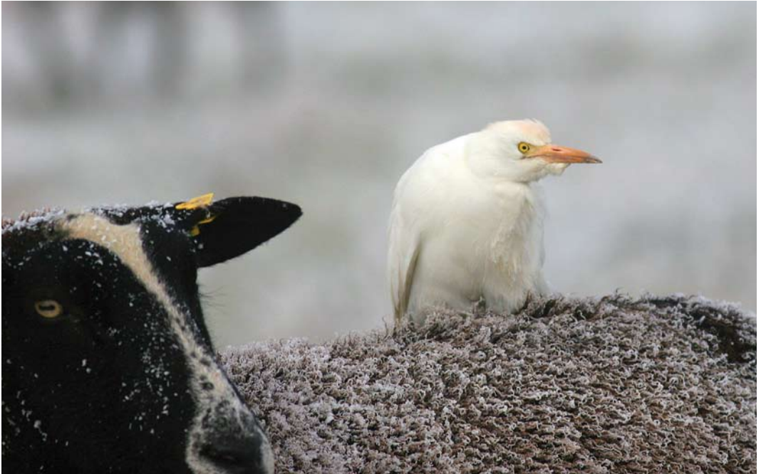
73 Koereiger / Cattle Egret Bubulcus ibis , Onnerpolder, Groningen, 27 november 2010