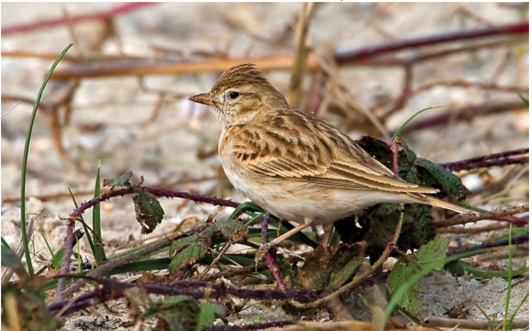
85 Kortteenleeuwerik / Greater Short-toed Lark Calandrella brachydactyla , De Cocksdoorp, Texel, Noord-Holland, 7 november 2010 ( Jos van den Berg )