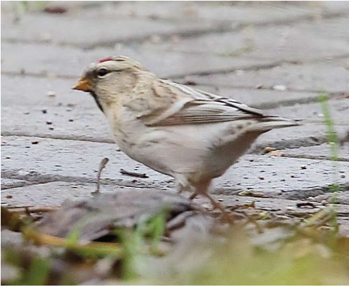
88 Witstuitbarmsijs / Arctic Redpoll Carduelis hornemanni , Texel, Noord-Holland, 14 november 2010 (Jos van den Berg)

Hooge Platen in de Westerschelde, Zeeland. Er werden in totaal ook nog c 670 langstreckende geteld, met onder andere 270 langs de Eemshaven en 187 langs Kamperhoek, Flevoland. Bij Castricum werden er in totaal ook nog acht geringd: de eerste vangsten voor dit ringstation sinds 2004. Er werden van trektelposten ruim 2100 langsvliegende barmsijsen Carduelis cabaret/ flammea gemeld. Daarnaast werden er c 400 geringd, waarvan het merendeel Grote Barmsijs C flammea betrof. Een Witstuitbarmsijs C hornemanni werd op 14 november gefotografeerd in de Sluftervallei op Texel.