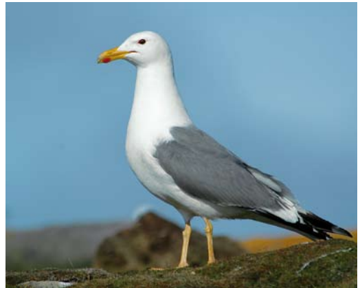
6 Taimyr Gull / Taimyrmeeuw Larus taimyrensis , adult trapped on nest, Bird Islands, Mys Vostochny, Taimyr, Russia, 22 July 2008 ( Jim de Fouw ) 7 Taimyr Gull / Taimyrmeeuw Larus taimyrensis , adult trapped on nest, Bird Islands, Mys Vostochny, Taimyr, Russia, 22 July 2008 ( Jim de Fouw ). Note primary moult (p1-2 shed). 8 Taimyr Gull / Taimyrmeeuw Larus taimyrensis , adult in breeding colony, Mys Vostochny, Taimyr, Russia, 9 August 2006 ( Bram Feij ) 9 Taimyr Gull / Taimyrmeeuw Larus taimyrensis , adult in breeding colony, Mys Vostochny, Taimyr, Russia, 9 August 2006 ( Bram Feij )

studied and ringed during many of these expeditions but often only as a side-project. Sergei Kharitonov has visited Medusa bay (73°21'N, 80°32'E) in western Taimyr, 17 km south of Dikson, several times since 1997, mainly to carry out research on geese, waders and gulls (eg, Kharitonov 2009). Bart Ebbsing has visited Mys Vostochny (in the mouth of the Pyasina river, 74°08'N, 86°43'E) in north-western Taimyr, 205 km east-northeast of Dikson, for a long-term research project on Dark-bellied Brent Goose Branta bernicla in several years between 1990 and 2008 (eg, Ebbsing & Mazurov 2005-07). Klaas van Dijk (1993) and Holmer Vonk (1994) spent a breeding season at Mys Vostochny for research on waders as mem-