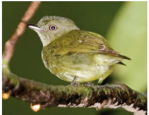
20 Lettered Aracari / Letterarassari Pteroglossus inscriptus, Alta Floresta, Mato Grosso, Brazil, November 2006 21 Red-necked Aracari / Roodhalsarassari Pteroglossus bitorquatus, Alta Floresta, Mato Grosso, Brazil, November 2006 22 Rufous-bellied Euphonia / Roodbuiorganist Euphonia rufiventris, male, Rio Cristalino, Alta Floresta, Mato Grosso, Brazil, 22 July 2006 23 Dusky-tailed Flatbill / Chapmans Breedbektiran Ramphotrigon fuscicauda, Rio Cristalino, Alta Floresta, Mato Grosso, Brazil, 15 August 2006 24 Amazonian Tyrannulet / Bruinkopinezia Inezia subflava, Alta Floresta, Mato Grosso, Brazil, November 2006 25 Dwarf Tyrant-manakin / Dwergtiranmanakin Tyrannetes stolzmanni, Rio Cristalino, Alta Floresta, Mato Grosso, Brazil, December 2006.