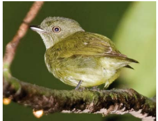
20 Lettered Aracari / Letterarassari Pteroglossus incriptus, Alta Floresta, Mato Grosso, Brazil, November 2006 21 Red-necked Aracari / Roodhalsarassari Pteroglossus bitorquatus, Alta Floresta, Mato Grosso, Brazil, November 2006 22 Rufous-bellied Euphonia / Roodbuikorganist Euphonia rufiventris, male, Rio Cristalino, Alta Floresta, Mato Grosso, Brazil, 22 July 2006 23 Dusky-tailed Flatbill / Chapmans Breedbektiran Ramphotrigon fuscicauda, Rio Cristalino, Alta Floresta, Mato Grosso, Brazil, 15 August 2006 24 Amazonian Tyrannulet / Bruinkopinezia Inezia subflava, Alta Floresta, Mato Grosso, Brazil, November 2006 25 Dwarf Tyrant-manakin / Dwergtiranmanakin Tyrannetes stolzmanni, Rio Cristalino, Alta Floresta, Mato Grosso, Brazil, December 2006. Plate 20-21 and 24 contributed from forthcoming Photographic handbook to birds of the world (Jornvall & Shirihai, A&C Black).