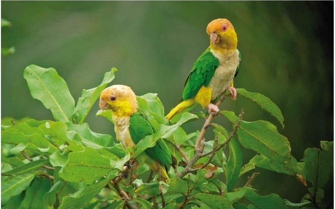
26 White-bellied Parrots / Witbuikc.aiques Pionites leucogaster , Rio Cristalino, Alta Floresta, Mato Grosso, Brazil, 24 September 2005 (Alexander C Lees). Mixed-subspecies pair with individual of eastern green-thighed nominate P. l. leucogaster (left) and individual of central yellow-thighed P. l. xanthurus (right). 27 Common Potoo / Grijze Reuzennachtzwaluw Nyctibius griseus , Carlinda, 40 km east of Alta Floresta, Mato Grosso, Brazil, 12 July 2005 (Alexander C Lees) 28 Zigzag Heron / Zigzagreiger Zebrilus undulatus , Alta Floresta, Mato Grosso, Brazil, November 2006 (Hadoram Shirihai). Contributed from forthcoming Photographic handbook to birds of the world (Jornvall & Shirihai, A&C Black).