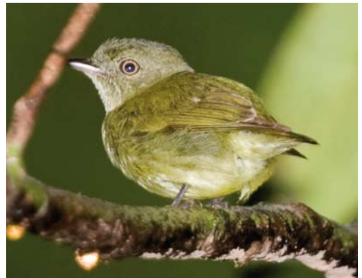
20 Lettered Aracari / Letterarassari Pteroglossus inscriptus, Alta Floresta, Mato Grosso, Brazil, November 2006 21 Red-necked Aracari / Roodhalsarassari Pteroglossus bitorquatus, Alta Floresta, Mato Grosso, Brazil, November 2006 22 Rufous-bellied Euphonia / Roodbuikorganist Euphonia rufiventris, male, Rio Cristalino, Alta Floresta, Mato Grosso, Brazil, 22 July 2006 23 Dusky-tailed Flatbill / Chapmans Breedbektiran Ramphotrigon fuscicauda, Rio Cristalino, Alta Floresta, Mato Grosso, Brazil, 15 August 2006 24 Amazonian Tyrannulet / Bruinkopinezia Inezia subflava, Alta Floresta, Mato Grosso, Brazil, November 2006 25 Dwarf Tyrant-manakin / Dwergtiranmanakin Tyrannetes stolzmanni, Rio Cristalino, Alta Floresta, Mato Grosso, Brazil, December 2006. Plate 20-21 and 24 contributed from forthcoming Photographic handbook to birds of the world (Jornvall & Shirihai, A&C Black).