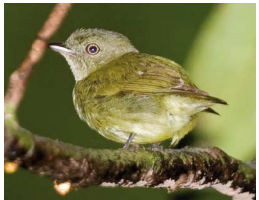
20 Lettered Aracari / Letterarassari Pteroglossus inscriptus, Alta Floresta, Mato Grosso, Brazil, November 2006 21 Red-necked Aracari / Roodhalsarassari Pteroglossus bitorquatus, Alta Floresta, Mato Grosso, Brazil, November 2006 22 Rufous-bellied Euphonia / Roodbuiorganist Euphonia rufiventris, male, Rio Cristalino, Alta Floresta, Mato Grosso, Brazil, 22 July 2006 23 Dusky-tailed Flatbill / Chapmans Breedbektiran Ramphotrigon fuscicauda, Rio Cristalino, Alta Floresta, Mato Grosso, Brazil, 15 August 2006 24 Amazonian Tyrannulet / Bruinkopinezia Inezia subflava, Alta Floresta, Mato Grosso, Brazil, November 2006 25 Dwarf Tyrant-manakin / Dwergtiranmanakin Tyrannetes stolzmanni, Rio Cristalino, Alta Floresta, Mato Grosso, Brazil, December 2006. Plate 20-21 and 24 contributed from forthcoming Photographic handbook to birds of the world (Jornvall & Shirihai, A&C Black).