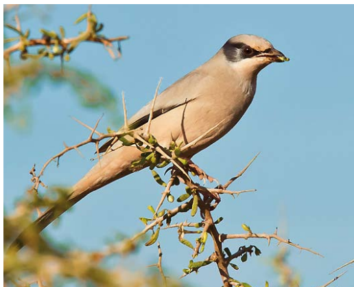
63 Hypocolius / Zijdestaart Hypocolius ampelinus , male, Cape Greco, Cyprus, 4 December 2010 (Alex Kirschel)