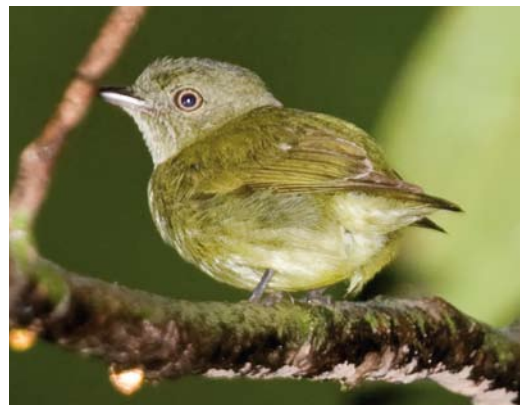
20 Lettered Aracari / Letterarassari Pteroglossus inscriptus , Alta Floresta, Mato Grosso, Brazil, November 2006 ( Hadoram Shirihai ) 21 Red-necked Aracari / Roodhalsarassari Pteroglossus bitorquatus , Alta Floresta, Mato Grosso, Brazil, November 2006 ( Hadoram Shirihai ) 22 Rufous-bellied Euphonia / Roodbuikorganist Euphonia rufiventris , male, Rio Cristalino, Alta Floresta, Mato Grosso, Brazil, 22 July 2006 ( Alexander C Lees ) 23 Dusky-tailed Flatbill / Chapman's Breedbektiran Ramphotrigon fuscicauda , Rio Cristalino, Alta Floresta, Mato Grosso, Brazil, 15 August 2006 ( Alexander C Lees ) 24 Amazonian Tyrannulet / Bruinkopinezia Inezia subflava , Alta Floresta, Mato Grosso, Brazil, November 2006 ( Hadoram Shirihai ) 25 Dwarf Tyrant-manakin / Dwergtiranmanakin Tyrannetes stolzmanni , Rio Cristalino, Alta Floresta, Mato Grosso, Brazil, December 2006 ( Arthur Grosset ). Plate 20-21 and 24 contributed from forthcoming Photographic handbook to birds of the world (Jornvall & Shirihai, A&C Black).