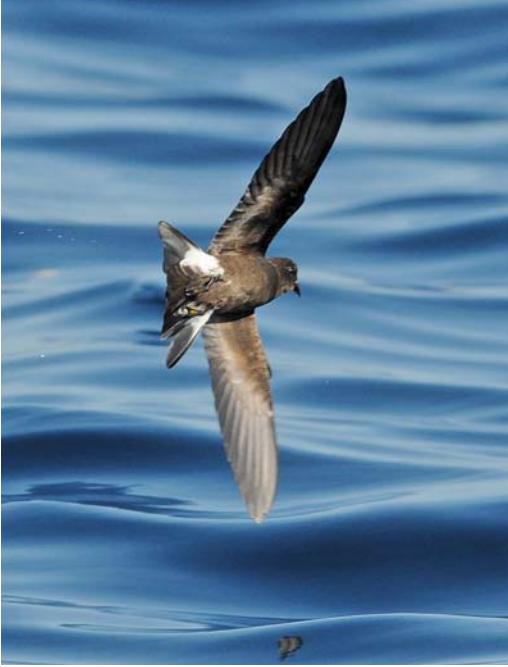
281 Wilson's Storm Petrel / Wilsons Stormvogeltje Oceanites oceanicus , off southern Portugal, 22 September 2009