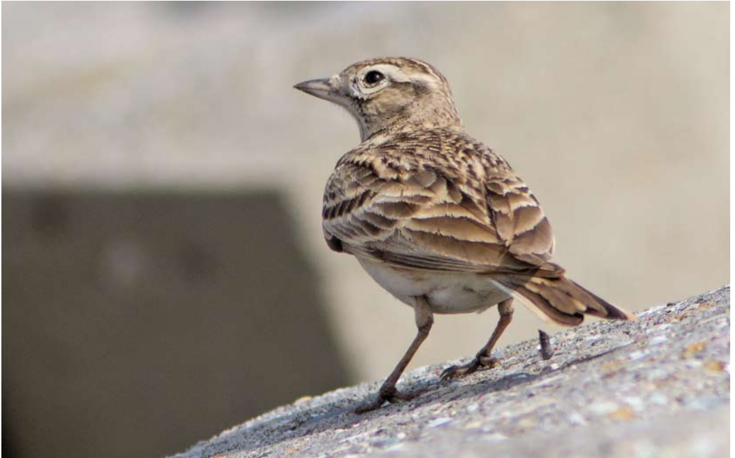
355 Kortteenleeuwerik / Greater Short-toed Lark Calendrella brachydactyla , Camperduin, Noord-Holland, 7 mei 2011 (Roelof de Beer)