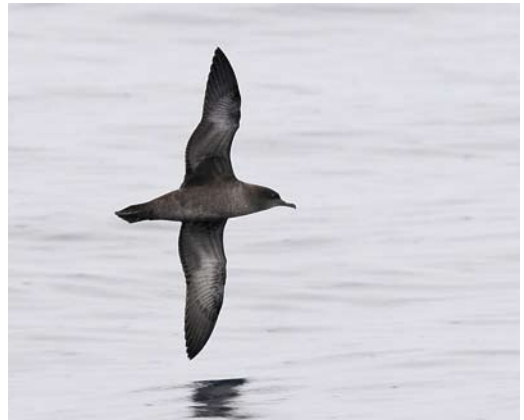
277 British Storm Petrel / Stormvogeltje Hydrobates pelagicus , off southern Portugal, 23 September 2010 (Roef Mulder) 278 Wilson's Storm Petrel / Wilsons Stormvogeltje Oceanites oceanicus , off southern Portugal, 23 September 2010 (Roef Mulder) 279 Great Shearwater / Grote Pijlstormvogel Puffinus gravis , off southern Portugal, 23 September 2010 (Roef Mulder) 280 Sooty Shearwater / Grauwe Pijlstormvogel Puffinus griseus , off southern Portugal, 23 September 2010 (Roef Mulder)

ed include Barolo Shearwater Puffinus baroli (eg, in September 2010). Yelkouan Shearwater P yelkouan is suspected to occur in very small numbers but there have not yet been any confirmed records (Magnus Robb in litt). The cape can especially be productive if the wind blows from a westerly direction. The southern headlands in the vicinity of Sagres is often even better when calm conditions prevail or the wind comes from the south, particularly for close-up views of shearwaters. The critically endangered Balearic Shearwater P mauretanicus can occur in numbers exceeding 200 birds per hour, representing a considerable percentage of the world population (in the Balearic Islands, breeding numbers have decreased severely over the last years and are estimated to stand as