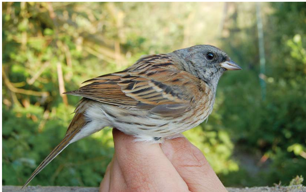
362 Maskergors / Black-faced Bunting Emberiza spodocephala , mannetje, Zwanenwater, Noord-Holland, 7 mei 2011 ( Peter Spanenburg ) 363 Cirlgors / Cirl Bunting Emberiza cirlus , vrouwtje, 't Vroon, Westkapelle, Zeeland, 4 mei 2011 ( Arnoud B van den Berg ) 364 Bruinkeelortolaan / Cretschmar's Bunting Emberiza caesia , mannetje, Rottumerplaat, Groningen, 14 mei 2011 ( Bernard Spaans )