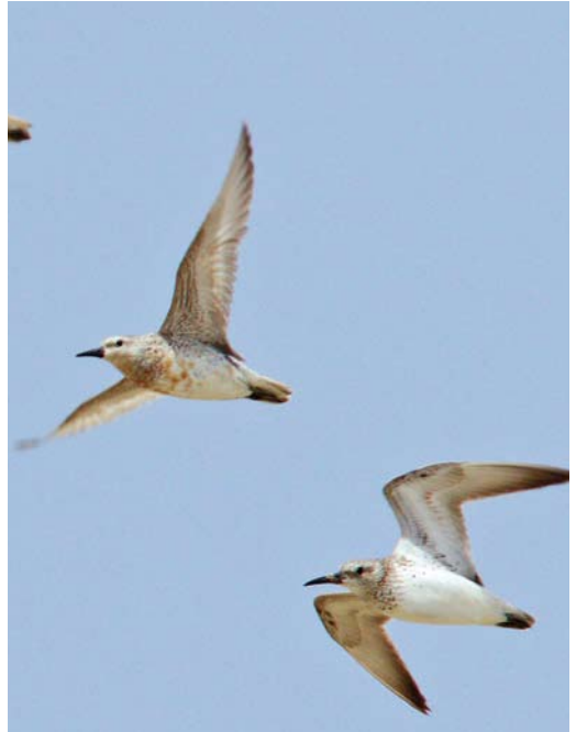
311 Presumed Eastern Common Tern / vermoedelijke Oostelijke Visdief Sterna hirundo longipennis, with Common Tern / Visdief S h hirundo, Heist, West-Vlaanderen, Belgium, 22 June 2011 312 Red Knot / Kanoet / Calidris canutus, with Great Knot / Grote Kanoet C tenuirostris, Bandar Abbas, Hormozgan, Iran, 18 May 2011 313 Brown Noddy / Noddy Anous stolidus, Persian Gulf, Iran, 7 June 2011