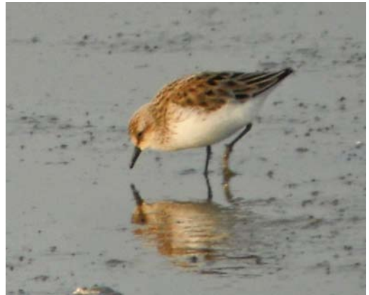
347 Lammergier / Bearded Vulture Gypaetus barbatus , onvolwassen, Den Helder, Noord-Holland, 20 juni 2011 (Henk van Boeijen) 348 Ralreiger / Squacco Heron Ardeola ralloides , Limietweg, Texel, Noord-Holland, 27 mei 2011 (Ruben Vermeer), 349 Lammergier / Bearded Vulture Gypaetus barbatus , tweede-kalenderjaar mannetje ('Sardona'), Philippine, Zeeland, 13 juni 2011 (Mark Hoekstein) 350 Grijze Strandloper / Semipalmated Sandpiper Calidris pusilla , Westpolder, Groningen, 20 mei 2011 (Martijn Bot)

Goed gefotografeerde exemplaren werden vastgesteld op 5 mei bij Bennekom, Gelderland; van 6 mei tot in juli op de Hoge Veluwe, Gelderland; op 7 mei bij Kinderdijk, Zuid-Holland; op 22 mei boven Roosendaal, Noord-Brabant; van 30 mei tot 3 juni op de Delleboersterheide bij Oldeberkoop, Friesland; en van 4 juni tot in juli in het Drents-Friese Wold bij Vledder, Drenthe. Ter vergelijking: in de periode 1907-95 werden slechts acht gevallen aanvaard. Waarnemingen van deze soort worden nog steeds beoordeeld door de CDNA. Een nagekomen melding betrof die van een eerste-zomer Steppiekiekendief Circus macrourus op 24 april bij Hardenberg, Overijssel. Andere exemplaren werden waargenomen op 1 mei bij Kampen, Overijssel (adult mannetje); op 1 mei bij Millingen aan de Rijn, Gelderland (adult mannetje); op 1 mei bij Slenaken, Limburg (eerste-zomer); op 2 mei een adult mannetje in Noord-Holland om 06:30 bij Heerhugowaard, om 08:28 bij de Dijkgatweide in de Wieringermeer en