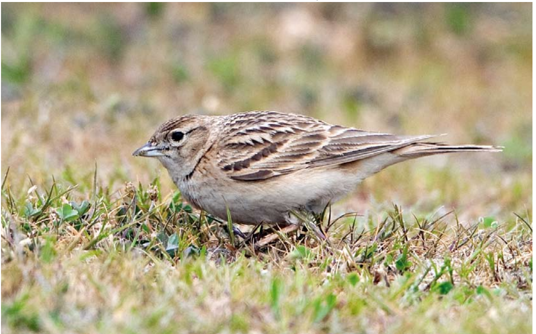
356 Kortteenleeuwerik / Greater Short-toed Lark Calendrella brachydactyla , IJmuiden, Noord-Holland, 16 mei 2011