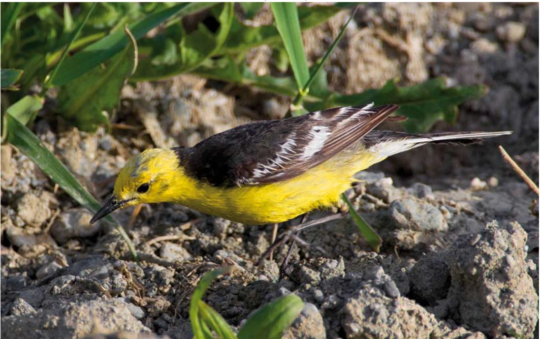
328 Black-backed Citrine Wagtail / Zwartrugcitroenkwikstaart Motacilla citreola calcarata , first-summer male, Van marshes, East Anatolia, Turkey, 18 May 2011 ( Daniele Occhiato )