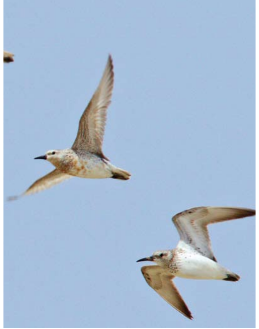
311 Presumed Eastern Common Tern / vermoedelijke Oostelijke Visdief Sterna hirundo longipennis, with Common Tern / Visdief S h hirundo, Heist, West-Vlaanderen, Belgium, 22 June 2011 312 Red Knot / Kanoet Calidris canutus, with Great Knot / Grote Kanoet C tenuirostris, Bandar Abbas, Hormozgan, Iran, 18 May 2011 313 Brown Noddy / Noddy Anous stolidus, Persian Gulf, Iran, 7 June 2011