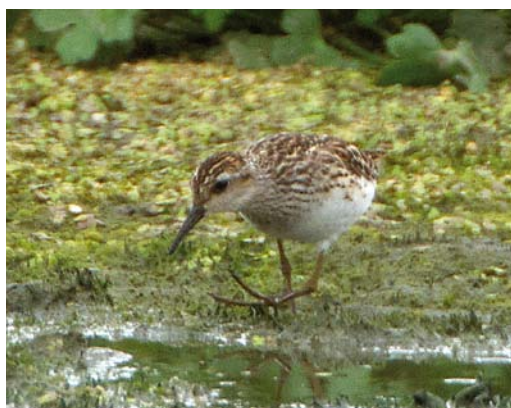
314 Egyptian Vulture / Aasgier Neophron percnopterus , Zandvoorde, West-Vlaanderen, Belgium, 22 April 2011 ( Johan Buckens ) cf Dutch Birding 33: 203, 2011 315 Crested Honey Buzzard / Aziatische Wespindief Pernis ptilorhynchus , adult male, Villa San Giovanni, Calabria, Italy, 18 May 2011 ( Angelo Scuderi ) 316 Western Reef Heron / Westelijke Rirfeiger Egretta gularis , Embouchure de l'oued Ksob, Diabat near Essaouir, Morocco, 19 June 2011 ( Suzanne Bonmarchand ) 317 Red-necked Stint / Roodkeelstrandloper Calidris ruticollis , adult, Utopia, Texel, Noord-Holland, Netherlands, 19 July 2011 ( Jos van den Berg ) 318 White-rumped Sandpiper / Bonapartes Strandloper Calidris fuscicollis , Comacchio, Po delta, Italy, 17 July 2011 ( Giuseppe Rossi ) 319 Long-toed Stint / Taigastrandloper Calidris subminuta , Braunschweiger Rieselfelder, Niedersachsen, Germany, June 2011 ( Stefan Pützke/green-lens.de )