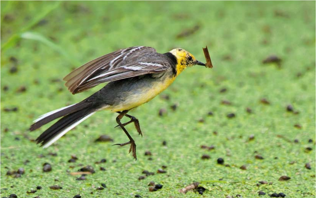
327 Citrine Wagtail / Citroenkwikstaart Motacilla citreola , first-summer male, collecting food for young, Zeewolde, Flevoland, Netherlands, 16 July 2011 ( Arnoud B van den Berg )