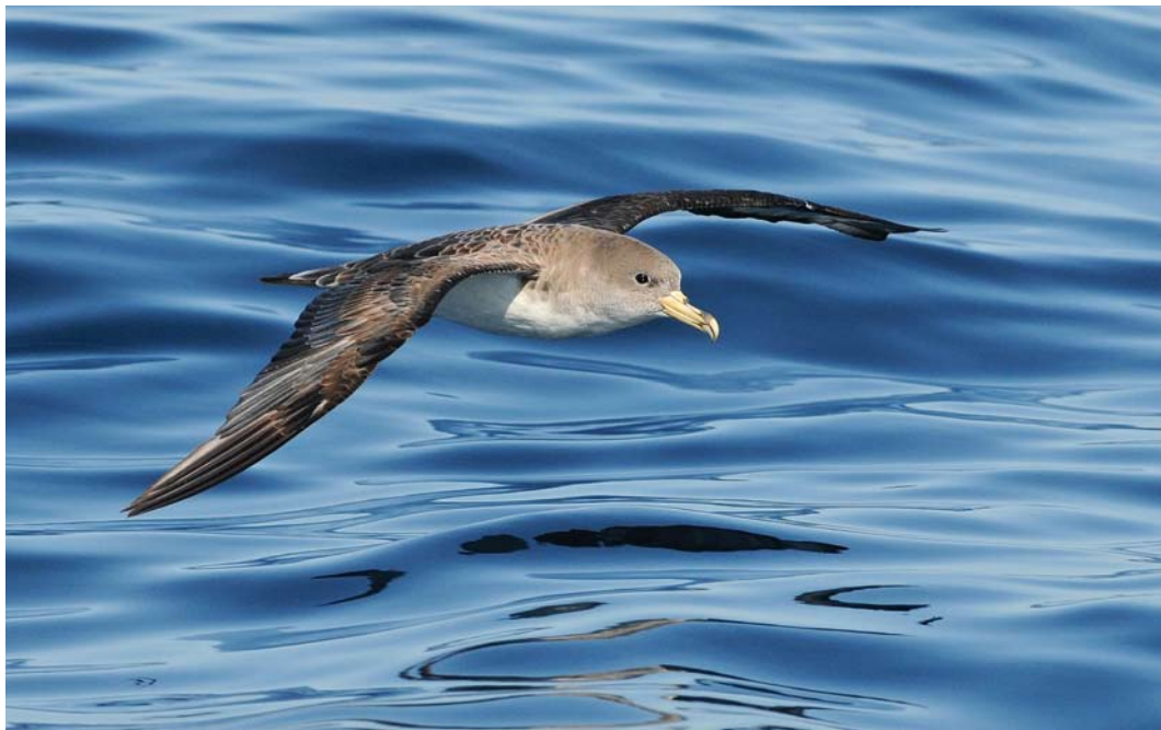
272 Cory's Shearwater / Kuhls Pijlstormvogel Calonectris borealis , off southern Portugal, 23 September 2009