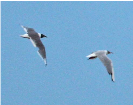
294-295 Franklin's Gull / Franklins Meeuw Larus pipixcan (left), with Black-headed Gull / Kokmeeuw Chroicocephalus ridibundus , Kushmurun lake, Qostanay province, Kazakhstan, 14 July 2010 ( Ross Ahmed ) 296-297 Franklin's Gull / Franklins Meeuw Larus pipixcan , Kushmurun lake, Qostanay province, Kazakhstan, 14 July 2010 ( Ross Ahmed )

Two other features that raised concerns were the apparently all-white tail (lacking any grey) and the less familiar wing-tip pattern. However, both of these features can be explained by moult and feather wear; the bird was missing at least two pri-