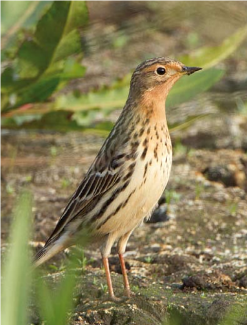
357 Roodkeelpieper / Red-throated Pipit Anthus cervinus , Zevenhoven, Zuid-Holland, 7 mei 2011