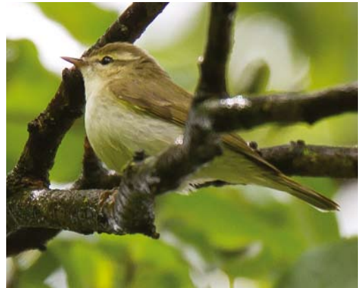
351 Kalendarleeuwerik / Calandra Lark Melanocorypha calandra , Paal 48, Vlieland, Friesland, 8 mei 2011 ( Joachim Bouwmeester ) 352 Roodkopklauwier / Woodchat Shrike Lanius senator , Maasvlakte, Zuid-Holland, 5 mei 2011 ( Ben van den Broek ) 353 Struikrietzanger / Blyth's Reed Warbler Acrocephalus dumetorum , Eemshaven-Oost, Groningen, 6 mei 2011 ( Albert-Erik de Winter ) 354 Grauwe Fitis / Greenish Warbler Phylloscopus trochiloides , Alphen aan den Rijn, Zuid-Holland, 19 juni 2011 ( Paul van der Werken )

RALLEN TOT STRANDLOPERS Kleinste Waterhoenders Porzana pusilla werden waargenomen van 26 mei tot 12 juni in De Wieden, Overijssel, van 1 tot 16 juni in Polder Achteraf bij Breukelenveen (drie), Noord-Holland, en van 4 tot 15 juni bij Schokland (twee); op de laatste locatie lieten de vogels zich af en toe aardig bekijken. Op enkele plekken kwamen Steltkluten Himantopus himantopus tot broeden, al verliep dat niet overall even succesvol. Twee doortrekkers werden op 27 juni gezien vanaf trektelepost De Nolle bij Vlissingen, Zeeland. Grielen Burhinus oedicnemus werden waargenomen op op 7 mei bij Strijen, Zuid-Holland (mogelijk de vogel die hier eerder op 24 en 25 april werd gezien), op 13 juni bij Stellendam, Zuid-Holland, en op 30 juni 's nachts bij Nieuw-Scheemda, Groningen. Op 4 en 5 mei verbleef een Woestijplevier Charadrius leschenaultii bij Den Helder. Waarschijnlijk betrof het dezelfde als op 27 april bij Hoek van Holland, Zuid-Holland. Een