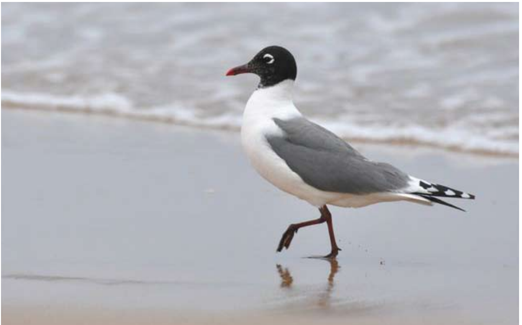
323 Franklin's Gull / Franklins Meeuw Larus pipixcan , adult, Aghroud plage, Haha, Morocco, 16 June 2011