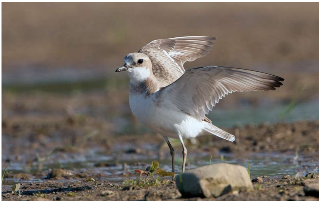
343 Woestijnplevier / Greater Sand Plover Charadrius leschenaultii , adult vrouwtje, Liendense Waard, Batenburg, Gelderland, 1 mei 2011