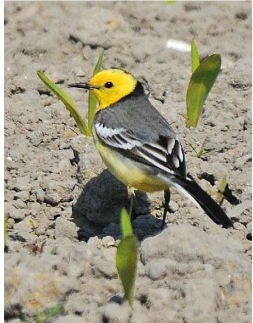
358 Citroenkwikstaart / Citrine Wagtail Motacilla citreola , mannetje, Dijkgatweide, Noord-Holland, 2 mei 2011 (Ruud Brouwer)

dween, veel waarnemers in vertwijfeling achterlatend omdat een Veldleeuwerik Alauda arvensis voor verwar- ring zorgde. Kortteenleeuweriken Calandrella brachydactyla lieten zich fraai bekijken in Noord-Holland op 7 mei bij Camperduin en van 14 tot 18 mei bij IJmuiden. Op 6 mei werd een overvliegende gemeld op de oost- punt van Vlieland. Een paar Kuifleeuweriken Galerida cristata bij Venlo, Limburg, gaf de Nederlandse populatie een flinke impuls door drie jongen te produceren. De enige andere plek waar de soort met zekerheid werd vastgesteld was in Slot Haverleij bij 's-Hertogenbosch, Noord-Brabant. Roodstuitzwaluwen Cecropis daurica werden gemeld op 1 mei langs Breskens, Zeeland (twee); op 1 mei over Berkeide bij Katwijk; op 1 mei over de Maasvlakte, Zuid-Holland; op 1 mei bij Berkel en Rodenrijs, Zuid-Holland; op 2 mei over de Eemshaven, Groningen (twee); op 3 mei langs Breskens; op 3 mei langs trektpost Noordkaap; op 4 mei langs Breskens; op 5 mei langs Breskens (twee); op 5 mei langs Petten, Noord-Holland; op 7 mei over Terschelling en Schier- monnikoog; op 9 mei langs trektpost Lauwersmeer Kustweg, Groningen (twee); op 20 mei boven het Paterswoldse Meer, Groningen; op 27 mei bij Ridderkerk, Zuid-Holland; en op 28 mei in de Brabantse Biesbosch, Noord-Brabant. Het voorjaarstotaal kwam hiermee uit op minimaal 30 exemplaren.