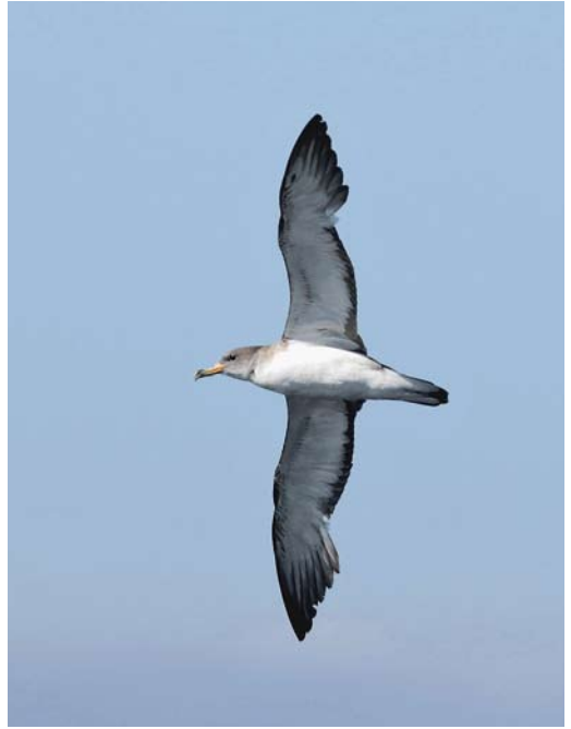
274 Balearic Shearwater / Vale Pijlstormvogel Puffinus mauretanicus , off southern Portugal, 25 September 2010 (Roef Mulder) 275 Scopoli's Shearwater / Scopoli's Pijlstormvogel Calonectris diomedea , off southern Portugal, 4 October 2009 (Ray Tipper) 276 Great Shearwater / Grote Pijlstormvogel Puffinus gravis , off southern Portugal, 23 September 2009 (Roef Mulder)