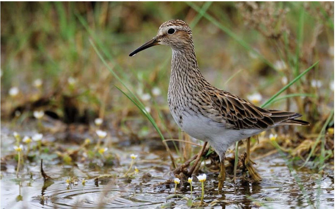
321 Pectoral Sandpiper / Gestreepte Strandloper Calidris melanotos , Stintino peninsula, Sardinia, Italy, 15 May 2011