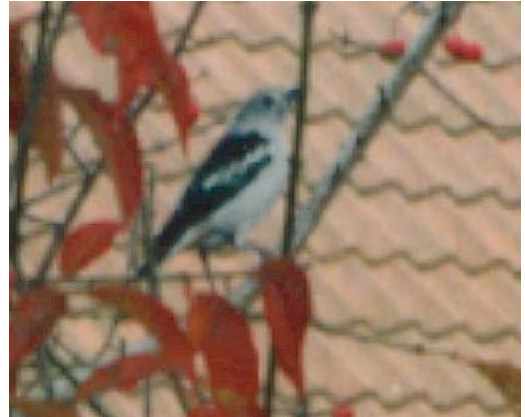
291 Daurische Spreeuw / Daurian Starling Agropsar sturninus , Duiven, Gelderland, 5 November 1999 (A J Meeuwissen)

slijtage of ontbrekende veren; snavel niet beschadigd, vergrooid of tweekleurig. Poten niet goed zichtbaar tussen bladeren, maar geen afwijkingen zichtbaar.