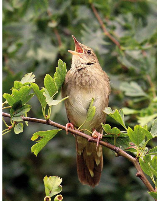
324 European Roller / Scharrelaar Coracias garrulus , Zuidland, Zuid-Holland, Netherlands, 10 July 2011 325 River Warbler / Krekelzanger Locustella fluviatilis , Beijumberbos, Groningen, Groningen, Netherlands, 2 July 2011 326 Lesser Grey Shrike / Kleine Klapekster Lanius minor , Houtave, West-Vlaanderen, Belgium, 2 June 2011