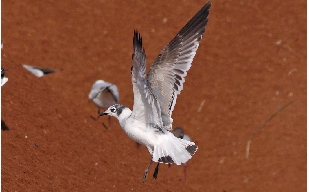
322 Franklin's Gull / Franklins Meeuw Larus pipixcan , second-summer, Delitzsch, Sachsen, Germany, 6 May 2011