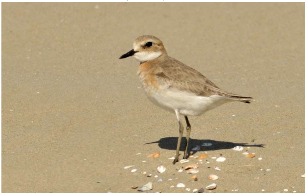
344 Woestijnplevier / Greater Sand Plover Charadrius leschenaultii , tweede-kalenderjaar, Julianadorp, Noord-Holland, 4 mei 2011