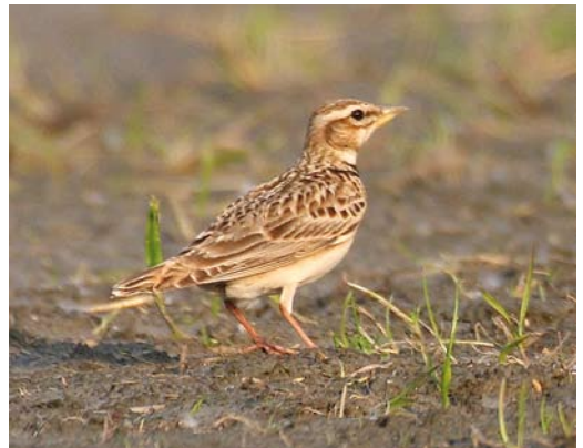
331 Sardinian Warbler / Kleine Zwartkop Sylvia melanocephala , male, Blåvandshuk, Vestjylland, Denmark, 15 June 2011 ( Henrik Knudsen ) 332 White-throated Sparrow / Witkeelgors Zonotrichia albicollis , second calendar-year, Helgoland, Schleswig-Holstein, Germany, 30 May 2011 ( Tobias Epple ) 333-334 Collared Flycatcher / Withalsvliegenvanger Ficedula albicollis , male, 152 km north-east of Dakhla, Western Sahara, Morocco, 11 April 2011 ( Wouter Faveyts ) 335 Great Spotted Cuckoo / Kuifkoekeok Clamator glandarius , juvenile, Evenreitster, Groningen, Netherlands, 10 July 2011 ( Guido Meeuwissen ) 336 Bimaculated Lark / Bergkalanderleeuwerik Melanocorypha bimaculata , Magadino, Tessin, Switzerland, 5 May 2011 ( Marco Thoma ) cf Dutch Birding 33: 207, 2011