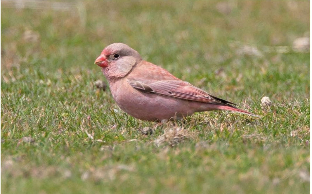
329 Trumpeter Finch / Woestijnvink Bucanetes githagineus , male, Lundy, Devon, England, 14 May 2011 (Andy Jordan)