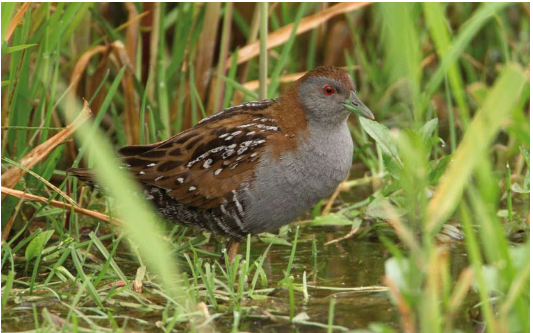
342 Kleinst Waterhoen / Baillon's Crake Porzana pusilla , Schokland, Flevoland, 6 juni 2011 (Roland Jansen)